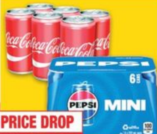
COCA-COLA or PEPSI SOFT DRINKS selected varieties 6x222 mL boissons gazeuses 20344286002 C06/20637360004 C06