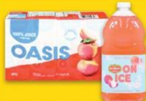
OASIS JUICE or ARIZONA ICED TEA, ALLEN'S APPLE or CRANBERRY COCKTAIL or DEL MONTE ON ICE REFRESHERS 1.89 L selected varieties jus ou thé glacé ou boissons 20313764002 SA/21375061 SA