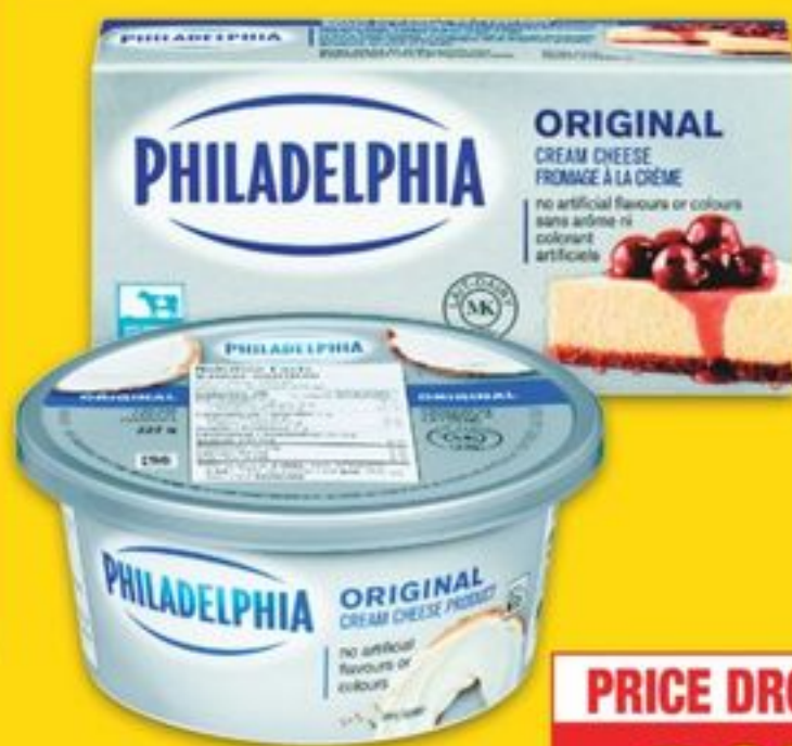
PHILADELPHIA CREAM CHEESE PRODUCT selected varieties 227/250 g produit de fromage à la crème 20641267 SA/2064492610 SA