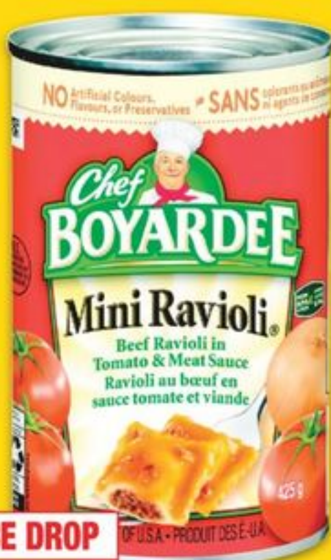
CHEF BOYARDEE selected varieties 418/425 g pâtes 2031230001 SA