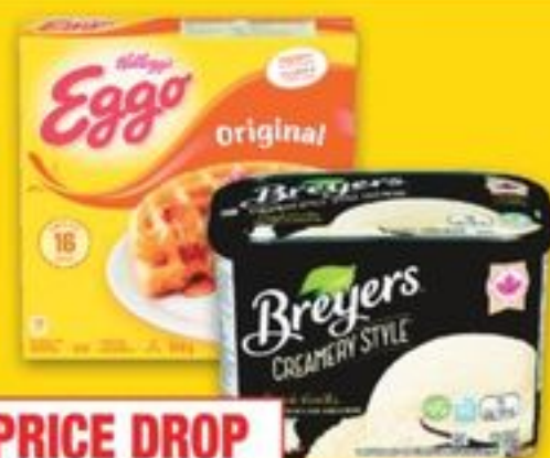
EGGO WAFFLES 16's or BREYERS CREAMERY STYLE ICE CREAM 1.66 L selected varieties, frozen gâteaux ou crème glacée 20099720004 SA/20344920004 SA