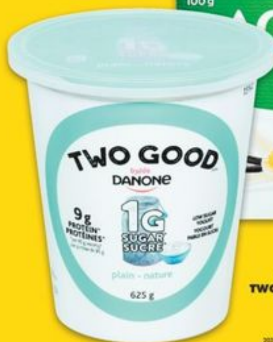
DANONE ACTIVIA 8% MIX & GO VANILLA 2% or TWO GOOD LOW SUGAR YOGURT selected varieties yogourt 2022384002 SA/21477313 SA