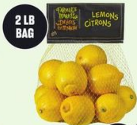
FARMER'S MARKET™ LEMONS PRODUCT OF SOUTH AFRICA 2 LB BAG 20795315001_EA