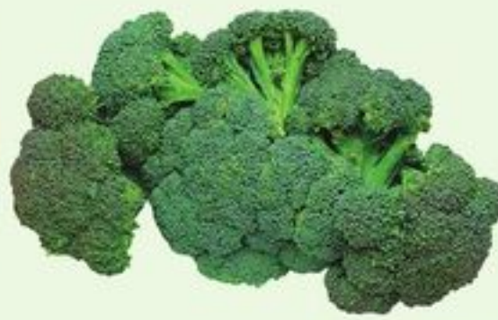
BROCCOLI CROWNS PRODUCT OF MEXICO OR U.S.A. EACH 21121560001_EA