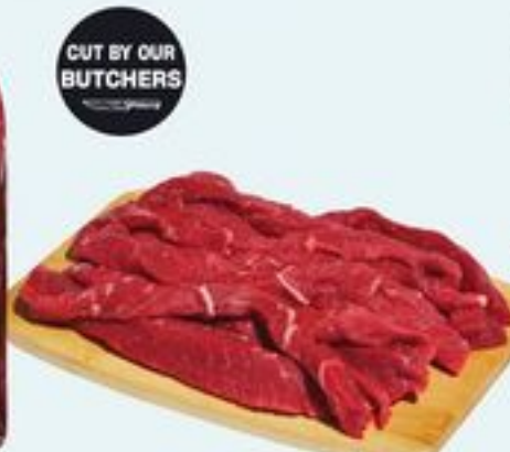
BEEF STIR FRY STRIPS 250 G 21588067_EA