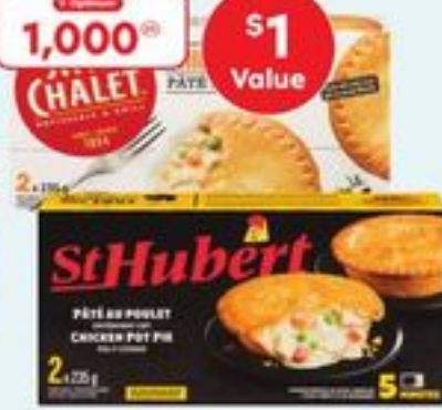
ST-HUBERT OR SWISS CHALET SINGLE PIES FROZEN 470 G 21047000_EA/21047192_EA