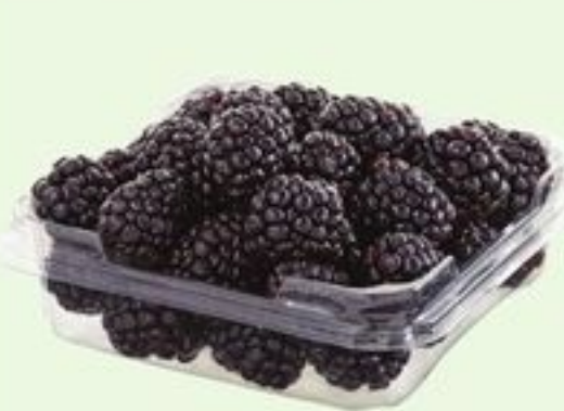
BLACKBERRIES PRODUCT OF MEXICO 170 G 20051015001_EA