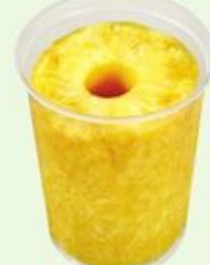
CORED PINEAPPLE MADE IN-STORE DAILY 600 G 20503143_EA