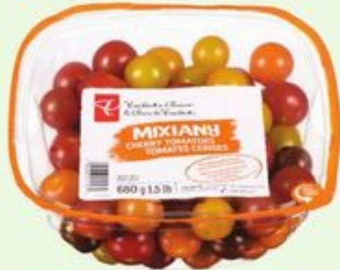
CANADA PC™ MIXIANY CHERRY TOMATOES PRODUCT OF CANADA 680 G 2128588001_EA