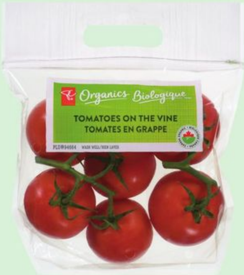
PC ® ORGANICS TOMATOES ON THE VINE PRODUCT OF CANADA 11.00/KG 20127917001_KG