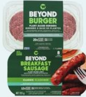
BEYOND MEAT PLANT BASED BURGER OR BREAKFAST SAUSAGES 226-400 G 21193815_EA/21399630_EA