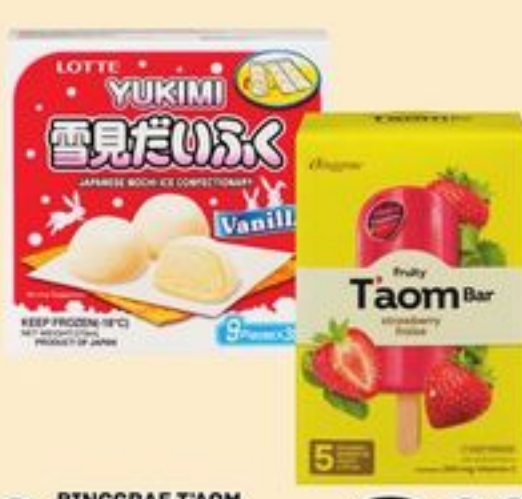
BINGGRAE T'AOM ICE BAR, 5'S OR LOTTE MOCHI 270 G SELECTED VARIETIES FROZEN 21247111_EA 21566306_EA