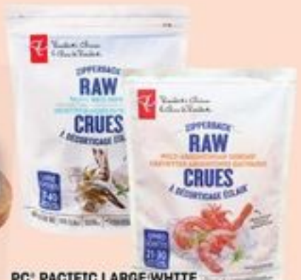
PC™ PACIFIC LARGE WHITE CRUES 31-40 PER LB 400 G OR JUMBO WILD ARGENTINIAN SHRIMP RAW ZIPPERBACK™ 21-30 PER LB 340 G FROZEN 20788888_EA/21332386_EA