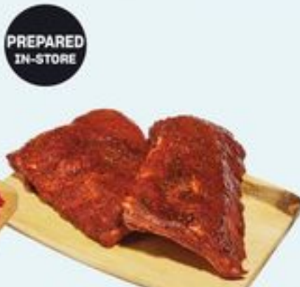
MARINATED PORK BACK RIBS 13.21/KG 21418296_KG