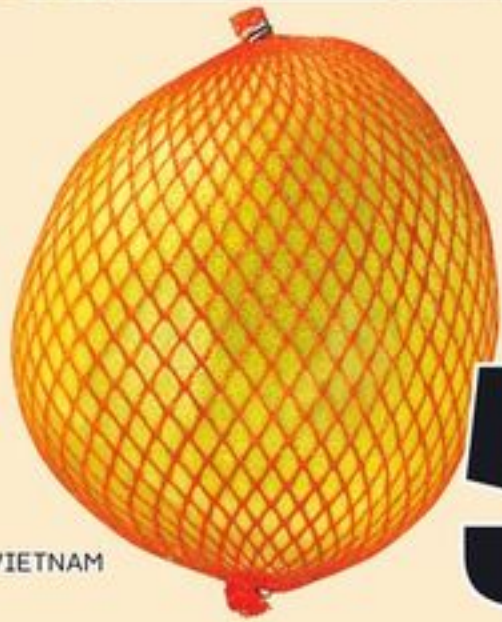
RED POMELO PRODUCT OF VIETNAM 20081390001_KG