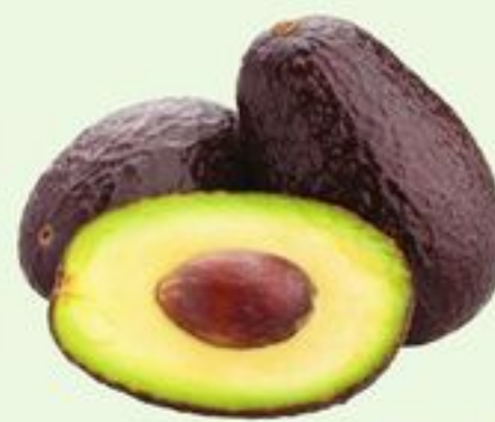
AVOCADO PRODUCT OF MEXICO EACH 21097012001_EA