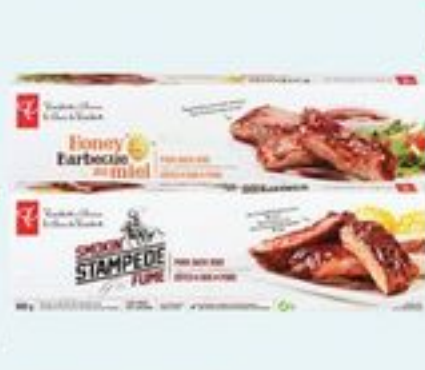
PC™ BBQ PORK BACK RIBS FULLY COOKED, SELECTED VARIETIES 500 G 21284538_EA/21284542_EA