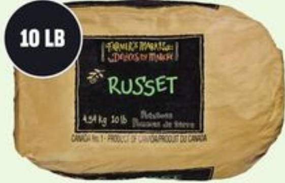
ATLANTIC FARMER'S MARKET™ RUSSET POTATOES PRODUCT OF ATLANTIC CANADA, CANADA NO. 1 GRADE 10 LB BAG 20601020001_EA