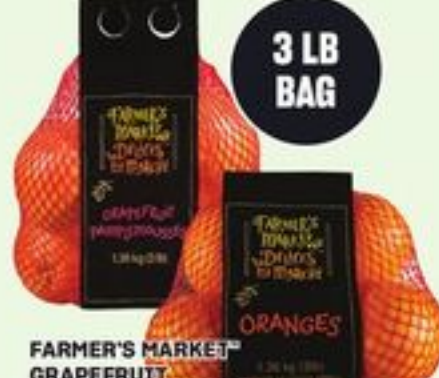
FARMER'S MARKET™ GRAPEFRUIT OR NAVEL ORANGES PRODUCT OF SPAIN, MOROCCO OR TURKEY 3 LB 20118409001_EA/ 20162945001_EA