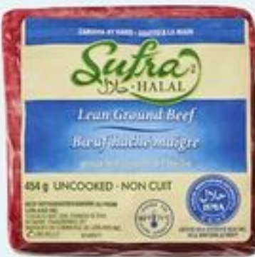
SUFRA™ HALAL LEAN GROUND BEEF 454 G 21397283_EA