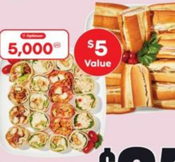
PIN WHEELS WRAP OR SMALL GAME NIGHT PLATTER EACH 21558135_EA/21557919_EA