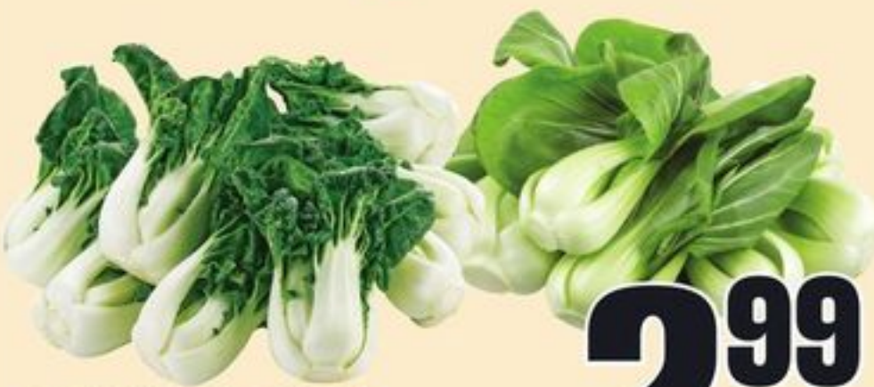
BABY OR SHANGHAI BOK CHOY PRODUCT OF MEXICO 6.59/KG 20082279001_KG/20032454001_KG