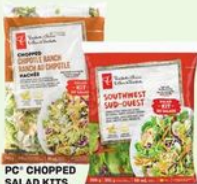
PC™ CHOPPED SALAD KITS PRODUCT OF U.S.A., SELECTED VARIETIES 285-369 G 21378071_EA/ 21378098_EA