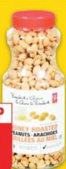
PC® DRY ROASTED PEANUTS selected varieties 700 g arachides 2005799002 SA