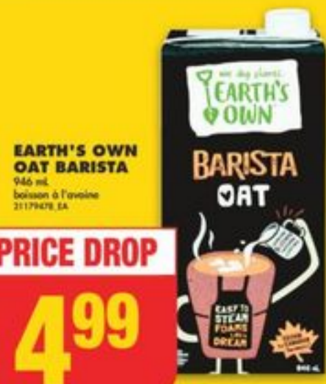
EARTH'S OWN OAT BARISTA 946 mL boisson à l'avoine 21179478 SA