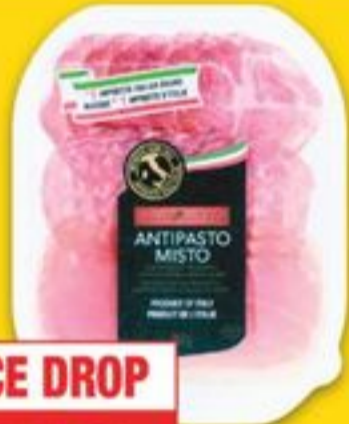
MARCANGELO SLICED DELI MEAT selected varieties 100 g viandes de charcuterie 20661202 SA