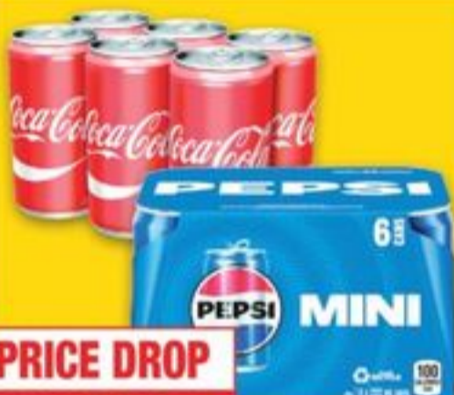
COCA-COLA or PEPSI SOFT DRINKS selected varieties 6x222 mL boissons gazeuses 20344286002 C06/20637360004 C06