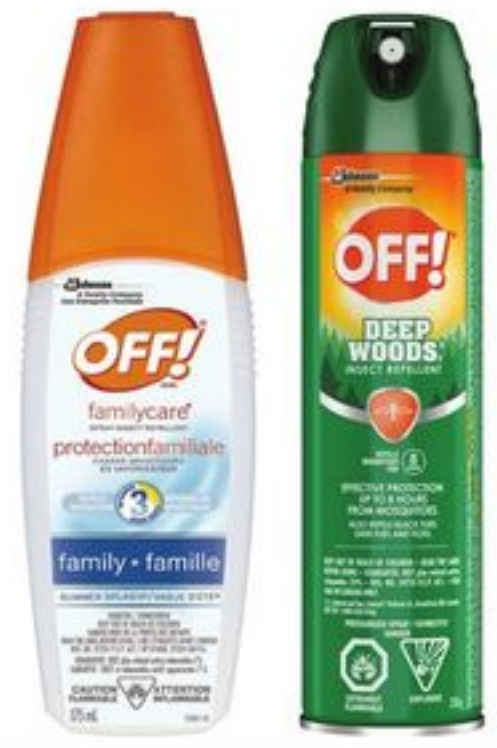
OFF! OR RAID INSECT REPELLENT SELECTED VARIETIES 20001279002_EA/20158572_EA