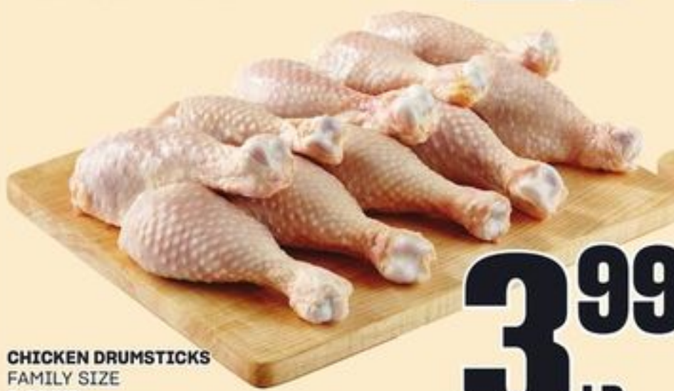
CHICKEN DRUMSTICKS FAMILY SIZE 8.80/KG 20707253_KG

Optimum Members-Only Price™ 99¢ Non-members 1 49