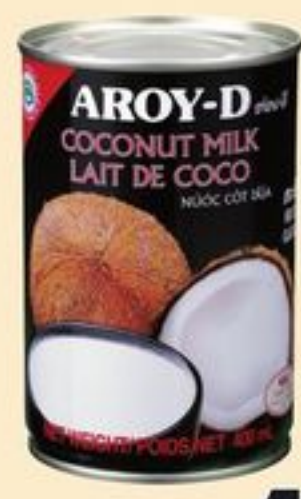
AROY-D COCONUT MILK SELECTED VARIETIES 400 ML 20063864_EA