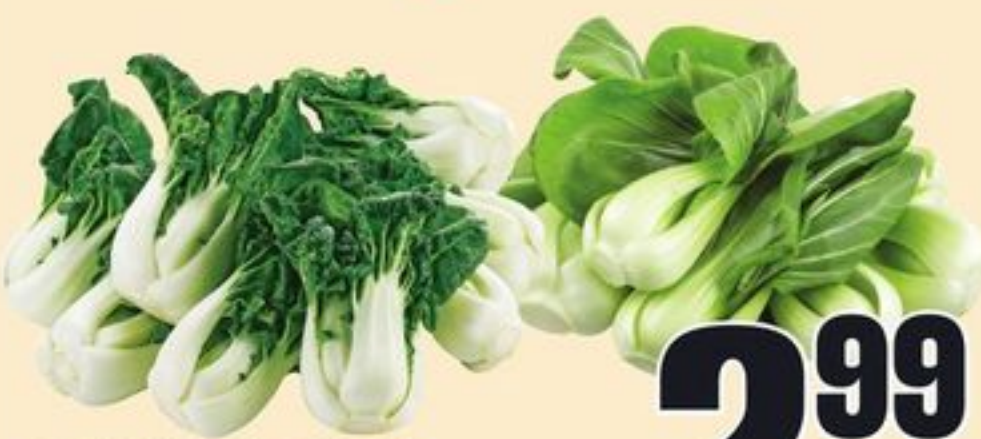
BABY OR SHANGHAI BOK CHOY PRODUCT OF MEXICO 6.59/KG 20082279001_KG/20032454001_KG