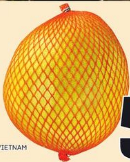
RED POMELO PRODUCT OF VIETNAM 20081390001_KG