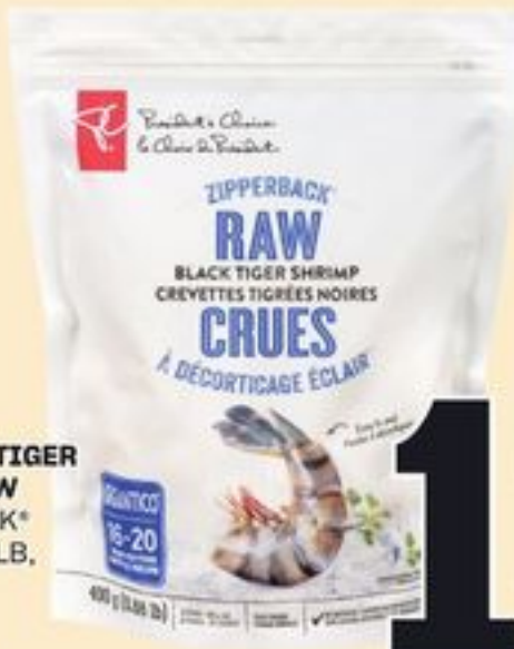
PC® BLACK TIGER SHRIMP ZIPPERBACK® 16-20 PER LB. FROZEN 400 G 20801192_EA