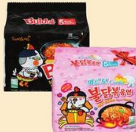
SAMYANG BULDAK RAMEN SELECTED VARIETIES 650-700 G 21345870_C05 21450283_EA