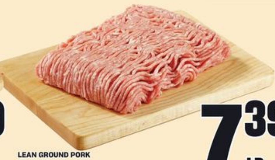
LEAN GROUND PORK 16.29/KG 20833248_KG