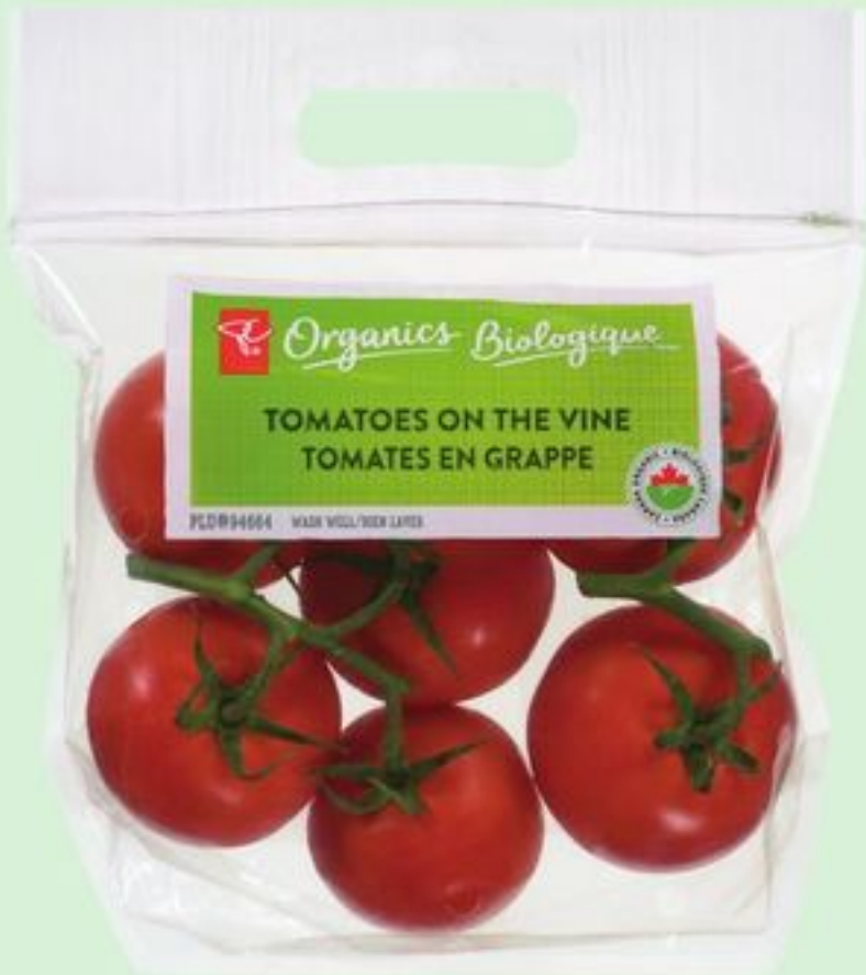
PC ® ORGANICS TOMATOES ON THE VINE PRODUCT OF CANADA 11.00/KG 20127917001_KG