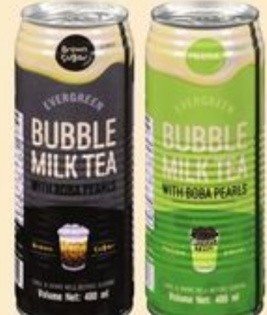
EVERGREEN BUBBLE MILK TEA SELECTED VARIETIES 480 ML 21528465_EA 21528467_EA