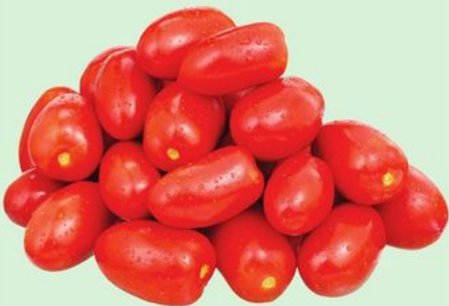
GREENHOUSE ROMA TOMATOES PRODUCT OF MEXICO 6.15/KG 20143381001_KG