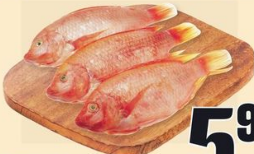
FRESH WHOLE RED TILAPIA 13.21/KG 20057884_KG