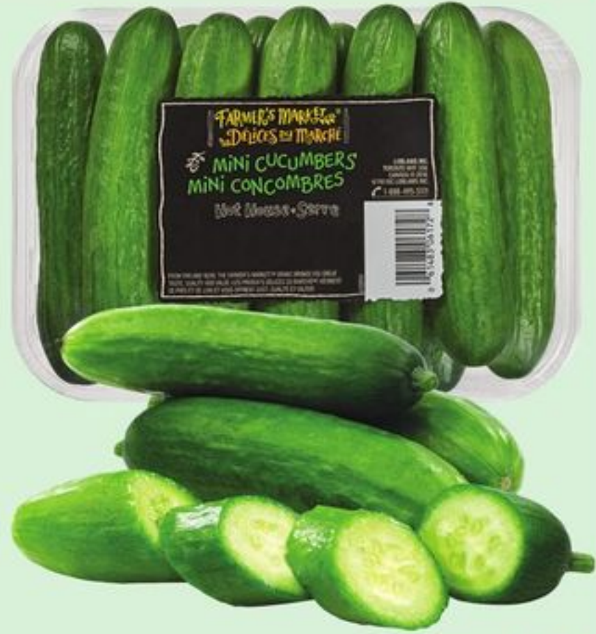
FARMER'S MARKET SM MINI CUCUMBERS PRODUCT OF ATLANTIC CANADA 11'S 21070679001_EA