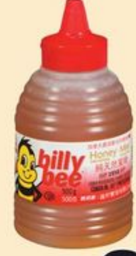
BILLY BEE HONEY 500 G 21001564_EA