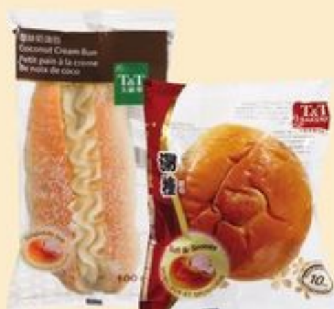
T&T® BAKERY BUNS SELECTED VARIETIES 90/100 G 20332833_EA 20334565_EA