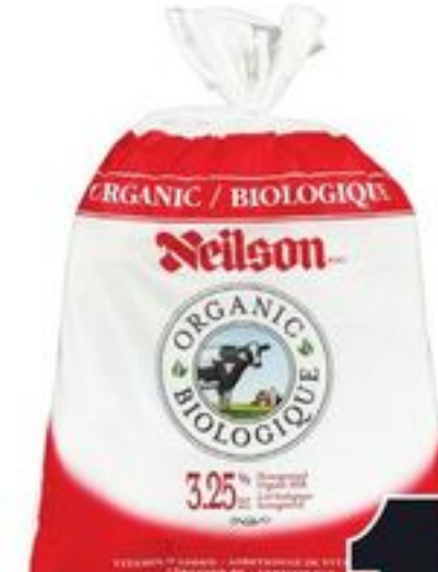
NEILSON ORGANIC MILK SELECTED VARIETIES 4 L 20711395_EA