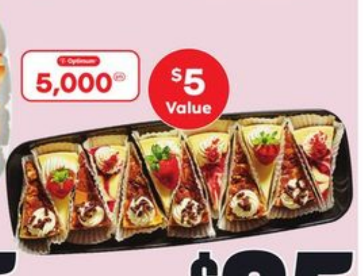
CHEESECAKE TRAY 108 G 2096282_EA