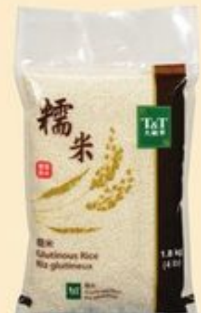
T&T® GLUTINOUS RICE 1.8 KG 20828956_EA