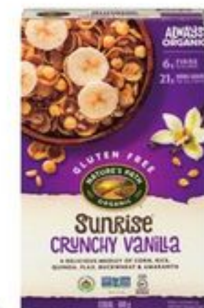
NATURES PATH SUNRISE CEREAL 300 G OR PC* ORGANICS GLUTEN-FREE ROLLED OATS 900 G SELECTED VARIETIES 20043938002_EA/21396198_EA