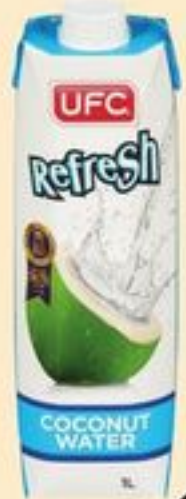
UFC REFRESH COCONUT WATER 1 L 20570506_EA