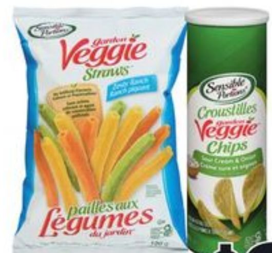
SENSIBLE PORTIONS VEGGIE STRAWS SELECTED VARIETIES 120-142 G 20377204001_EA/21380091_EA