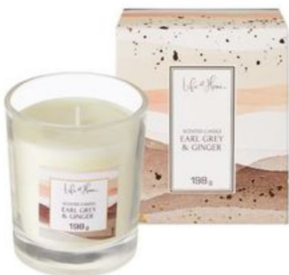
LIFE AT HOME™ 7 OZ SINGLE WICK CANDLE ASSORTED SCENTS $10 21414403_EA

Sophisticated and alluring, this textural scent boasts notes of suede, amber and rosewood wrapped in sensual vanilla and tonka.