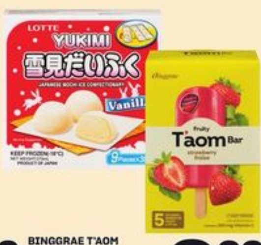
BINGGRAE T'AOM ICE BAR, 5'S OR LOTTE MOCHI 270 G SELECTED VARIETIES FROZEN 21247111_EA 21566306_EA