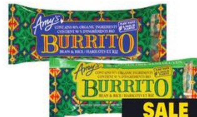
AMYS KITCHEN SELECTED VARIETIES AND SIZES 20042092002_EA/20371439001_EA