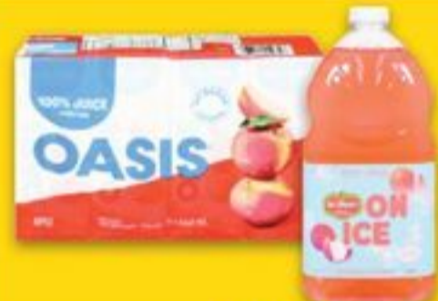
OASIS JUICE or ARIZONA ICED TEA, ALLEN'S APPLE CRANBERRY COCKTAIL or DEL MONTE ON ICE REFRESHERS 1.89 L selected varieties jus ou thé glacé ou boissons 20313744002 SA/21375061 SA