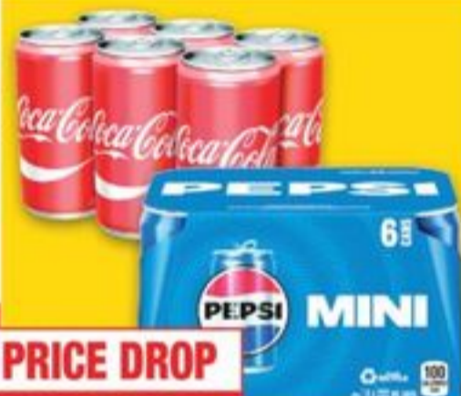
COCA-COLA or PEPSI SOFT DRINKS selected varieties 6x222 mL boissons gazeuses 20344288002 C06/20637340004 C06