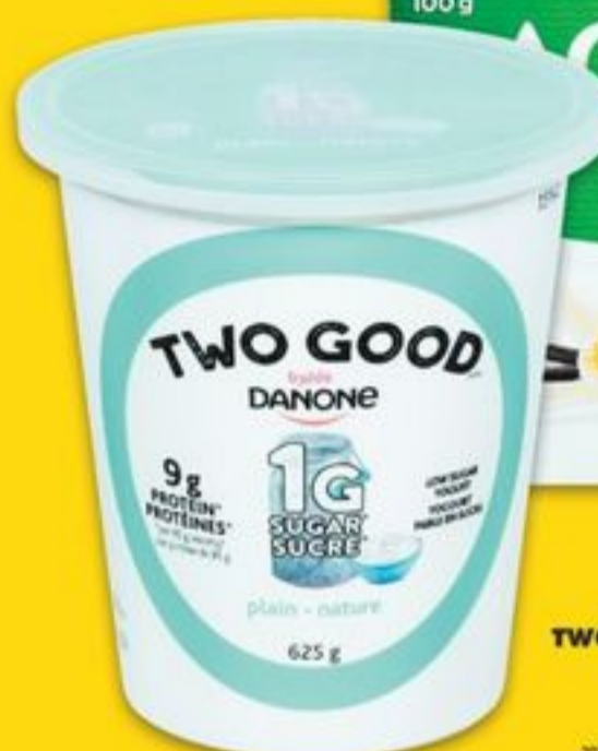
DANONE ACTIVIA 8% MIX & GO VANILLA 2% or TWO GOOD LOW SUGAR YOGURT selected varieties yogourt 2022384002 SA/21477313 SA