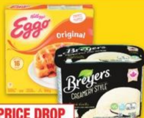
EGGO WAFFLES 16's or BREYERS CREAMERY STYLE ICE CREAM 1.66 L selected varieties, frozen gâteaux ou crème glacée 20099730004 SA/20344920004 SA