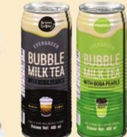
EVERGREEN BUBBLE MILK TEA SELECTED VARIETIES 480 ML 21528465_EA 21528467_EA