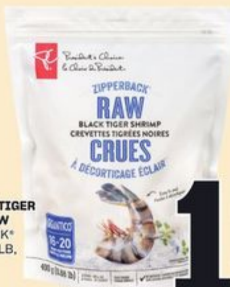
PC® BLACK TIGER SHRIMP ZIPPERBACK® 16-20 PER LB. FROZEN 400 G 20801192_EA