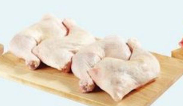
CHICKEN LEGS FAMILY SIZE 6.59/KG 20707114_KG