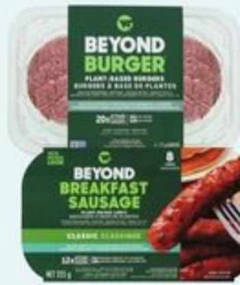
BEYOND MEAT PLANT BASED BURGER OR BREAKFAST SAUSAGES 226-400 G 21193815_EA/21399630_EA