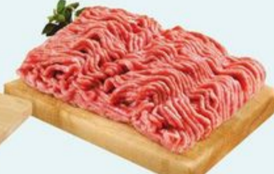
EXTRA LEAN GROUND CHICKEN OR TURKEY TRAY PACK 14.31/KG 20107226_KG/20707719_KG