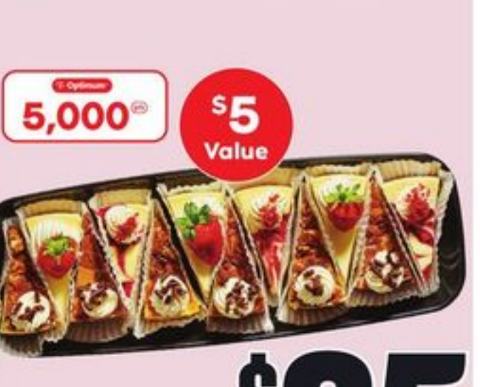
CHEESECAKE TRAY 108 G 2096282_EA