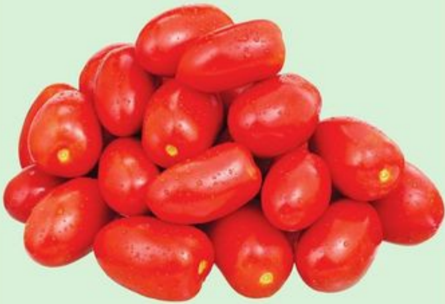
GREENHOUSE ROMA TOMATOES PRODUCT OF MEXICO 6.15/KG 20143381001_KG