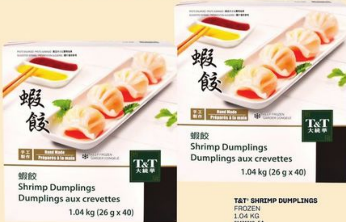
蝦餃 Shrimp Dumplings Dumplings aux crevettes 1.04 kg (26 g x 40)