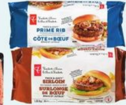
PC™ BURGERS SELECTED VARIETIES, FROZEN 568 G-1.36 KG 20941230_EA/ 20941443_EA