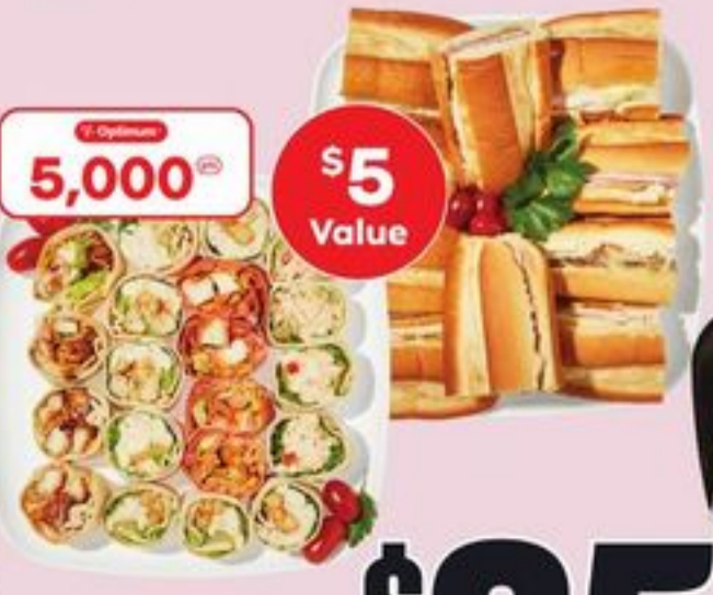
PIN WHEELS WRAP OR SMALL GAME NIGHT PLATTER EACH 21558135_EA/21557919_EA