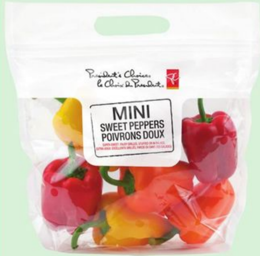
PC ® MINI PEPPERS PRODUCT OF CANADA 454 G 20920821001_EA