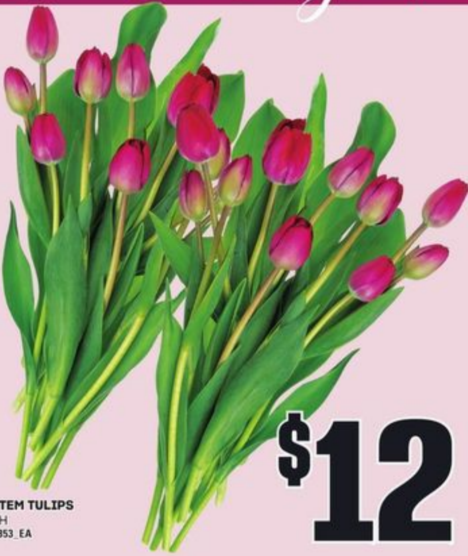
10 STEM TULIPS EACH 21521853_EA