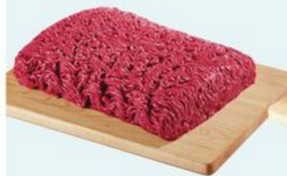
LEAN GROUND BEEF FAMILY SIZE 15.41/KG 20782821_KG