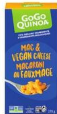
GOGO QUINOA MAC & VEGAN CHEESE SELECTED VARIETIES 170 G 21380709_EA