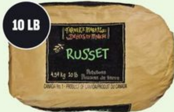
ATLANTIC FARMER'S MARKET™ RUSSET POTATOES PRODUCT OF ATLANTIC CANADA, CANADA NO. 1 GRADE 10 LB BAG 20601020001_EA