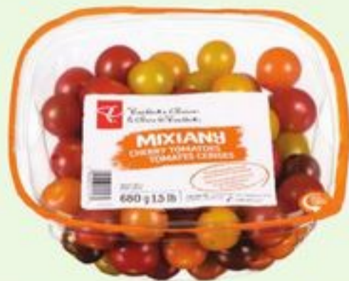
CANADA PC™ MIXIANY CHERRY TOMATOES PRODUCT OF CANADA 680 G 2128588001_EA