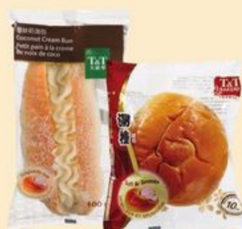
T&T® BAKERY BUNS SELECTED VARIETIES 90/100 G 20332833_EA 20334565_EA