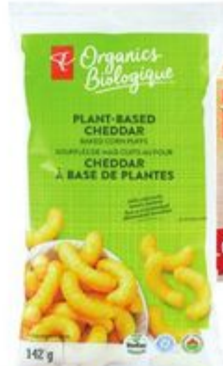
PC* GLUTEN-FREE WAFFLES OR PC* ORGANICS VEGAN PUFFS SELECTED VARIETIES 142-198 G 21358684_EA/21419163_EA