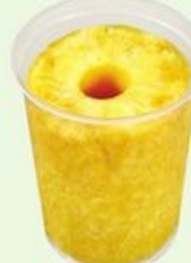
CORED PINEAPPLE MADE IN-STORE DAILY 600 G 20503143_EA