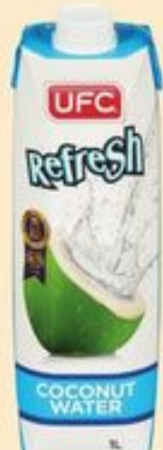
UFC REFRESH COCONUT WATER 1 L 20570506_EA