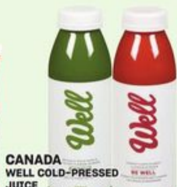
CANADA WELL COLD-PRESSED JUICE PRODUCT OF CANADA, SELECTED VARIETIES 333 ML 21186483_EA/ 21186518_EA