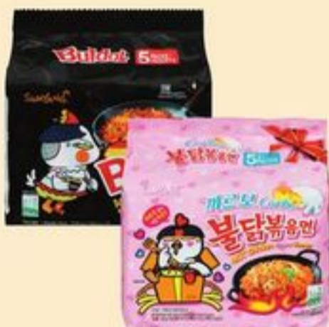
SAMYANG BULDAK RAMEN SELECTED VARIETIES 650-700 G 21345870_C05 21450283_EA