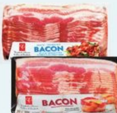
PC™ NATURALLY SMOKED BACON SELECTED VARIETIES 375-500 G 20057892_EA/20152629_EA