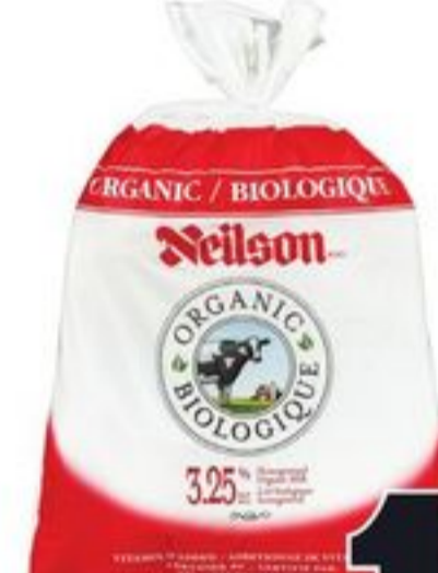
NEILSON ORGANIC MILK SELECTED VARIETIES 4 L 20711395_EA