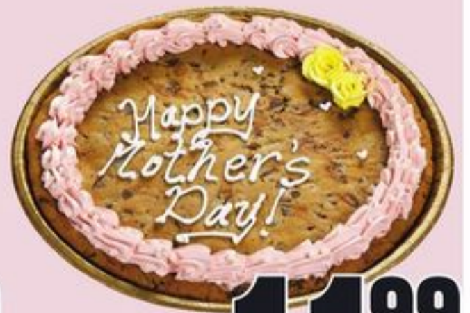
BAKED MOTHER'S DAY MESSAGE COOKIE CAKE 612 G 20966119_C10