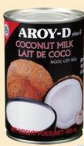
AROY-D COCONUT MILK SELECTED VARIETIES 400 ML 20063864_EA