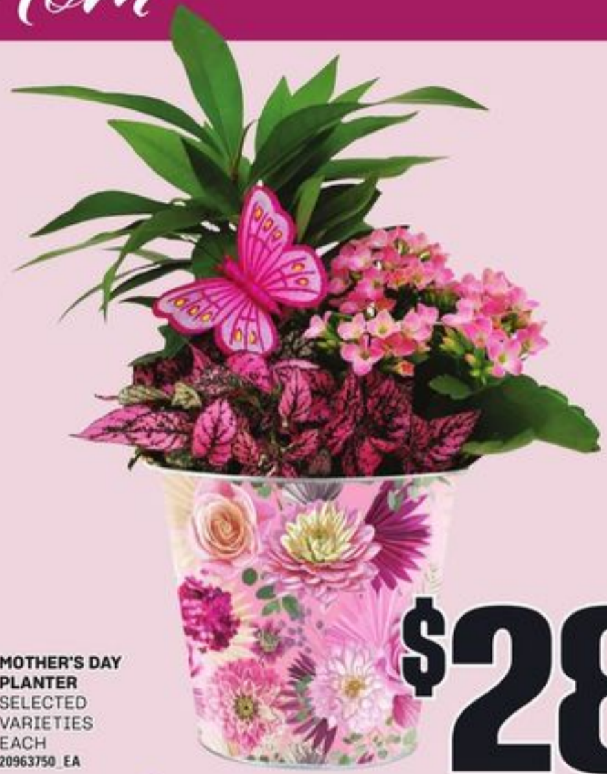
MOTHER'S DAY PLANTER SELECTED VARIETIES EACH 20963750_EA