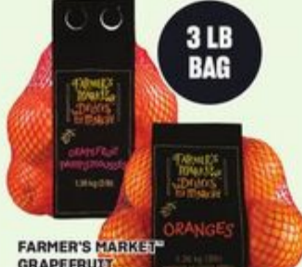
FARMER'S MARKET™ GRAPEFRUIT OR NAVEL ORANGES PRODUCT OF SPAIN, MOROCCO OR TURKEY 3 LB 20118409001_EA/ 20162945001_EA