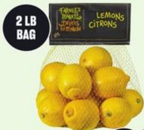
FARMER'S MARKET™ LEMONS PRODUCT OF SOUTH AFRICA 2 LB BAG 20795315001_EA