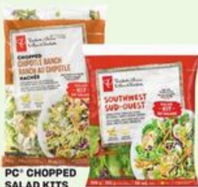
PC™ CHOPPED SALAD KITS PRODUCT OF U.S.A., SELECTED VARIETIES 285-369 G 21378071_EA/ 21378098_EA