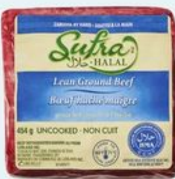
SUFRA™ HALAL LEAN GROUND BEEF 454 G 21397283_EA