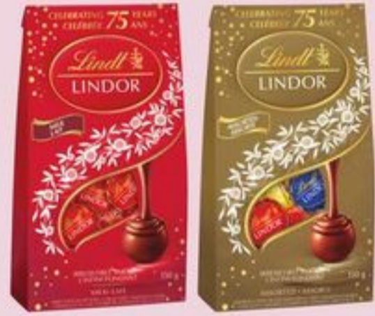
LINDOR OR GHIRARDELLI CHOCOLATE BAGS SELECTED VARIETIES 116-151 G 21390291_EA 21390363_EA