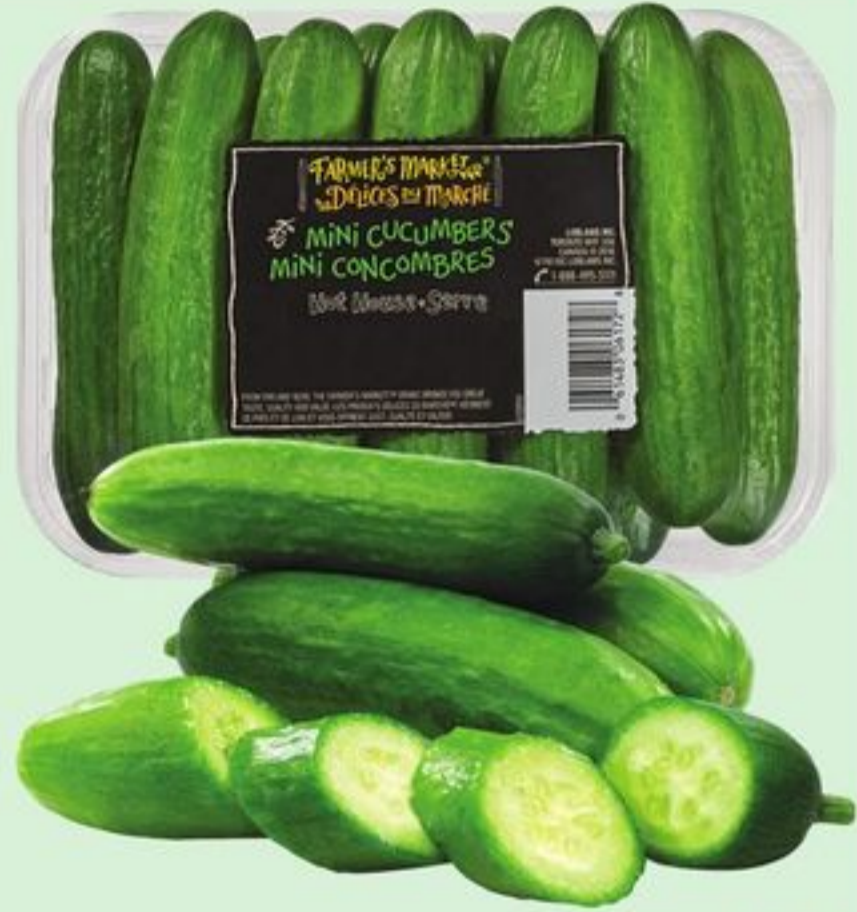
FARMER'S MARKET SM MINI CUCUMBERS PRODUCT OF ATLANTIC CANADA 11'S 21070679001_EA