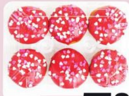
MINI MOTHER'S DAY DONUTS 6'S 21355442_EA