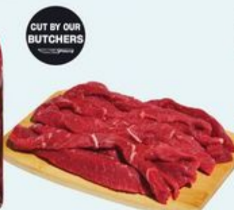
BEEF STIR FRY STRIPS 250 G 21588067_EA