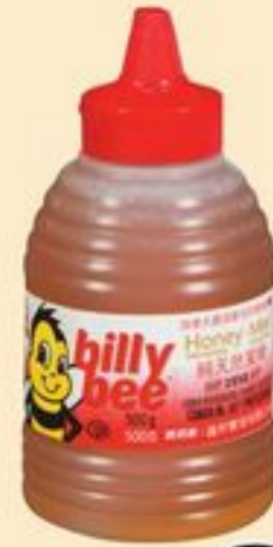
BILLY BEE HONEY 500 G 21001564_EA