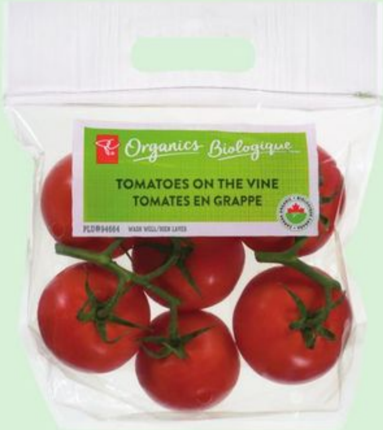
PC ® ORGANICS TOMATOES ON THE VINE PRODUCT OF CANADA 11.00/KG 20127917001_KG