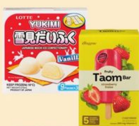
BINGGRAE T'AOM ICE BAR, 5'S OR LOTTE MOCHI 270 G SELECTED VARIETIES FROZEN 21247111_EA 21566306_EA