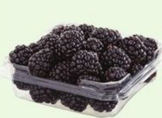
BLACKBERRIES PRODUCT OF MEXICO 170 G 20051015001_EA