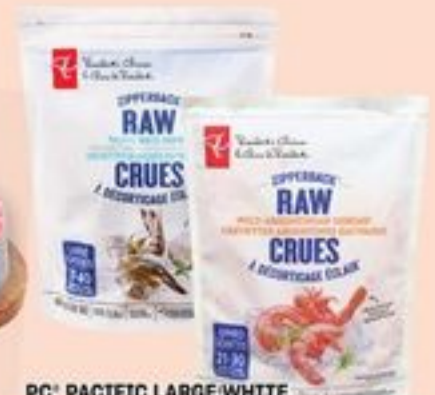
PC™ PACIFIC LARGE WHITE 31-40 PER LB 400 G OR JUMBO WILD ARGENTINIAN SHRIMP RAW ZIPPERBACK™ 21-30 PER LB 340 G FROZEN 20788888_EA/21332386_EA