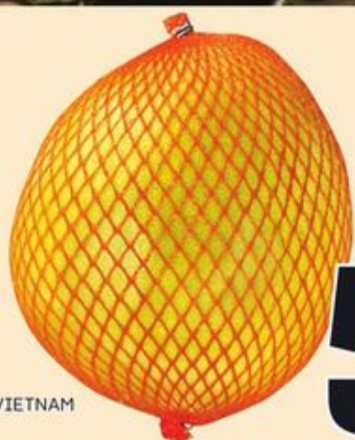
RED POMELO PRODUCT OF VIETNAM 20081390001_KG