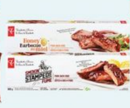
PC™ BBQ PORK BACK RIBS FULLY COOKED, SELECTED VARIETIES 500 G 21284538_EA/21284542_EA