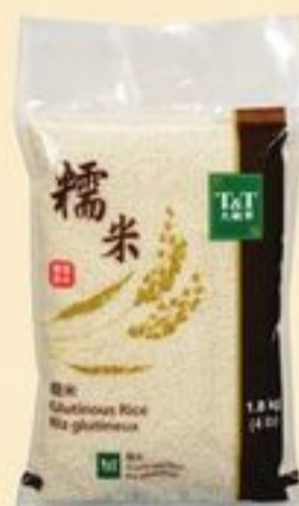
T&T® GLUTINOUS RICE 1.8 KG 20828956_EA