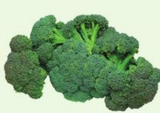
BROCCOLI CROWNS PRODUCT OF MEXICO OR U.S.A. EACH 21121560001_EA