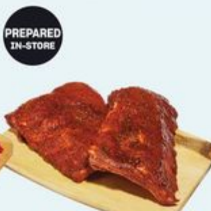
MARINATED PORK BACK RIBS 13.21/KG 21418296_KG