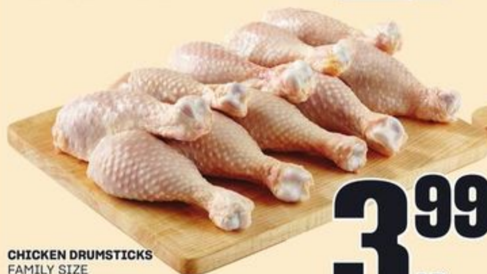
CHICKEN DRUMSTICKS FAMILY SIZE 8.80/KG 20707253_KG

Optimum Members-Only Price™ 99¢ Non-members 1 49