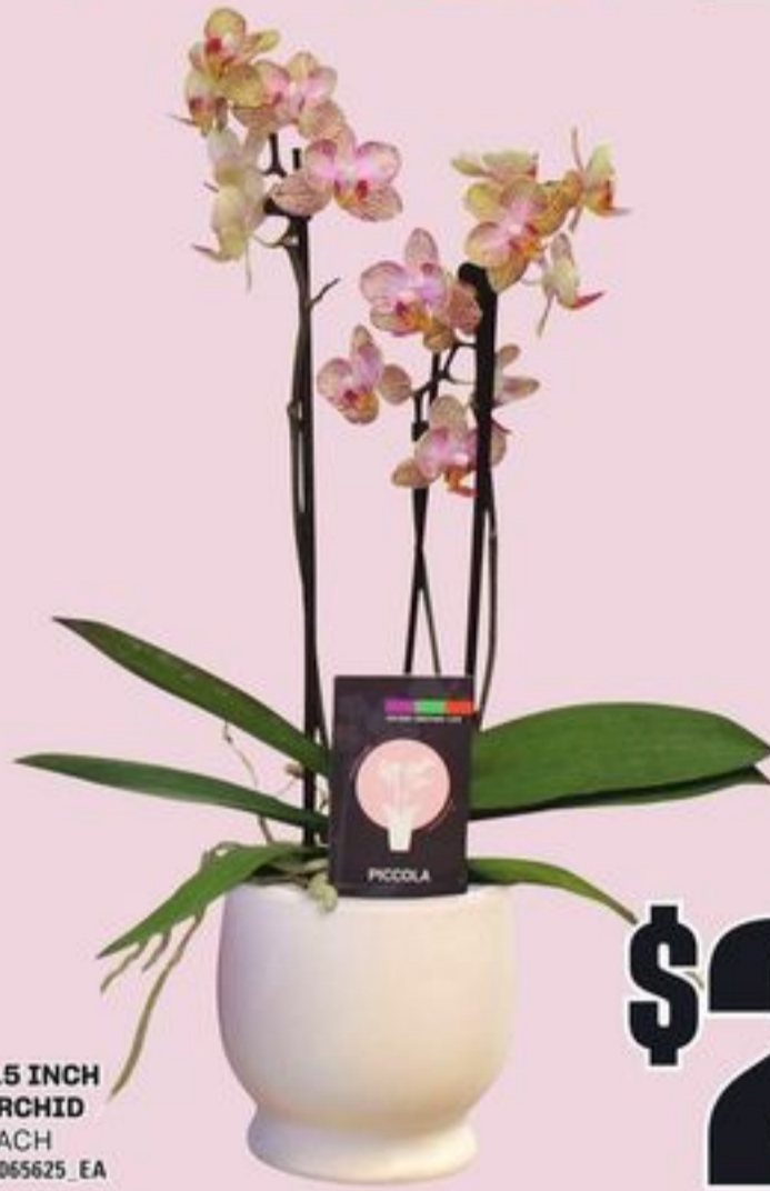
3.5 INCH ORCHID EACH 21065625_EA