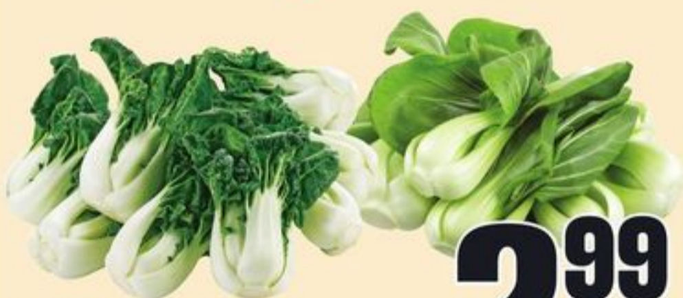
BABY OR SHANGHAI BOK CHOY PRODUCT OF MEXICO 6.59/KG 20082279001_KG/20032454001_KG