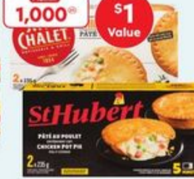
ST-HUBERT OR SWISS CHALET SINGLE PIES FROZEN 470 G 21047000_EA/21047192_EA