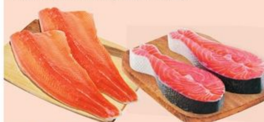
STEELHEAD TROUT FILLETS FROZEN OR PREVIOUSLY FROZEN 24.23/KG 21478771_KG

Fresh seafood items subject to availability.