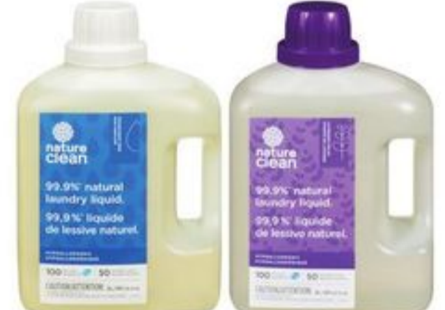
NATURE CLEAN LAUNDRY LIQUID 3 L, PLASTIC FREE LAUNDRY OR CLEANER STRIPS 32/36'S SELECTED VARIETIES 20067905_EA/20757371001_EA