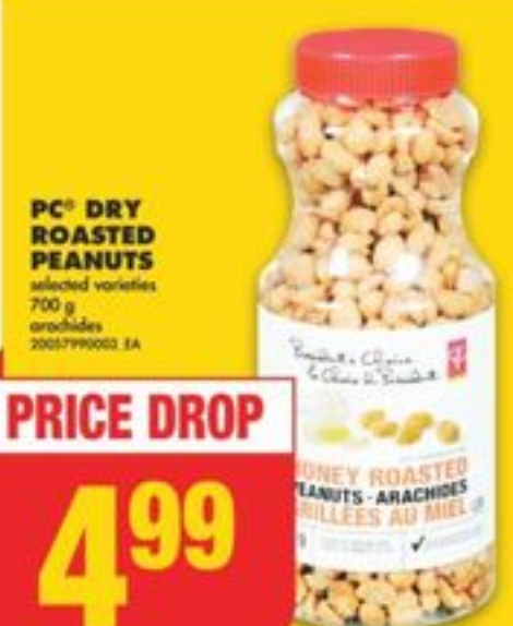
PC® DRY ROASTED PEANUTS selected varieties 700 g arachides 2005799002 SA