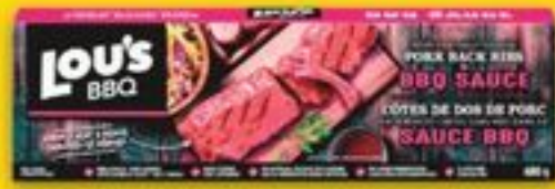
LOU'S PORK BACK RIBS selected varieties, frozen 680 g côtes de dos 21320777 SA