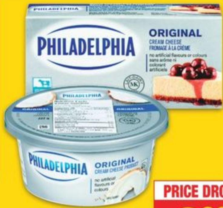
PHILADELPHIA CREAM CHEESE PRODUCT selected varieties 227/250 g produit de fromage à la crème 20641267 SA/2064492610 SA