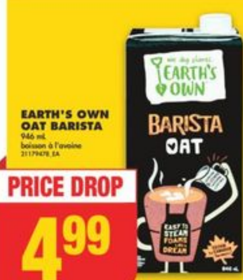
EARTH'S OWN OAT BARISTA 946 mL boisson à l'avoine 21179478 SA