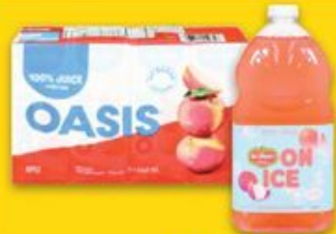
OASIS JUICE or ARIZONA ICED TEA, ALLEN'S APPLE CRANBERRY COCKTAIL or DEL MONTE ON ICE REFRESHERS 1.89 L selected varieties jus ou thé glacé ou boissons 20313744002 SA/21375061 SA