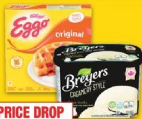
EGGO WAFFLES 16's or BREYERS CREAMERY STYLE ICE CREAM 1.66 L selected varieties, frozen gâteaux ou crème glacée 20099730004 SA/20344920004 SA