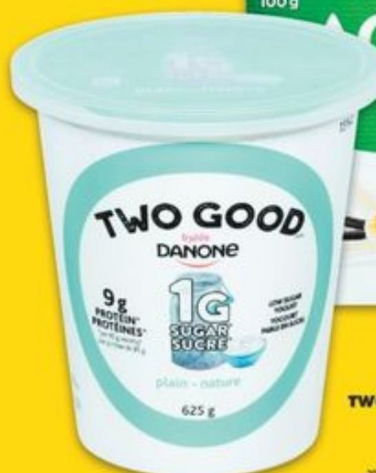
DANONE ACTIVIA 8%, MIX & GO VANILLA 2% or TWO GOOD LOW SUGAR YOGURT selected varieties yogourt 20325384002 SA/21477313 SA