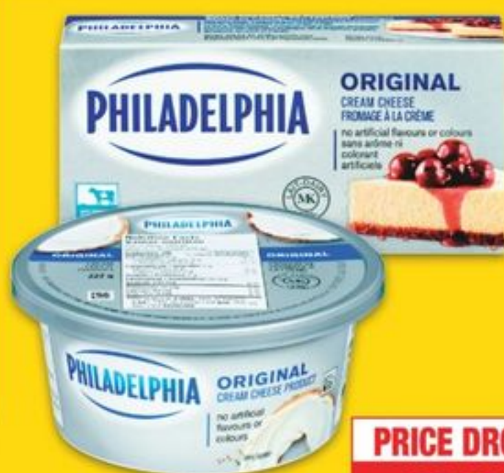
PHILADELPHIA CREAM CHEESE PRODUCT selected varieties 227/250 g produit de fromage à la crème 20641267 SA/20644924010 SA