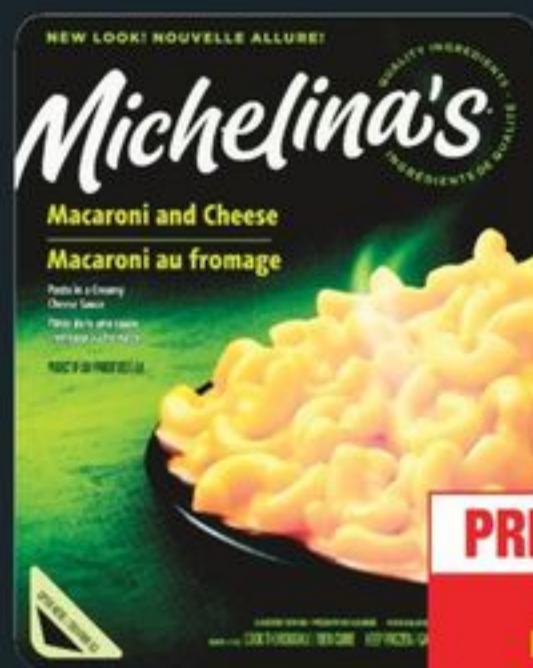
MICHELINA'S DINNER ENTRÉES selected varieties, frozen 156-284 g 3120614 EA