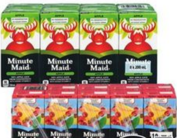
MINUTE MAID, FIVE ALIVE OR NESTEA ICED TEA DRINK BOXES SELECTED VARIETIES 8/10X200 ML 20327042001_EA/21092667_EA