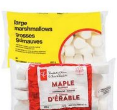
NO NAME® MARSHMALLOWS SELECTED VARIETIES 400 G 20304672001_EA 21008975_EA