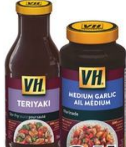
VH SAUCES SELECTED VARIETIES 341/355 ML 20308726001_EA/20309693001_EA