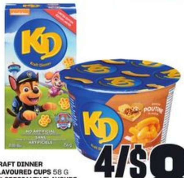
KRAFT DINNER FLAVOURED CUPS 58 G OR SPECIALTY FLAVOURS 150-200 G SELECTED VARIETIES 21393426_EA/21435132_EA