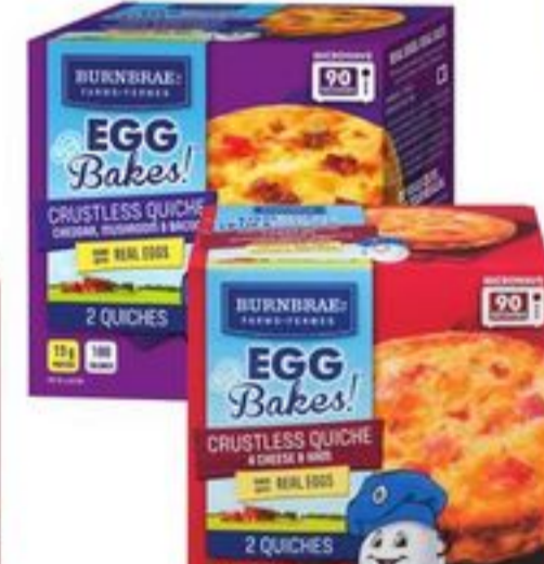
BURNBRAE EGG BAKES SELECTED VARIETIES FROZEN 2/4'S 21060391_EA/21097732_EA