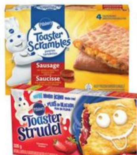
PILLSBURY TOASTER STRUDEL 326 G OR SCRAMBLES 204 G SELECTED VARIETIES FROZEN 20172664001_EA/21474507_EA