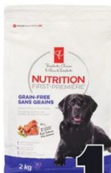
PC ® NUTRITION FIRST ® DOG FOOD SELECTED VARIETIES 2 KG 21307661_EA