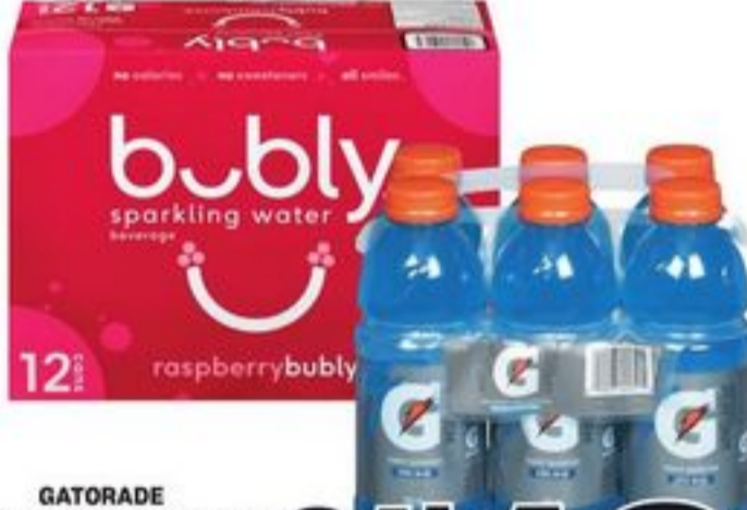
GATORADE 6X591 ML OR BUBLY SPARKLING WATER 12X355 ML OR MONTELLIER 10X355 ML SELECTED VARIETIES 20303218003_C06 21568926_C12