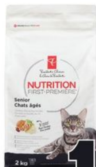
PC ® NUTRITION FIRST ® CAT FOOD SELECTED VARIETIES 2 KG 21303270_EA