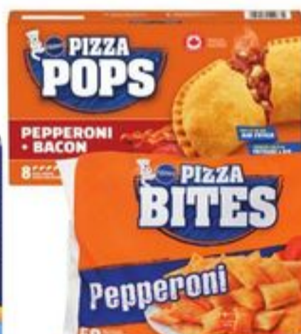
PILLSBURY PIZZA POPS 760 G OR BITES 693 G SELECTED VARIETIES FROZEN 20972958_EA 21435931_EA