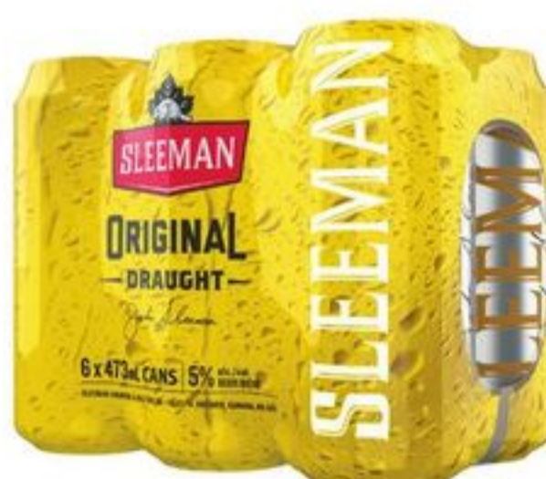
SLEEMAN ORIGINAL DRAUGHT 6X473 ML CANS 20955192_C06