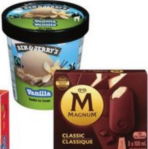
BEN & JERRY'S 473 ML OR MAGNUM BARS 4'S SELECTED VARIETIES FROZEN 20950739_EA/21568089_EA