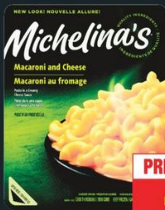
MICHELINA'S DINNER ENTRÉES selected varieties, frozen 156-284 g 3120614 EA