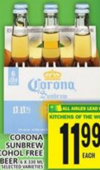
CORONA SUNBREW ALCOHOL FREE BEER 6 x 330 ML SELECTED VARIETIES

ALL AISLES LEAD HOME KITCHENS OF THE WORLD 2.49 EACH