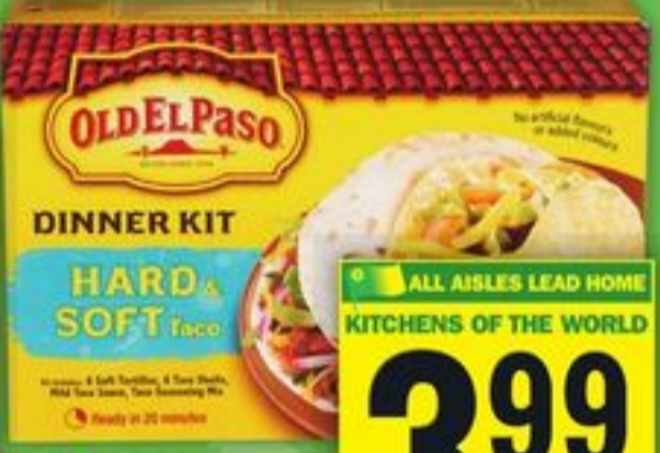
OLD EL PASO TACO KIT 250 / 400 G SALSA 650 ML SELECTED VARIETIES

ALL AISLES LEAD HOME KITCHENS OF THE WORLD 3.99 EACH