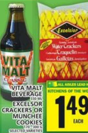
VITA MALT BEVERAGE 1.7 / 200 G EXCELSIOR CRACKERS OR MUNGHEE COOKIES SELECTED VARIETIES

ALL AISLES LEAD HOME KITCHENS OF THE WORLD 7.99 EACH