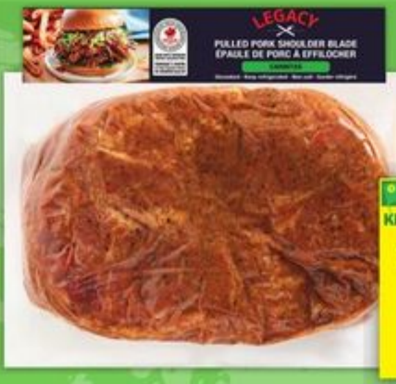
LEGACY CARNITA PULLED PORK ROAST 1 KG SELECTED VARIETIES

ALL AISLES LEAD HOME KITCHENS OF THE WORLD 9.49 EACH