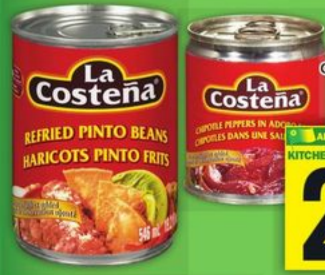
LA COSTEÑA CANNED BEANS 528 / 546 ML MARINADES 186 / 477 ML SELECTED VARIETIES

ALL AISLES LEAD HOME KITCHENS OF THE WORLD 1.79 EACH