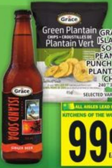
GRACE ISLAND SODA, PEANUT PUNCH OR PLANTAIN CHIPS 240 / 355 ML 85 G SELECTED VARIETIES

ALL AISLES LEAD HOME KITCHENS OF THE WORLD 1.49 EACH