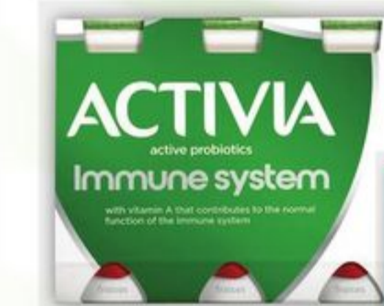
ACTIVIA DRINKABLE YOGURT 8.5 SELECTED VARIETIES