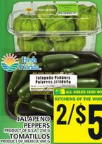
JALAPENO PEPPERS PRODUCT OF MEXICO TOMATILLOS PRODUCT OF MEXICO

ALL AISLES LEAD HOME KITCHENS OF THE WORLD 99¢ EACH