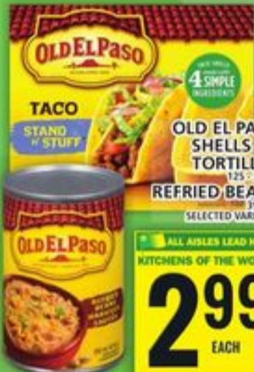
OLD EL PASO TACO SHELLS OR TORTILLAS 125 / 134 G REFRIED BEANS 398 ML SELECTED VARIETIES

ALL AISLES LEAD HOME KITCHENS OF THE WORLD 3.99 EACH