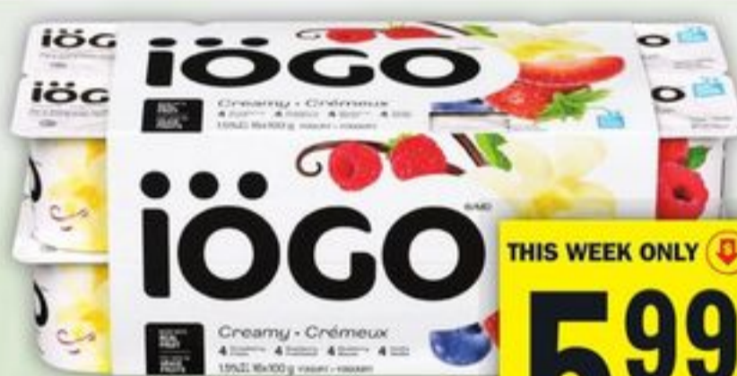
IÖGO YOGURT 16.5 SELECTED VARIETIES