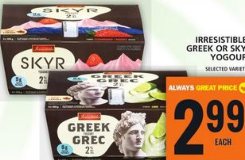
IRRESISTIBLES GREEK OR SKYR YOGURT 4.5 SELECTED VARIETIES