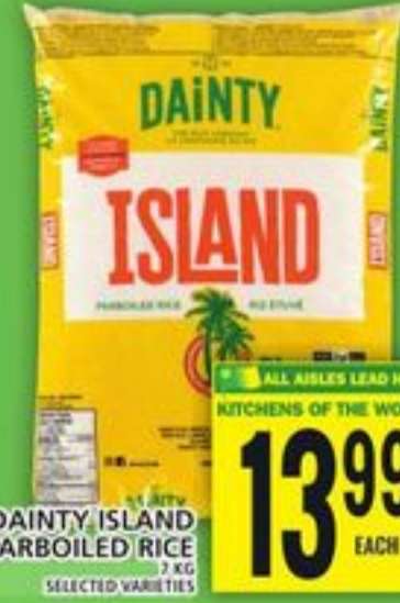
DAINTY ISLAND PARBOILED RICE 1.7 / 200 G SELECTED VARIETIES

ALL AISLES LEAD HOME KITCHENS OF THE WORLD 2.79 EACH