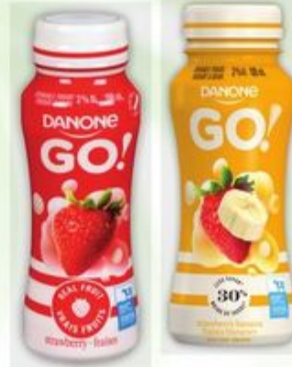
DANONE GO! DRINKABLE YOGURT 190 ML SELECTED VARIETIES