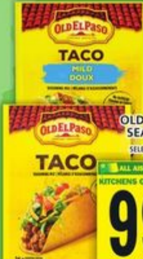
OLD EL PASO TACO SEASONING 24 G SELECTED VARIETIES

ALL AISLES LEAD HOME KITCHENS OF THE WORLD 2.99 EACH