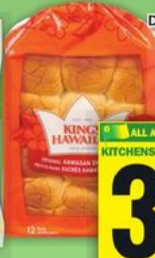
DON PANCHO TORTILLAS 700 G KING'S HAWAIIAN ROLLS 312 / 340 G SELECTED VARIETIES

ALL AISLES LEAD HOME KITCHENS OF THE WORLD 3.99 EACH