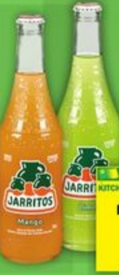
JARRITOS SODA 370 ML SELECTED VARIETIES

ALL AISLES LEAD HOME KITCHENS OF THE WORLD 3.49 EACH