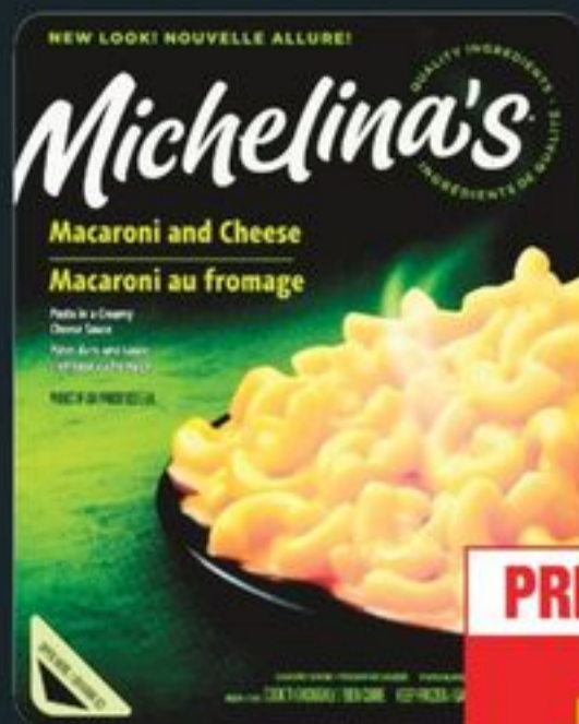
MICHELINA'S DINNER ENTRÉES selected varieties, frozen 156-204 g plats cuisinés 2120814 EA