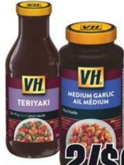
VH SAUCES SELECTED VARIETIES 341/355 ML 20308726001_EA/20309693001_EA