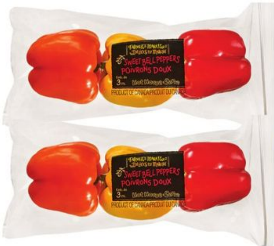
FARMER'S MARKET™ GREENHOUSE PEPPERS PRODUCT OF WESTERN PROVINCES 3'S 20085851001_EA