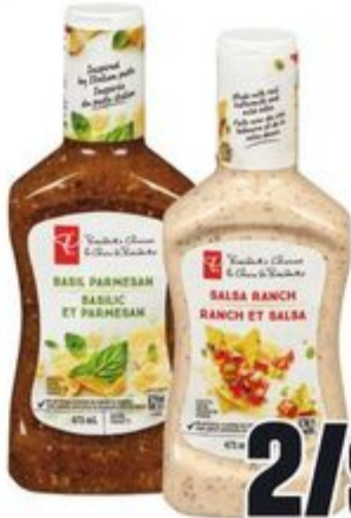
PC® SALAD DRESSING SELECTED VARIETIES 475 ML 20627618001_EA/20627618005_EA

Members save $2 Optimum Members-Only Price 6 99 Non-members 8 99