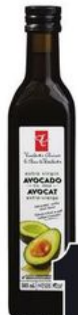
PC® AVOCADO OIL 500 ML 20332066_EA