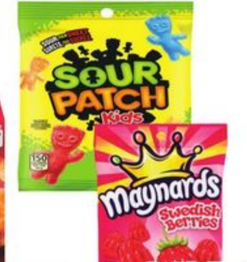
MAYNARDS CANDY SELECTED VARIETIES 150-154 G 21545554_EA/21545605_EA