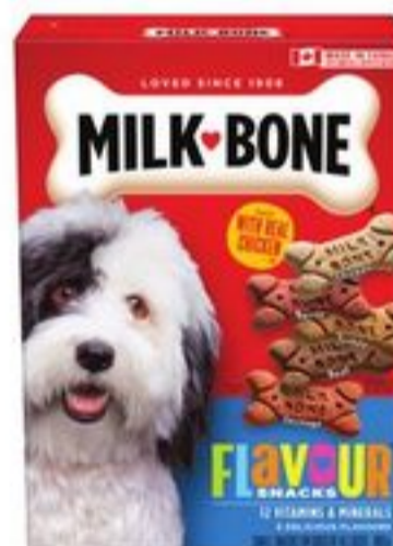
MILK BONE DOG TREATS SELECTED VARIETIES 750-900 G 21014573_EA