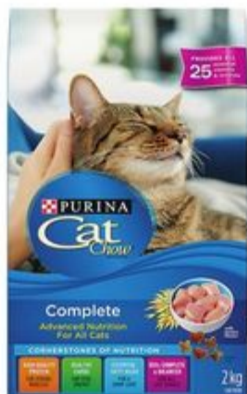
PURINA CAT CHOW SELECTED VARIETIES 1.42-2 KG 20319556001_EA