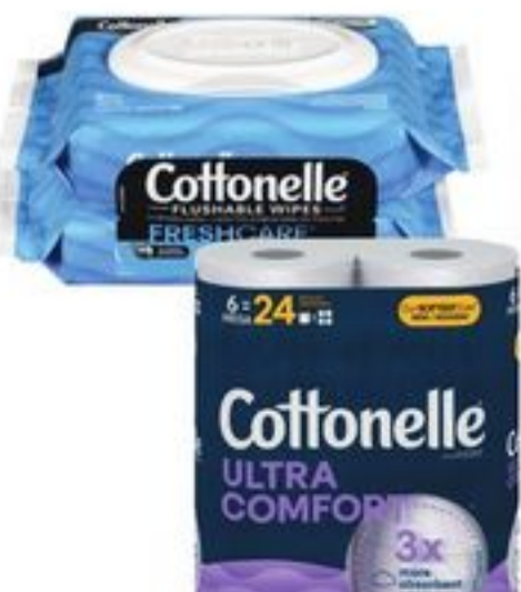
COTTONELLE BATHROOM TISSUE 6-24 ROLLS OR FLUSHABLE WIPES 2'S SELECTED VARIETIES 20688530_EA/21594641_EA