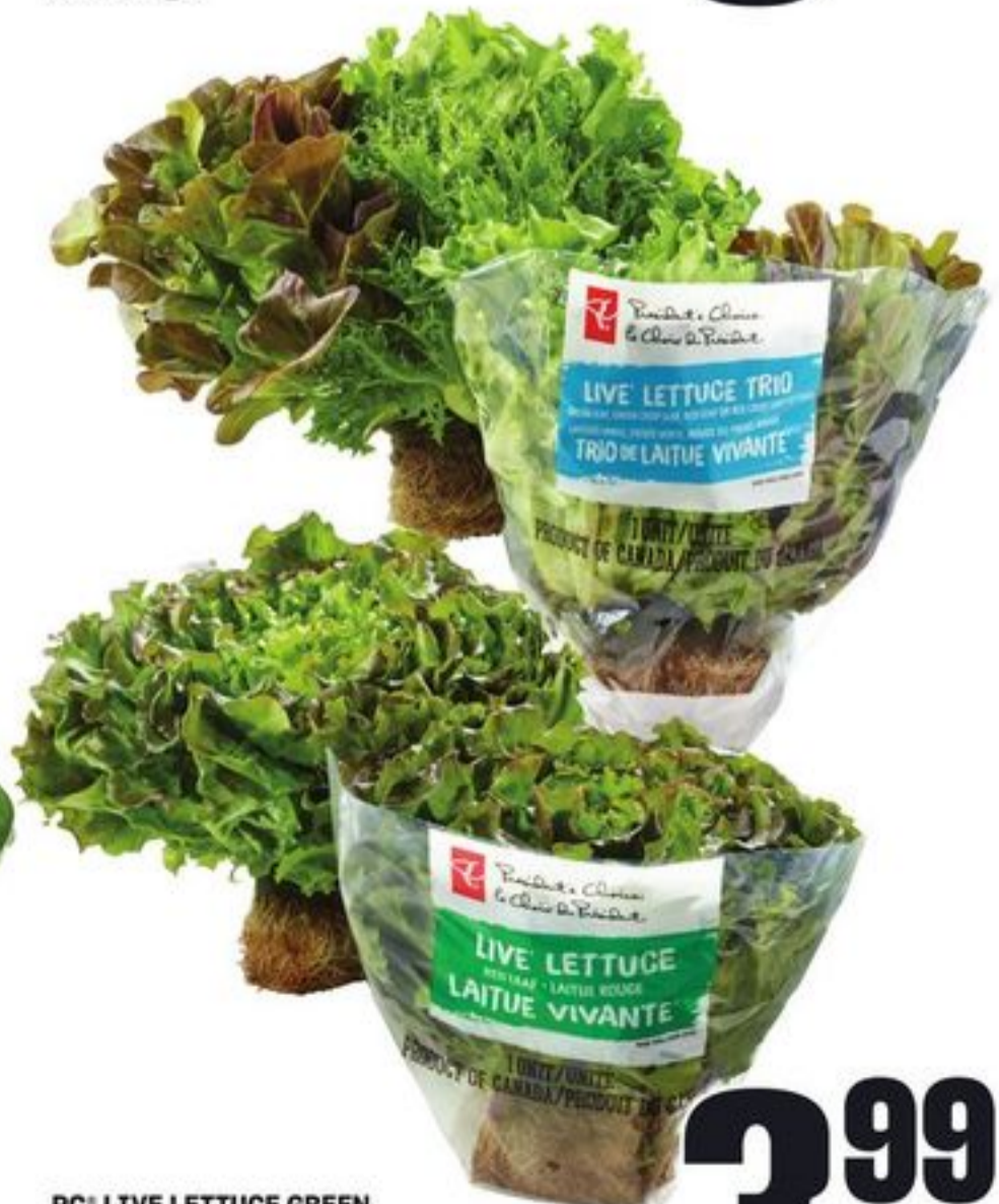
PC® LIVE LETTUCE GREEN, RED OR TRIO PRODUCT OF CANADA EACH 21178855_EA/21506580_EA