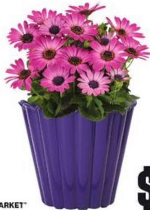
FARMER'S MARKET® 8 INCH EARLY ANNUAL PLANTER SELECTED VARIETIES 21214982_EA