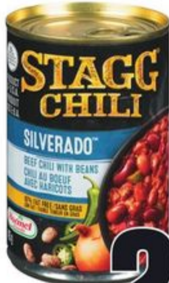
STAGG CHILI SELECTED VARIETIES 425 G 20309125004_EA