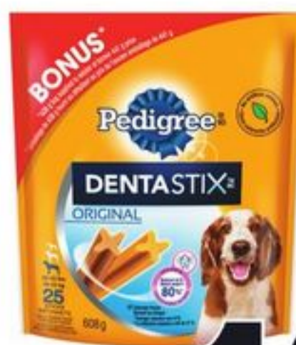
PEDIGREE DENTASTIX TREATS FOR DOGS SELECTED VARIETIES 100 G-1.9 KG 21081180_EA