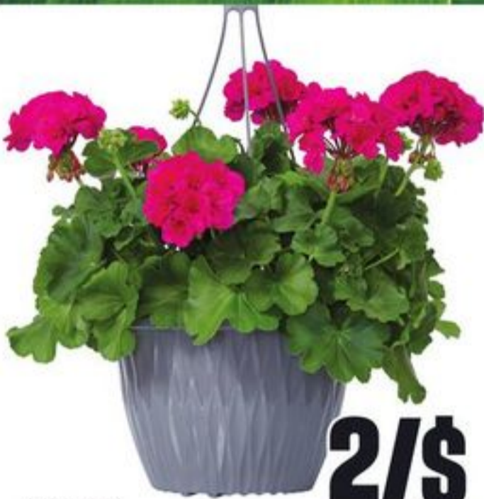
PC® 11 INCH DELUXE ANNUAL HANGING BASKET EACH 20753918_EA