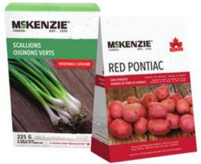
SEED POTATOES, ONIONS AND SHALLOTS SOURCED FROM CANADIAN FARMERS 21515074_EA 21348211_EA