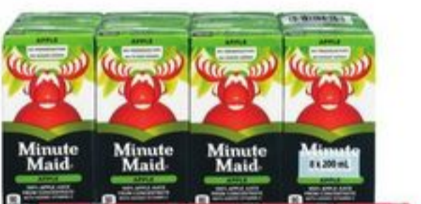
MINUTE MAID, FIVE ALIVE OR NESTEA ICED TEA DRINK BOXES SELECTED VARIETIES 8/10X200 ML 20327042001_EA/21092667_EA