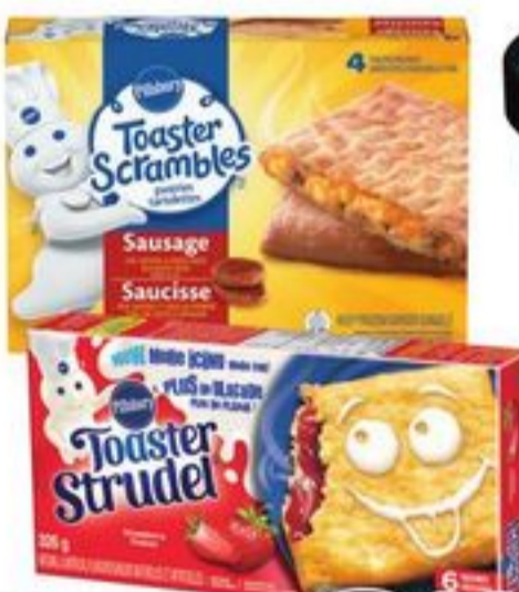
PILLSBURY TOASTER STRUDEL 326 G OR SCRAMBLES 204 G SELECTED VARIETIES FROZEN 20172664001_EA/21474507_EA