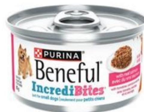
BENEFUL INCREDI BITES 85 G 21576867_EA