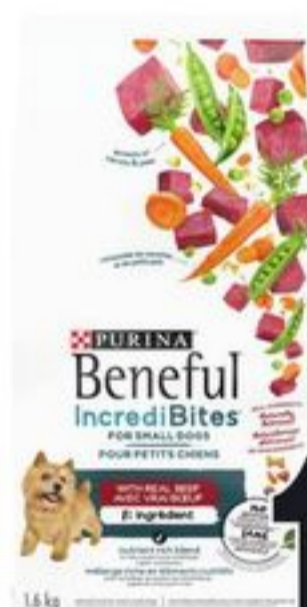
BENEFUL DOG FOOD SELECTED VARIETIES 1.6/1.8 KG 20295905001_EA