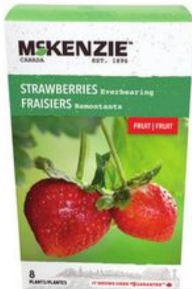
GROW YOUR OWN SELECTION OF FRUITS AND VEGETABLES SELECTED VARIETIES 21515163_EA