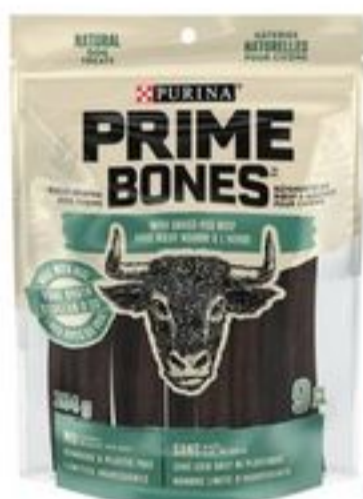
PRIME BONES TREATS FOR DOGS SELECTED VARIETIES 264-320 G 21357812_EA