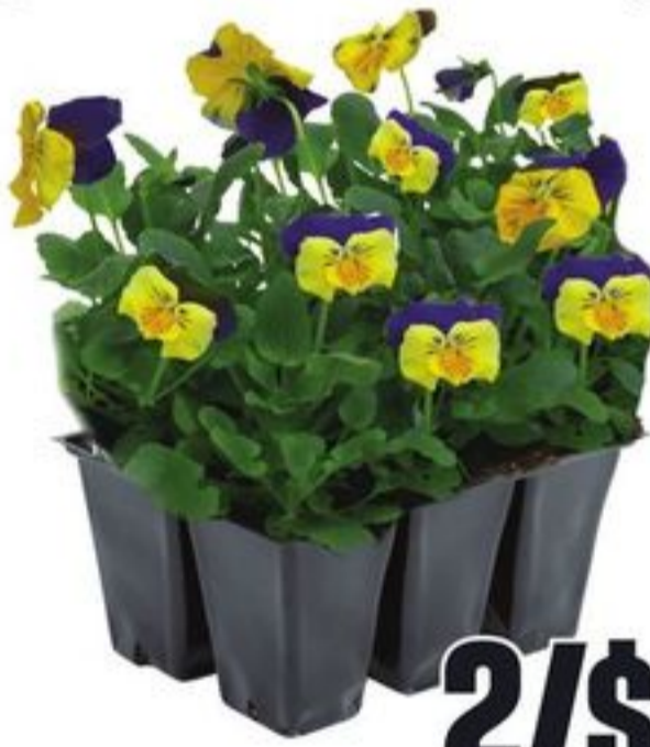
3.5 INCH ANNUALS SELECTED VARIETIES 6'S 21351207_EA