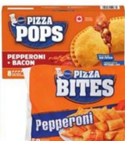
PILLSBURY PIZZA POPS 760 G OR BITES 693 G SELECTED VARIETIES FROZEN 20972958_EA 21435931_EA