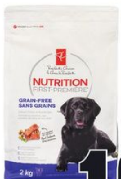
PC ® NUTRITION FIRST ® DOG FOOD SELECTED VARIETIES 2 KG 21307661_EA