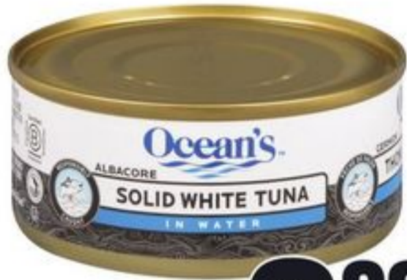
OCEAN'S WHITE TUNA SELECTED VARIETIES 170 G 21005158_EA