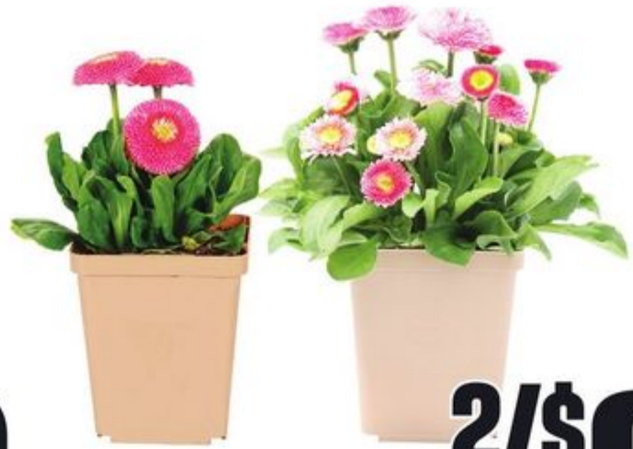
PC® 9 CM PERENNIALS SELECTED VARIETIES 21350463_EA