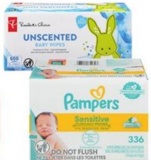
PC®, HUGGIES OR PAMPERS 6'S BABY WIPES 352-600'S SELECTED VARIETIES 21102958_EA 21271645_EA