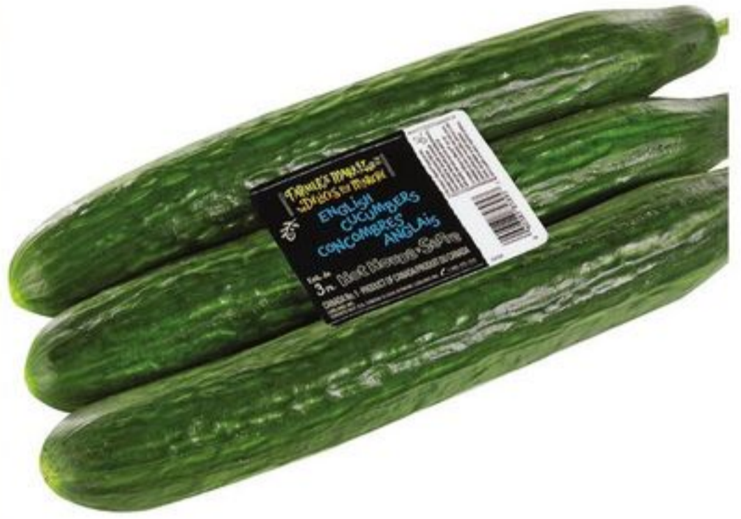
FARMER'S MARKET™ ENGLISH CUCUMBERS PRODUCT OF WESTERN PROVINCES 3'S 20828461001_EA