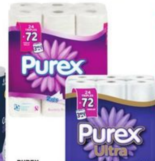
PUREX BATHROOM TISSUE SELECTED VARIETIES 24-72 ROLLS 21189854_EA 21443672_EA