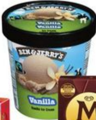
BEN & JERRY'S 473 ML OR MAGNUM BARS 4'S SELECTED VARIETIES FROZEN 20950739_EA/21568089_EA