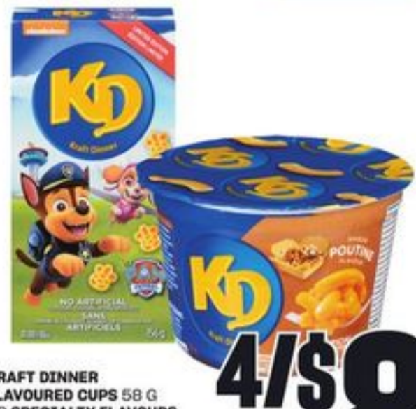
KRAFT DINNER FLAVOURED CUPS 58 G OR SPECIALTY FLAVOURS 150-200 G SELECTED VARIETIES 21393426_EA/21435132_EA