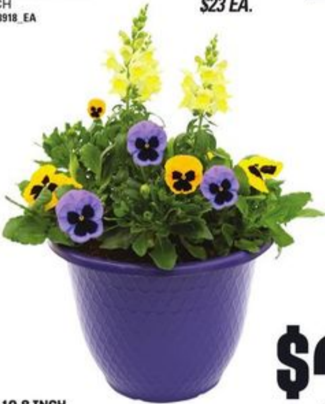
PC® 10.8 INCH EARLY ANNUAL PLANTER SELECTED VARIETIES 20753967_EA