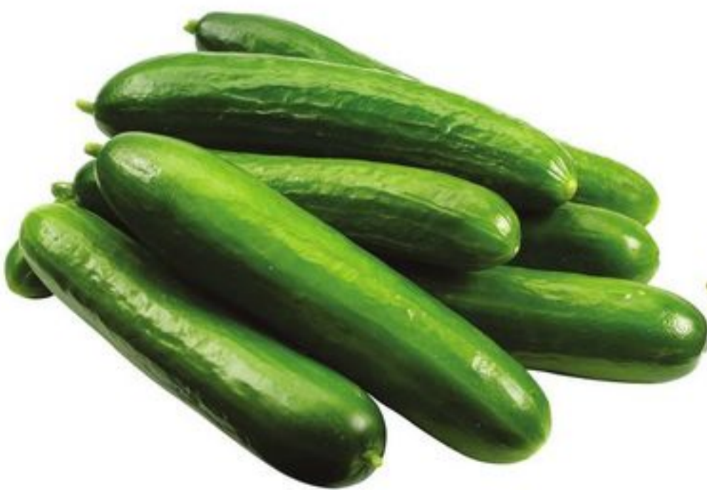
ORGANIC MINI CUCUMBERS PRODUCT OF MEXICO 6'S 20935931001_EA