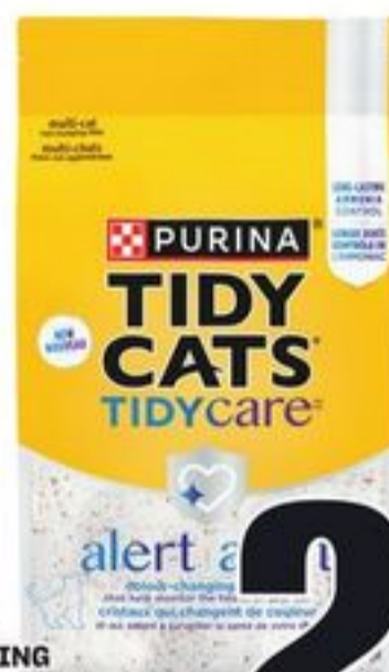
TIDY CATS TIDY CARE ALERT COLOUR CHANGING CRYSTALS CAT LITTER 3.63 KG 21581080_EA