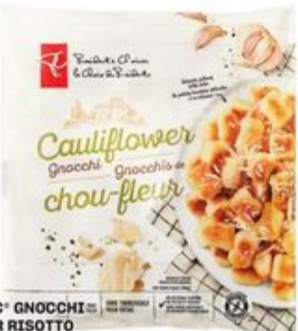
PC® GNOCCHI OR RISOTTO 350-400 G OR PC® ASIAN ENTRÉES OR SOUPS 300 G SELECTED VARIETIES, FROZEN 21546584_EA 21546625_EA