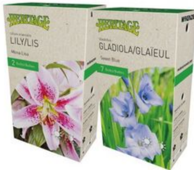
SPRING BULBS PLANT NOW FOR SUMMER BLOOMS SELECTED VARIETIES 21357246_EA/21357249_EA