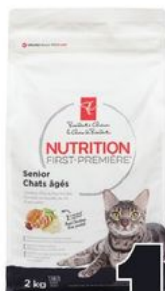
PC ® NUTRITION FIRST ® CAT FOOD SELECTED VARIETIES 2 KG 21303270_EA