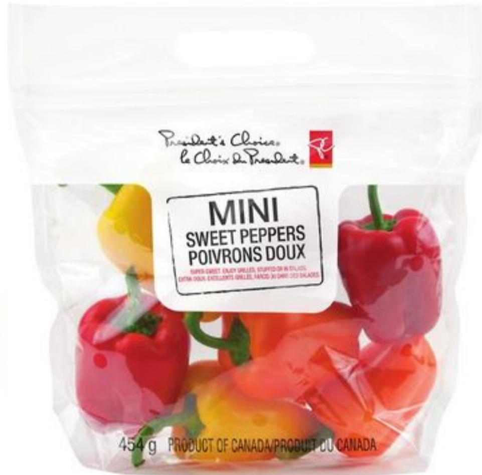
PC® MINI PEPPERS PRODUCT OF CANADA 454 G 20889400001_EA