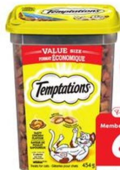
WHISKAS TEMPTATIONS CAT TREATS SELECTED VARIETIES 454 G 21012108_EA

Members save $2 Optimum Members-Only Price 6 99 Non-members 8 99