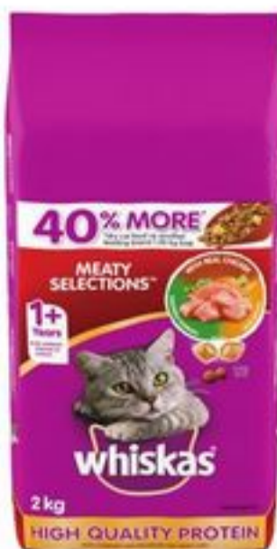
WHISKAS CAT FOOD SELECTED VARIETIES 1.5/2 KG 20754051_EA