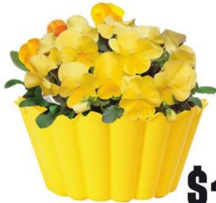
FARMER'S MARKET® 10 INCH PANSY BOWL SELECTED VARIETIES 20753921_EA