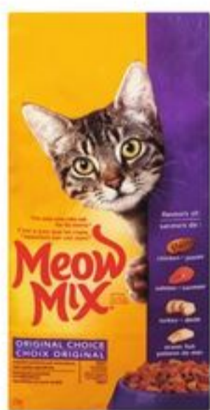
MEOW MIX CAT FOOD SELECTED VARIETIES 1.36-2 KG 21565150_EA