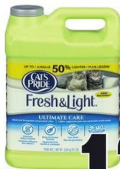
CAT'S PRIDE FRESH & LIGHT CAT LITTER SELECTED VARIETIES 3.86 KG 21352107_EA