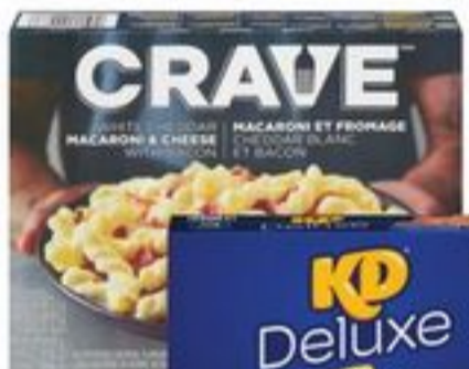
CRAVE OR KRAFT DINNER ENTRÉES SELECTED VARIETIES FROZEN 200-340 G 21085515_EA 21553329_EA