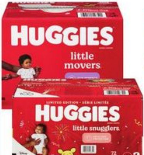
HUGGIES SUPER BIG PACK DIAPERS SELECTED VARIETIES 36-108'S 21456221_EA/21456311_EA