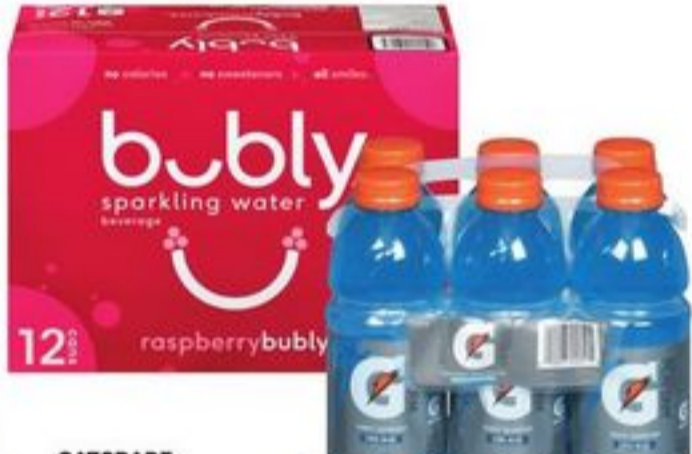
GATORADE 6X591 ML OR BUBLY SPARKLING WATER 12X355 ML OR MONTELLIER 10X355 ML SELECTED VARIETIES 20303218003_C06 21568926_C12