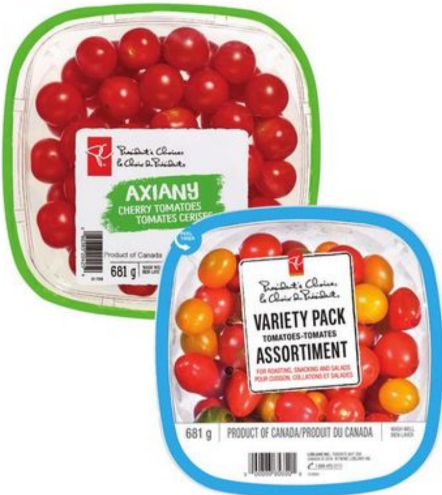
PC® AXIANY TOMATOES OR PC® TOMATO VARIETY PACK PRODUCT OF CANADA 681 G 21090447001_EA/20949866001_EA