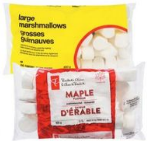
NO NAME® MARSHMALLOWS SELECTED VARIETIES 400 G 20304672001_EA 21008975_EA