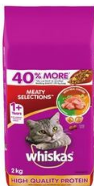
WHISKAS CAT FOOD SELECTED VARIETIES 1.5/2 KG 20754051_EA