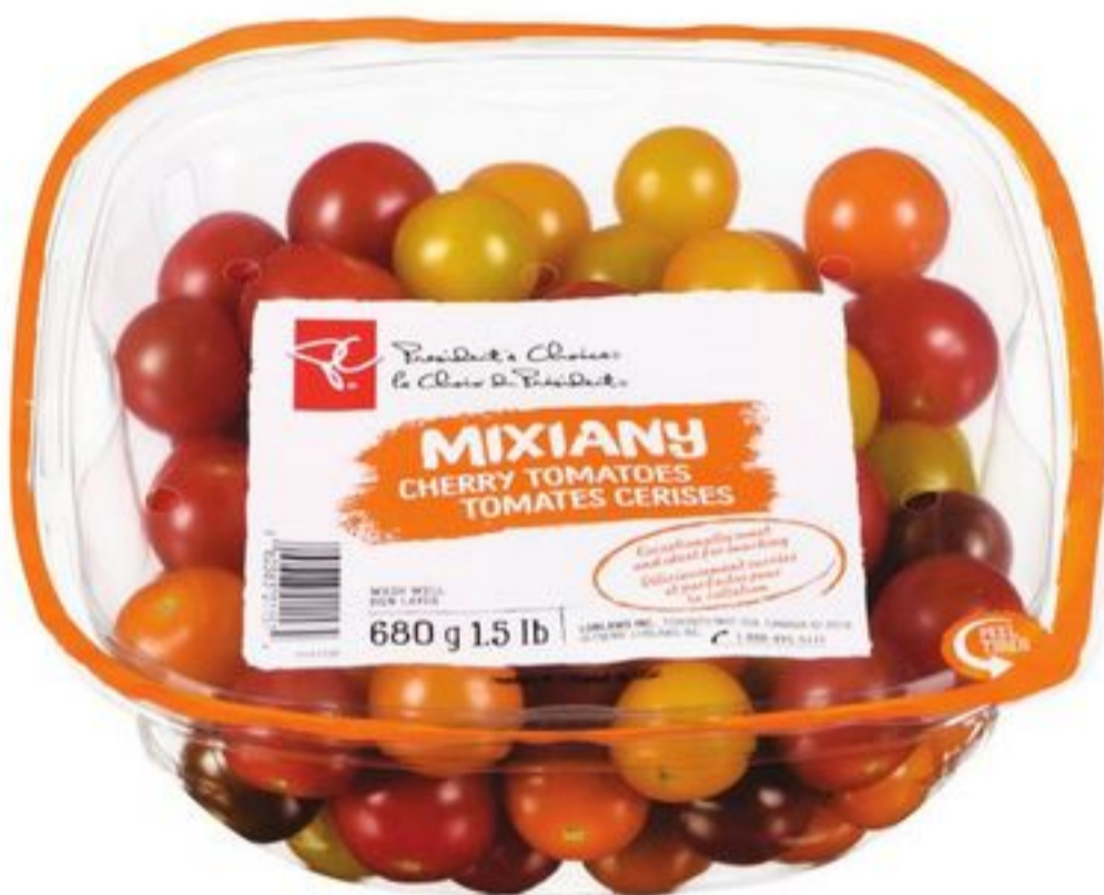
PC® MIXIANY CHERRY TOMATOES PRODUCT OF ONTARIO 680 G 21285888001_EA