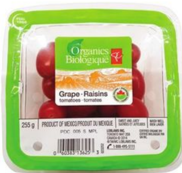
PC® ORGANICS GRAPE TOMATOES PRODUCT OF CANADA OR MEXICO 255 G 20799491001_EA