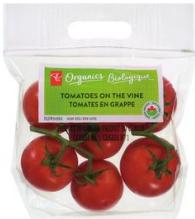
PC® ORGANICS TOMATOES ON THE VINE PRODUCT OF ONTARIO 7.69/KG 20127917001_KG