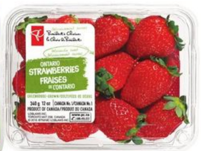
PC® GREENHOUSE STRAWBERRIES PRODUCT OF ONTARIO CANADA NO. 1 GRADE 340 G 21027142001_EA