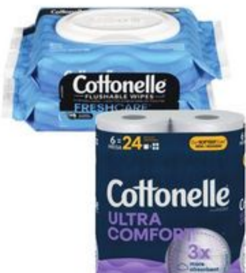
COTTONELLE BATHROOM TISSUE 6-24 ROLLS OR FLUSHABLE WIPES 2'S SELECTED VARIETIES 20688530_EA/21594641_EA