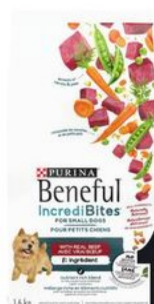
BENEFUL DOG FOOD SELECTED VARIETIES 1.6/1.8 KG 20295905001_EA