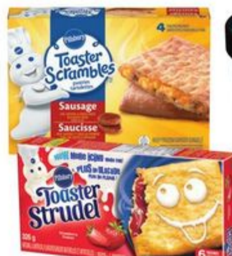
PILLSBURY TOASTER STRUDEL 326 G OR SCRAMBLES 204 G SELECTED VARIETIES FROZEN 20172664001_EA/21474507_EA