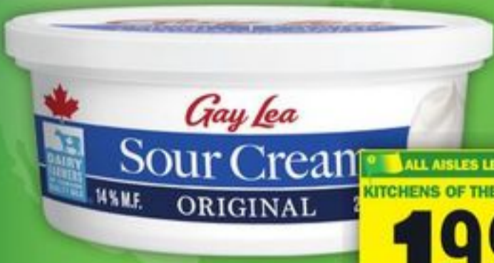
GAY LEA SOUR CREAM 250 ML SELECTED VARIETIES

ALL AISLES LEAD HOME KITCHENS OF THE WORLD 10.99 EACH