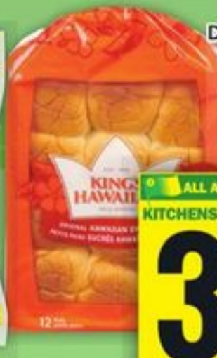
DON PANCHO TORTILLAS 700 G KING'S HAWAIIAN ROLLS 312 / 340 G SELECTED VARIETIES

ALL AISLES LEAD HOME KITCHENS OF THE WORLD 3.99 EACH