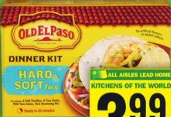
OLD EL PASO TACO KIT 250 / 400 G SALSA 500 ML SELECTED VARIETIES

ALL AISLES LEAD HOME KITCHENS OF THE WORLD 3.99 EACH