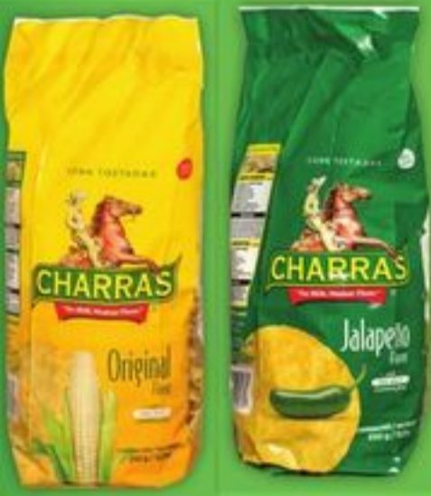
CHARRAS TOSTADAS CHIPS 350 G SELECTED VARIETIES

ALL AISLES LEAD HOME KITCHENS OF THE WORLD 11.99 EACH