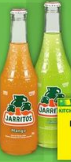
JARRITOS SODA 370 ML SELECTED VARIETIES

ALL AISLES LEAD HOME KITCHENS OF THE WORLD 3.49 EACH