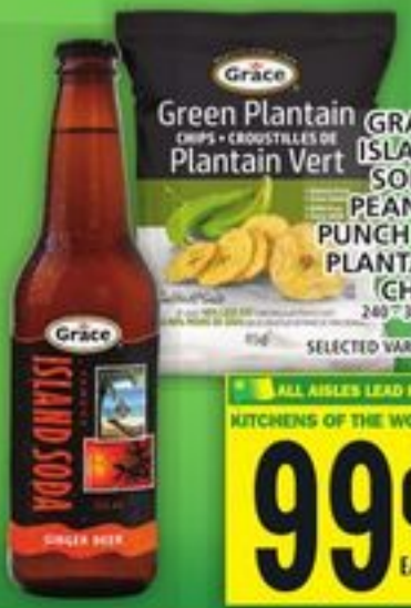
GRACE ISLAND SODA, PEANUT PUNCH OR PLANTAIN CHIPS 240 / 355 ML 85 G SELECTED VARIETIES

ALL AISLES LEAD HOME KITCHENS OF THE WORLD 1.49 EACH