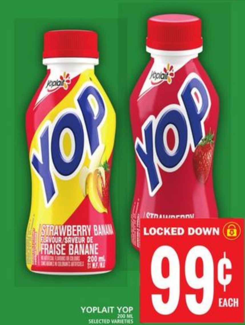
YOPLAIT YOP 200 ML SELECTED VARIETIES