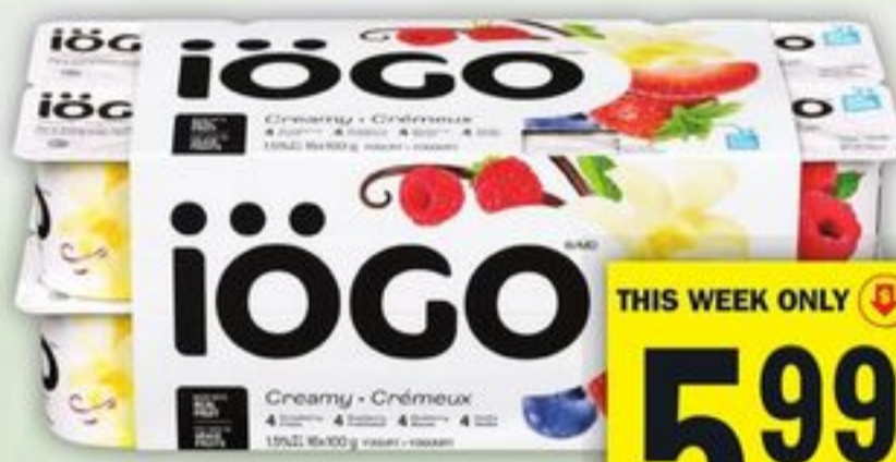
IÖGO YOGURT 16.5 SELECTED VARIETIES