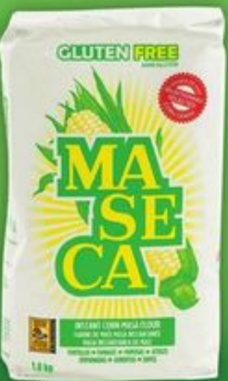
MASECA INSTANT CORN FLOUR 1.8 KG SELECTED VARIETIES

ALL AISLES LEAD HOME KITCHENS OF THE WORLD 7.99 EACH