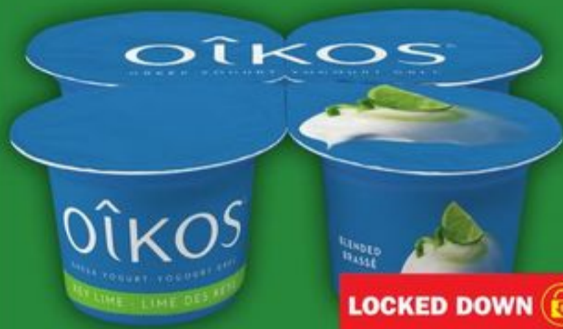
OIKOS GREEK YOGURT 4.5 SELECTED VARIETIES