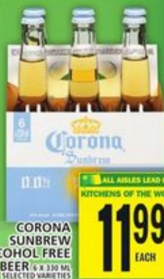
CORONA SUNBREW ALCOHOL FREE BEER 5 x 330 ML SELECTED VARIETIES

ALL AISLES LEAD HOME KITCHENS OF THE WORLD 2.49 EACH