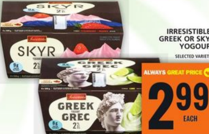
IRRESISTIBLES GREEK OR SKYR YOGURT 4.5 SELECTED VARIETIES