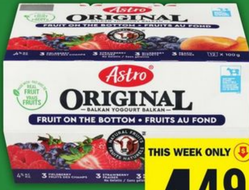
ASTRO ORIGINAL YOGURT 12.5 SELECTED VARIETIES