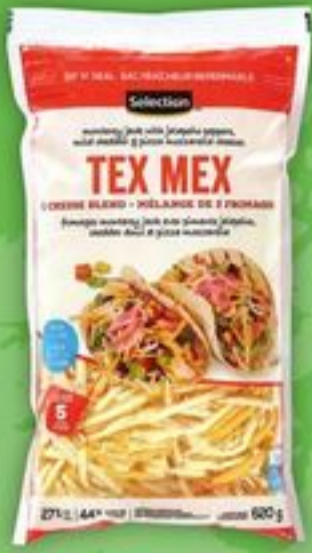
SELECTION SHREDDED CHEESE 620 G SELECTED VARIETIES

ALL AISLES LEAD HOME KITCHENS OF THE WORLD 9.49 EACH