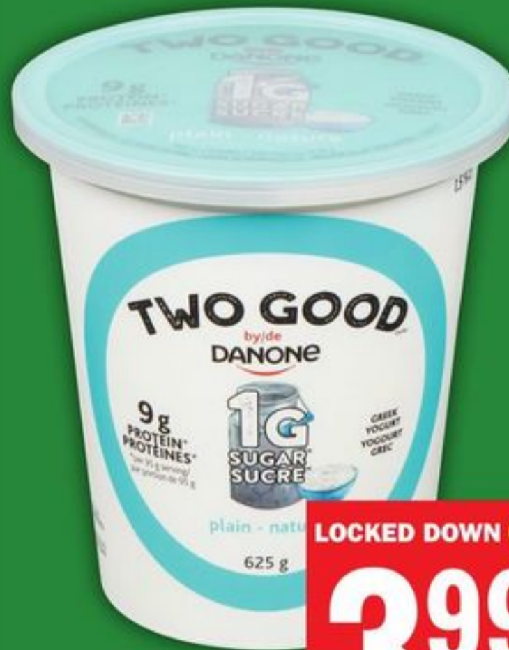
DANONE TWO GOOD GREEK YOGURT 625 G SELECTED VARIETIES