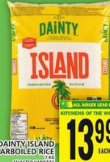
DAINTY ISLAND PARBOILED RICE 1.37 KG SELECTED VARIETIES

ALL AISLES LEAD HOME KITCHENS OF THE WORLD 2.79 EACH