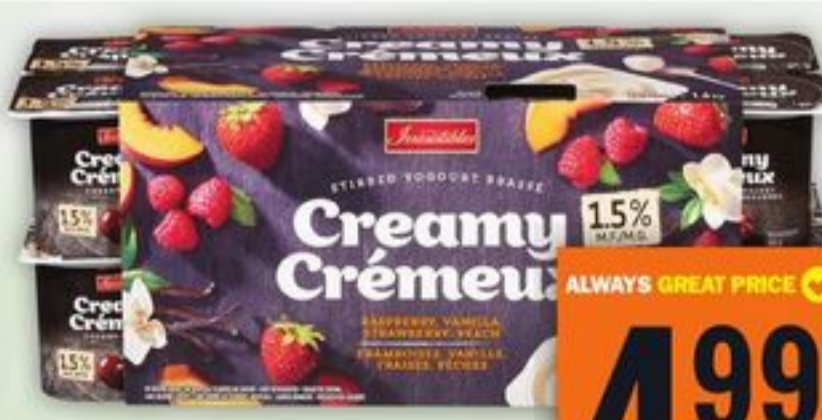
IRRESISTIBLES YOGURT SELECTED VARIETIES