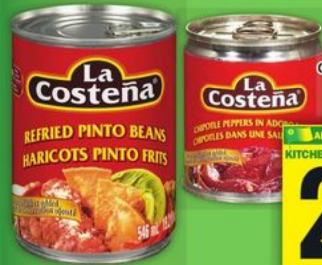
LA COSTEÑA CANNED BEANS 528 / 546 ML MARINADES 186 / 477 ML SELECTED VARIETIES

ALL AISLES LEAD HOME KITCHENS OF THE WORLD 1.79 EACH