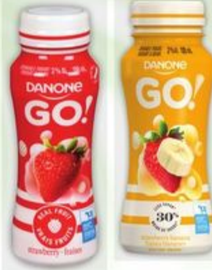
DANONE GO! DRINKABLE YOGURT 190 ML SELECTED VARIETIES