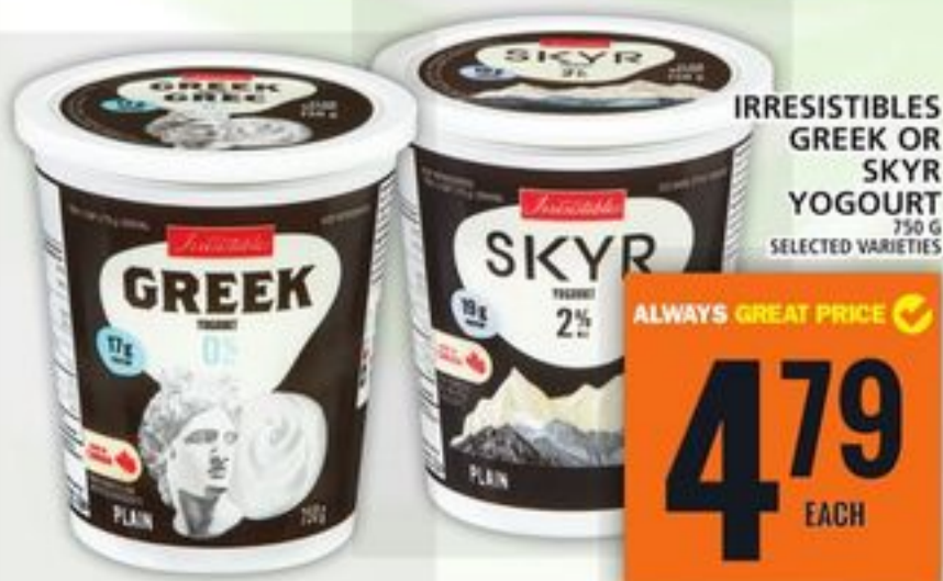
IRRESISTIBLES GREEK OR SKYR YOGURT 750 G SELECTED VARIETIES