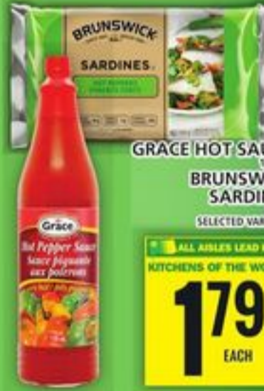
GRACE HOT SAUCE 170 ML BRUNSWICK SARDINES 106 G SELECTED VARIETIES

ALL AISLES LEAD HOME KITCHENS OF THE WORLD 1.67 EACH