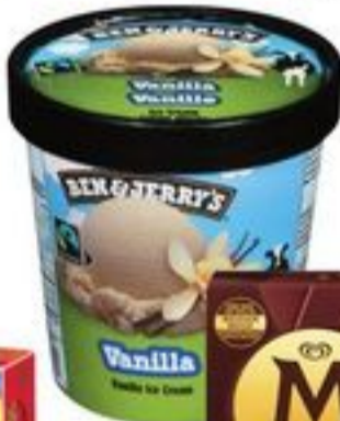
BEN & JERRY'S 473 ML OR MAGNUM BARS 4'S SELECTED VARIETIES FROZEN 20950739_EA/21568089_EA