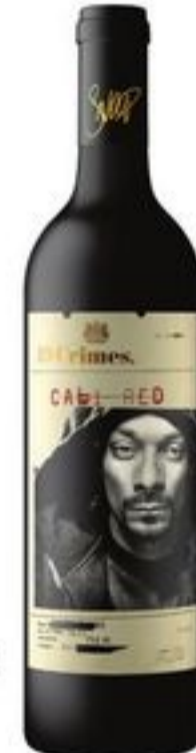
19 CRIMES CALI RED WINE 750 ML 21377867_EA