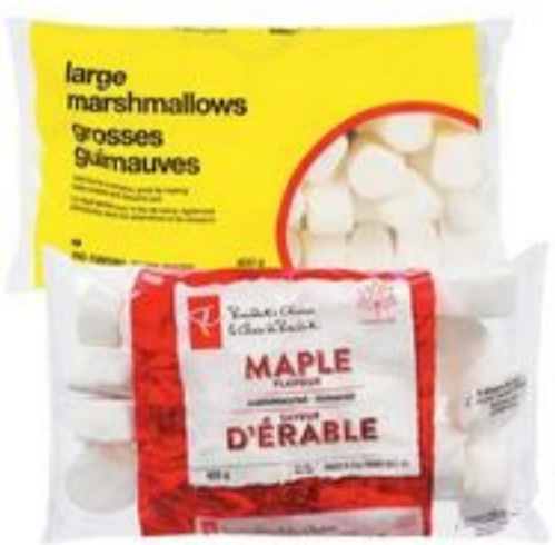
NO NAME® MARSHMALLOWS SELECTED VARIETIES 400 G 20304672001_EA 21008975_EA