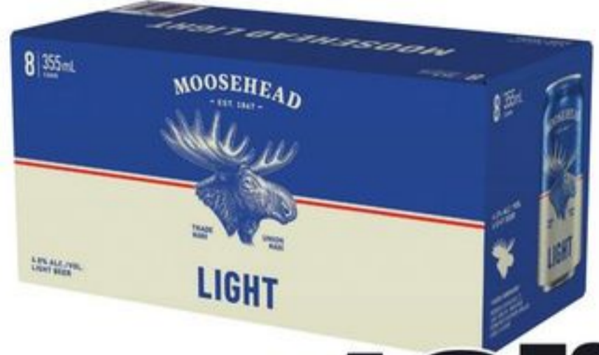
MOOSEHEAD LIGHT BEER 8 X 355 ML 21468501_C08