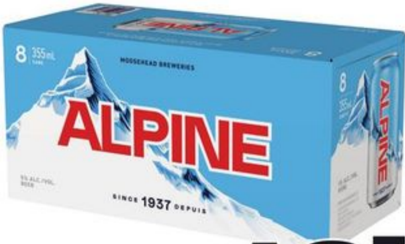
ALPINE LAGER BEER 8 X 355 ML 21467656_C08