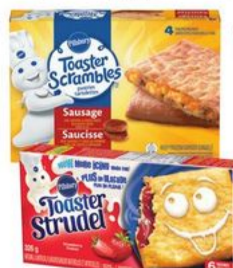
PILLSBURY TOASTER STRUDEL 326 G OR SCRAMBLES 204 G SELECTED VARIETIES FROZEN 20172664001_EA/21474507_EA