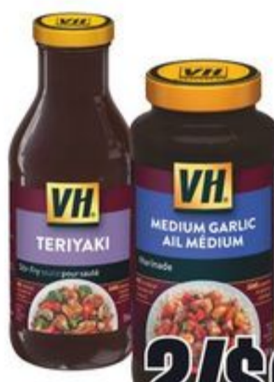
VH SAUCES SELECTED VARIETIES 341/355 ML 20308726001_EA/20309693001_EA