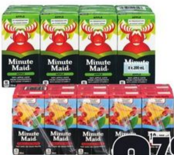
MINUTE MAID, FIVE ALIVE OR NESTEA ICED TEA DRINK BOXES SELECTED VARIETIES 8/10X200 ML 20327042001_EA/21092667_EA