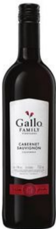
GALLO CABERNET WINE 750 ML 20024652_EA