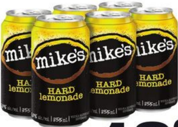
MIKE'S HARD LEMONADE 6 X 355 ML 21107868_C06