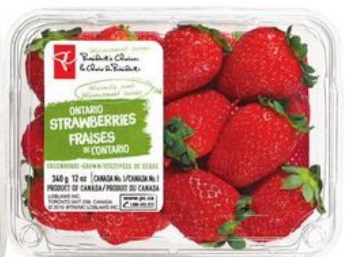
PC® GREENHOUSE STRAWBERRIES PRODUCT OF CANADA CANADA NO. 1 GRADE 340 G 21027142001_EA