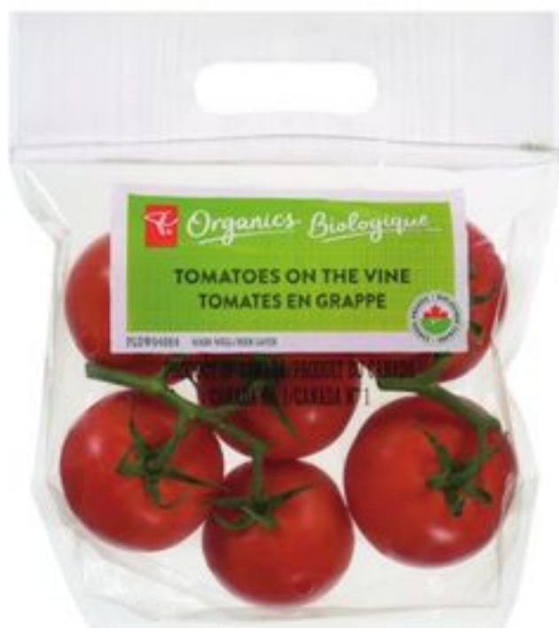
PC® ORGANICS TOMATOES ON THE VINE PRODUCT OF CANADA 8.80/KG 20127917001_KG