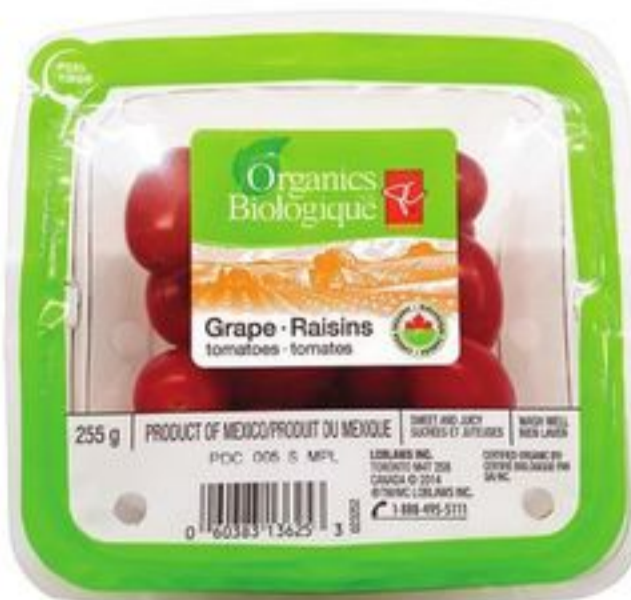
PC® ORGANICS GRAPE TOMATOES PRODUCT OF CANADA OR MEXICO 255 G 20799491001_EA