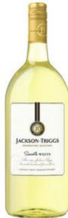
JACKSON TRIGGS WINE WHITE 1.5 L 21211466_EA