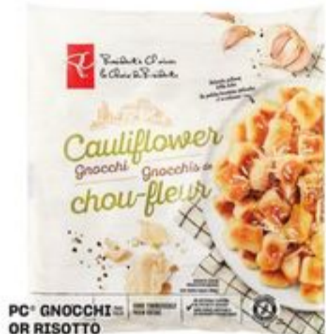
PC® GNOCCHI OR RISOTTO 350-400 G OR PC® ASIAN ENTRÉES OR SOUPS 300 G SELECTED VARIETIES, FROZEN 21546584_EA 21546625_EA