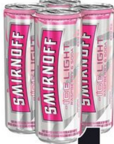
SMIRNOFF ICE LIGHT RASPBERRY & SODA 4 X 355 ML 20796567_C04