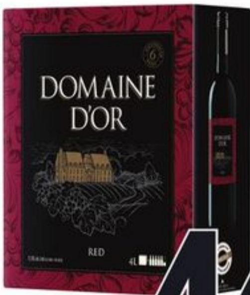
DOMAINE D'OR RED T. #1 WINE 4 L 20136510_EA