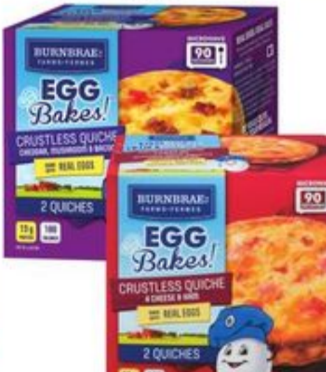
BURNBRAE EGG BAKES SELECTED VARIETIES FROZEN 21/4'S 21060391_EA/21097732_EA