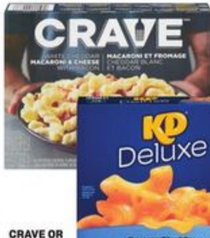
CRAVE OR KRAFT DINNER ENTRÉES SELECTED VARIETIES FROZEN 200-340 G 21085515_EA 21553329_EA