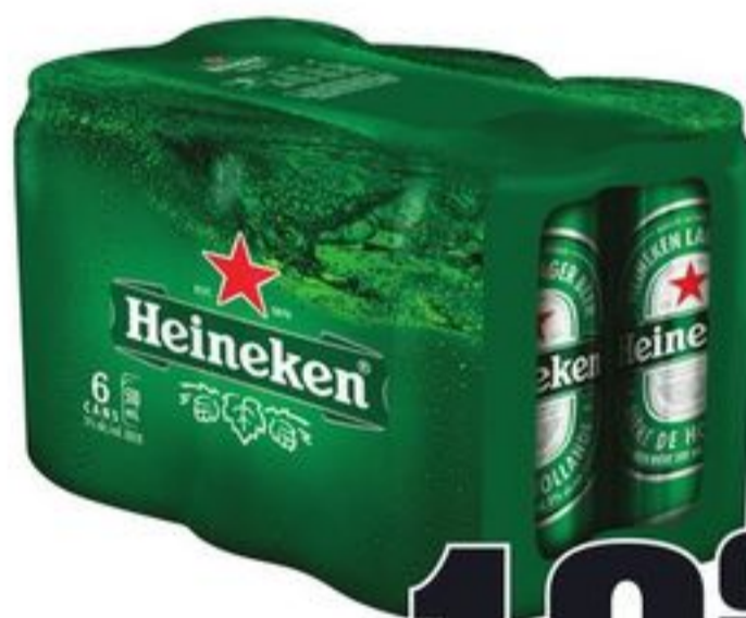
HEINEKEN 6X500 ML CANS 20955260_C06