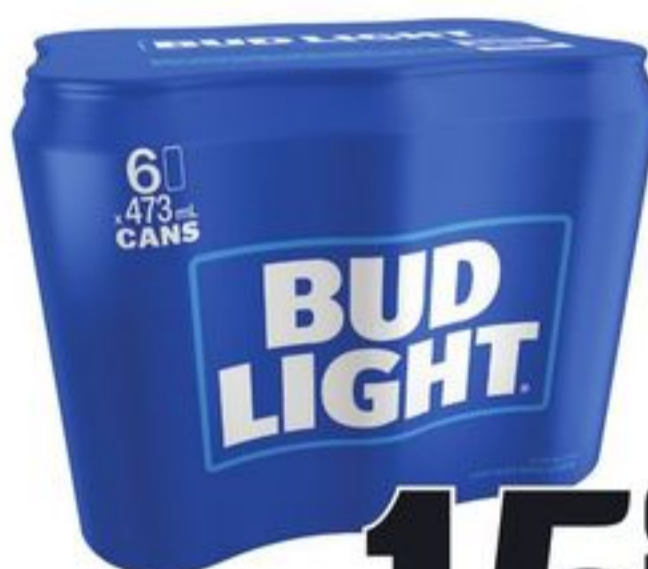
BUD LIGHT 6X473 ML CANS 20955258_C06