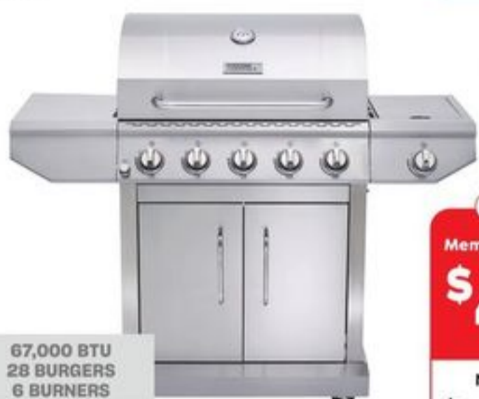
67,000 BTU 28 BURGERS 6 BURNERS