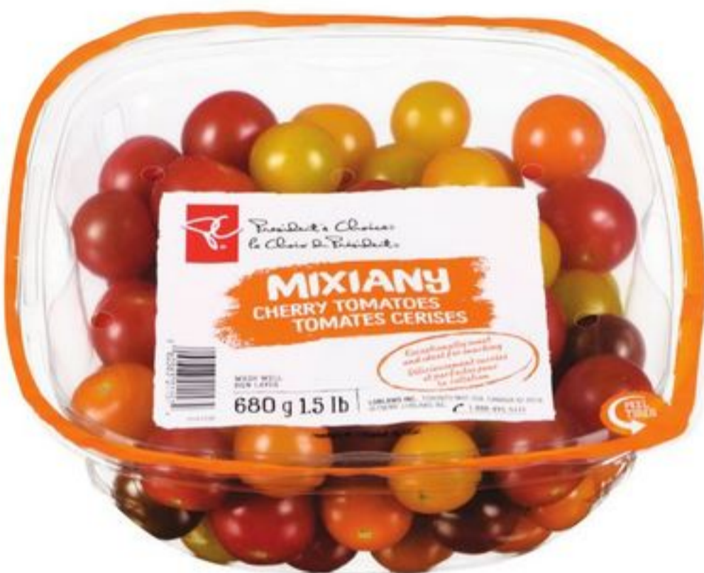
PC® MIXIANY CHERRY TOMATOES PRODUCT OF ONTARIO 680 G 21285888001_EA