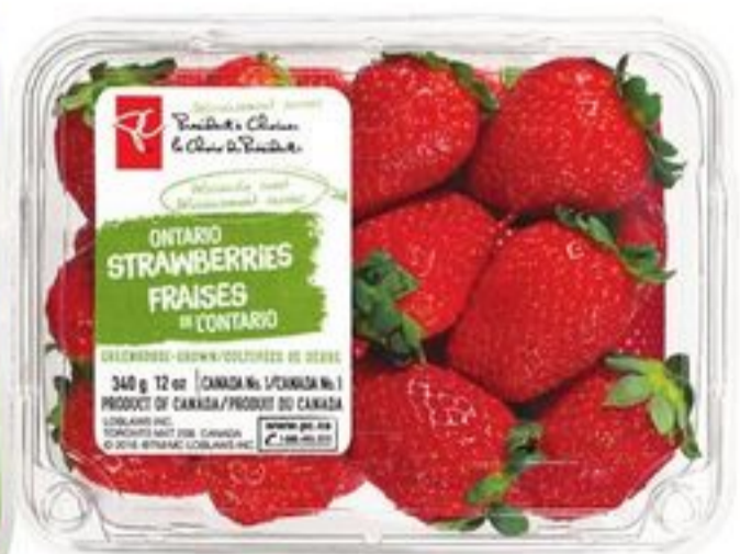
PC® GREENHOUSE STRAWBERRIES PRODUCT OF ONTARIO CANADA NO. 1 GRADE 340 G 21027142001_EA