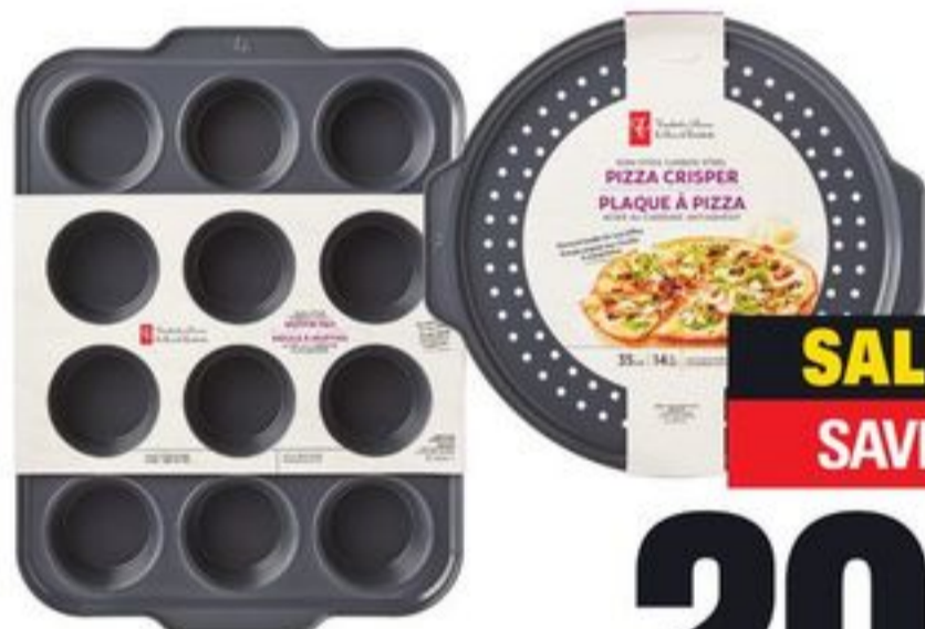
PC® METAL BAKEWARE SELECTED VARIETIES 21494804_EA/21494818_EA