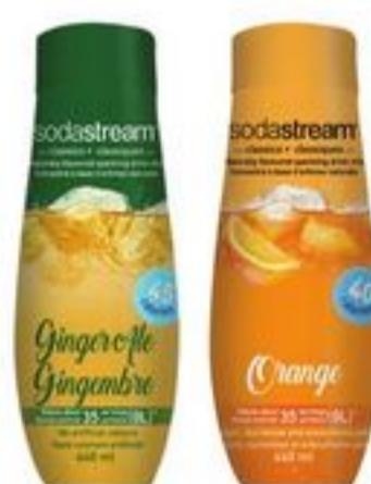
SODASTREAM CLASSICS 440 ML OR BUBLY SYRUPS 40 ML SELECTED VARIETIES 21361021_EA/21361500_EA