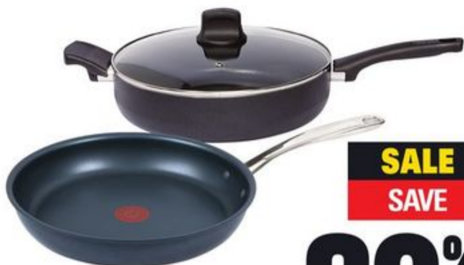
T-FAL INTUITION OR PLATINUM COOKWARE OR SETS SELECTED VARIETIES 20972338_EA/21470675_EA