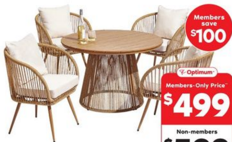
LIFE AT HOME™ 5 PIECE DINING SET 21529586_EA