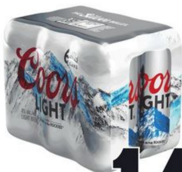
COORS LIGHT 6X473 ML CANS 20946471_C06