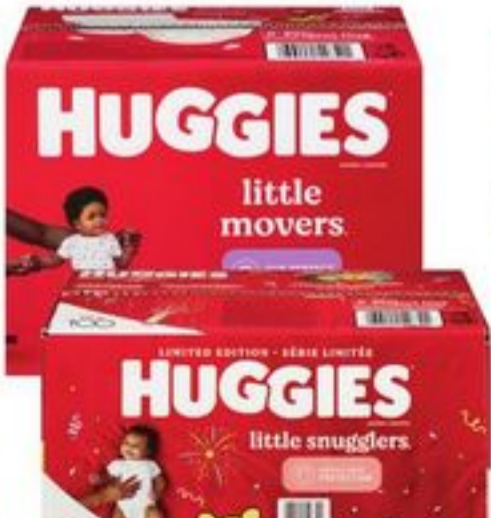
HUGGIES SUPER BIG PACK DIAPERS SELECTED VARIETIES 36-108'S 21456221_EA/21456311_EA