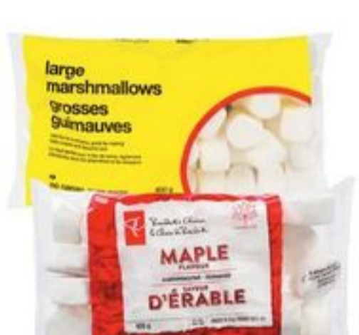
NO NAME® MARSHMALLOWS SELECTED VARIETIES 400 G 20304672001_EA 21008975_EA