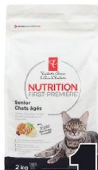
PC ® NUTRITION FIRST ® CAT FOOD SELECTED VARIETIES 2 KG 21303270_EA