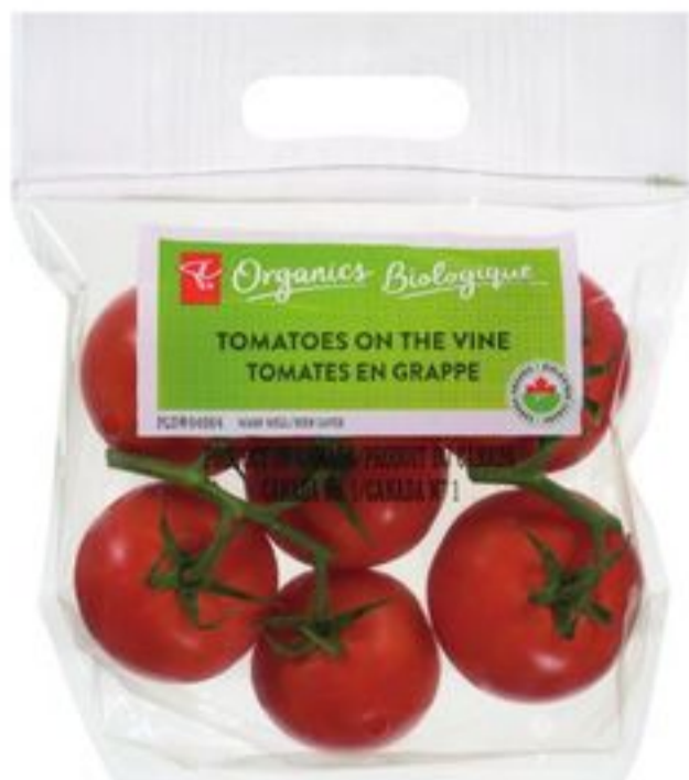
PC® ORGANICS TOMATOES ON THE VINE PRODUCT OF ONTARIO 7.69/KG 20127917001_KG