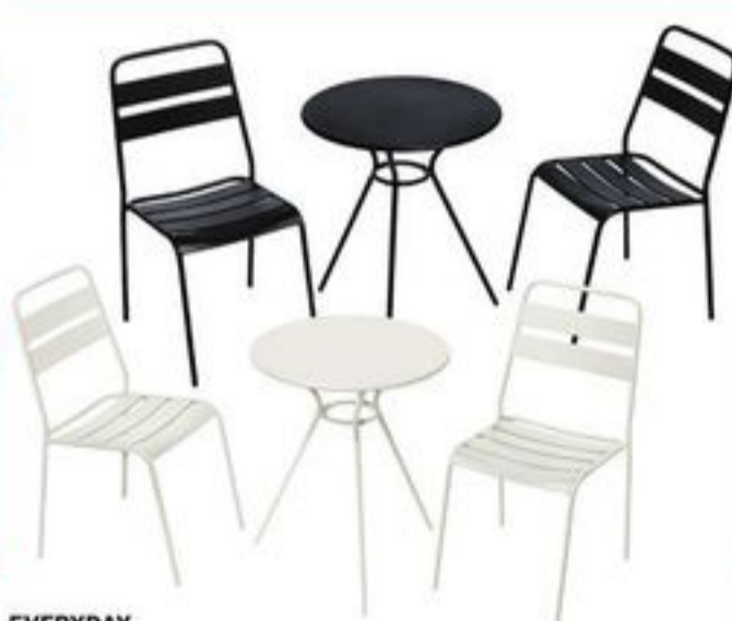
EVERYDAY ESSENTIALS™ 3 PIECE BISTRO SET AVAILABLE IN BLACK OR BONE WHITE 21528749_EA/21298095_EA

Optimum™ Members-Only Price™ $419 Non-members $499