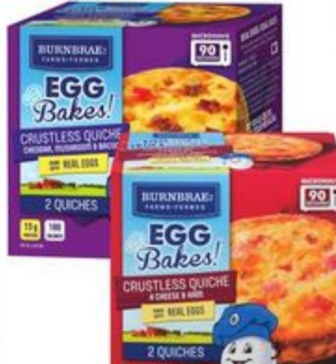
BURNBRAE EGG BAKES SELECTED VARIETIES FROZEN 2/4'S 21060391_EA/21097732_EA