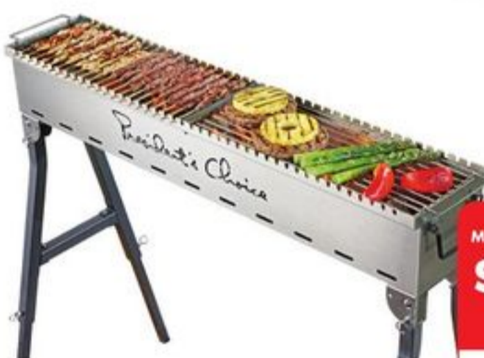
PC™ CHARCOAL SPIDIENI GRILL FITS 43 SKEWERS, INCLUDES TWO INTERCHANGABLE STAINLESS STEEL GRATES AND CARRY COVER BAG LIMITED 5 YEARS WARRANTY 21524440_EA

Optimum™ Members-Only Price™ $149 Non-members $249