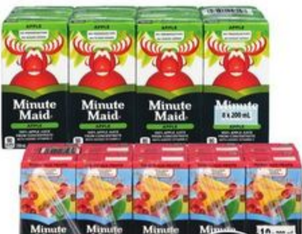
MINUTE MAID, FIVE ALIVE OR NESTEA ICED TEA DRINK BOXES SELECTED VARIETIES 8/10X200 ML 20327042001_EA/21092667_EA