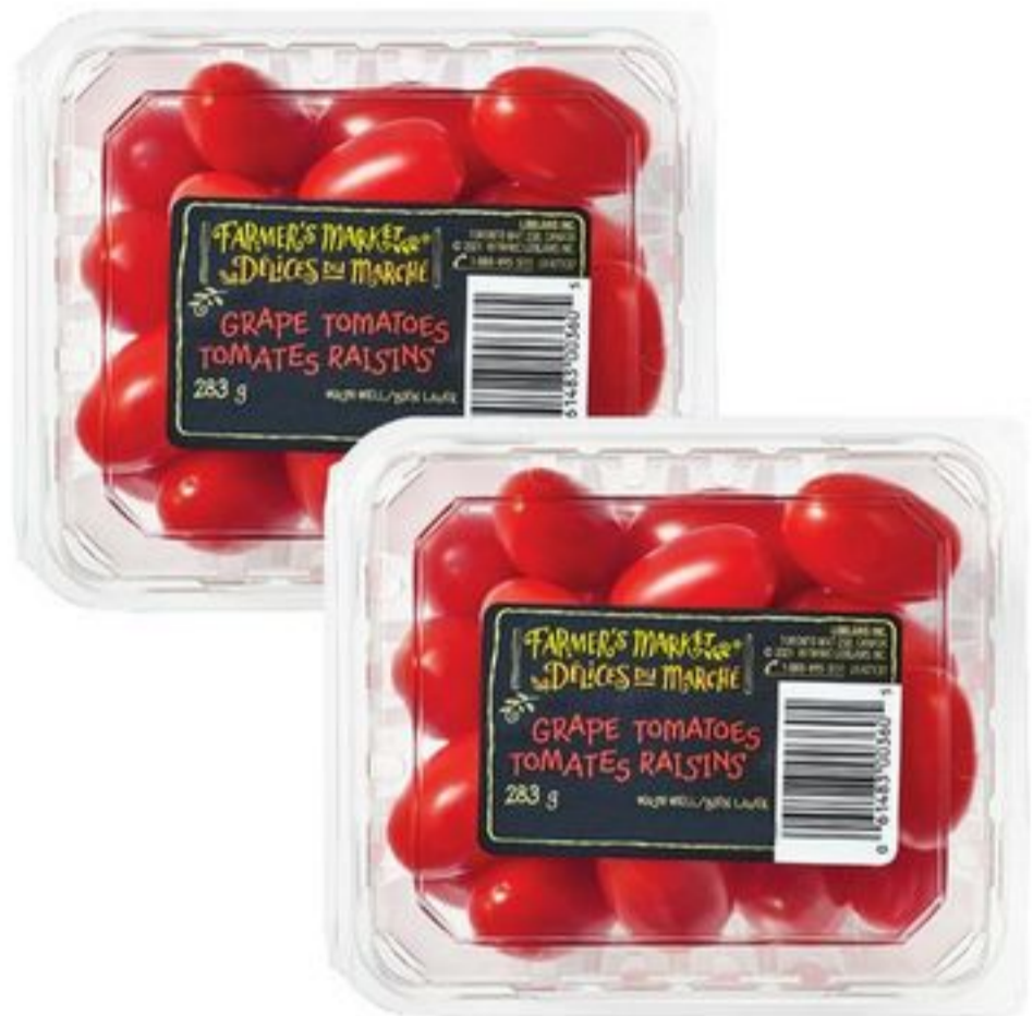
FARMER'S MARKET™ GRAPE TOMATOES PRODUCT OF MEXICO 283 G 21367888001_EA