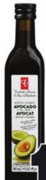
PC® AVOCADO OIL 500 ML 20332066_EA