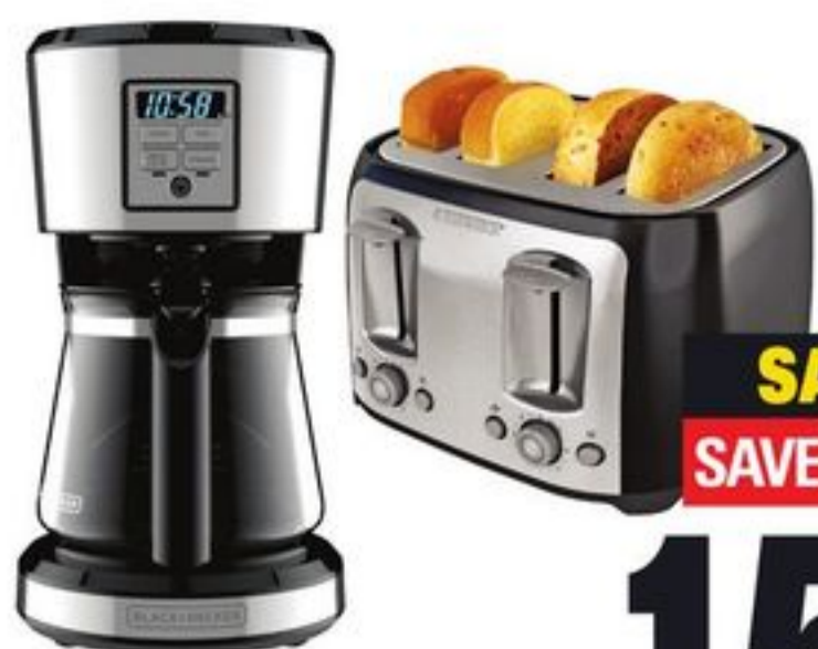
BLACK & DECKER APPLIANCES SELECTED VARIETIES 20960122_EA/21513969_EA