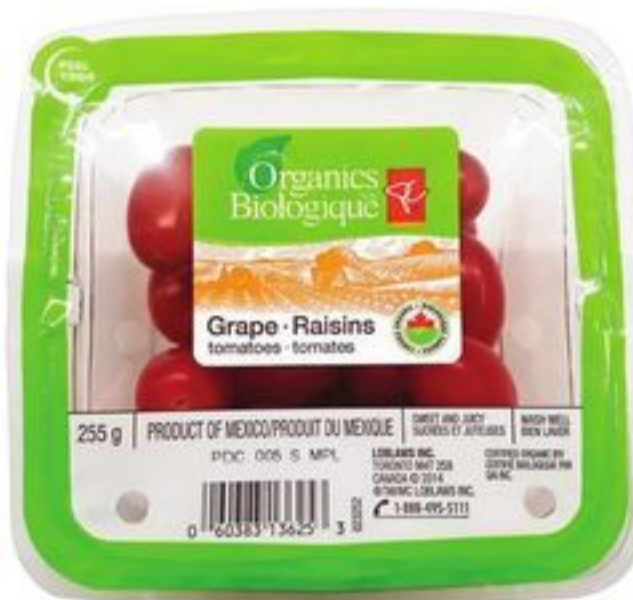
PC® ORGANICS GRAPE TOMATOES PRODUCT OF CANADA OR MEXICO 255 G 20799491001_EA