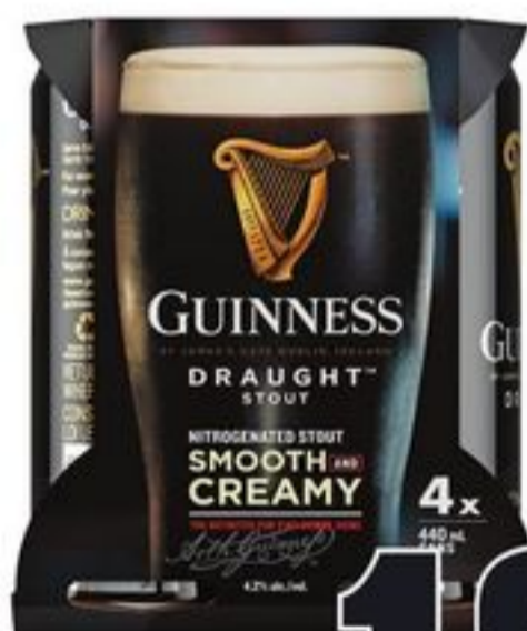
GUINNESS DRAUGHT 4X440 ML CANS 20035374_C04