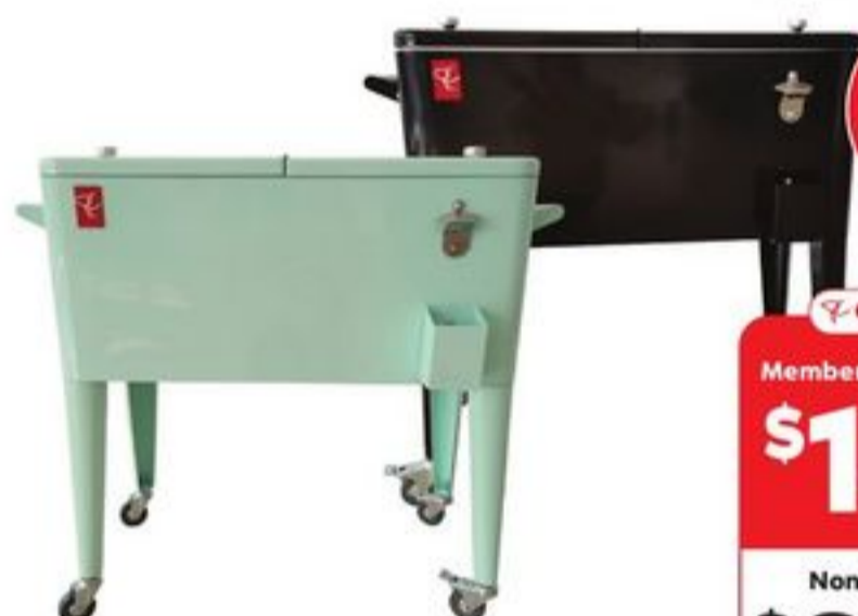
PC™ RETRO COOLER BLACK OR MINT, HOLDS 110-355 ML CANS WITH 26 POUNDS OF ICE 21480391_EA/21480408_EA

Optimum™ Members-Only Price™ $99 Non-members $139