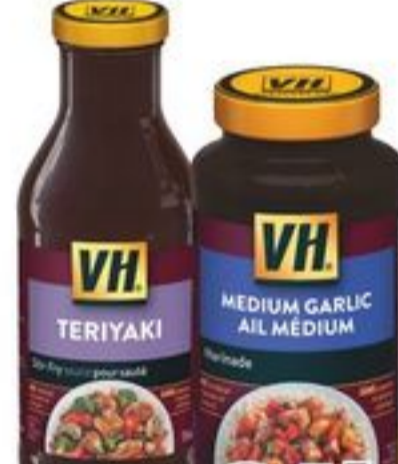
VH SAUCES SELECTED VARIETIES 341/355 ML 20308726001_EA/20309693001_EA