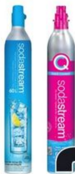
SODASTREAM CO2 CYLINDER OR $19.99 EA. FOR EXCHANGED 21128469_EA/21475557_EA