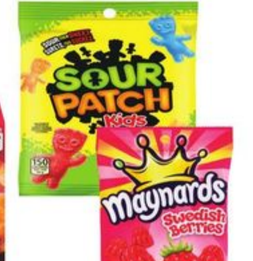
MAYNARDS CANDY SELECTED VARIETIES 150-154 G 21545554_EA/21545605_EA