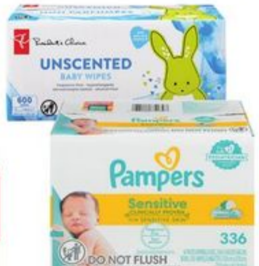
PC®, HUGGIES OR PAMPERS 6'S BABY WIPES 352-600'S SELECTED VARIETIES 21102958_EA 21271645_EA