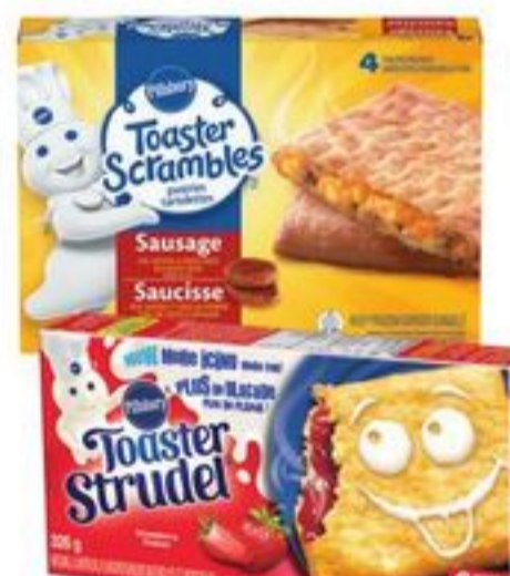
PILLSBURY TOASTER STRUDEL 326 G OR SCRAMBLES 204 G SELECTED VARIETIES FROZEN 20172664001_EA/21474507_EA