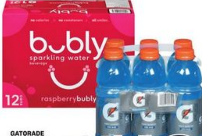
GATORADE 6X591 ML OR BUBLY SPARKLING WATER 12X355 ML OR MONTELLIER 10X355 ML SELECTED VARIETIES 20303218003_C06 21568926_C12