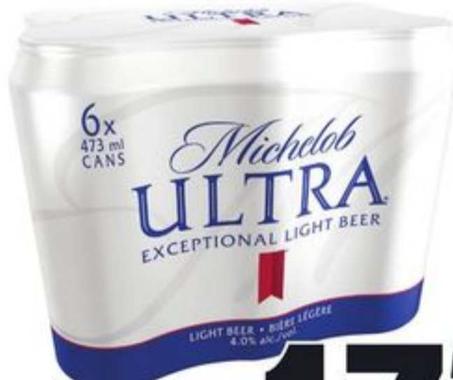
MICHELOB ULTRA 6X473 ML CANS 21097258_C06