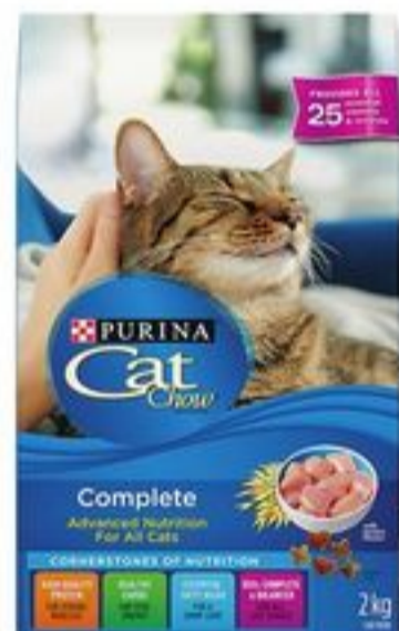
PURINA CAT CHOW SELECTED VARIETIES 1.42-2 KG 20319556001_EA