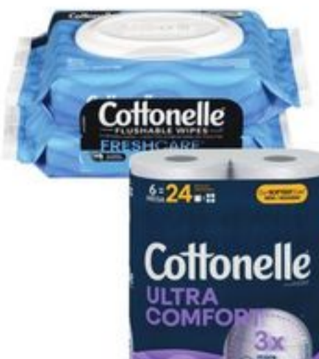
COTTONELLE BATHROOM TISSUE 6-24 ROLLS OR FLUSHABLE WIPES 2'S SELECTED VARIETIES 20688530_EA/21594641_EA