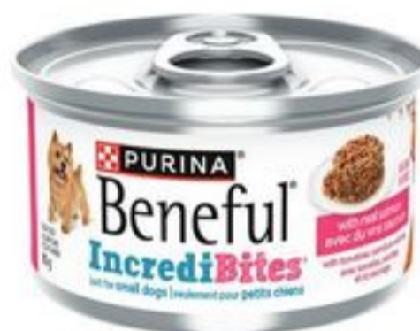
BENEFUL INCREDI BITES 85 G 21576867_EA