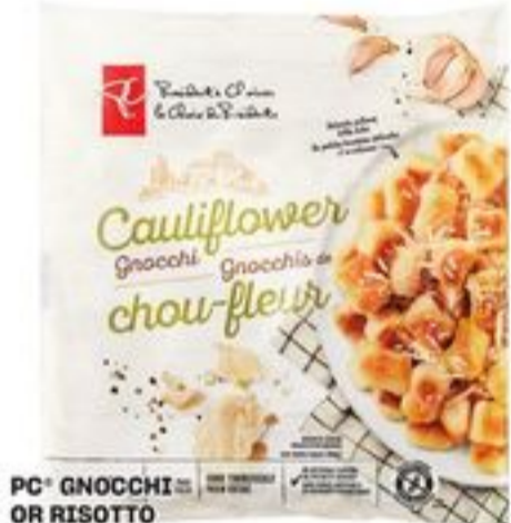
PC® GNOCCHI OR RISOTTO 350-400 G OR PC® ASIAN ENTRÉES OR SOUPS 300 G SELECTED VARIETIES, FROZEN 21546584_EA 21546625_EA