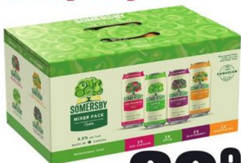
SOMERSBY CIDER MIXER 8X473 ML CANS 21313147_C08