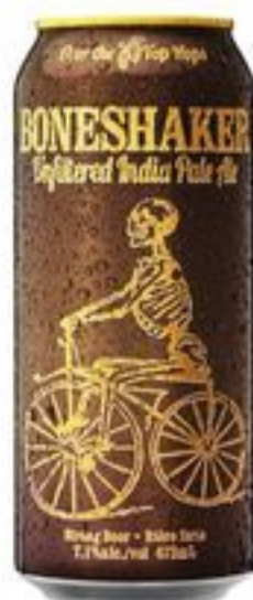
AMSTERDAM BONESHAKER IPA 473 ML CANS 20944160_EA