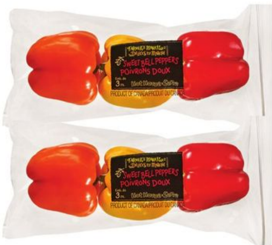
FARMER'S MARKET™ GREENHOUSE PEPPERS PRODUCT OF ONTARIO 3'S 20085851001_EA