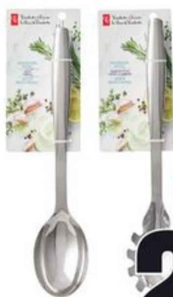
PC® STAINLESS STEEL GADGETS 21216316_EA/21216318_EA