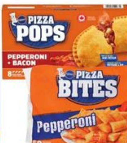
PILLSBURY PIZZA POPS 760 G OR BITES 693 G SELECTED VARIETIES FROZEN 20972958_EA 21435931_EA