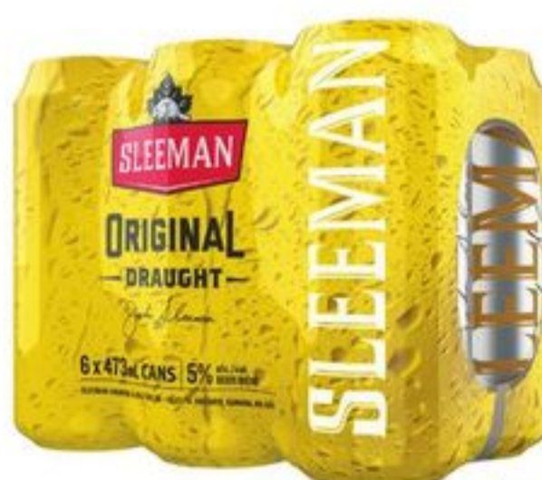
SLEEMAN ORIGINAL DRAUGHT 6X473 ML CANS 20955192_C06