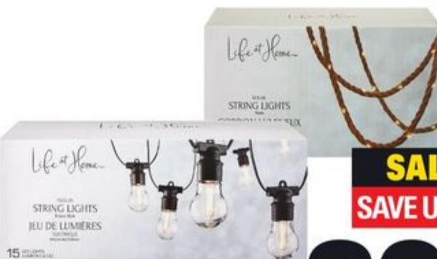
LIFE AT HOME™ OUTDOOR SOLAR LANTERNS OR STRING LIGHTS SELECTED VARIETIES 21382933_EA/21386986_EA