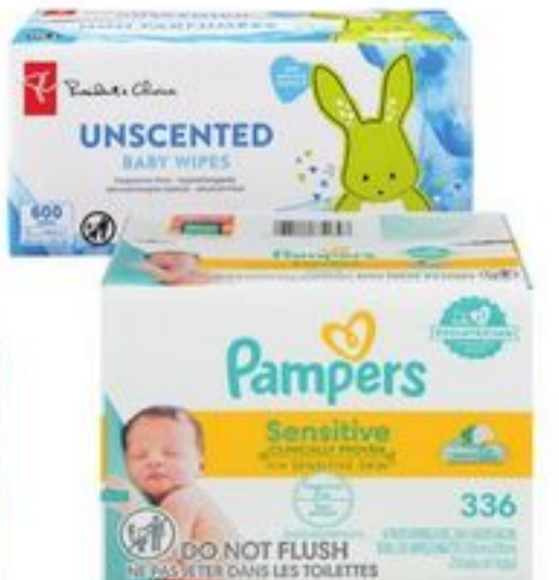
PC®, HUGGIES OR PAMPERS 6'S BABY WIPES 352-600'S SELECTED VARIETIES 21102958_EA 21271645_EA