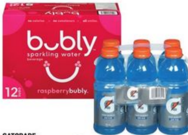
GATORADE 6X591 ML OR BUBLY SPARKLING WATER 12X355 ML OR MONTELLIER 10X355 ML SELECTED VARIETIES 20303218003_C06 21568926_C12