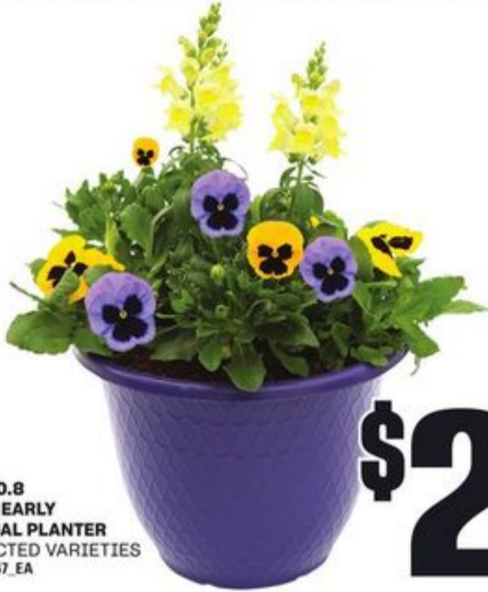
PC® 10.8 INCH EARLY ANNUAL PLANTER SELECTED VARIETIES 20753967_EA