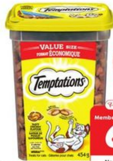
WHISKAS TEMPTATIONS CAT TREATS SELECTED VARIETIES 454 G 21012108_EA