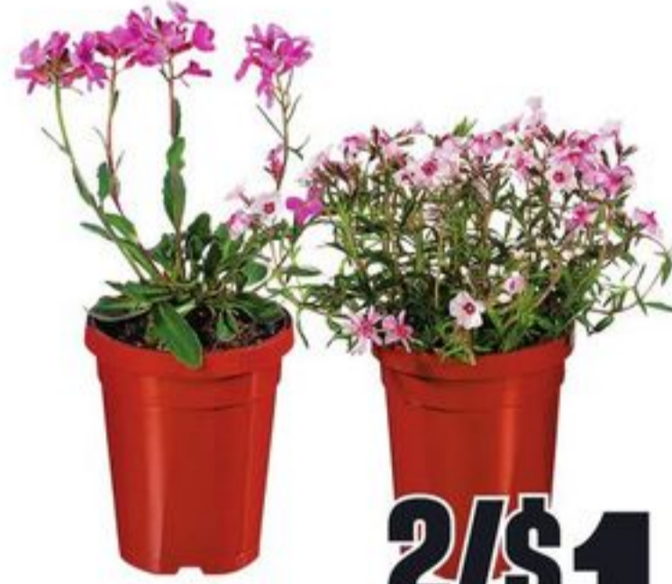
13 CM PERENNIALS EARLY SEASON SELECTED VARIETIES 21348244_EA/21430587_EA