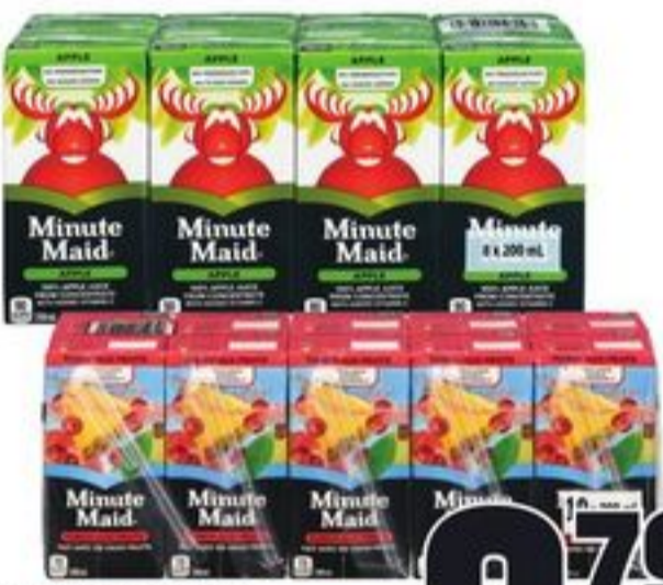
MINUTE MAID, FIVE ALIVE OR NESTEA ICED TEA DRINK BOXES SELECTED VARIETIES 8/10X200 ML 20327042001_EA/21092667_EA