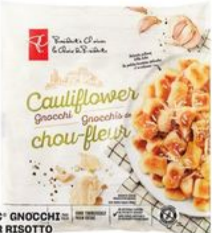
PC® GNOCCHI OR RISOTTO 350-400 G OR PC® ASIAN ENTRÉES OR SOUPS 300 G SELECTED VARIETIES, FROZEN 21546584_EA 21546625_EA