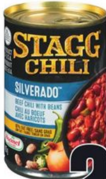
STAGG CHILI SELECTED VARIETIES 425 G 20309125004_EA