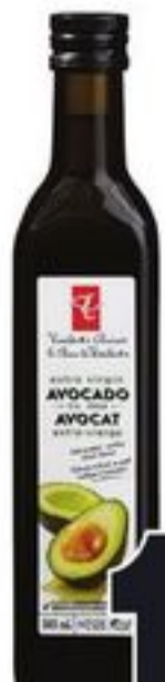
PC® AVOCADO OIL 500 ML 20332066_EA