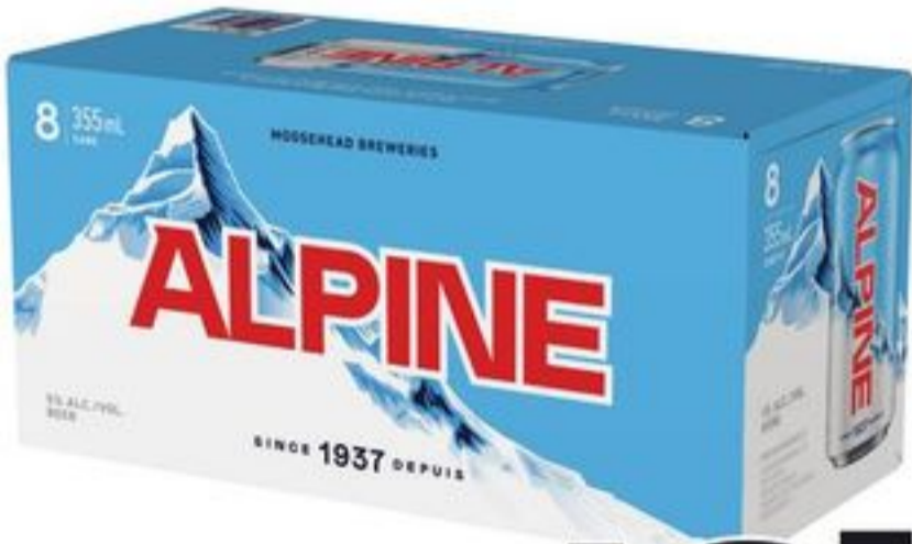
ALPINE LAGER BEER 8 X 355 ML 21467656_C08