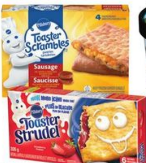
PILLSBURY TOASTER STRUDEL 326 G OR SCRAMBLES 204 G SELECTED VARIETIES FROZEN 20172664001_EA/21474507_EA