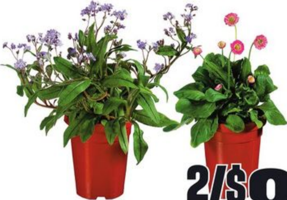
9 CM PERENNIALS EARLY SEASON SELECTED VARIETIES 21347591_EA