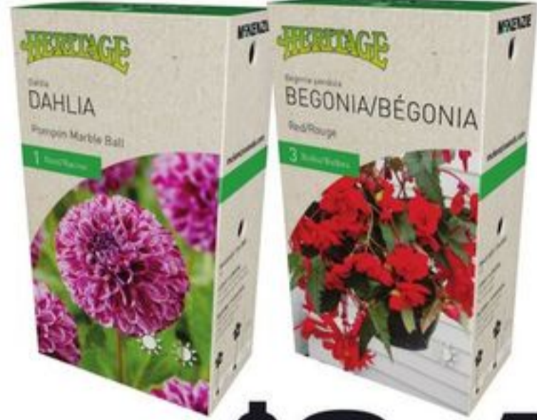
SPRING BULBS PLANT NOW FOR SUMMER BLOOMS SELECTED VARIETIES 21350419_EA/21357248_EA