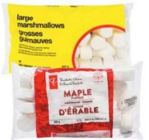
NO NAME® MARSHMALLOWS SELECTED VARIETIES 400 G 20304672001_EA 21008975_EA