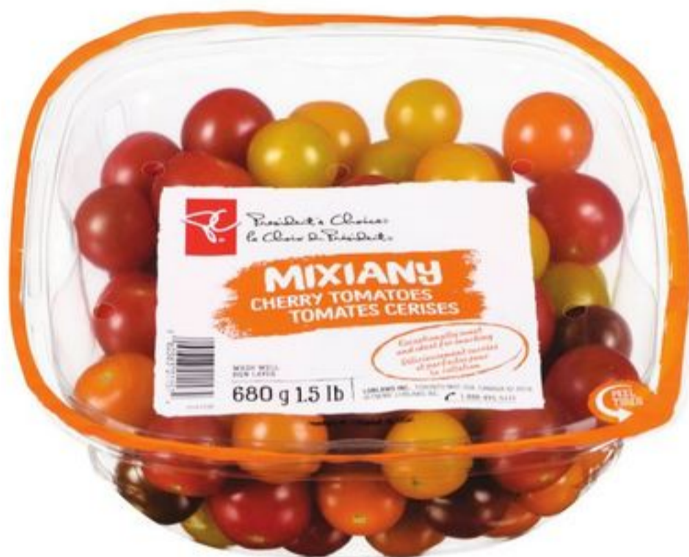
PC® MIXIANY CHERRY TOMATOES PRODUCT OF CANADA 680 G 21285888001_EA