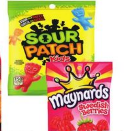
MAYNARDS CANDY SELECTED VARIETIES 150-154 G 21545554_EA/21545605_EA