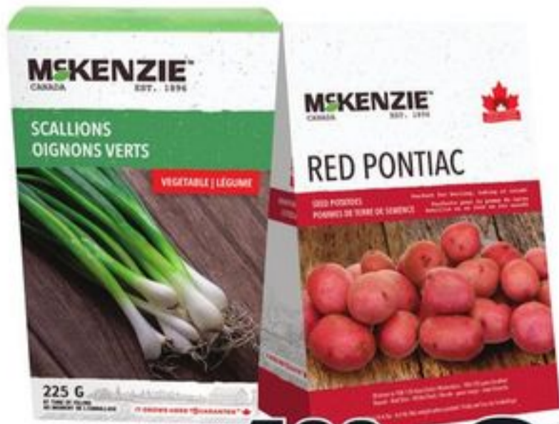
SEED POTATOES, ONIONS AND SHALLOTS SOURCED FROM CANADIAN FARMERS 21515074_EA/21348211_EA