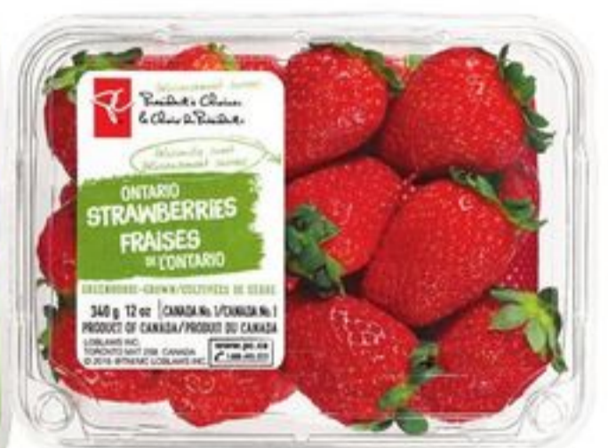
PC® GREENHOUSE STRAWBERRIES PRODUCT OF CANADA CANADA NO. 1 GRADE 340 G 21027142001_EA