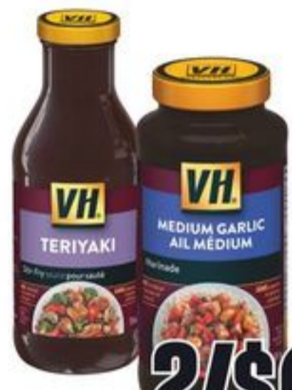
VH SAUCES SELECTED VARIETIES 341/355 ML 20308726001_EA/20309693001_EA