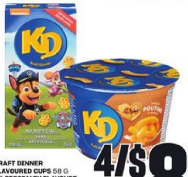
KRAFT DINNER FLAVOURED CUPS 58 G OR SPECIALTY FLAVOURS 150-200 G SELECTED VARIETIES 21393426_EA/21435132_EA