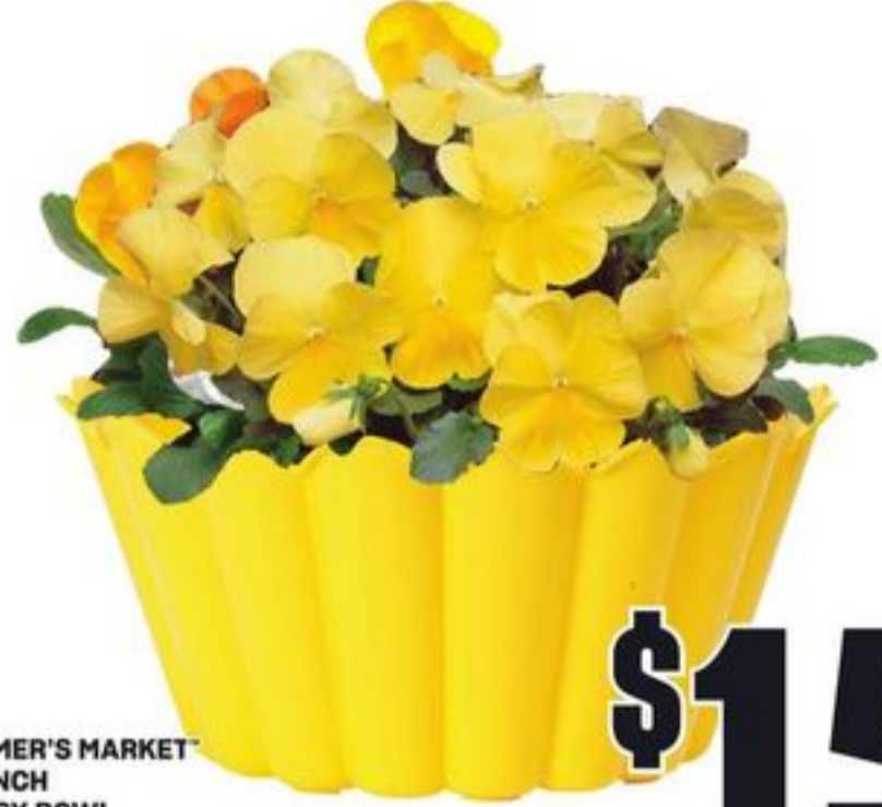
FARMER'S MARKET™ 10 INCH PANSY BOWL SELECTED VARIETIES 20753921_EA