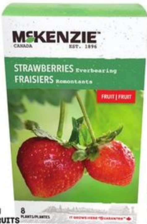
GROW YOUR OWN SELECTION OF FRUITS AND VEGETABLES SELECTED VARIETIES 21515163_EA