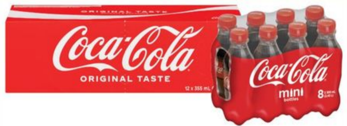
COCA-COLA OR CANADA DRY SOFT DRINKS SELECTED VARIETIES, 8X300 ML/12X355 ML