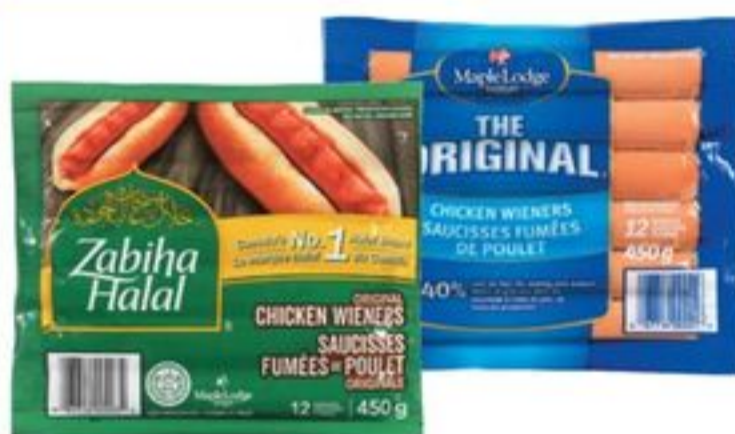
MAPLE LODGE ZABIHA HALAL OR REGULAR CHICKEN WIENERS SELECTED VARIETIES, 450 G 20006571_EA/20062715_EA