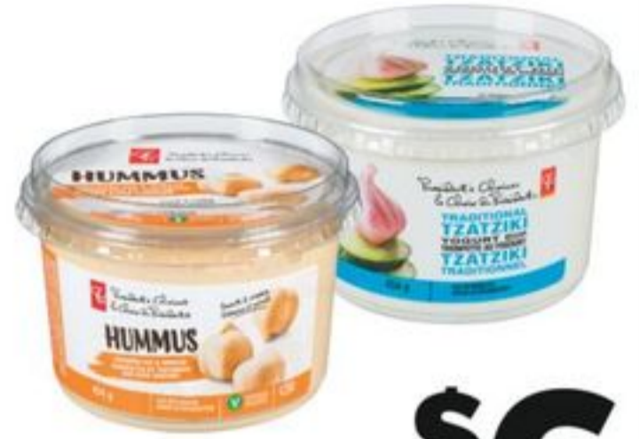
PC® DIPS OR HUMMUS SELECTED VARIETIES, 454 G 20584001_EA/20584098_EA