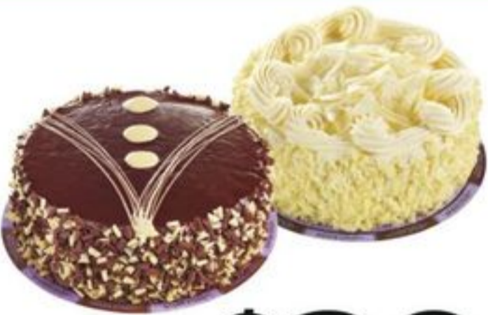
BAKER STREET CAKES SELECTED VARIETIES 910 G-1.9 KG 20381322_EA/20381323_EA