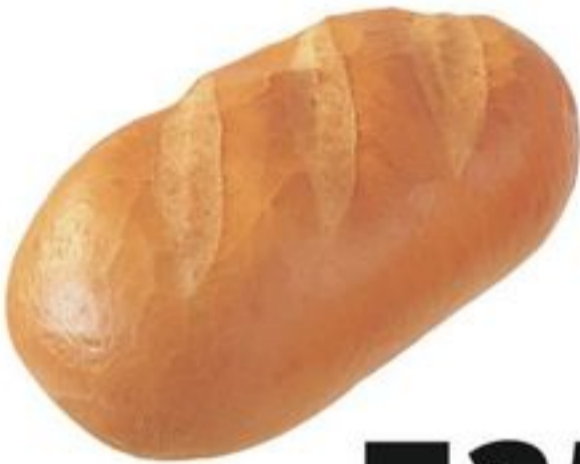
FRENCH OR ITALIAN BREAD SELECTED VARIETIES BAKED IN-STORE, 450 G 21169914_EA