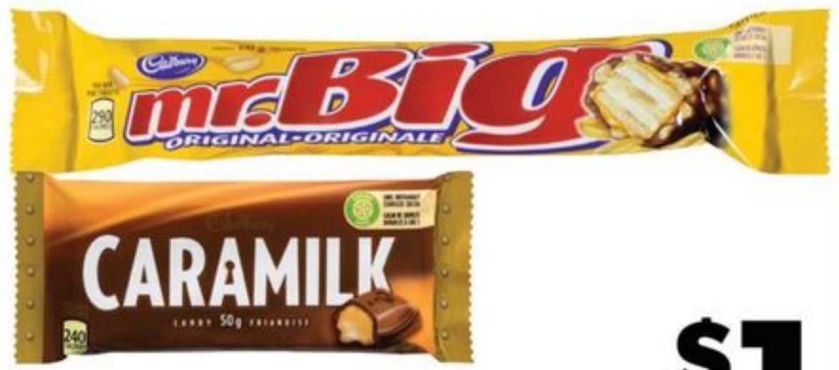
CADBURY SINGLE CHOCOLATE BAR SELECTED VARIETIES, 33-60 G