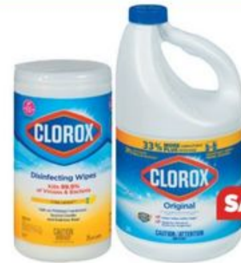
CLOROX DISINFECTANT WIPES 75'S OR BLEACH 2.4 L SELECTED VARIETIES