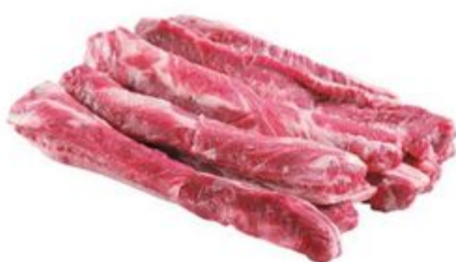
BEEF RIB FINGER MEAT BONELESS, CRYOVAC 201421591_KG