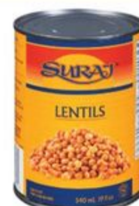
SURAJ® BEANS OR LENTILS 540 ML 20540269_EA