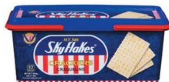
M.Y. SAN SKY FLAKES CRACKERS 800 G 21176796_EA