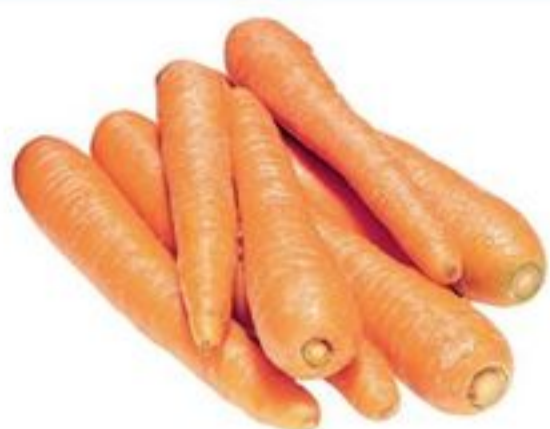
JUMBO CARROTS PRODUCT OF CHINA 20851084001_KG