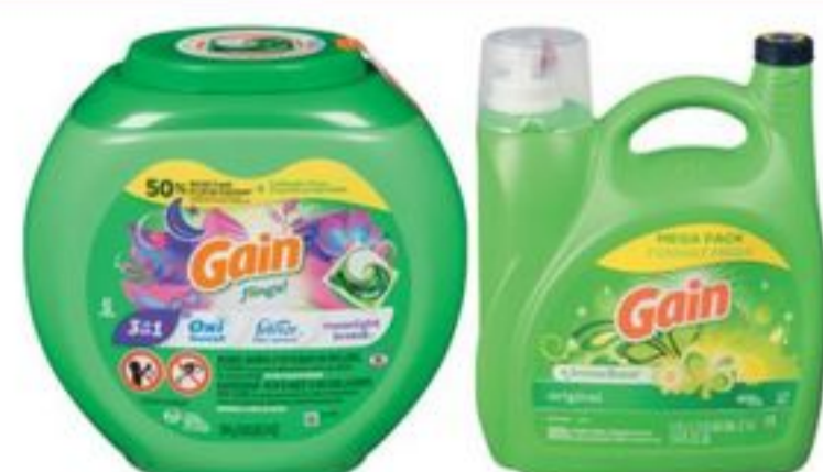
GAIN LIQUID LAUNDRY DETERGENT 4.55 L OR FLINGS 42'S SELECTED VARIETIES