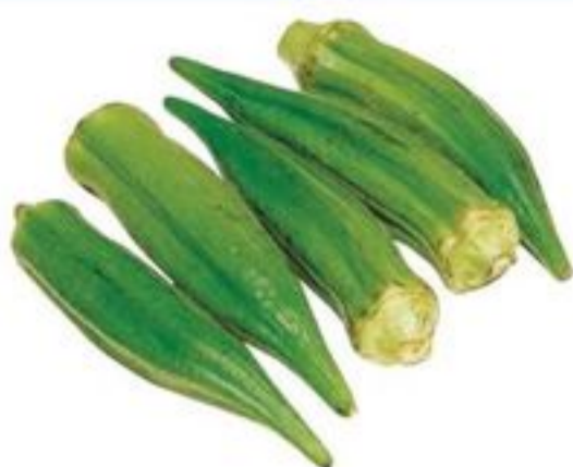
OKRA PRODUCT OF HONDURAS OR NICARAGUA 20095263001_KG