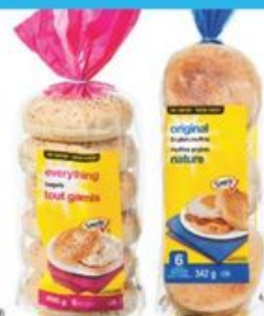
NO NAME® BAGELS OR ENGLISH MUFFINS SELECTED VARIETIES 6'S 21297780_EA/21297781_EA