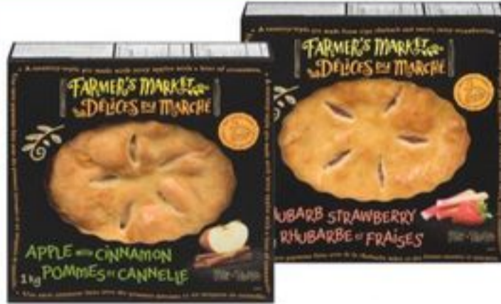
FARMER'S MARKET™ PIES SELECTED VARIETIES, 580 G-1 KG 21297366_EA/21297367_EA