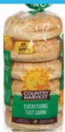
COUNTRY HARVEST BAGELS SELECTED VARIETIES, 6'S 21178597_EA