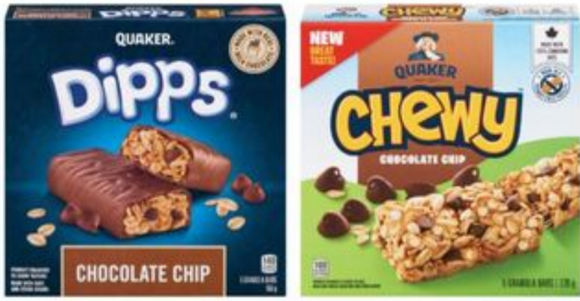
QUAKER DIPPS OR CHEWY GRANOLA BARS SELECTED VARIETIES, 120-156 G

Deals on 1000s of your favourite products.