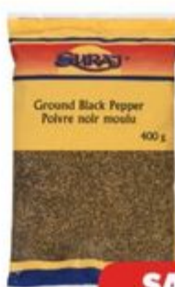
SURAJ® GROUND BLACK PEPPER 400 G 20618050_EA