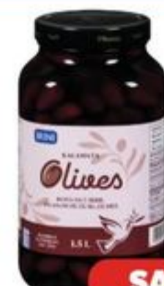
IRINI KALAMATA OLIVES 1.5 L 20020052_EA