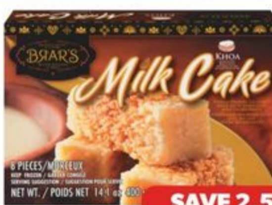
BRAR'S MILK CAKE SELECTED VARIETIES FROZEN, 400 G 20609047_EA