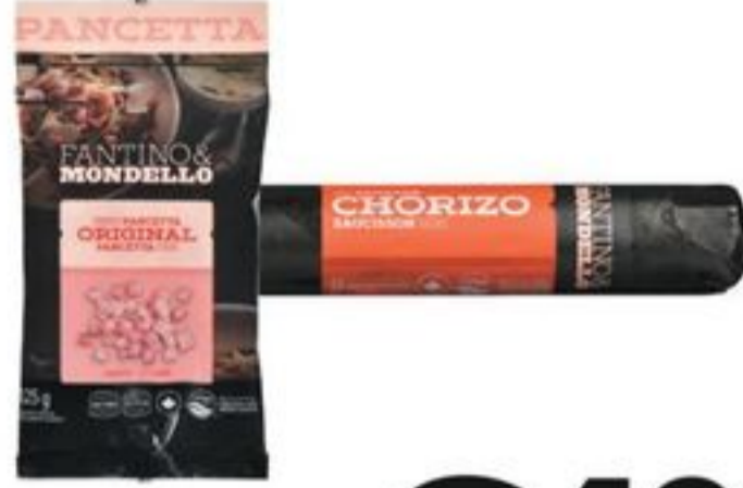
FANTINO AND MONDELLO SPECIALTY DELI MEATS SELECTED VARIETIES, 100-200 G 21551583_EA/21551779_EA