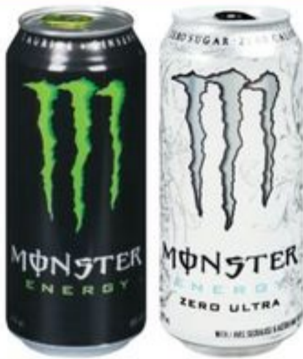
MONSTER ENERGY DRINKS SELECTED VARIETIES, 473 ML