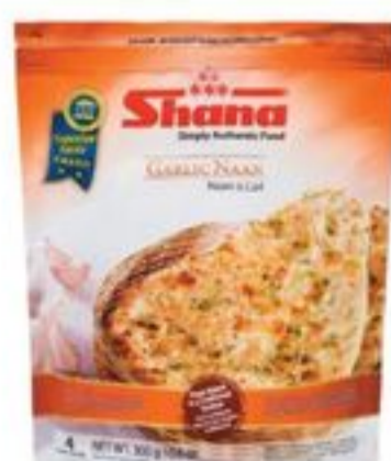
SHANA NAANS SELECTED VARIETIES FROZEN, 300 G 20983341002_EA