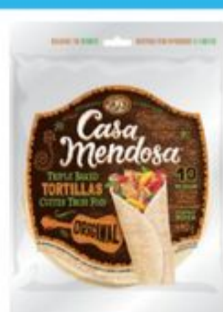
CASA MENDOSA 7/10 INCH TORTILLAS SELECTED VARIETIES, 340-640 G 20179156_EA