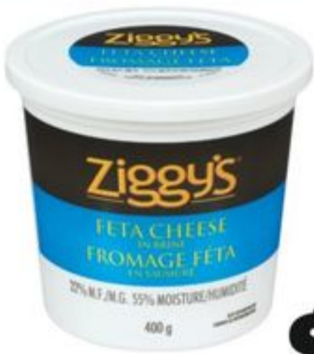
ZIGGY'S® FETA CHEESE SELECTED VARIETIES, 400 G 20992952_EA