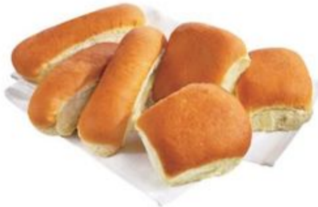
TEXAS STYLE HOT DOG OR HAMBURGER BUNS SELECTED VARIETIES BAKED IN-STORE, 8'S 20711614_EA