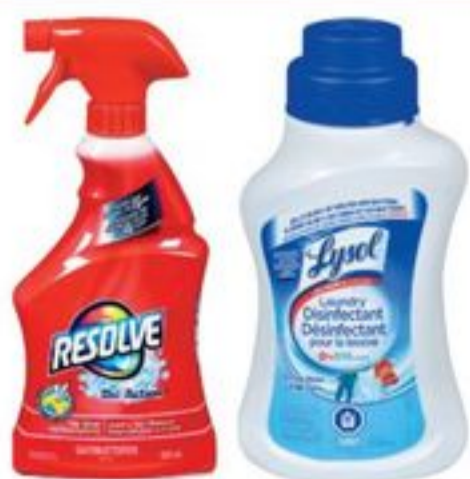
LYSOL LAUNDRY DISINFECTANT 1.2 L OR SPRAY 425 G, RESOLVE IN-WASH 625 G OR PRE-TREAT 650 ML SELECTED VARIETIES