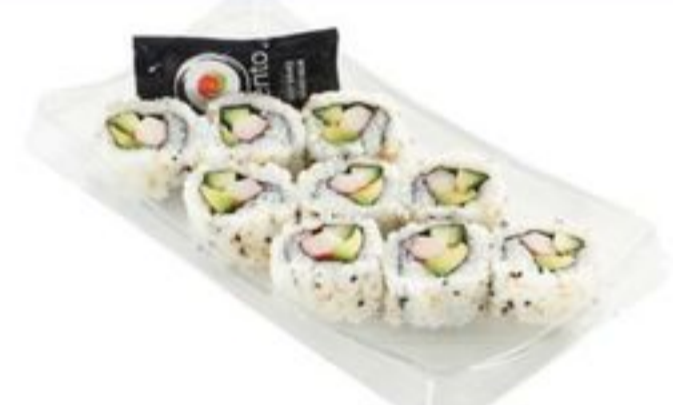
BENTO SUSHI CALIFORNIA ROLLS SELECTED VARIETIES, 200/205 G 20184852_EA