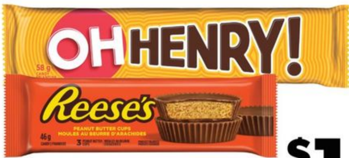
HERSHEY'S SINGLE CHOCOLATE BAR SELECTED VARIETIES, 42-58 G