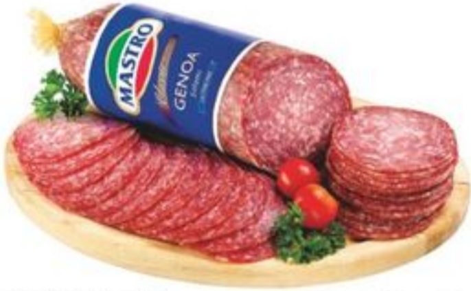
MASTRO SALAMI OR SALAMI WITH PROSCIUTTO DELI SERVICE CASE SLICED SELECTED VARIETIES 20087761_KG