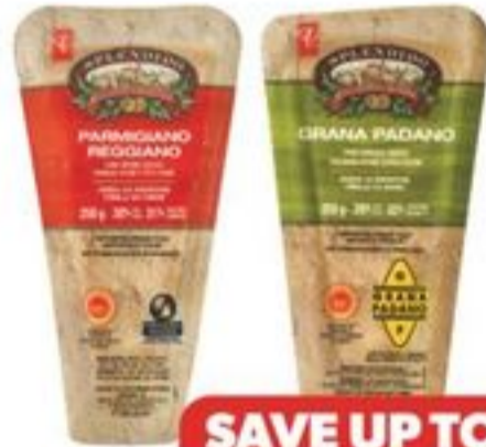
PC® SPLENDIDO™ PARMIGIANO REGGIANO, GRANA PADANO OR PECORINO ROMANO 250 G 21051031_EA/21051343_EA