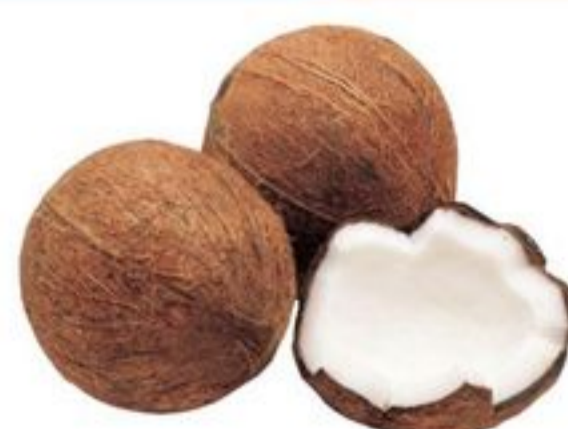
COCONUT PRODUCT OF DOMINICAN REPUBLIC OR INDIA 20005774001_EA