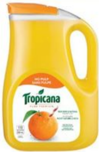
TROPICANA ORANGE JUICE SELECTED VARIETIES, REFRIGERATED, 2.63 L