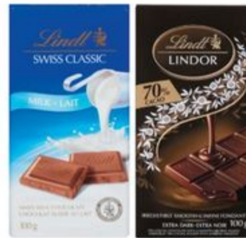
LINDT SWISS CLASSIC OR LINDOR CHOCOLATE TABLET SELECTED VARIETIES, 100 G