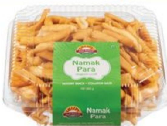
CRISPY NAMAK PARA 360 G 21443491_EA