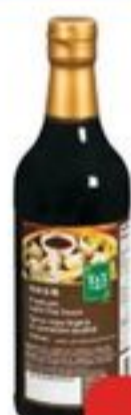
T&T® LIGHT SOY SAUCE 500 ML 20608042_EA