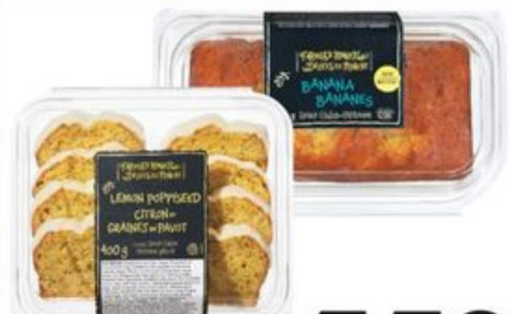
FARMER'S MARKET™ LOAF CAKES SELECTED VARIETIES, 344-400 G 20565382_EA/21488954_EA