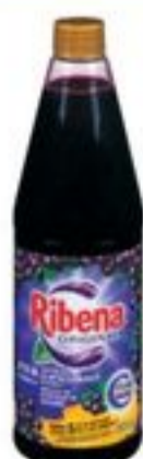
RIBENA JUICE 850 ML 2101494_EA