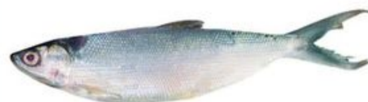
MILKFISH WHOLE, FROZEN 20119071_KG