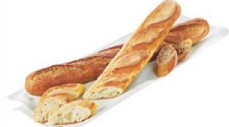
ACE BAKERY BAGUETTES SELECTED VARIETIES 200-400 G 20711717_EA