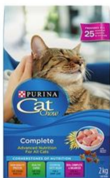
PURINA CAT CHOW SELECTED VARIETIES 1.42-2 KG 20319556001_EA