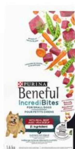
BENEFUL DOG FOOD SELECTED VARIETIES 1.6/1.8 KG 20295905001_EA