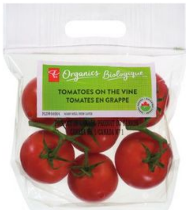
PC® ORGANICS TOMATOES ON THE VINE PRODUCT OF ONTARIO 8.80/KG 20127917001_KG