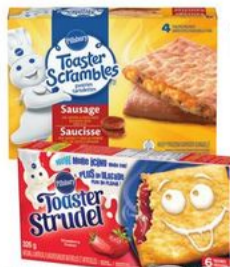
PILLSBURY TOASTER STRUDEL 326 G OR SCRAMBLES 204 G SELECTED VARIETIES FROZEN 20172664001_EA/21474507_EA