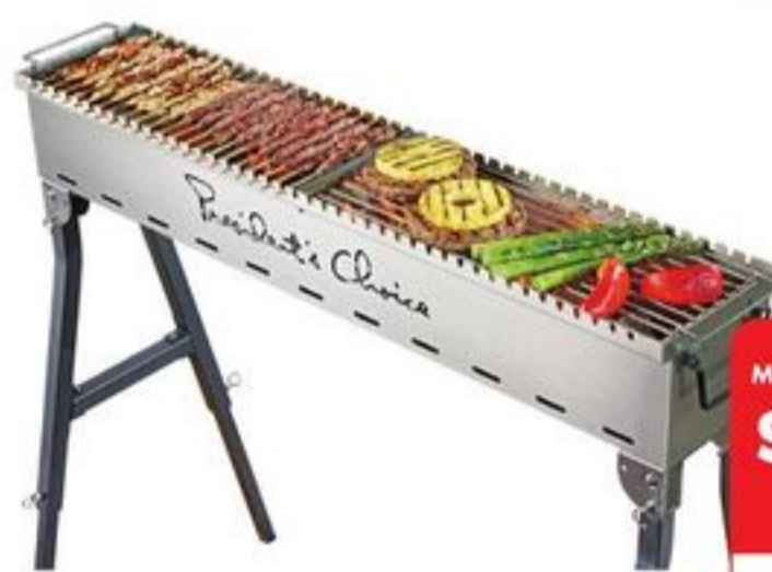
PC® CHARCOAL SPIDIENI GRILL FITS 43 SKEWERS, INCLUDES TWO INTERCHANGABLE STAINLESS STEEL GRATES AND CARRY COVER BAG LIMITED 5 YEARS WARRANTY 21524440_EA

Members save $100 Optimum™ Members-Only Price™ $149 Non-members $249