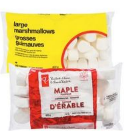
NO NAME® MARSHMALLOWS SELECTED VARIETIES 400 G 20304672001_EA 21008975_EA