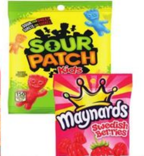
MAYNARDS CANDY SELECTED VARIETIES 150-154 G 21545554_EA/21545605_EA