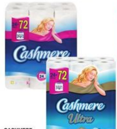
CASHMERE BATHROOM TISSUE SELECTED VARIETIES 24-72 ROLLS 21189845_EA 21443648_EA