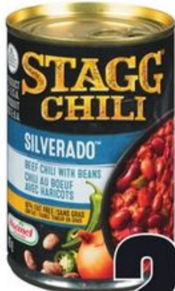
STAGG CHILI SELECTED VARIETIES 425 G 20309125004_EA