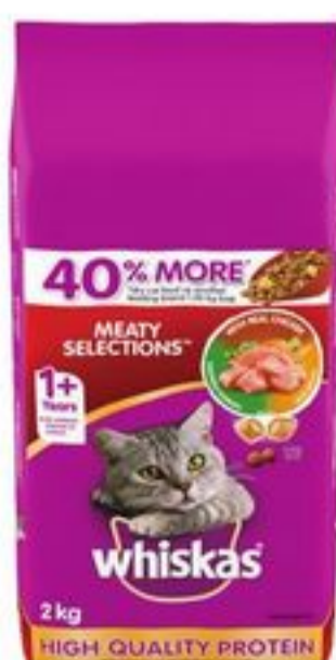
WHISKAS CAT FOOD SELECTED VARIETIES 1.5/2 KG 20754051_EA