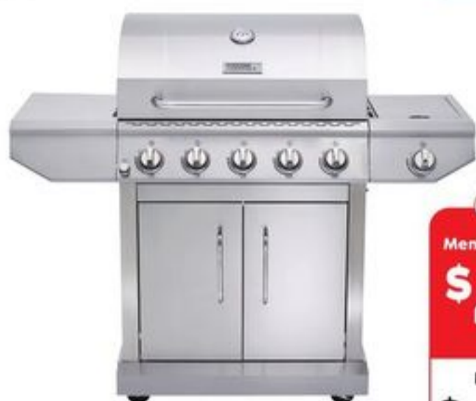
EVERYDAY ESSENTIALS™ 5+1 BURNER PROPANE BBQ GRILL LIMITED 1 YEAR WARRANTY 21258117_EA

Members save $40 Optimum™ Members-Only Price™ $99 Non-members $139