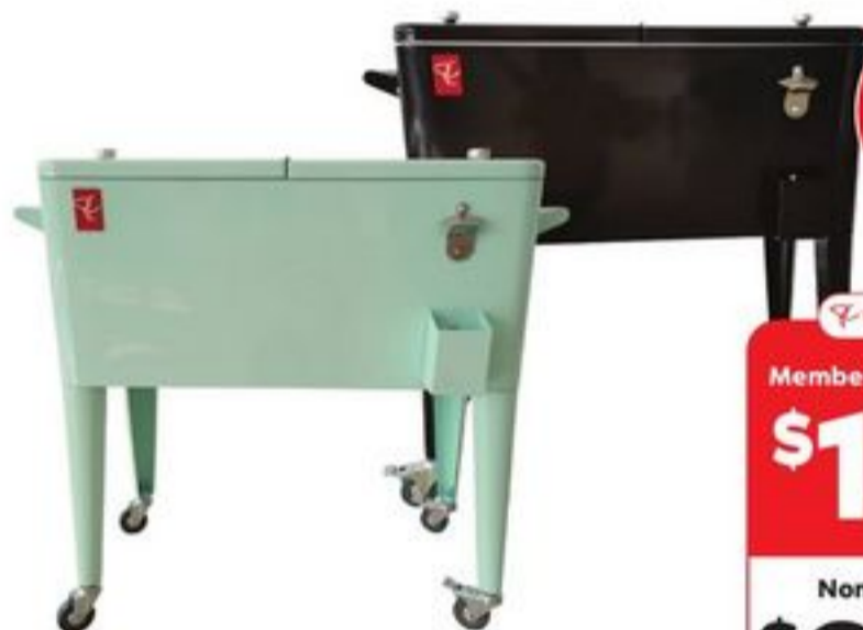
PC® RETRO COOLER BLACK OR MINT, HOLDS 110-355 ML CANS WITH 26 POUNDS OF ICE 21480391_EA/21480408_EA

Members save $80 Optimum™ Members-Only Price™ $419 Non-members $499