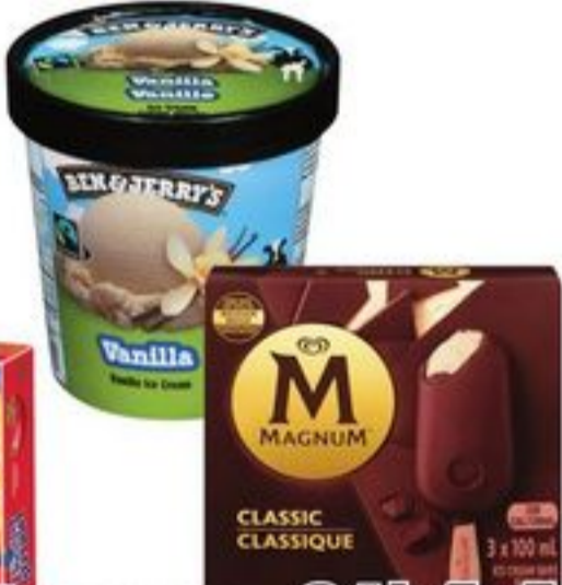
BEN & JERRY'S 473 ML OR MAGNUM BARS 4'S SELECTED VARIETIES FROZEN 20950739_EA/21568089_EA