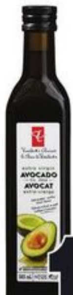
PC® AVOCADO OIL 500 ML 20332066_EA