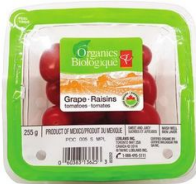
PC® ORGANICS GRAPE TOMATOES PRODUCT OF CANADA OR MEXICO 255 G 20799491001_EA