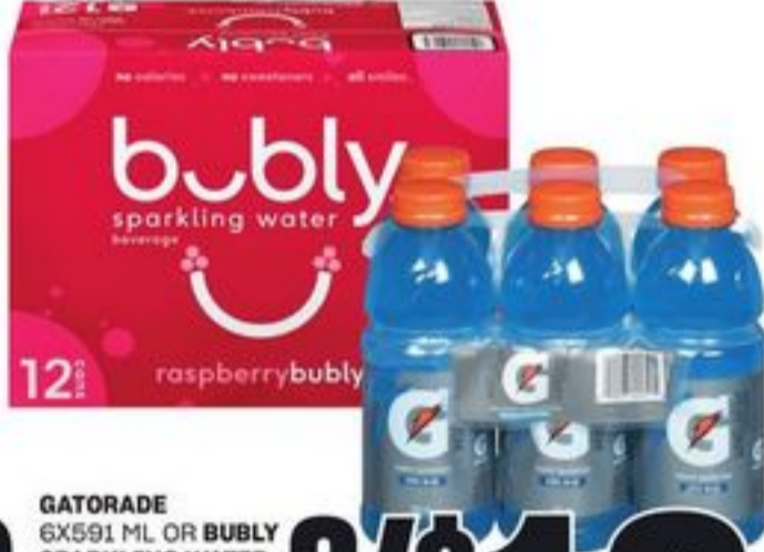
GATORADE 6X591 ML OR BUBLY SPARKLING WATER 12X355 ML OR MONTELLIER 10X355 ML SELECTED VARIETIES 20303218003_C06 21568926_C12