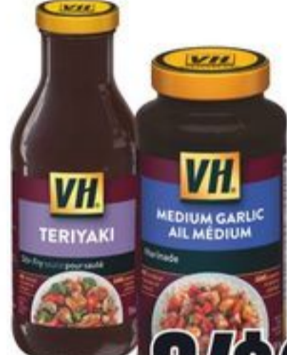
VH SAUCES SELECTED VARIETIES 341/355 ML 20308726001_EA/20309693001_EA