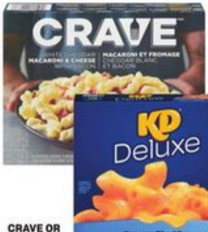
CRAVE OR KRAFT DINNER ENTRÉES SELECTED VARIETIES FROZEN 200-340 G 21085515_EA 21553329_EA