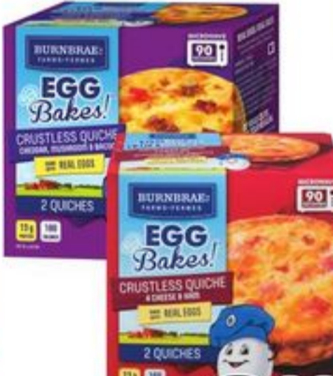
BURNBRAE EGG BAKES SELECTED VARIETIES FROZEN 2/4'S 21060391_EA/21097732_EA