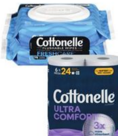
COTTONELLE BATHROOM TISSUE 6-24 ROLLS OR FLUSHABLE WIPES 2'S SELECTED VARIETIES 20688530_EA/21594641_EA