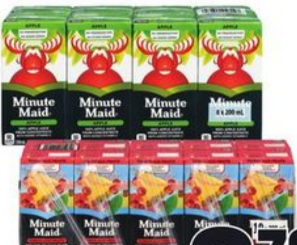
MINUTE MAID, FIVE ALIVE OR NESTEA ICED TEA DRINK BOXES SELECTED VARIETIES 8/10X200 ML 20327042001_EA/21092667_EA