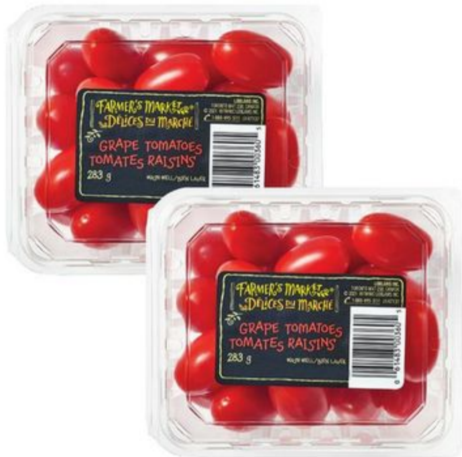
FARMER'S MARKET™ GRAPE TOMATOES PRODUCT OF MEXICO 283 G 21367888001_EA