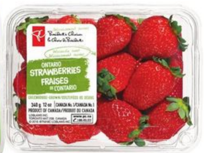
PC® GREENHOUSE STRAWBERRIES PRODUCT OF ONTARIO CANADA NO. 1 GRADE 340 G 21027142001_EA