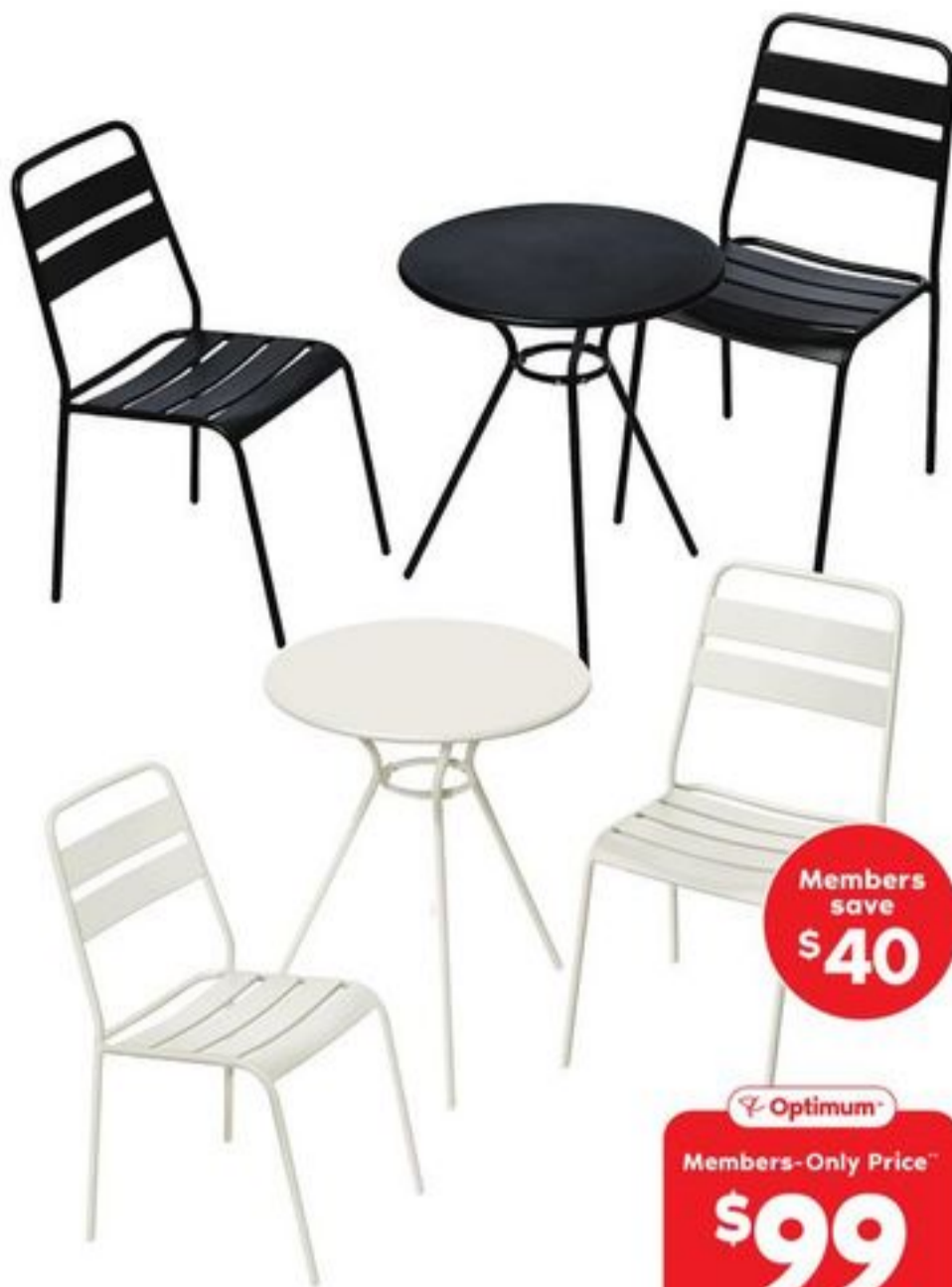
EVERYDAY ESSENTIALS™ 3 PIECE BISTRO SET AVAILABLE IN BLACK OR BONE WHITE 21528749_EA/21298005_EA

Members save $100 Optimum™ Members-Only Price™ $499 Non-members $599