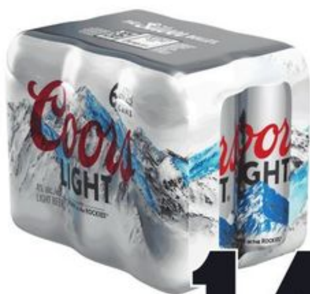
COORS LIGHT 6X473 ML CANS 20946471_C06