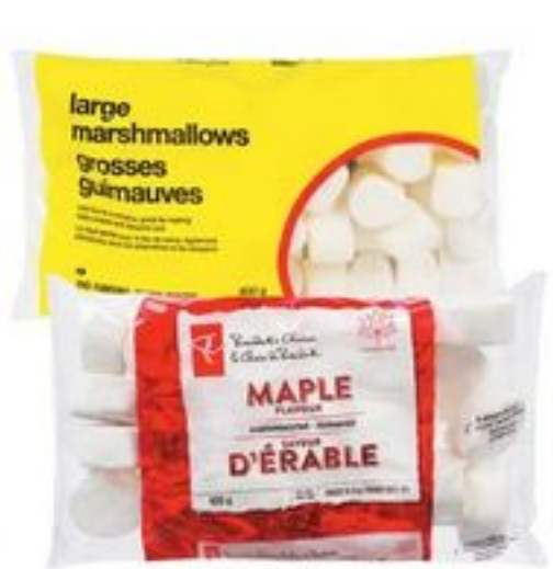
NO NAME® MARSHMALLOWS SELECTED VARIETIES 400 G 20304672001_EA 21008975_EA