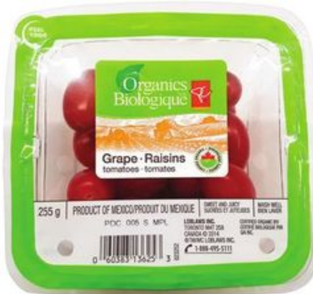
PC® ORGANICS GRAPE TOMATOES PRODUCT OF CANADA OR MEXICO 255 G 20799491001_EA