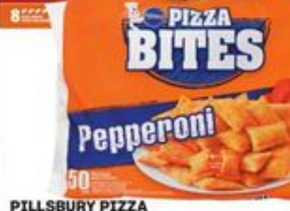
PILLSBURY PIZZA POPS 760 G OR BITES 693 G SELECTED VARIETIES FROZEN 20972958_EA 21435931_EA