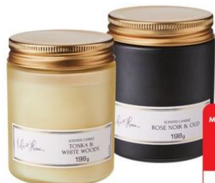
LIFE AT HOME SINGLE WICK CANDLE ASSORTED SCENTS 21414437_EA/21414475_EA