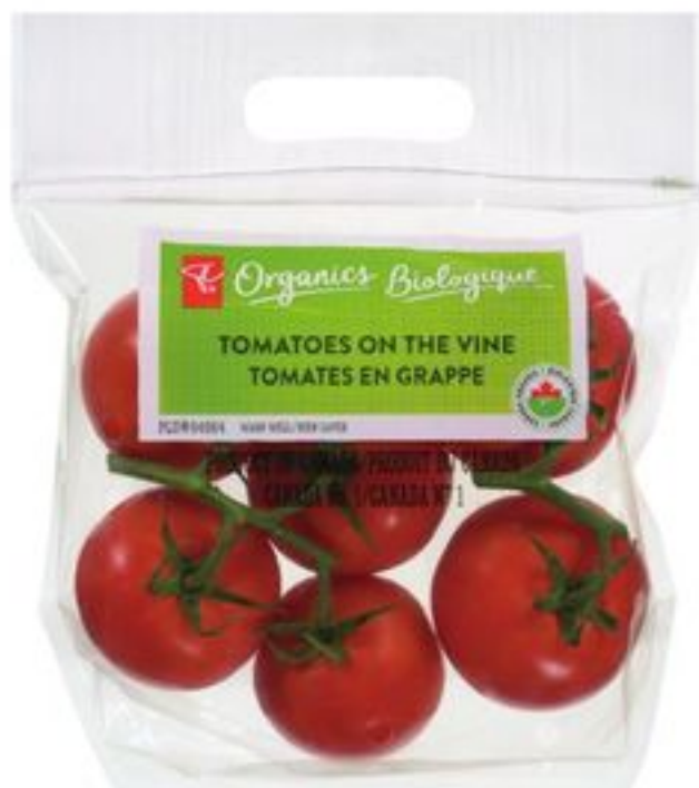
PC® ORGANICS TOMATOES ON THE VINE PRODUCT OF ONTARIO 8.80/KG 20127917001_KG