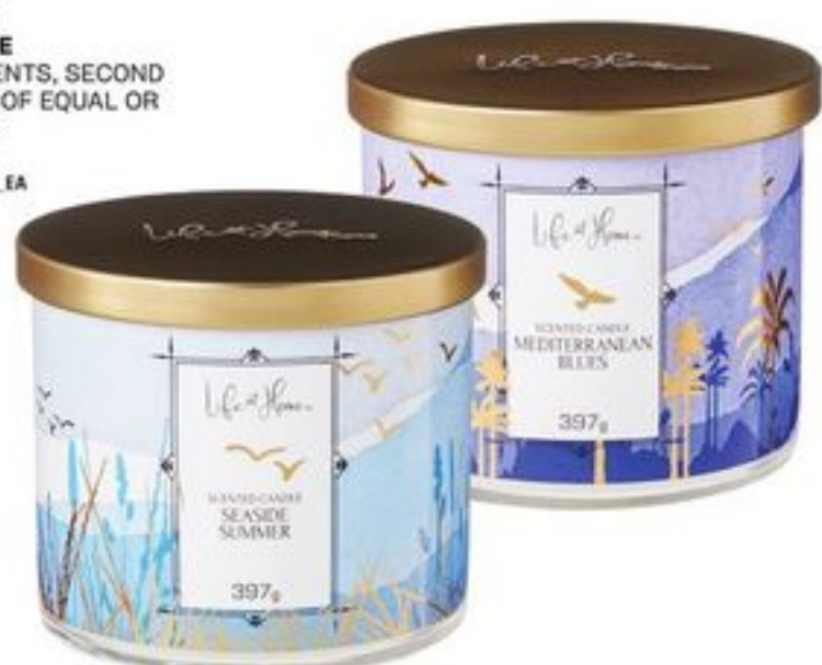
LIFE AT HOME 3 WICK CANDLE ASSORTED SCENTS, SECOND ITEM MUST BE OF EQUAL OR LESSER VALUE $16 21541249_EA/21541281_EA