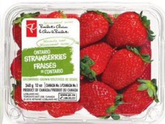
PC® GREENHOUSE STRAWBERRIES PRODUCT OF ONTARIO CANADA NO. 1 GRADE 340 G 21027142001_EA