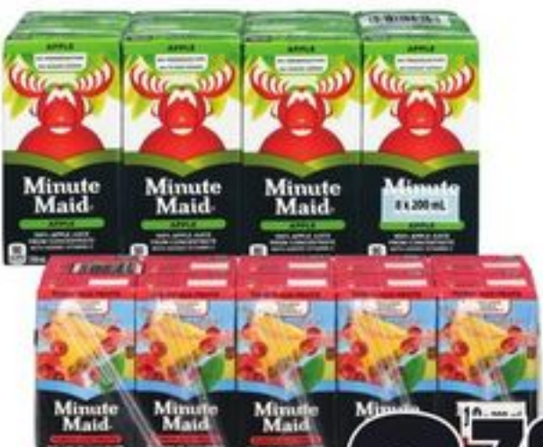
MINUTE MAID, FIVE ALIVE OR NESTEA ICED TEA DRINK BOXES SELECTED VARIETIES 8/10X200 ML 20327042001_EA/21092667_EA