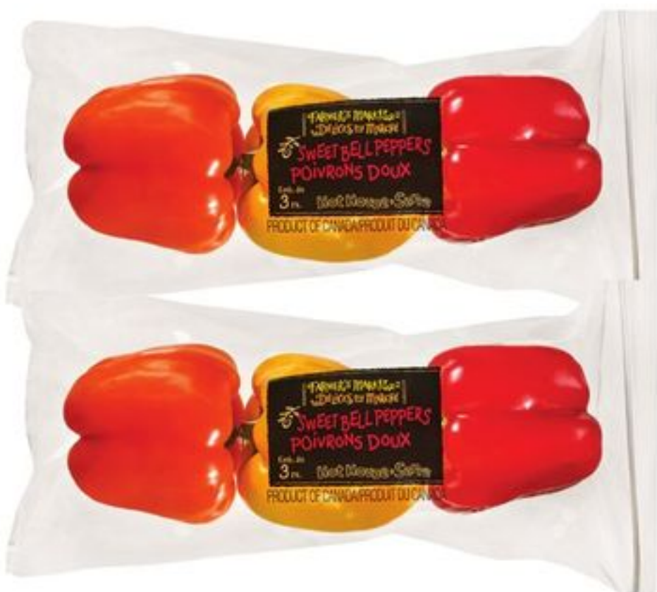
FARMER'S MARKET™ GREENHOUSE PEPPERS PRODUCT OF ONTARIO 3'S 20085851001_EA