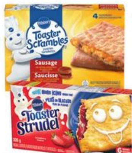
PILLSBURY TOASTER STRUDEL 326 G OR SCRAMBLES 204 G SELECTED VARIETIES FROZEN 20172664001_EA/21474507_EA