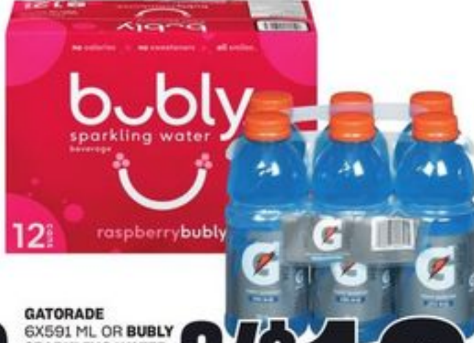
GATORADE 6X591 ML OR BUBLY SPARKLING WATER 12X355 ML OR MONTELLIER 10X355 ML SELECTED VARIETIES 20303218003_C06 21568926_C12