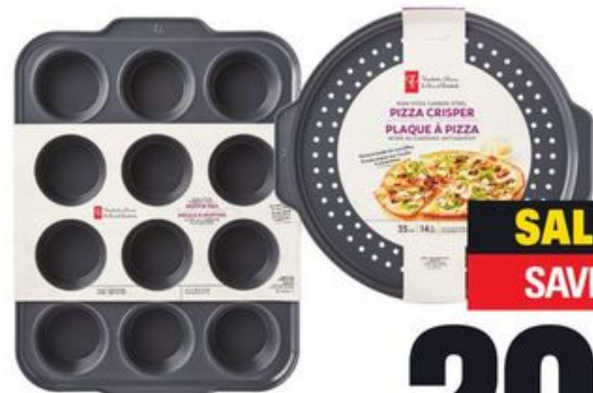
PC METAL BAKEWARE SELECTED VARIETIES 21494804_EA/21494818_EA