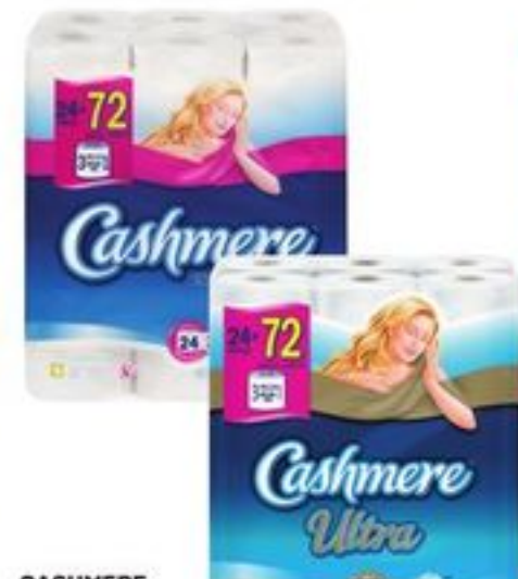
CASHMERE BATHROOM TISSUE SELECTED VARIETIES 24-72 ROLLS 21189845_EA 21443648_EA