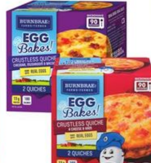
BURNBRAE EGG BAKES SELECTED VARIETIES FROZEN 2/4'S 21060391_EA/21097732_EA