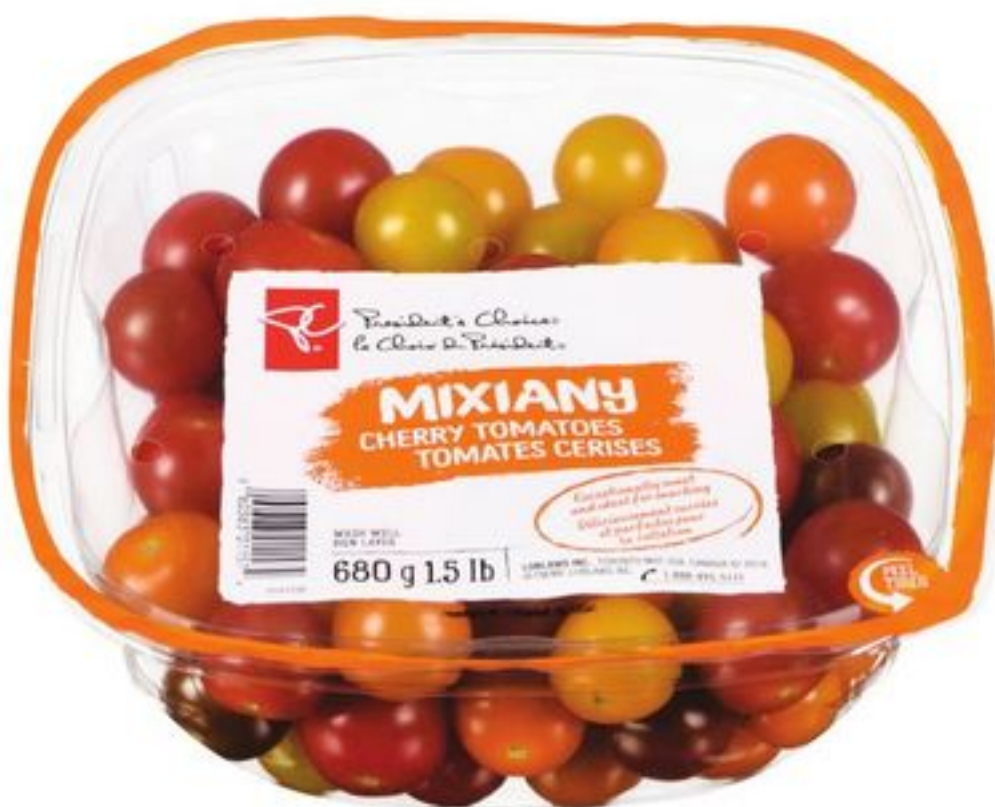
PC® MIXIANY CHERRY TOMATOES PRODUCT OF ONTARIO 680 G 21285888001_EA