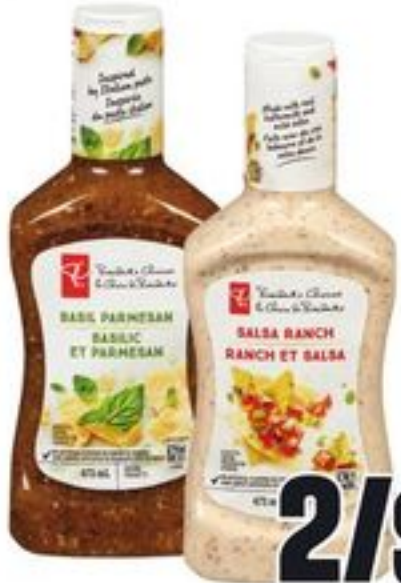
PC® SALAD DRESSING SELECTED VARIETIES 475 ML 20627618001_EA/20627618005_EA

Members save $2 Optimum Members-Only Price 6 99 Non-members 8 99