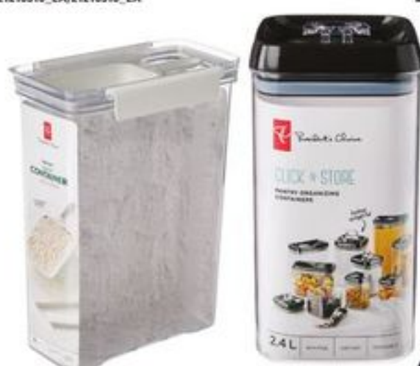
PC TRITAN PANTRY, PC CLICK & STORE OR PC PANTRY STORAGE CONTAINERS SELECTED VARIETIES 20786342_EA/21350618_EA