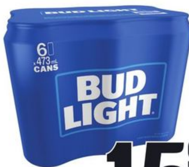
BUD LIGHT 6X473 ML CANS 20955258_C06