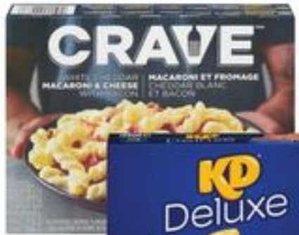
CRAVE OR KRAFT DINNER ENTRÉES SELECTED VARIETIES FROZEN 200-340 G 21085515_EA 21553329_EA