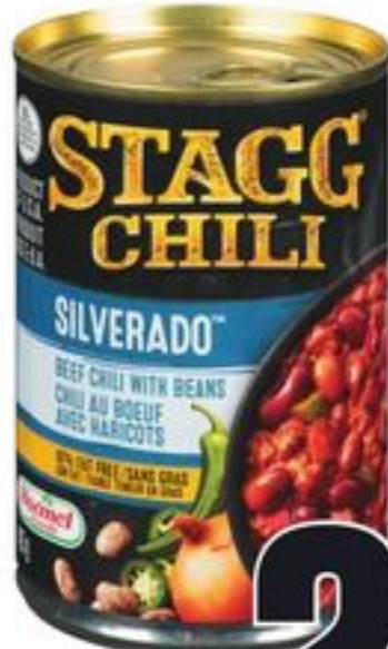
STAGG CHILI SELECTED VARIETIES 425 G 20309125004_EA