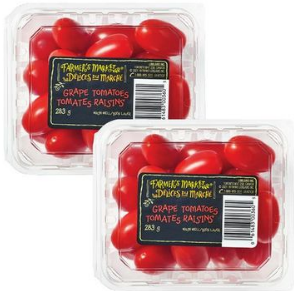
FARMER'S MARKET™ GRAPE TOMATOES PRODUCT OF MEXICO 283 G 21367888001_EA