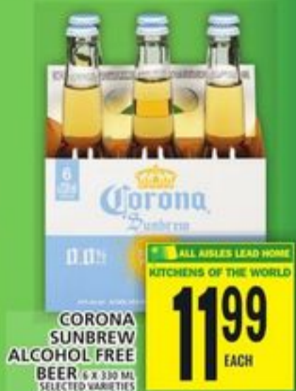
CORONA SUNBREW ALCOHOL FREE BEER 5 x 330 ML SELECTED VARIETIES

ALL AISLES LEAD HOME KITCHENS OF THE WORLD 2.49 EACH