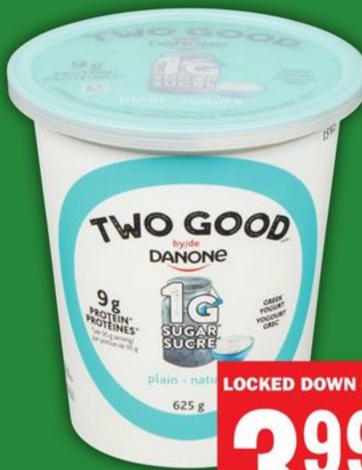
DANONE TWO GOOD GREEK YOGURT 625 G SELECTED VARIETIES