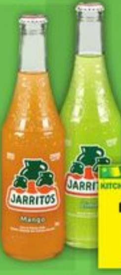
JARRITOS SODA 370 ML SELECTED VARIETIES

ALL AISLES LEAD HOME KITCHENS OF THE WORLD 3.49 EACH