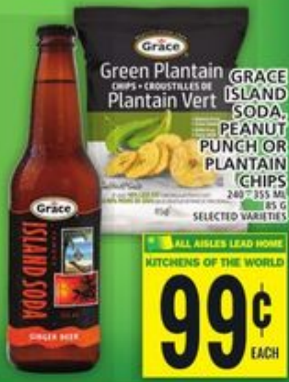
GRACE ISLAND SODA, PEANUT PUNCH OR PLANTAIN CHIPS 240 / 355 ML SELECTED VARIETIES

ALL AISLES LEAD HOME KITCHENS OF THE WORLD 1.49 EACH