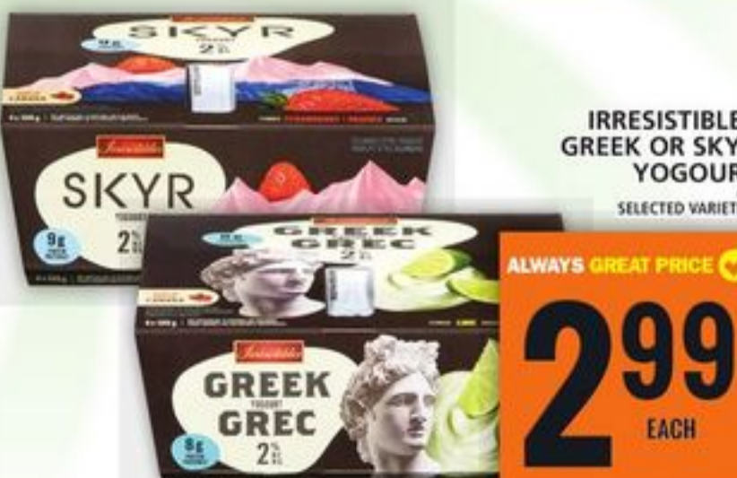
IRRESISTIBLES GREEK OR SKYR YOGURT 4.5 SELECTED VARIETIES