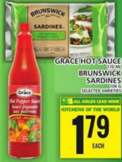
GRACE HOT SAUCE 170 ML BRUNSWICK SARDINES 106 G SELECTED VARIETIES

ALL AISLES LEAD HOME KITCHENS OF THE WORLD 1.67 EACH