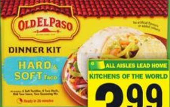
OLD EL PASO TACO KIT 250 / 400 G SALSA 500 ML SELECTED VARIETIES

ALL AISLES LEAD HOME KITCHENS OF THE WORLD 3.99 EACH