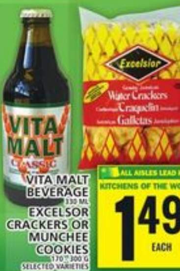
VITA MALT BEVERAGE 370 ML EXCELSIOR CRACKERS OR MUNGHEE COOKIES 170 / 200 G SELECTED VARIETIES

ALL AISLES LEAD HOME KITCHENS OF THE WORLD 7.99 EACH