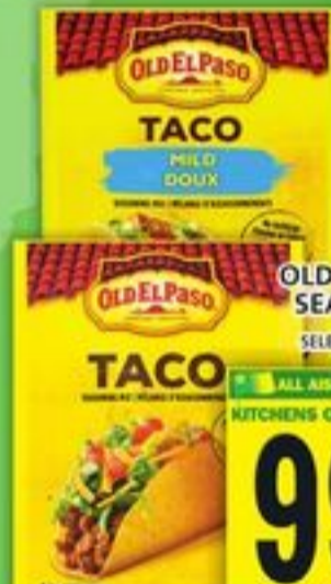
OLD EL PASO SEASONING 24 G SELECTED VARIETIES

ALL AISLES LEAD HOME KITCHENS OF THE WORLD 2.99 EACH