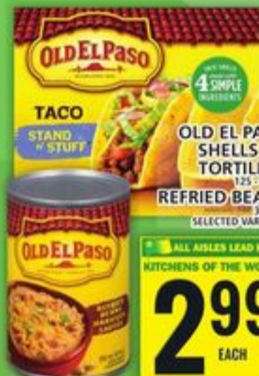
OLD EL PASO SHELLS OR TORTILLAS 125 / 334 G REFRIED BEANS 398 ML SELECTED VARIETIES

ALL AISLES LEAD HOME KITCHENS OF THE WORLD 3.99 EACH