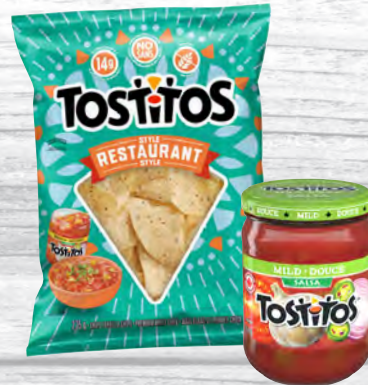
Tostitos Tortilla Chips or Salsa (418 ml) 205-295 g