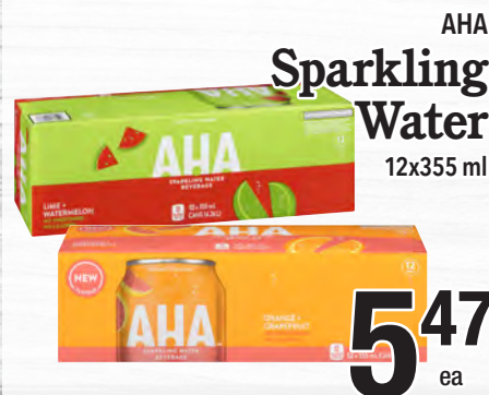
AHA Sparkling Water 12x355 ml