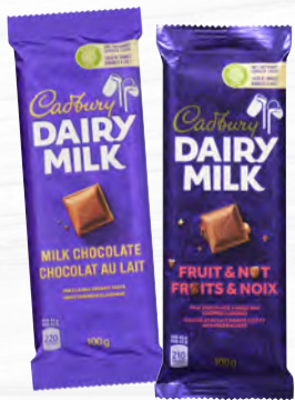
Cadbury Family Bars 100 g