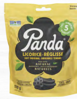
Panda Natural Licorice 170 g