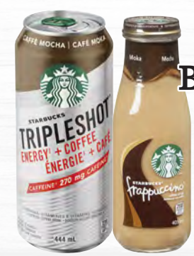
Starbucks Coffee Beverage 405-444 ml