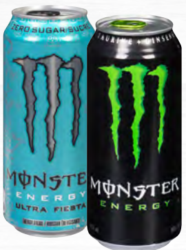
Monster Energy Drinks 444-473 ml