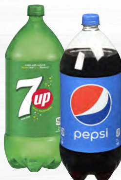
Pepsi & Assorted Pepsi Products 2 L