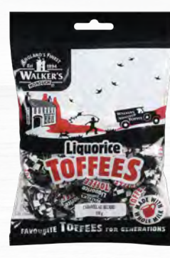
Walker's Toffee Candy 135-150 g