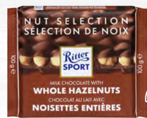
Ritter Sport Chocolate Bar 100 g