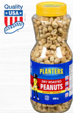
Planters Roasted Peanuts Dry Roasted 600 g