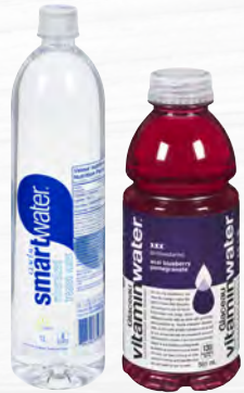
Glacéau Vitamin Water or Smart Water 591 ml-1 L