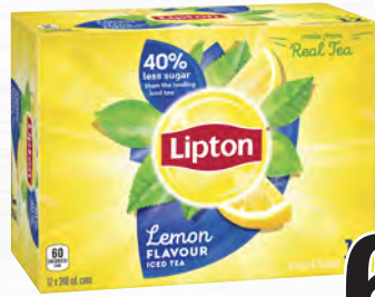
Lipton Iced Tea 12x340 ml