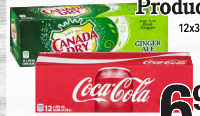
Coke & Assorted Coca Cola Products 12x355 ml