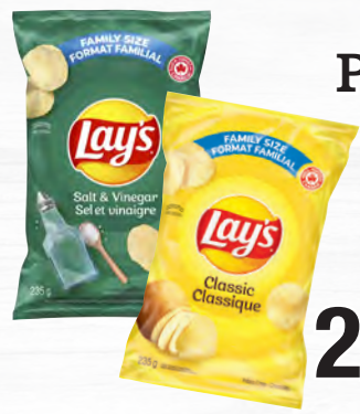
Lay's Potato Chips 220-235 g