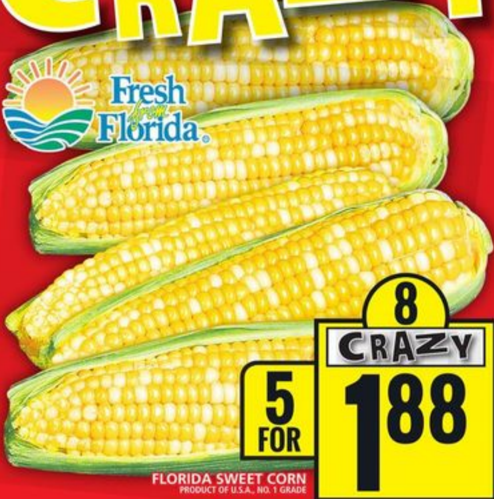
FLORIDA SWEET CORN PRODUCT OF U.S.A., NO. 1 GRADE