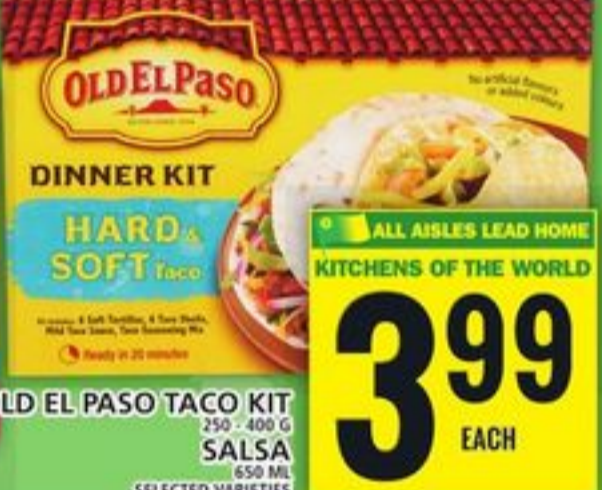
OLD EL PASO TACO KIT 250 / 400 G SALSA 650 ML SELECTED VARIETIES

ALL AISLES LEAD HOME KITCHENS OF THE WORLD 3.99 EACH