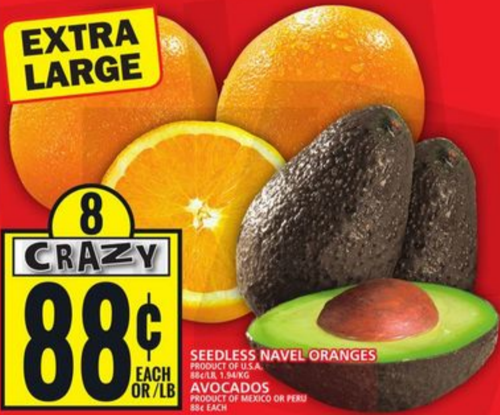
SEEDLESS NAVEL ORANGES PRODUCT OF U.S.A. 88¢/LB, 1.94/KG AVOCADOS PRODUCT OF MEXICO OR PERU 88¢ EACH