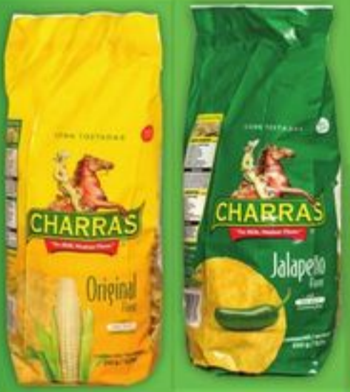
CHARRAS TOSTADAS CHIPS 350 G SELECTED VARIETIES

ALL AISLES LEAD HOME KITCHENS OF THE WORLD 11.99 EACH