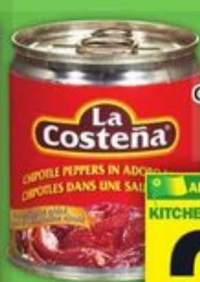
LA COSTEÑA CANNED BEANS 528 / 546 ML MARINADES 186 / 477 ML SELECTED VARIETIES

ALL AISLES LEAD HOME KITCHENS OF THE WORLD 2.79 EACH