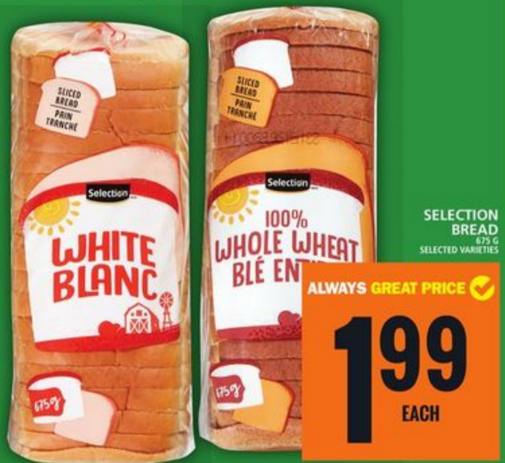
SELECTION BREAD 675 G SELECTED VARIETIES