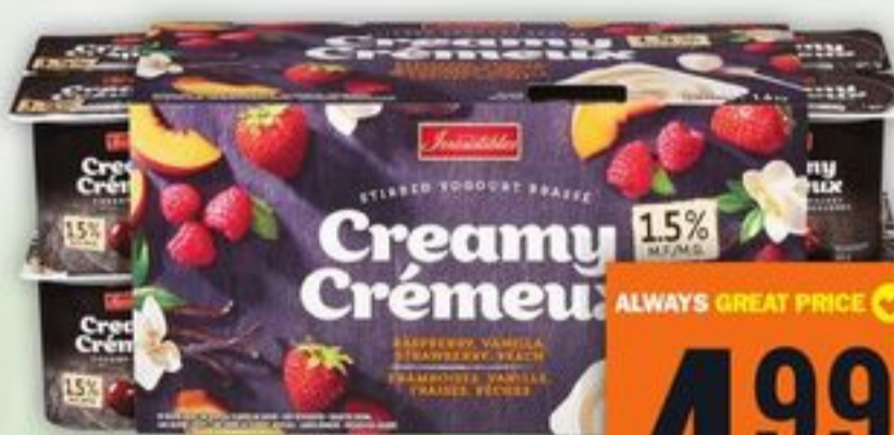
IRRESISTIBLES YOGURT 12 - 16.5 SELECTED VARIETIES