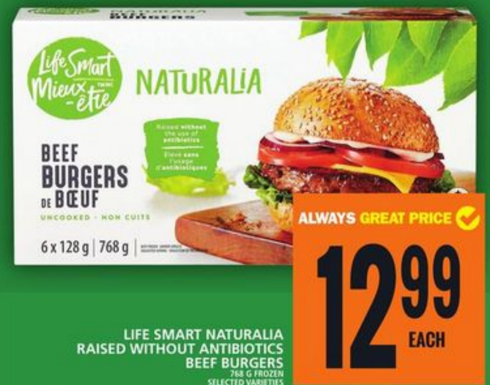
LIFE SMART NATURALIA RAISED WITHOUT ANTIBIOTICS BEEF BURGERS 768 G FROZEN SELECTED VARIETIES