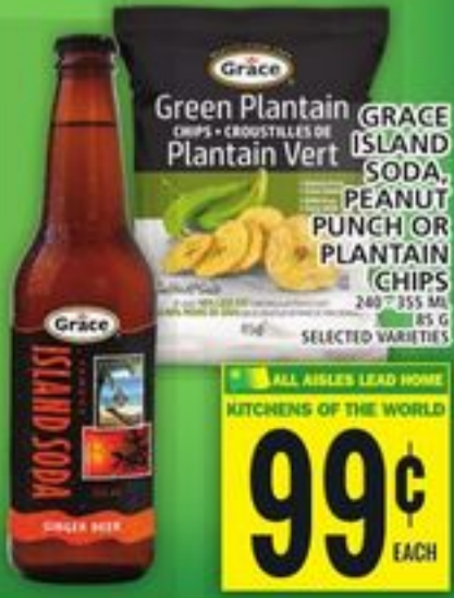
GRACE ISLAND SODA, PEANUT PUNCH OR PLANTAIN CHIPS 240 / 355 ML 106 G SELECTED VARIETIES

ALL AISLES LEAD HOME KITCHENS OF THE WORLD 1.49 EACH