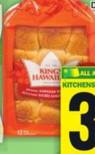
DON PANCHO TORTILLAS 700 G KING'S HAWAIIAN ROLLS 312 / 340 G SELECTED VARIETIES

ALL AISLES LEAD HOME KITCHENS OF THE WORLD 3.99 EACH