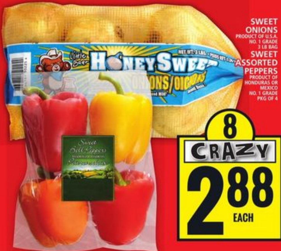
SWEET ONIONS PRODUCT OF U.S.A. NO. 1 GRADE 3 LB BAG SWEET ASSORTED PEPPERS PRODUCT OF HONDURAS OR MEXICO NO. 1 GRADE PKG OF 4