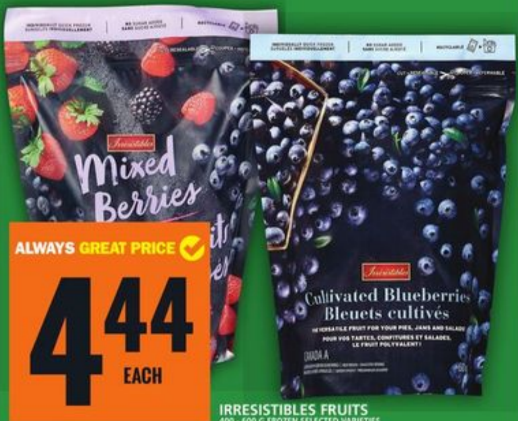
IRRÉSISTIBLES FRUITS 400 - 600 G FROZEN SELECTED VARIETIES