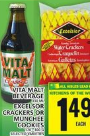
VITA MALT BEVERAGE 1.7 / 200 G EXCELSOR CRACKERS OR MUNGHEE COOKIES SELECTED VARIETIES

ALL AISLES LEAD HOME KITCHENS OF THE WORLD 7.99 EACH