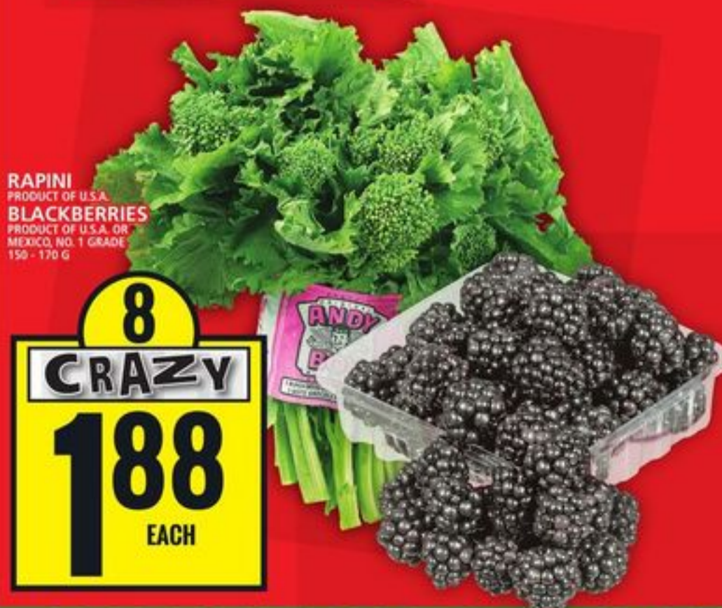
RAPINI PRODUCT OF U.S.A. BLACKBERRIES PRODUCT OF U.S.A. OR MEXICO, NO. 1 GRADE 150 - 170 G

ALWAYS MO GET READY TO SAVE! GREAT PRICES START ON T