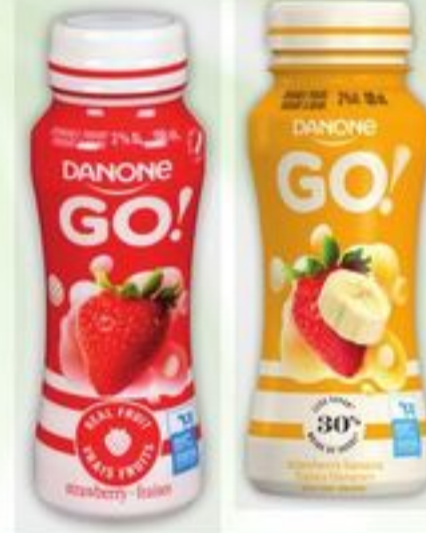
DANONE GO! DRINKABLE YOGURT 190 ML SELECTED VARIETIES