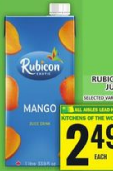
RUBICON JUICE SELECTED VARIETIES

LIMES PRODUCT OF MEXICO OR BRAZIL 1.8 BAG 3.98 EACH