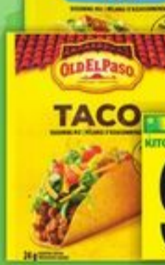
OLD EL PASO TACO SEASONING 24 G SELECTED VARIETIES

ALL AISLES LEAD HOME KITCHENS OF THE WORLD 2.99 EACH