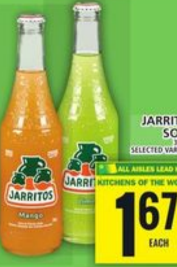
JARRITOS SODA 370 ML SELECTED VARIETIES

ALL AISLES LEAD HOME KITCHENS OF THE WORLD 3.49 EACH