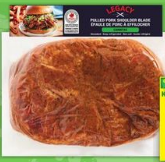
LEGACY CARNITA PULLED PORK ROAST 1 KG SELECTED VARIETIES

ALL AISLES LEAD HOME KITCHENS OF THE WORLD 9.49 EACH