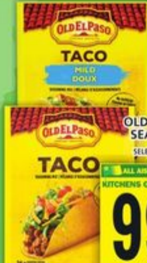
OLD EL PASO TACO SEASONING 24 G SELECTED VARIETIES

ALL AISLES LEAD HOME KITCHENS OF THE WORLD 2.99 EACH