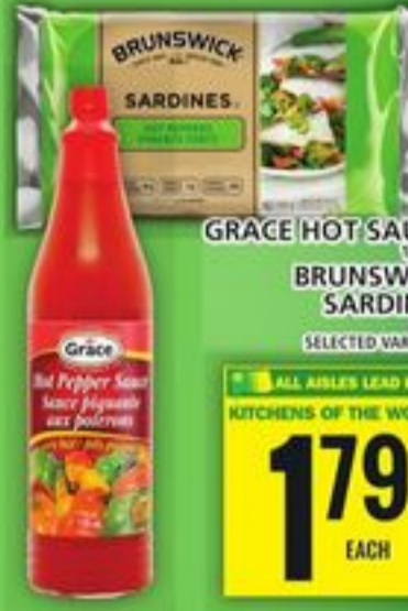
GRACE HOT SAUCE 170 ML BRUNSWICK SARDINES 106 G SELECTED VARIETIES

ALL AISLES LEAD HOME KITCHENS OF THE WORLD 1.67 EACH