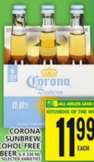
CORONA SUNBREW ALCOHOL FREE BEER 6 x 330 ML SELECTED VARIETIES

ALL AISLES LEAD HOME KITCHENS OF THE WORLD 2.49 EACH