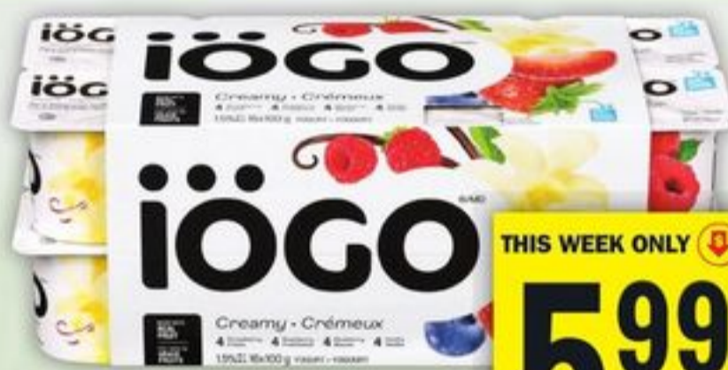
IÖGO YOGURT 16.5 SELECTED VARIETIES