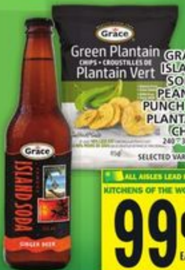
GRACE ISLAND SODA, PEANUT PUNCH OR PLANTAIN CHIPS 240 / 355 ML SELECTED VARIETIES

ALL AISLES LEAD HOME KITCHENS OF THE WORLD 1.49 EACH