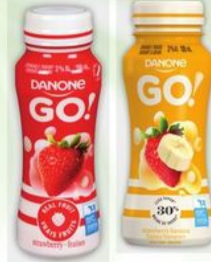
DANONE GO! DRINKABLE YOGURT 190 ML SELECTED VARIETIES