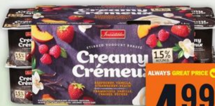
IRRESISTIBLES YOGURT SELECTED VARIETIES