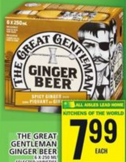
THE GREAT GENTLEMAN GINGER BEER SELECTED VARIETIES

ALL AISLES LEAD HOME KITCHENS OF THE WORLD 13.99 EACH