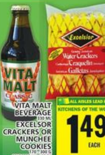
VITA MALT BEVERAGE 1.7 L EXCELSIOR CRACKERS OR MUNGHEE COOKIES 170 / 200 G SELECTED VARIETIES

ALL AISLES LEAD HOME KITCHENS OF THE WORLD 7.99 EACH