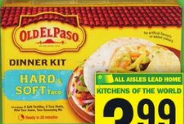
OLD EL PASO TACO KIT 250 / 400 G SALSA 650 ML SELECTED VARIETIES

ALL AISLES LEAD HOME KITCHENS OF THE WORLD 3.99 EACH