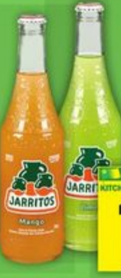
JARRITOS SODA 370 ML SELECTED VARIETIES

ALL AISLES LEAD HOME KITCHENS OF THE WORLD 3.49 EACH