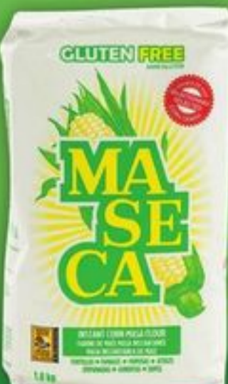
MASECA INSTANT CORN FLOUR 1.8 KG SELECTED VARIETIES

ALL AISLES LEAD HOME KITCHENS OF THE WORLD 7.99 EACH