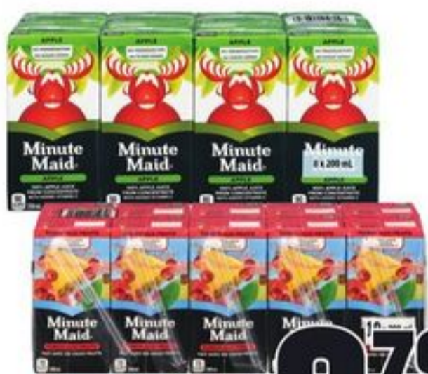
MINUTE MAID, FIVE ALIVE OR NESTEA ICED TEA DRINK BOXES SELECTED VARIETIES 8/10X200 ML 20327042001_EA/21092667_EA