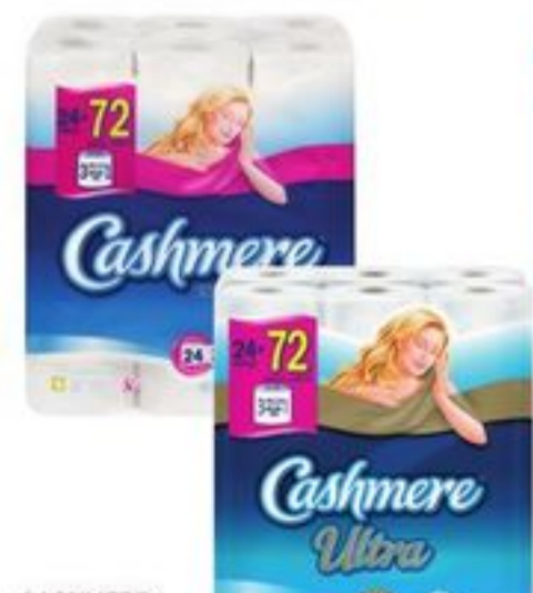
CASHMERE BATHROOM TISSUE SELECTED VARIETIES 24-72 ROLLS 21189845_EA 21443648_EA