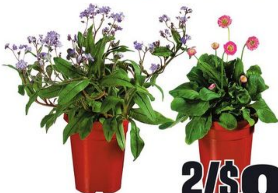
9 CM PERENNIALS EARLY SEASON SELECTED VARIETIES 21347591_EA