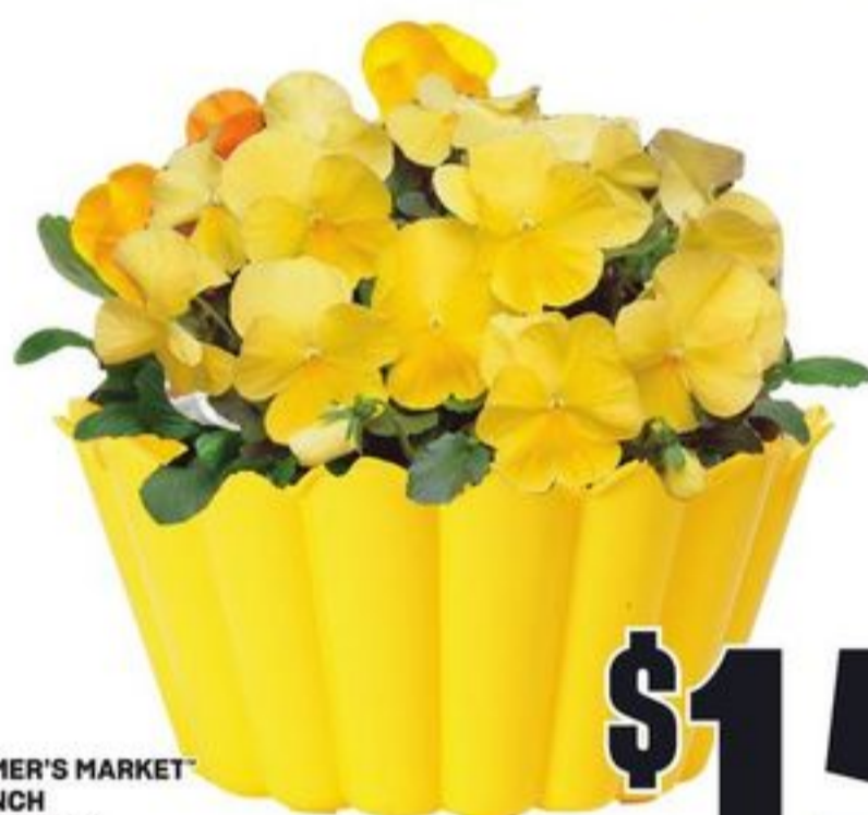
FARMER'S MARKET™ 10 INCH PANSY BOWL SELECTED VARIETIES 20753921_EA