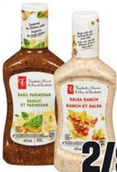
PC® SALAD DRESSING SELECTED VARIETIES 475 ML 20627618001_EA/20627618005_EA

Optimum Members-Only Price 6 99 Non-members 8 99