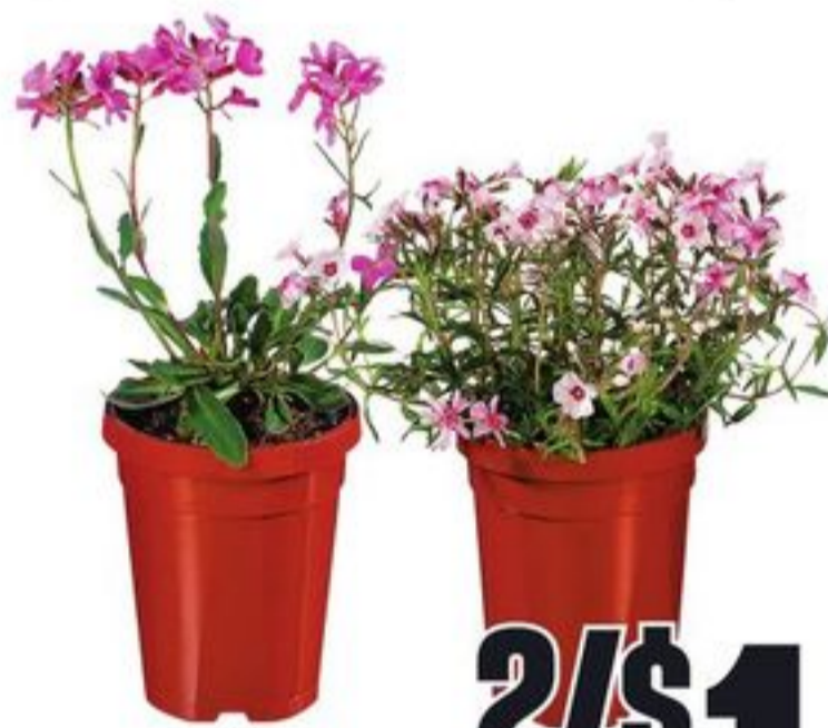
13 CM PERENNIALS EARLY SEASON SELECTED VARIETIES 21348244_EA/21430587_EA