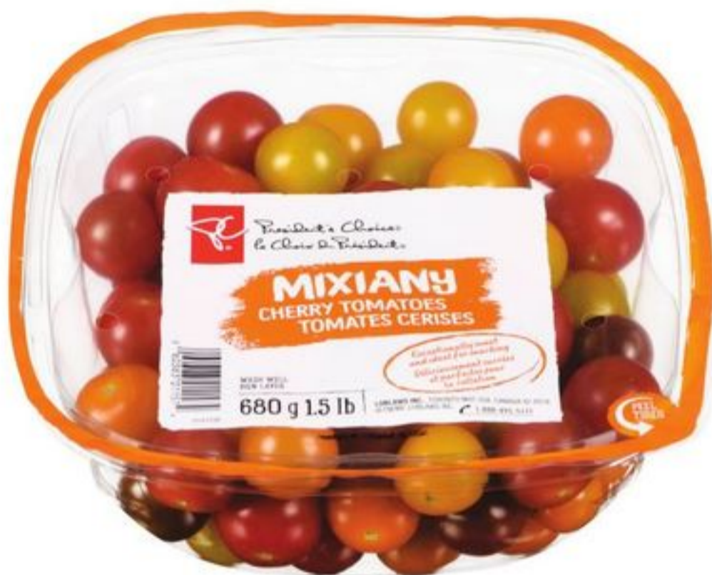
PC® MIXIANY CHERRY TOMATOES PRODUCT OF CANADA 680 G 21285888001_EA