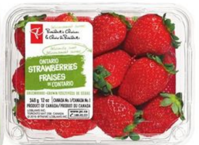
PC® GREENHOUSE STRAWBERRIES PRODUCT OF CANADA CANADA NO. 1 GRADE 340 G 21027142001_EA