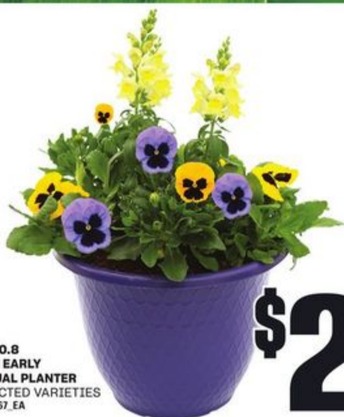
PC® 10.8 INCH EARLY ANNUAL PLANTER SELECTED VARIETIES 20753967_EA