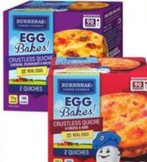
BURNBRAE EGG BAKES SELECTED VARIETIES FROZEN 2/4'S 21060391_EA/21097732_EA