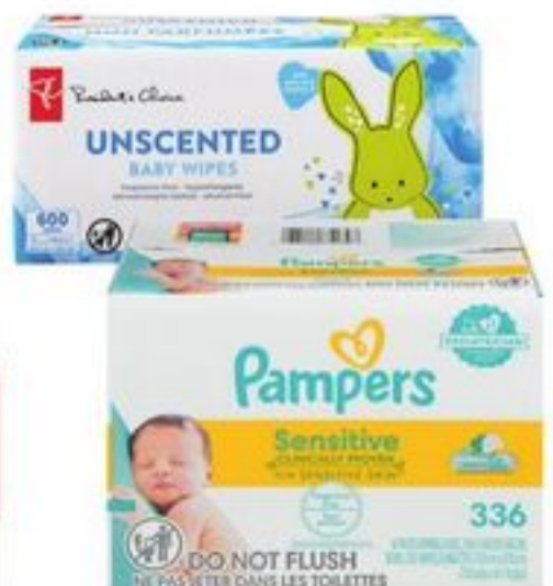
PC®, HUGGIES OR PAMPERS 6'S BABY WIPES 352-600'S SELECTED VARIETIES 21102958_EA 21271645_EA