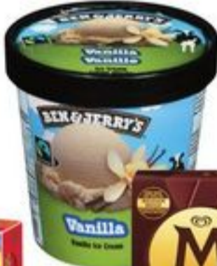
BEN & JERRY'S 473 ML OR MAGNUM BARS 4'S SELECTED VARIETIES FROZEN 20950739_EA/21568089_EA