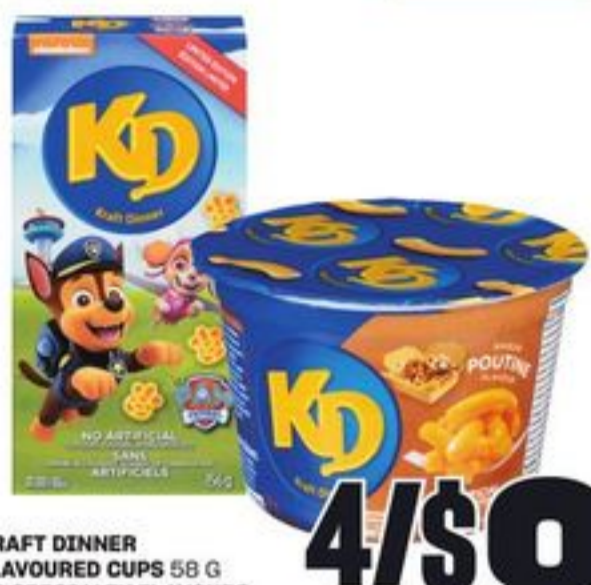
KRAFT DINNER FLAVOURED CUPS 58 G OR SPECIALTY FLAVOURS 150-200 G SELECTED VARIETIES 21393426_EA/21435132_EA