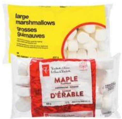
NO NAME® MARSHMALLOWS SELECTED VARIETIES 400 G 20304672001_EA 21008975_EA