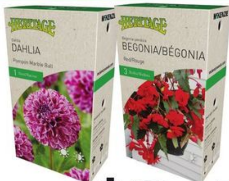
SPRING BULBS PLANT NOW FOR SUMMER BLOOMS SELECTED VARIETIES 21350419_EA/21357248_EA