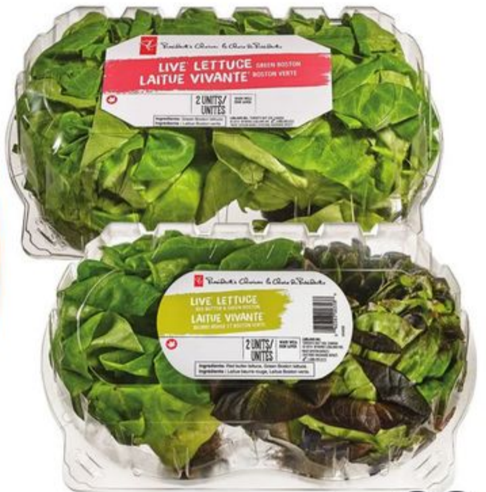
PC® LIVE LETTUCE GREEN, RED OR TRIO PRODUCT OF CANADA 2'S 21212486_EA/21212487_EA