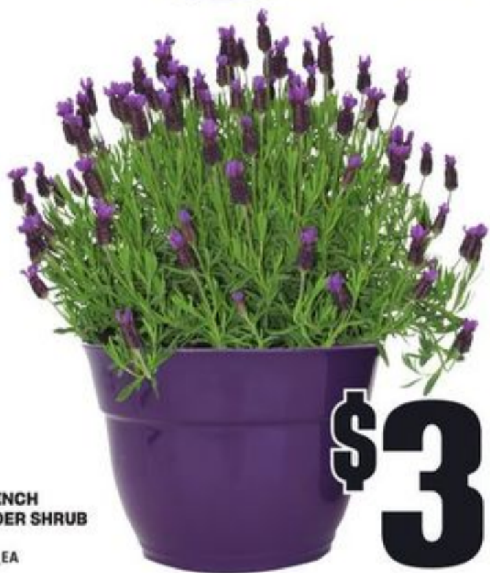
PC® 11 INCH LAVENDER SHRUB EACH 20926885_EA