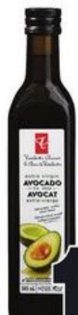
PC® AVOCADO OIL 500 ML 20332066_EA