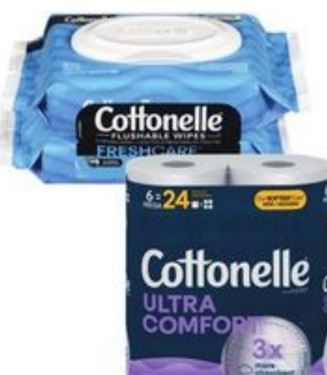
COTTONELLE BATHROOM TISSUE 6-24 ROLLS OR FLUSHABLE WIPES 2'S SELECTED VARIETIES 20688530_EA/21594641_EA