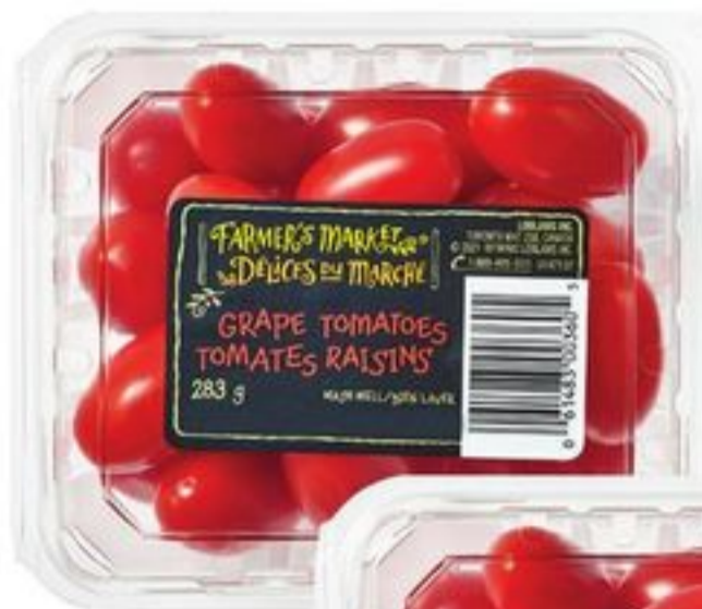
FARMER'S MARKET™ GRAPE TOMATOES PRODUCT OF MEXICO 283 G 21367888001_EA