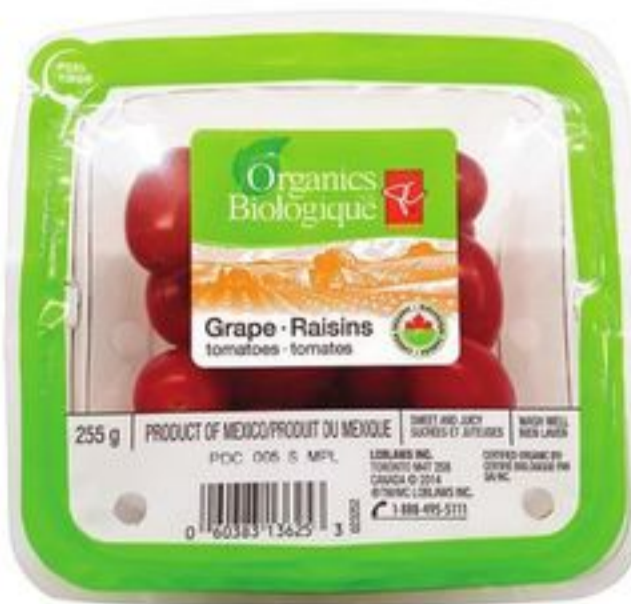
PC® ORGANICS GRAPE TOMATOES PRODUCT OF CANADA OR MEXICO 255 G 20799491001_EA