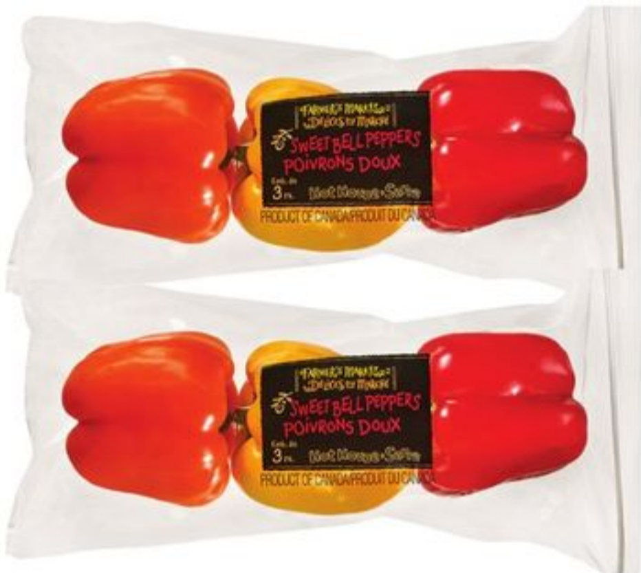
FARMER'S MARKET™ GREENHOUSE PEPPERS PRODUCT OF CANADA 3'S 20085851001_EA