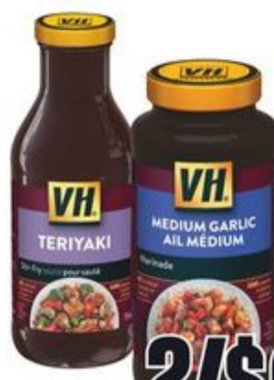
VH SAUCES SELECTED VARIETIES 341/355 ML 20308726001_EA/20309693001_EA