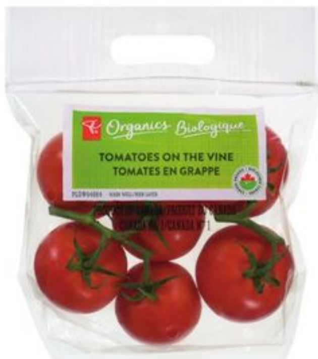
PC® ORGANICS TOMATOES ON THE VINE PRODUCT OF CANADA 8.80/KG 20127917001_KG