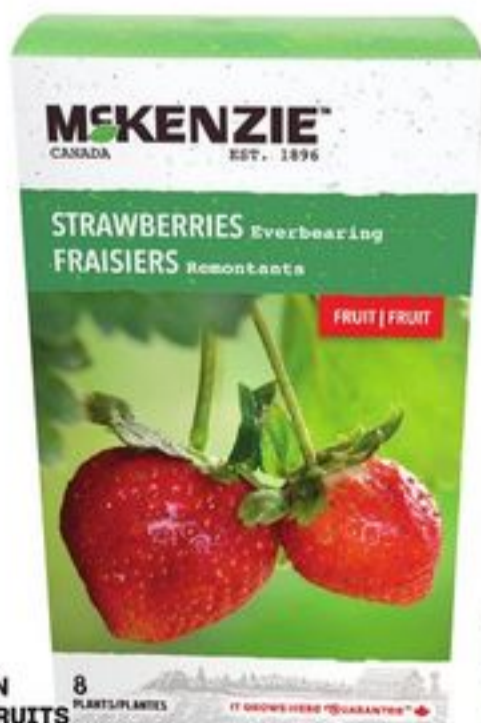
GROW YOUR OWN SELECTION OF FRUITS AND VEGETABLES SELECTED VARIETIES 21515163_EA