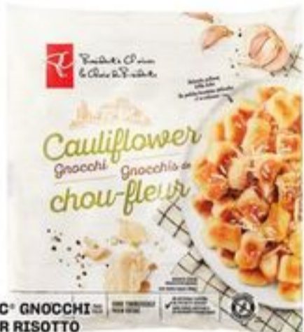
PC® GNOCCHI OR RISOTTO 350-400 G OR PC® ASIAN ENTRÉES OR SOUPS 300 G SELECTED VARIETIES, FROZEN 21546584_EA 21546625_EA