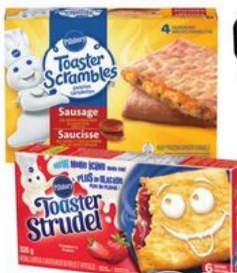
PILLSBURY TOASTER STRUDEL 326 G OR SCRAMBLES 204 G SELECTED VARIETIES FROZEN 20172664001_EA/21474507_EA