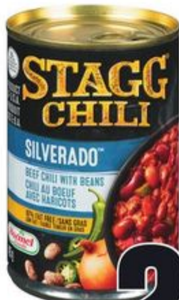
STAGG CHILI SELECTED VARIETIES 425 G 20309125004_EA