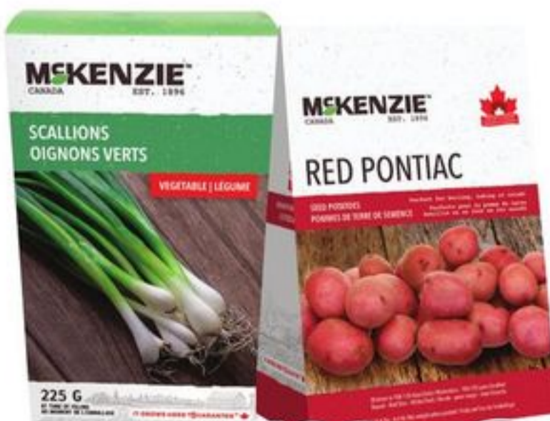
SEED POTATOES, ONIONS AND SHALLOTS SOURCED FROM CANADIAN FARMERS 21515074_EA/21348211_EA