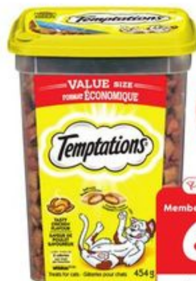
WHISKAS TEMPTATIONS CAT TREATS SELECTED VARIETIES 454 G 21012108_EA