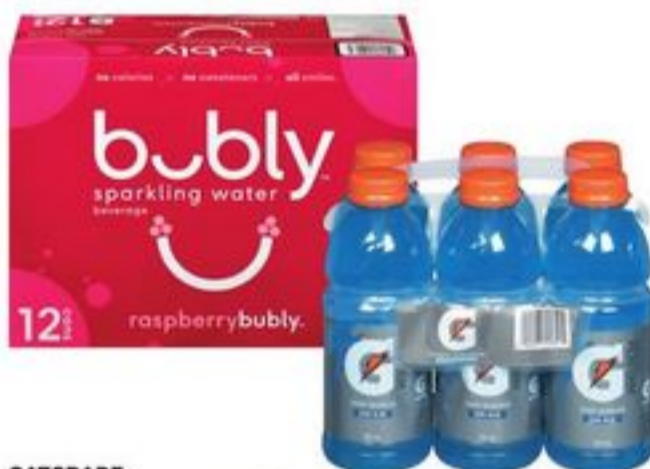
GATORADE 6X591 ML OR BUBLY SPARKLING WATER 12X355 ML OR MONTELLIER 10X355 ML SELECTED VARIETIES 20303218003_C06 21568926_C12