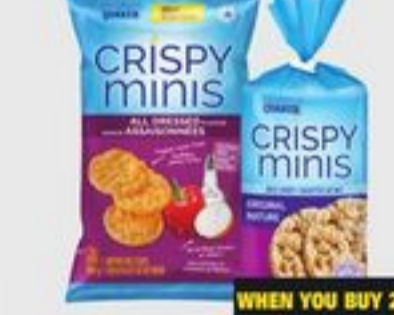
QUAKER CRISPY MINIS OR LARGE RICE CAKES SELECTED VARIETIES 90-199 G 20163708002_EA 21427917_EA