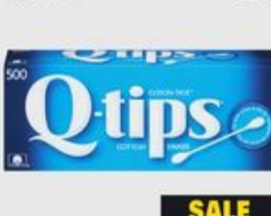
Q-TIPS COTTON SWABS SELECTED VARIETIES 500'S 20323077001_EA