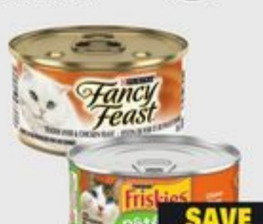
FANCY FEAST 85 G OR FRISKIES 156 G CAT FOOD SELECTED VARIETIES 2030256001_EA 20316703_EA