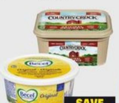
BECEL MARGARINE 427/454 G OR PC ® BLUE MENU ® 907 G OR COUNTRY CROCK ® 850 G SELECTED VARIETIES 20322707001_EA/21535355_EA