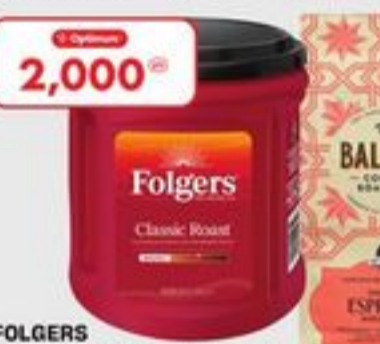
FOLGERS 544-816 G GROUND, BALZAC'S GROUND OR WHOLE BEAN 300/340 G OR CRANK WHOLE BEAN COFFEE 340 G SELECTED VARIETIES 20987612_EA/21478183_EA