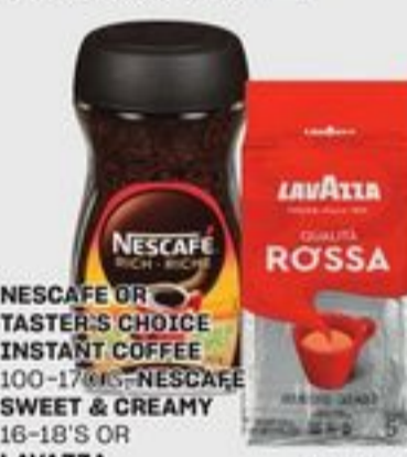
NESCAFÉ OR TASTER'S CHOICE INSTANT COFFEE 100-170 G OR NESCAFÉ SWEET & CREAMY 16-18'S OR LAVAZZA GROUND COFFEE 250 G SELECTED VARIETIES 20873036_EA/21553695_EA