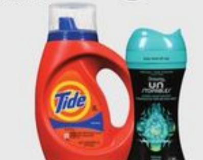
TIDE LAUNDRY DETERGENT 1.09 L, 12-16'S, DOWNY OR GAIN FABRIC SOFTENER 946 ML-1.31 L OR BEADS 141 G SELECTED VARIETIES 20751972_EA/21553274_EA