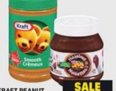
KRAFT PEANUT BUTTER 750 G/1 KG OR HAZELNUT SPREAD 725 G SELECTED VARIETIES 20039581001_EA 21285418_EA