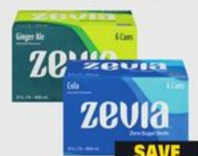
ZEVIA SODA 6X355 ML OR MIXER 6X222 ML SELECTED VARIETIES 21106233_EA 21106231_EA