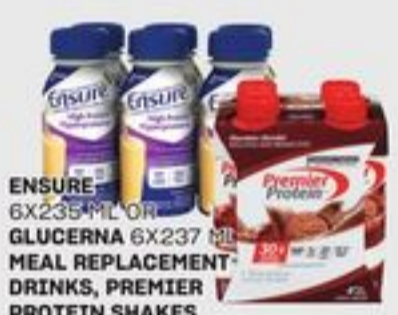
ENSURE 6X235 ML OR GLUCERNA 6X237 ML MEAL REPLACEMENT DRINKS, PREMIER PROTEIN SHAKES 4X325 ML OR MUSCLE MILK PROTEIN SHAKE 4X330 ML SELECTED VARIETIES 20308731001_C06 21031114_EA