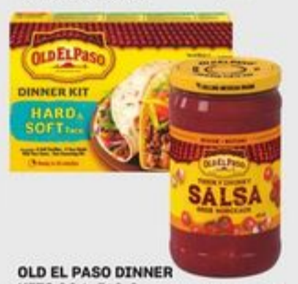
OLD EL PASO DINNER KITS 264-510 G OR SALSA 650 ML SELECTED VARIETIES 20305182001_EA 20795534_EA