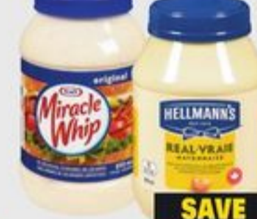
HELLMANN'S MAYONNAISE 710-890 ML OR KRAFT MIRACLE WHIP 650-890 ML SELECTED VARIETIES 20298681001_EA 20618579001_EA