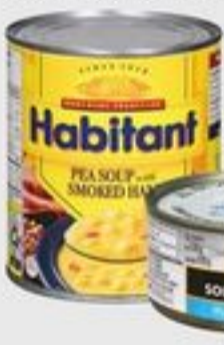
HABITANT SOUPS 796 ML OR CLOVER LEAF WHITE TUNA 170 G SELECTED VARIETIES 2029909002_EA 20326258001_EA