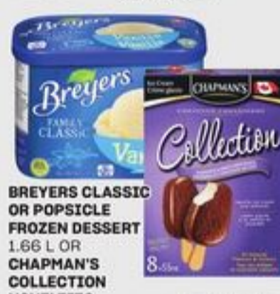
BREYERS CLASSIC OR POPSICLE FROZEN DESSERT 1.66 L OR CHAPMAN'S COLLECTION NOVELTIES 6/8'S SELECTED VARIETIES FROZEN 20301305006_EA 20323757001_EA