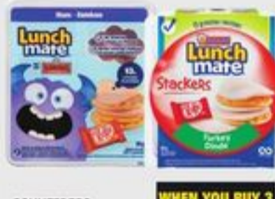
SCHNEIDERS LUNCHMATE STACKERS OR KITS SELECTED VARIETIES 90-132 G 21310034_EA 20710777_EA