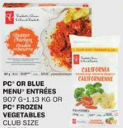
PC ® OR BLUE MENU ® ENTRÉES 907 G-1.13 KG OR PC ® FROZEN VEGETABLES CLUB SIZE 1.75 KG SELECTED VARIETIES FROZEN 20713450_EA 21359210_EA