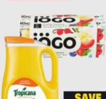
TROPICANA ORANGE JUICE 2.63 L OR iOGO YOGURT 16X100 G SELECTED VARIETIES 2011956001_EA/20609583001_EA