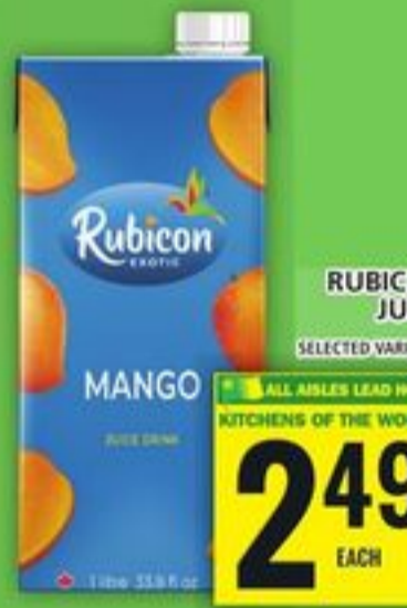
RUBICON JUICE SELECTED VARIETIES

LIMES PRODUCT OF MEXICO OR BRAZIL 1.8 BAG 3.98 EACH