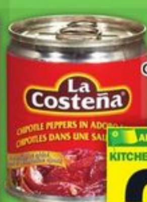
LA COSTEÑA CANNED BEANS 528 / 546 ML MARINADES 186 / 477 ML SELECTED VARIETIES

ALL AISLES LEAD HOME KITCHENS OF THE WORLD 2.79 EACH