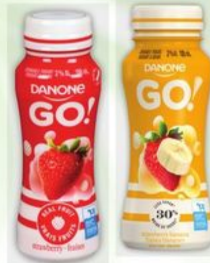
DANONE GO! DRINKABLE YOGURT 190 ML SELECTED VARIETIES