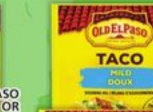
OLD EL PASO SHELLS OR TORTILLAS 125 / 134 G REFRIED BEANS 398 ML SELECTED VARIETIES

ALL AISLES LEAD HOME KITCHENS OF THE WORLD 2.99 EACH