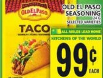
OLD EL PASO SEASONING 24 G SELECTED VARIETIES

ALL AISLES LEAD HOME KITCHENS OF THE WORLD 2.99 EACH