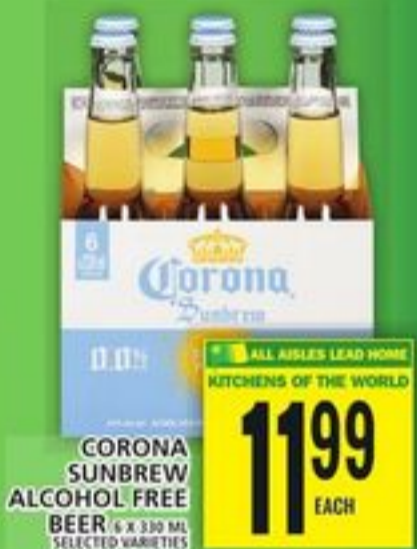
CORONA SUNBREW ALCOHOL FREE BEER 6 x 330 ML SELECTED VARIETIES

ALL AISLES LEAD HOME KITCHENS OF THE WORLD 2.49 EACH