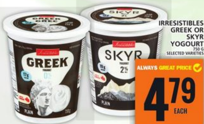
IRRESISTIBLES GREEK OR SKYR YOGURT 750 G SELECTED VARIETIES