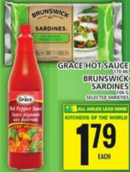
GRACE HOT SAUCE 170 ML

ALL AISLES LEAD HOME KITCHENS OF THE WORLD 1.67 EACH