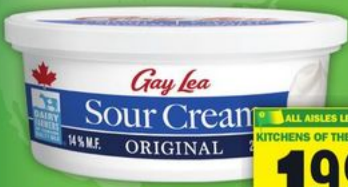
GAY LEA SOUR CREAM SELECTED VARIETIES

ALL AISLES LEAD HOME KITCHENS OF THE WORLD 10.99 EACH