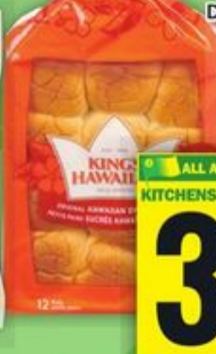
DON PANCHO TORTILLAS 700 G KING'S HAWAIIAN ROLLS 312 / 340 G SELECTED VARIETIES

ALL AISLES LEAD HOME KITCHENS OF THE WORLD 3.99 EACH