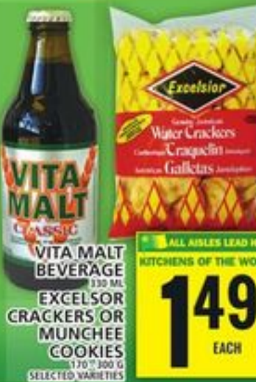
VITA MALT BEVERAGE 1.70 / 200 G EXCELSOR CRACKERS OR MUNGHEE COOKIES SELECTED VARIETIES

ALL AISLES LEAD HOME KITCHENS OF THE WORLD 7.99 EACH