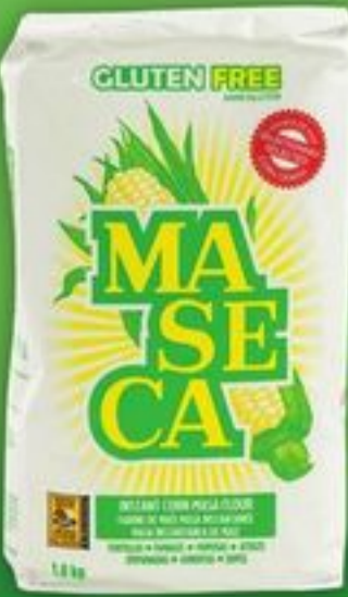
MASECA INSTANT CORN FLOUR 1.8 KG SELECTED VARIETIES

ALL AISLES LEAD HOME KITCHENS OF THE WORLD 7.99 EACH