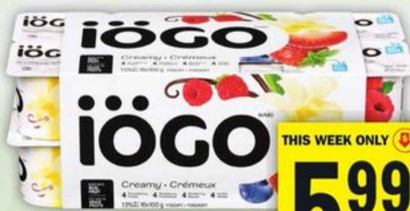
IÖGO YOGURT 16.5 SELECTED VARIETIES