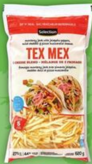
SELECTION SHREDDED CHEESE 620 G SELECTED VARIETIES

ALL AISLES LEAD HOME KITCHENS OF THE WORLD 9.49 EACH