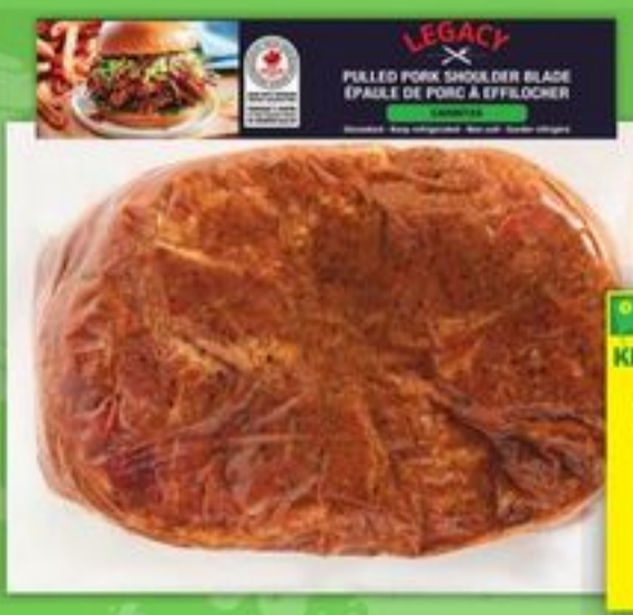
LEGACY CARNITA PULLED PORK ROAST 1 KG SELECTED VARIETIES

ALL AISLES LEAD HOME KITCHENS OF THE WORLD 9.49 EACH