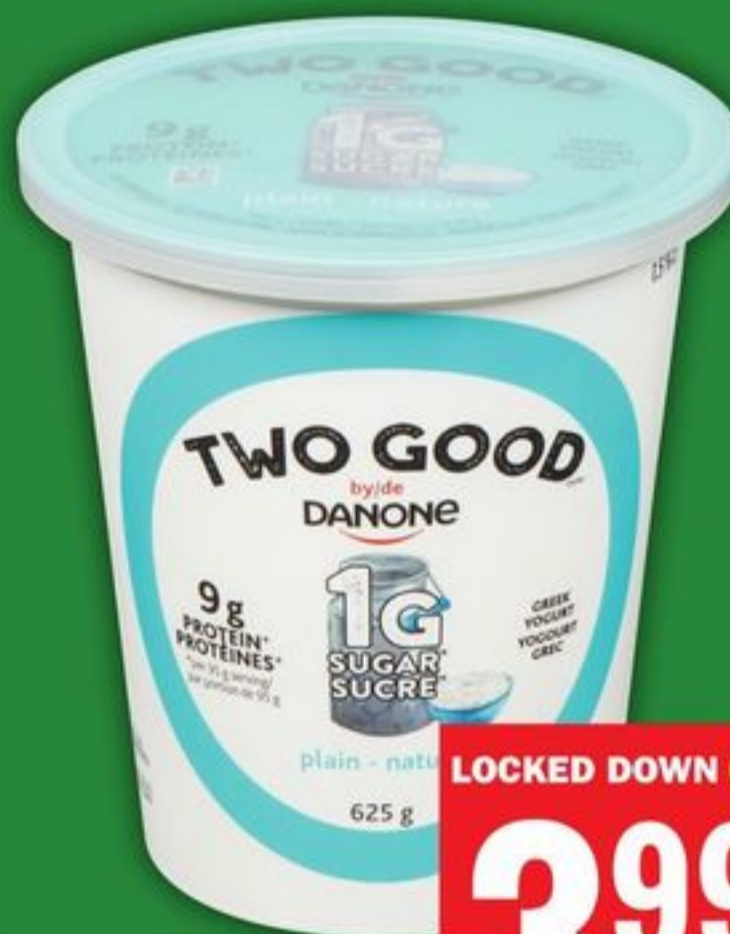
DANONE TWO GOOD GREEK YOGURT 625 G SELECTED VARIETIES