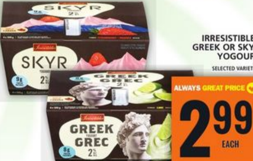
IRRESISTIBLES GREEK OR SKYR YOGURT 4.5 SELECTED VARIETIES