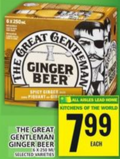
THE GREAT GENTLEMAN GINGER BEER SELECTED VARIETIES

ALL AISLES LEAD HOME KITCHENS OF THE WORLD 13.99 EACH