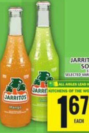
JARRITOS SODA 370 ML SELECTED VARIETIES

ALL AISLES LEAD HOME KITCHENS OF THE WORLD 3.49 EACH