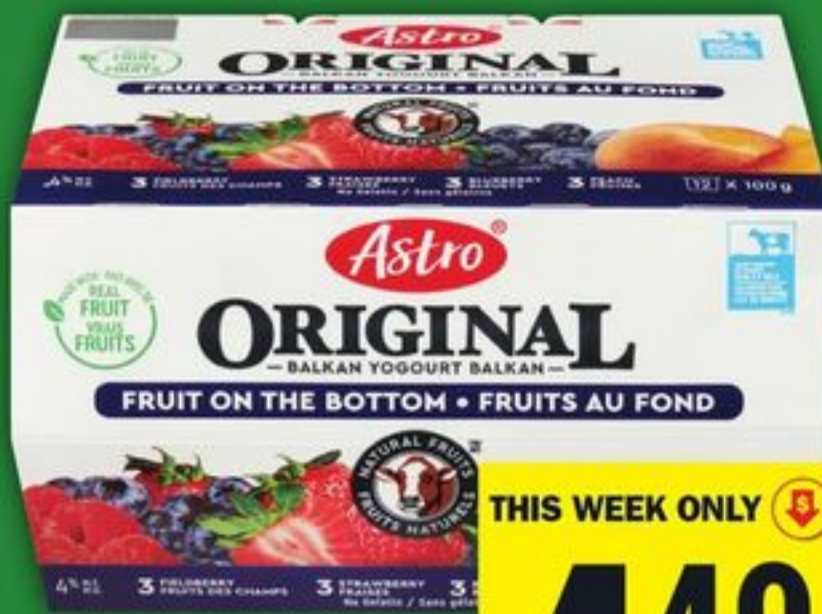
ASTRO ORIGINAL YOGURT 12.5 SELECTED VARIETIES