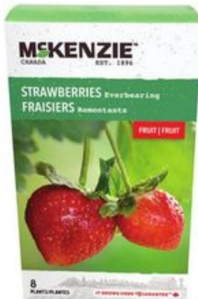
GROW YOUR OWN SELECTION OF FRUITS AND VEGETABLES SELECTED VARIETIES 21515163_EA