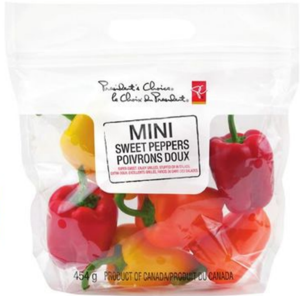
PC® MINI PEPPERS PRODUCT OF CANADA 454 G 20889400001_EA