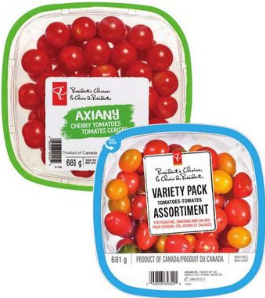
PC® AXIANY TOMATOES OR PC® TOMATO VARIETY PACK PRODUCT OF CANADA 681 G 21090447001_EA/20949866001_EA