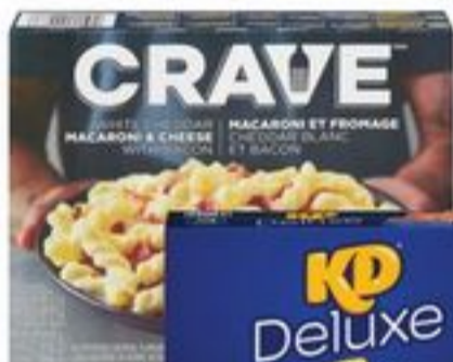
CRAVE OR KRAFT DINNER ENTRÉES SELECTED VARIETIES FROZEN 200-340 G 21085515_EA 21553329_EA