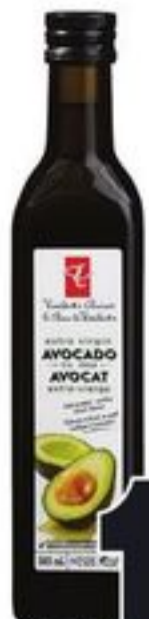
PC® AVOCADO OIL 500 ML 20332066_EA