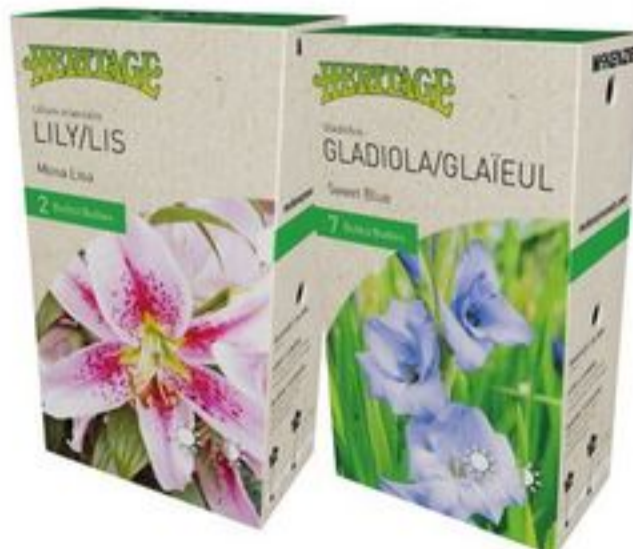
SPRING BULBS PLANT NOW FOR SUMMER BLOOMS SELECTED VARIETIES 21357246_EA/21357249_EA