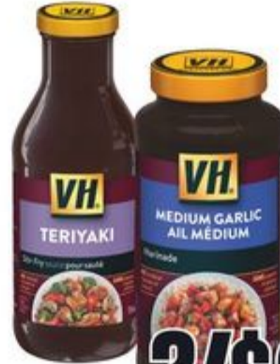
VH SAUCES SELECTED VARIETIES 341/355 ML 20308726001_EA/20309693001_EA