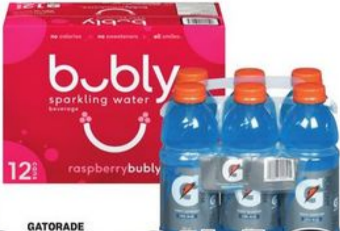
GATORADE 6X591 ML OR BUBLY SPARKLING WATER 12X355 ML OR MONTELLIER 10X355 ML SELECTED VARIETIES 20303218003_C06 21568926_C12