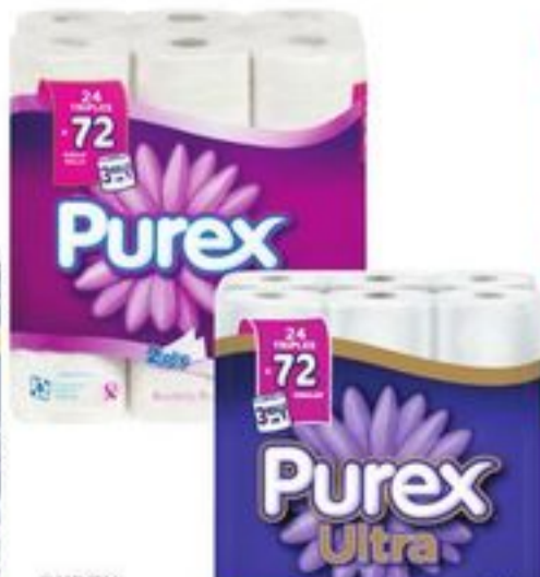
PUREX BATHROOM TISSUE SELECTED VARIETIES 24-72 ROLLS 21189854_EA 21443672_EA