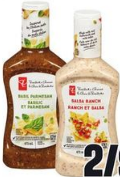
PC® SALAD DRESSING SELECTED VARIETIES 475 ML 20627618001_EA/20627618005_EA

Members save $2 Optimum Members-Only Price 6 99 Non-members 8 99