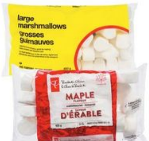
NO NAME® MARSHMALLOWS SELECTED VARIETIES 400 G 20304672001_EA 21008975_EA