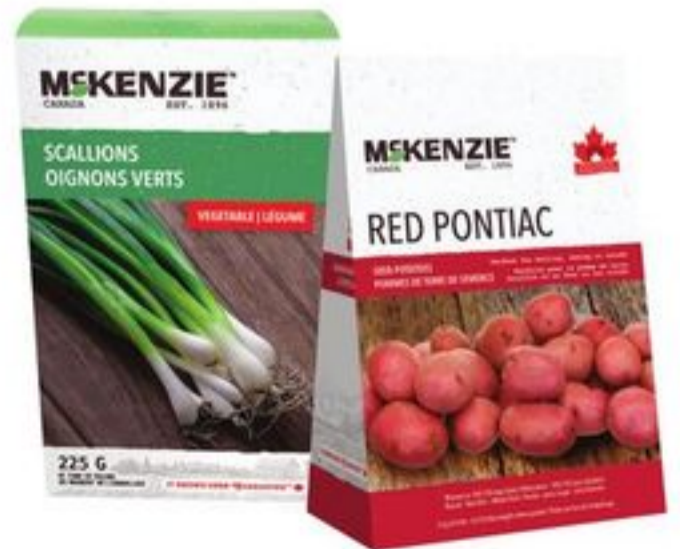
SEED POTATOES, ONIONS AND SHALLOTS SOURCED FROM CANADIAN FARMERS 21515074_EA 21348211_EA