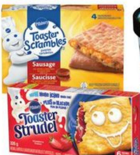
PILLSBURY TOASTER STRUDEL 326 G OR SCRAMBLES 204 G SELECTED VARIETIES FROZEN 20172664001_EA/21474507_EA