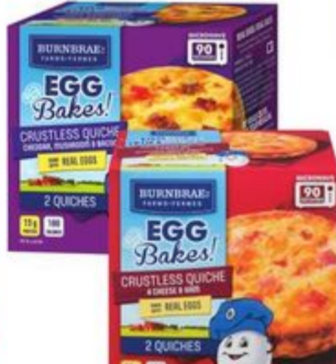
BURNBRAE EGG BAKES SELECTED VARIETIES FROZEN 2/4'S 21060391_EA/21097732_EA