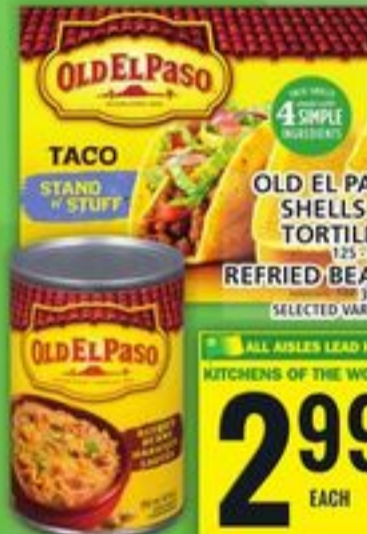
OLD EL PASO SHELLS OR TORTILLAS 334 G REFRIED BEANS 398 ML SELECTED VARIETIES

ALL AISLES LEAD HOME KITCHENS OF THE WORLD 3.99 EACH