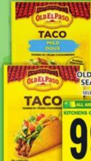
OLD EL PASO TACO SEASONING 24 G SELECTED VARIETIES

ALL AISLES LEAD HOME KITCHENS OF THE WORLD 2.99 EACH