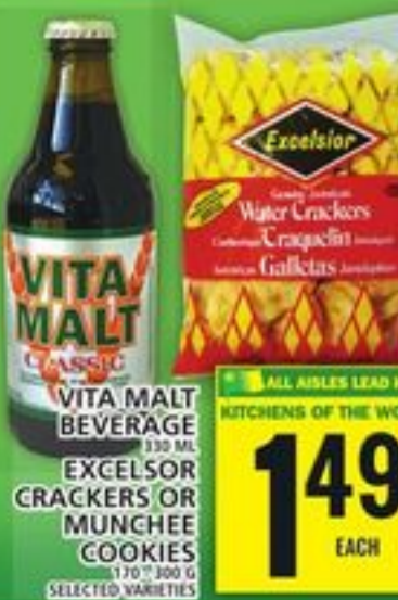
VITA MALT BEVERAGE 1.7 L EXCELSIOR CRACKERS OR MUNGHEE COOKIES 1.7 - 200 G SELECTED VARIETIES

ALL AISLES LEAD HOME KITCHENS OF THE WORLD 7.99 EACH