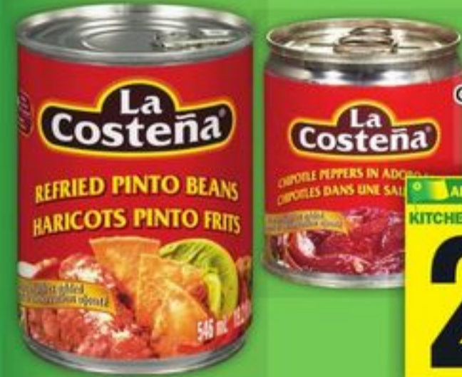
LA COSTEÑA CANNED BEANS 528 - 546 ML MARINADES 186 - 477 ML SELECTED VARIETIES

ALL AISLES LEAD HOME KITCHENS OF THE WORLD 1.79 EACH