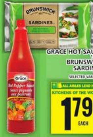
GRACE HOT SAUCE 170 ML BRUNSWICK SARDINES 106 G SELECTED VARIETIES

ALL AISLES LEAD HOME KITCHENS OF THE WORLD 1.67 EACH