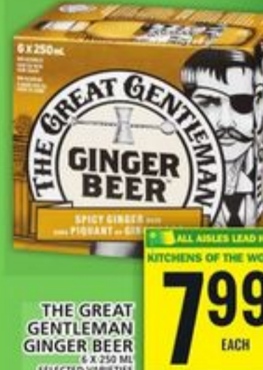
THE GREAT GENTLEMAN GINGER BEER 6 x 250 ML SELECTED VARIETIES

ALL AISLES LEAD HOME KITCHENS OF THE WORLD 13.99 EACH