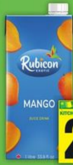
RUBICON JUICE 1.1 L SELECTED VARIETIES

LIMES PRODUCT OF MEXICO OR BRAZIL 1.8 BAG 3.98 EACH