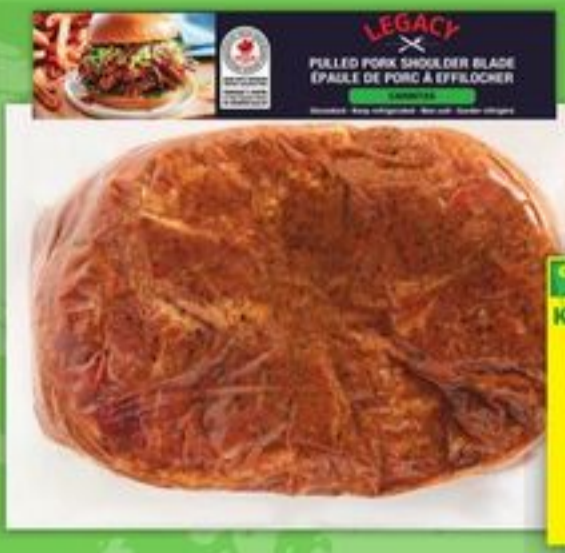
LEGACY CARNITA PULLED PORK ROAST 1.1 KG SELECTED VARIETIES

ALL AISLES LEAD HOME KITCHENS OF THE WORLD 9.49 EACH