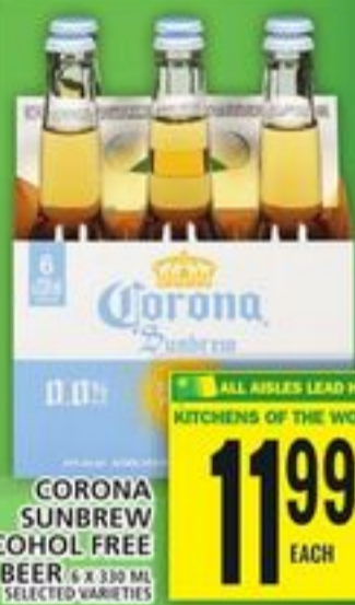
CORONA SUNBREW ALCOHOL FREE BEER 6 x 330 ML SELECTED VARIETIES

ALL AISLES LEAD HOME KITCHENS OF THE WORLD 2.49 EACH