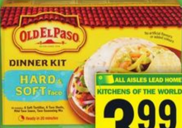
OLD EL PASO TACO KIT 250 - 400 G SALSA 500 ML SELECTED VARIETIES

ALL AISLES LEAD HOME KITCHENS OF THE WORLD 3.99 EACH