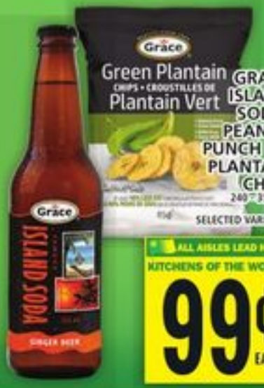
GRACE ISLAND SODA, PEANUT PUNCH OR PLANTAIN CHIPS 240 - 355 ML 85 G SELECTED VARIETIES

ALL AISLES LEAD HOME KITCHENS OF THE WORLD 1.49 EACH