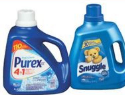
PUREX LIQUID LAUNDRY DETERGENT 4.08-4.43 L OR SNUGGLE FABRIC SOFTENER 2.8-3.4 L

OR SHEETS 200'S SELECTED VARIETIES 20063525001_EA/20151241_EA