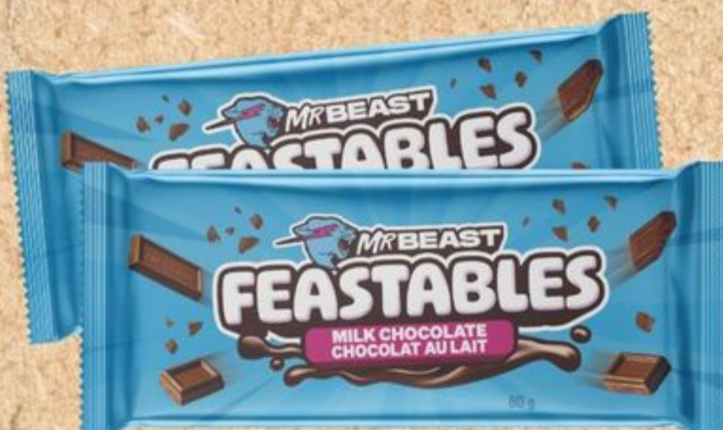
Feastables Mr Beast Chocolate Bars selected varieties, 60 g