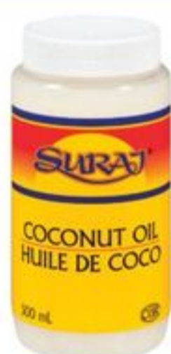
SURAJ® COCONUT OIL 500 ML 20283644_EA