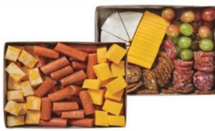
MADE IN-STORE DELI TRAYS SELECTED VARIETIES, 530-800 G