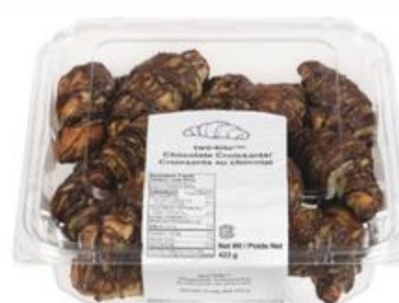
MINI CHOCOLATE CROISSANTS 423 G