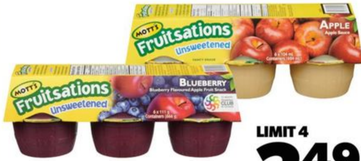
MOTT'S FRUITSATIONS FRUIT CUPS SELECTED VARIETIES, 6'S