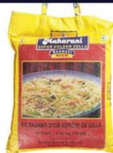
MAHARANI SUPER GOLDEN SELLA BASMATI RICE 4.54 KG 20282250_C01