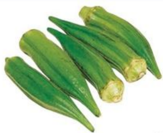
OKRA PRODUCT OF HONDURAS OR NICARAGUA 2009263001_KG