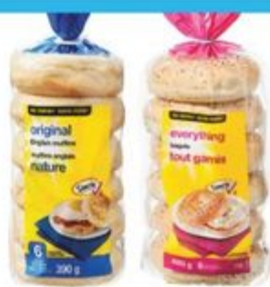
NO NAME® BAGELS OR ENGLISH MUFFINS SELECTED VARIETIES, 6'S