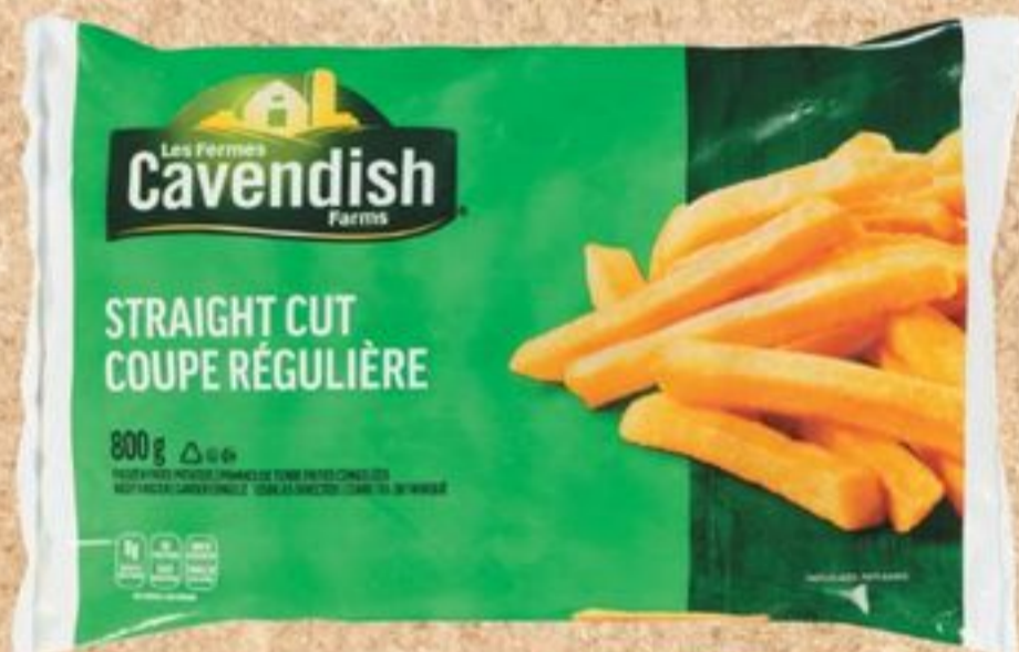
Cavendish Farms Fries selected varieties, frozen, 800 g