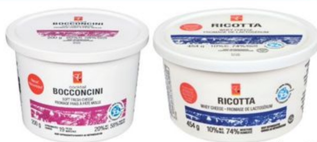
PC® BOCCONCINI 200 G OR PC® RICOTTA CHEESE 450 G SELECTED VARIETIES