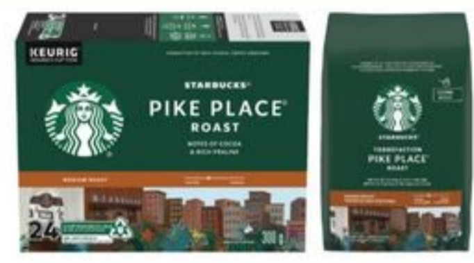
STARBUCKS COFFEE PODS 24'S OR ROAST AND GROUND 793/794 G

SELECTED VARIETIES 2122965_EA/2169344_EA