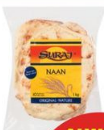
SURAJ® NAAN SELECTED VARIETIES, 10'S 20342261_EA