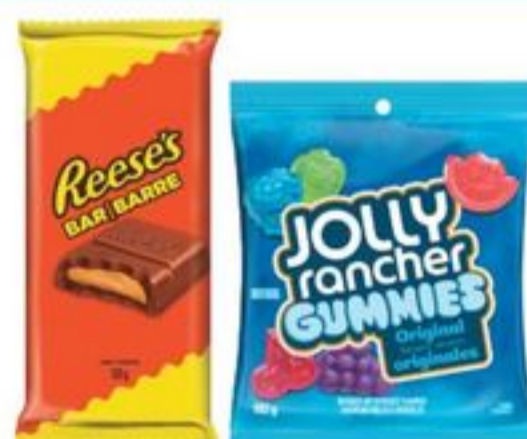
HERSHEY'S CHOCOLATE BAR 90-120 G OR JOLLY RANCHER CANDY 182-198 G