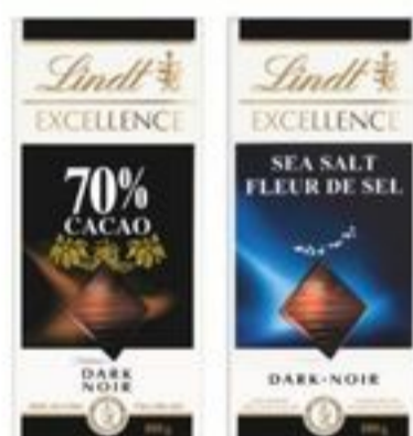
LINDT EXCELLENCE CHOCOLATE TABLET