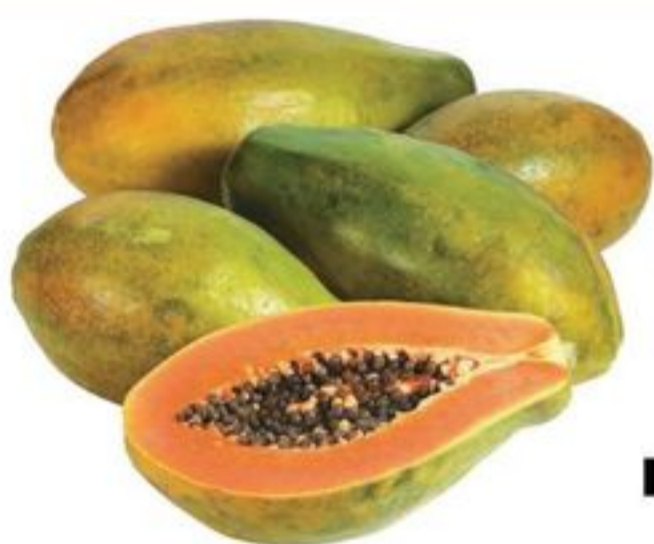
PAPAYA PRODUCT OF MEXICO 20817066001_KG