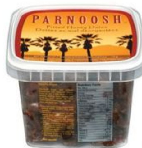
HONEY PITTED DATES PRODUCT OF IRAN, 907 G 20772841_EA