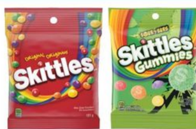
SKITTLES OR STARBURST CANDY SELECTED VARIETIES, 121-191 G