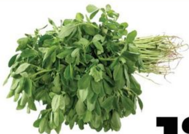
METHI LEAF PRODUCT OF U.S.A. OR MEXICO 20159689001_EA