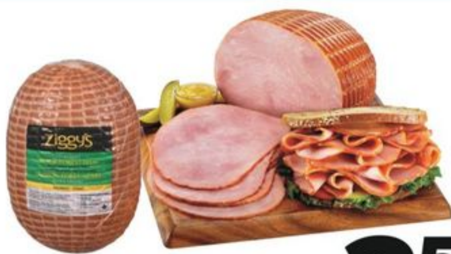
ZIGGY'S® HAM DELI SERVICE CASE SLICED, SELECTED VARIETIES