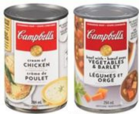
CAMPBELL'S CONDENSED SOUP