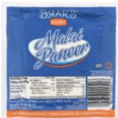
BRAR'S MALAI PANEER 375 G 20283164_EA