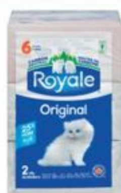
ROYALE FACIAL TISSUE SELECTED VARIETIES 6X88/126 SHEETS