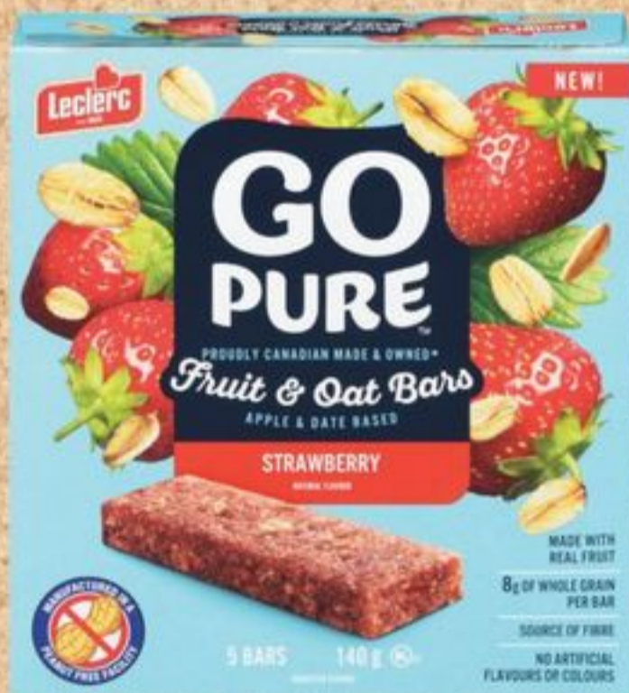
Leclerc Go Pure bars selected varieties, 140-175 g