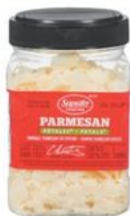
SAPUTO PARMESAN PETALS 300 G