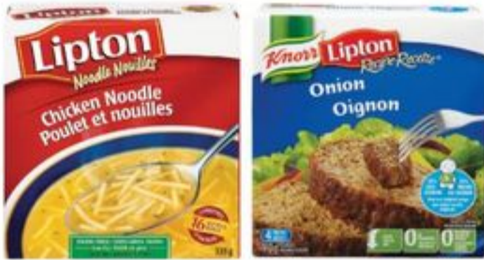
LIPTON OR KNORR SOUP MIX