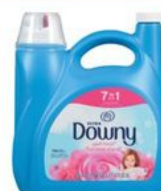
DOWNY FABRIC SOFTENER 4.16 L, SCENT BOOSTERS 680 G OR TIDE ZERO LIQUID LAUNDRY DETERGENT 3.4 L

SELECTED VARIETIES 21549939_EA/21552884_EA