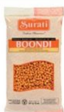
SURATI SNACKS SELECTED VARIETIES, 341 G 20322576003_EA