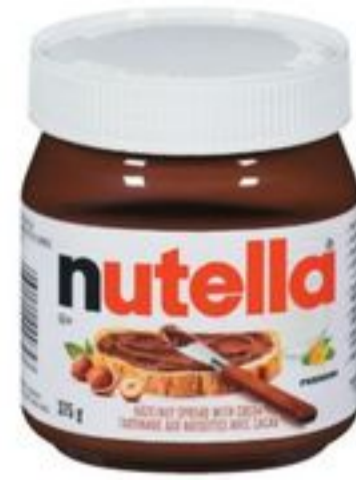
NUTELLA B-READY BARS 132 G OR HAZELNUT SPREAD 375 G