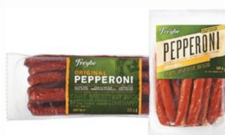
FREYBE PEPPERONI STICKS SELECTED VARIETIES 500 G