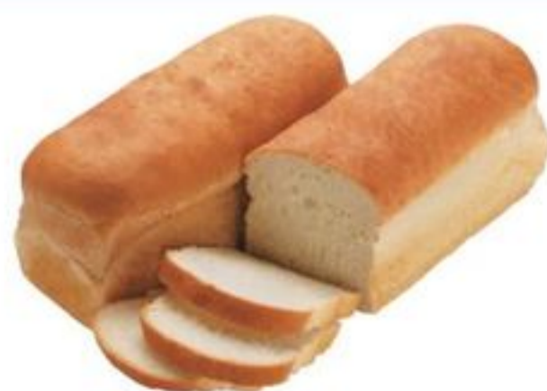
INSTORE BAKED WHITE OR WHOLE WHEAT BREAD SELECTED VARIETIES, 450 G