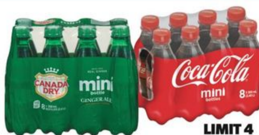
COCA-COLA OR CANADA DRY SOFT DRINKS SELECTED VARIETIES, 8X300 ML