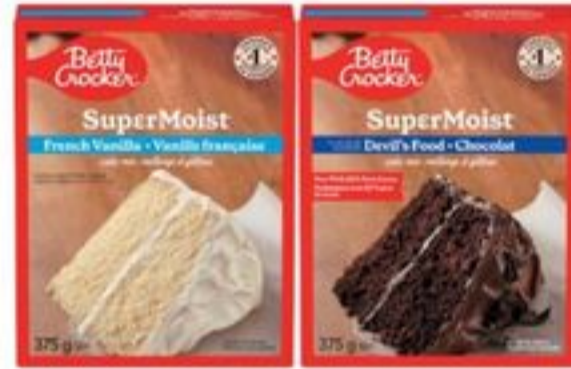
BETTY CROCKER SUPER MOIST CAKE MIXES 375/404 G OR SNACK SIZE 184-212 G

SELECTED VARIETIES 21547834_EA/21547838_EA