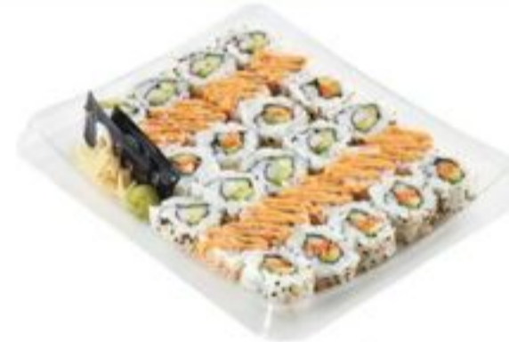
BENTO SUSHI FAMILY PACK SELECTED VARIETIES, 545-700 G