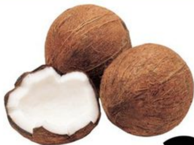
COCONUT PRODUCT OF DOMINICAN REPUBLIC OR INDIA 20005774001_EA