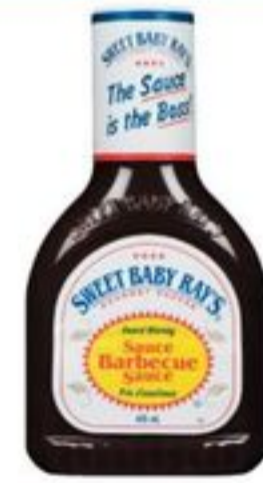
SWEET BABY RAY'S BBQ SAUCE