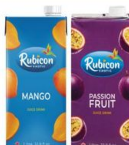
RUBICON JUICE SELECTED VARIETIES, 1 L 20202328001_EA/20296770002_EA