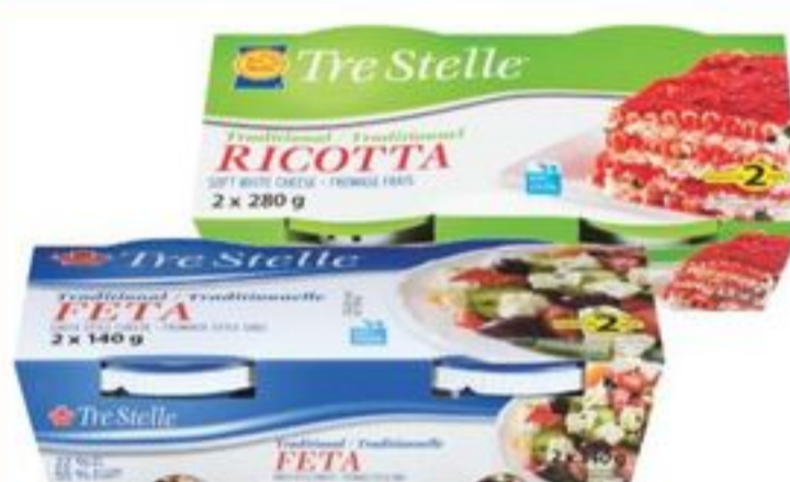
TRE STELLE CHEESE TWIN PACK SELECTED VARIETIES, 240-560 G