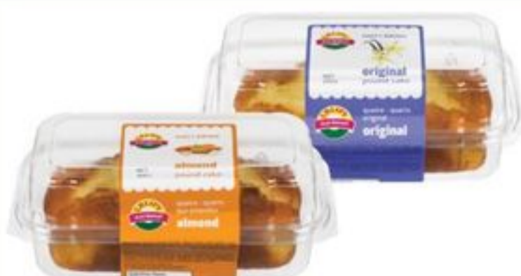
CRISPY POUND CAKE SELECTED VARIETIES, 368 G 20814080_EA/20814268_EA