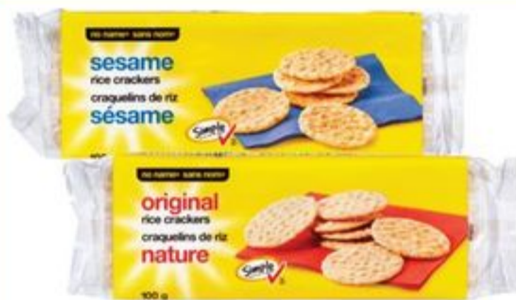
NO NAME® RICE CRACKERS