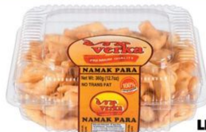
VERKA NAMAK OR SPICY PARA SELECTED VARIETIES, 360 G 2048192_EA