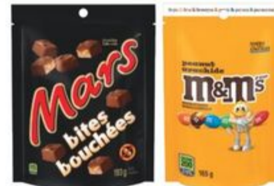
MARS OR M&M'S CHOCOLATE POUCHES SELECTED VARIETIES, 155-193 G