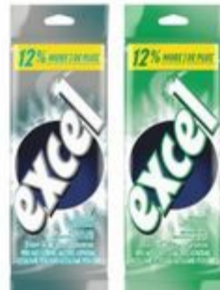
EXCEL GUM MULTIPACK SELECTED VARIETIES, 75/77 G