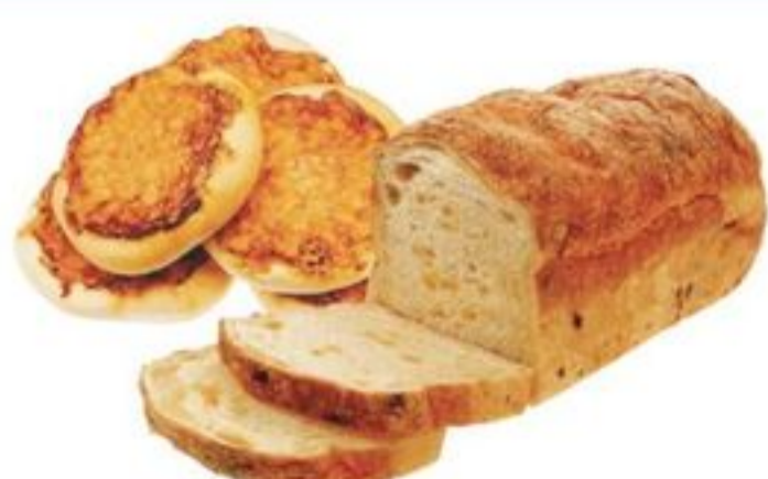
PIZZA BUNS 4'S OR CHEESE BUNS 6'S OR CHEESE BREAD 450 G SELECTED VARIETIES BAKED INSTORE