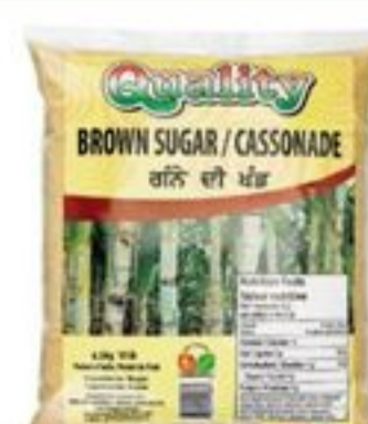
QUALITY BROWN SUGAR 4.5 KG 20178452_EA