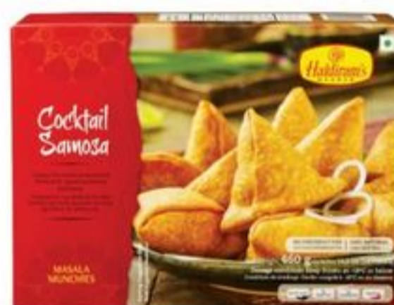
HALDIRAM'S SAMOSA, ALOO TIKKI OR KHAMAN DHOKLA SELECTED VARIETIES, 420-500 G 20170712_EA