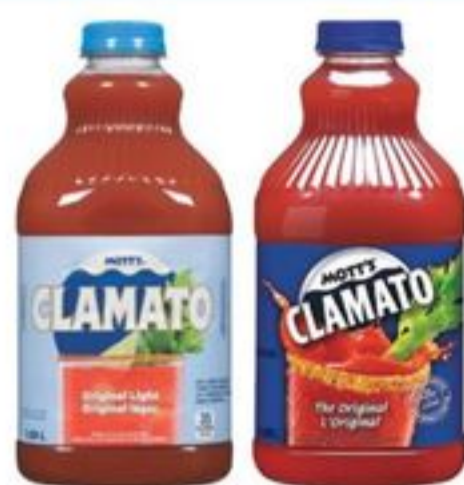
MOTT'S CLAMATO COCKTAIL SELECTED VARIETIES, 1.89 L

Deals on 1000s of your favourite products.