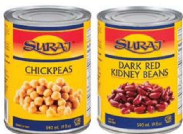
SURAJ® BEANS SELECTED VARIETIES, 540 ML 20284206_EA/2011048_EA