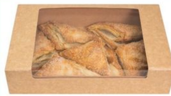
IN-STORE BAKED TURNOVERS SELECTED VARIETIES, 6'S