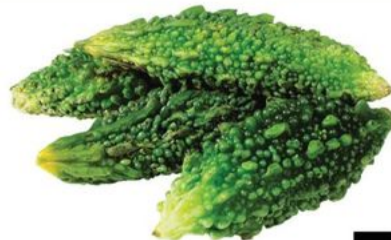
INDIAN KARELA PRODUCT OF MEXICO OR HONDURAS 20028046001_KG