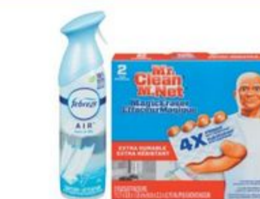
FEBREZE AIR CARE 250 G OR MR. CLEAN MAGIC ERASERS 2-3'S

SELECTED VARIETIES 21005077_EA/20020795_EA