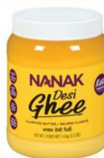
NANAK DESI GHEE 1.6 KG 20187044_EA