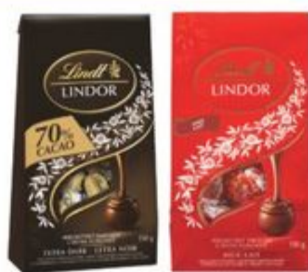
LINDT LINDOR OR GHIRARDELLI CHOCOLATE BAG