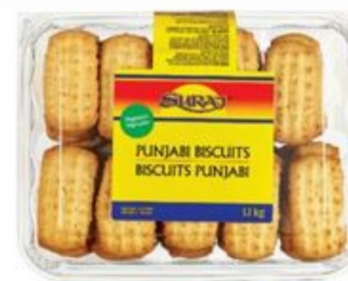
SURAJ® PUNJABI BISCUITS 1.1 KG 2052448_EA