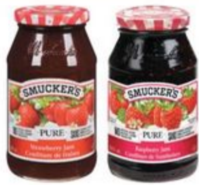
SMUCKER'S JAM, JELLY OR MARMALADE