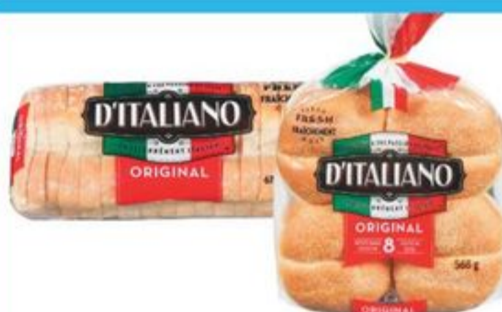
D'ITALIANO BREAD 600/675 G OR BUNS 6'S/8'S SELECTED VARIETIES