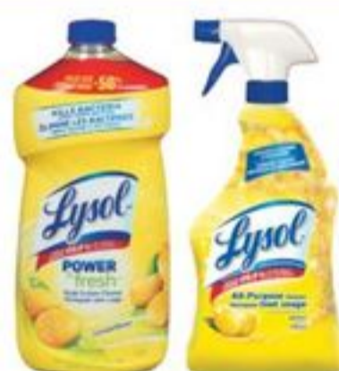
LYSOL MULTI SURFACE CLEANER 1.2 L, SPRAYS 650-950 ML OR TOILET BOWL CLEANER 710 ML

SELECTED VARIETIES 20309873002_EA/2030677001_EA