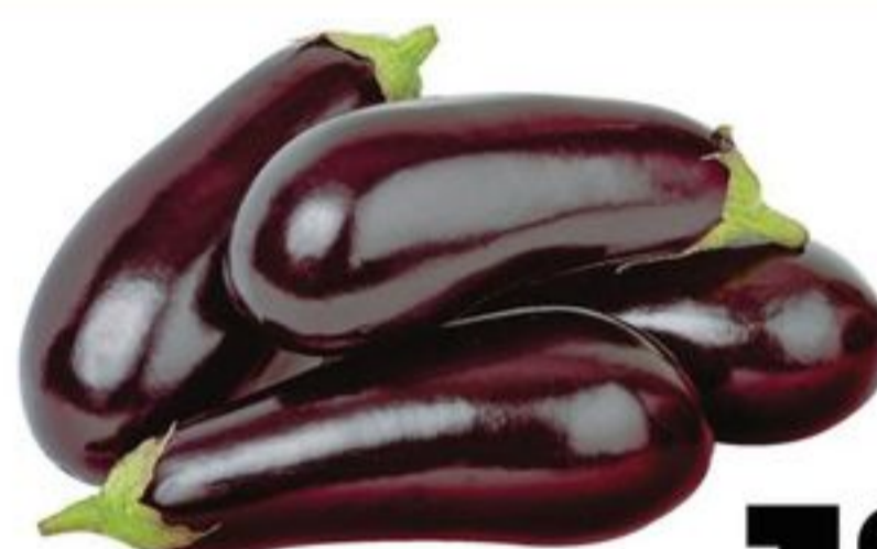
EGGPLANT PRODUCT OF MEXICO 20155709001_KG