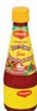
MAGGI SAUCE SELECTED VARIETIES, 340 ML 20687724_EA