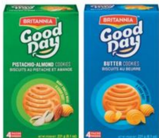
BRITANNIA GOOD DAY BISCUITS SELECTED VARIETIES, 231 G 20223781_EA/20223769_EA