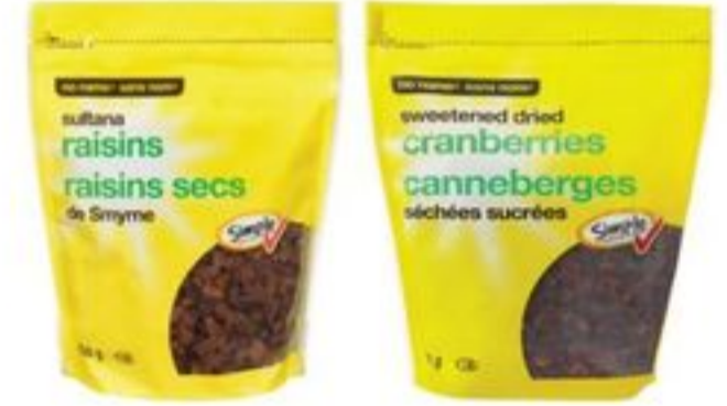
NO NAME® SULTANA RAISINS, CRANBERRIES 750 G OR WHOLE PITTED DATES 1 KG