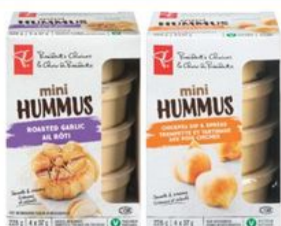
PC® MINI HUMMUS SELECTED VARIETIES, 4X57 G