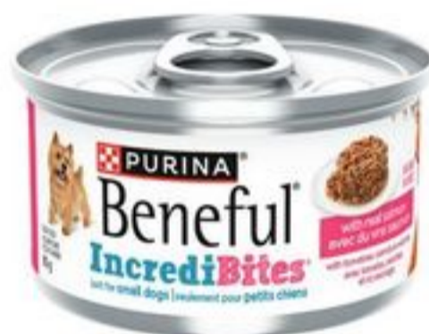
BENEFUL INCREDI BITES 85 G 21576867_EA