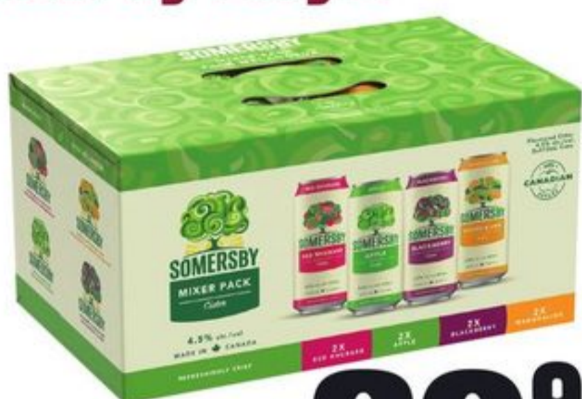
SOMERSBY CIDER MIXER 8X473 ML CANS 21313147_C08