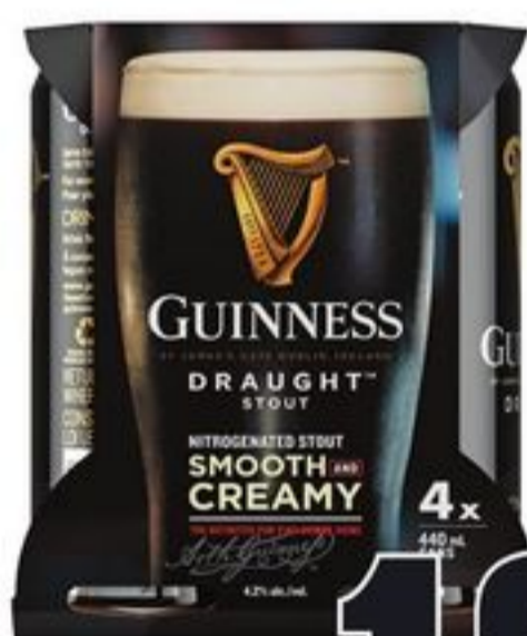
GUINNESS DRAUGHT 4X440 ML CANS 20035374_C04