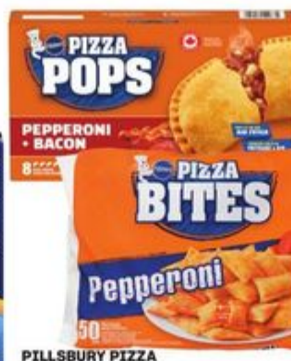
PILLSBURY PIZZA POPS 760 G OR BITES 693 G SELECTED VARIETIES FROZEN 20972958_EA 21435931_EA