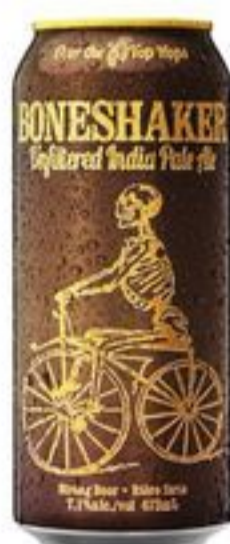
AMSTERDAM BONESHAKER IPA 473 ML CANS 20944160_EA