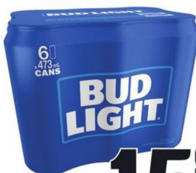
BUD LIGHT 6X473 ML CANS 20955258_C06