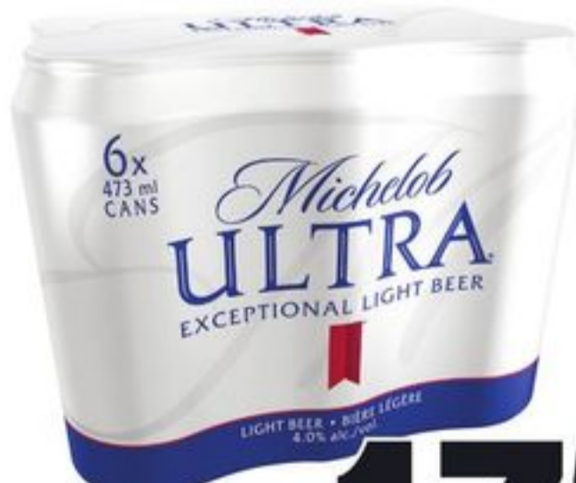
MICHELOB ULTRA 6X473 ML CANS 21097258_C06