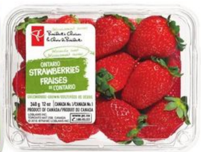
PC® GREENHOUSE STRAWBERRIES PRODUCT OF ONTARIO CANADA NO. 1 GRADE 340 G 21027142001_EA