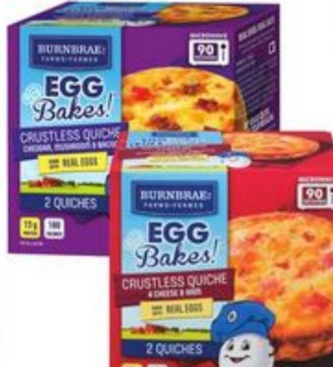
BURNBRAE EGG BAKES SELECTED VARIETIES FROZEN 2/4'S 21060391_EA/21097732_EA