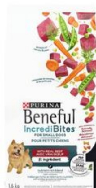
BENEFUL DOG FOOD SELECTED VARIETIES 1.6/1.8 KG 20295905001_EA