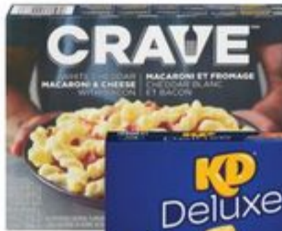
CRAVE OR KRAFT DINNER ENTRÉES SELECTED VARIETIES FROZEN 200-340 G 21085515_EA 21553329_EA