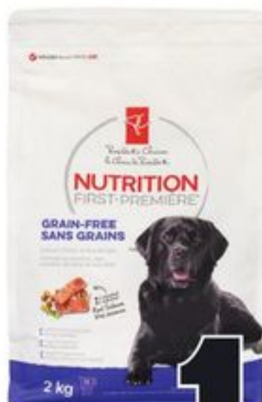
PC ® NUTRITION FIRST ® DOG FOOD SELECTED VARIETIES 2 KG 21307661_EA