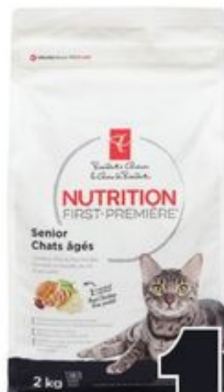
PC ® NUTRITION FIRST ® CAT FOOD SELECTED VARIETIES 2 KG 21303270_EA