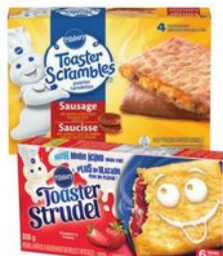
PILLSBURY TOASTER STRUDEL 326 G OR SCRAMBLES 204 G SELECTED VARIETIES FROZEN 20172664001_EA/21474507_EA