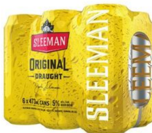
SLEEMAN ORIGINAL DRAUGHT 6X473 ML CANS 20955192_C06