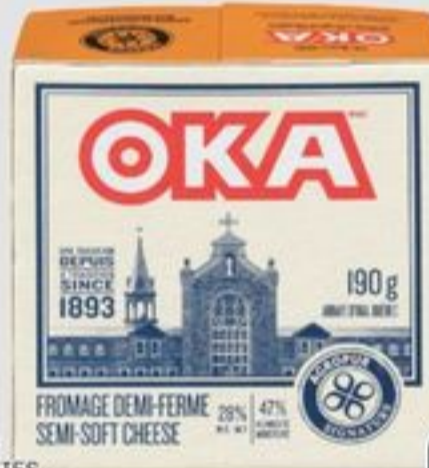
OKA SOFT CHEESE SELECTED VARIETIES 190 G FROMAGE À PÂTE MOLLE OKA 20920756_EA