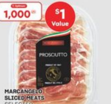
MARCANGELO SLICED MEATS SELECTED VARIETIES 100 G VIANDES TRANCHÉES MARCANGELO 20864839_EA