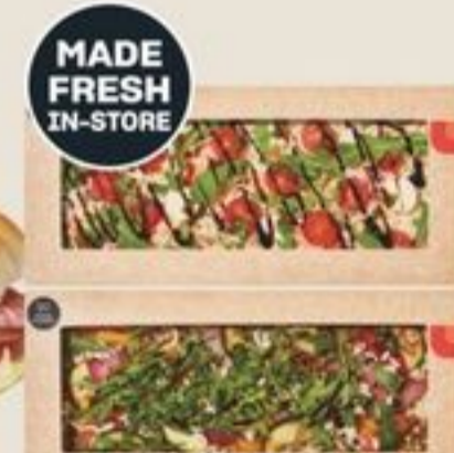
MADE FRESH IN-STORE GOURMET FLATBREAD 350-415 G PAIN PLAT GOURMET 21487152_EA/21540391_EA