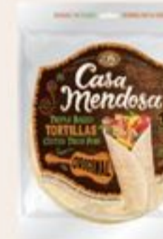
CASA MENDOSA OR WONDER TORTILLAS SELECTED VARIETIES 10 INCH TORTILLAS CASA MENDOSA OU WONDER 20318788_EA/20976626_EA