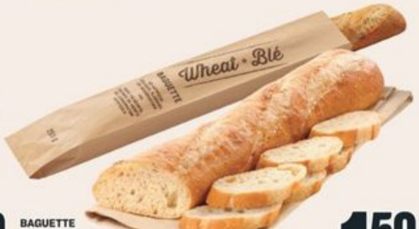
BAGUETTE WHITE OR WHOLE WHEAT 255 G BAGUETTE 21529211_EA/21530097_EA