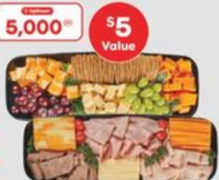
PARTY PLATTERS SELECTED VARIETIES 696 G-1.15 KG PLATEAUX DE CÉLÉBRATION 21217522_EA/21217539_EA