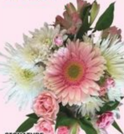
SIGNATURE BOUQUETS SELECTED VARIETIES BOUQUETS SIGNATURES 21436377_EA/21436378_EA