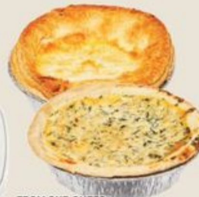
FROM OUR CHEFS PIES 590-600 G PÂTES CONCOCTÉ PAR NOS CHEFS™ 21579901_EA/ 21583390_EA