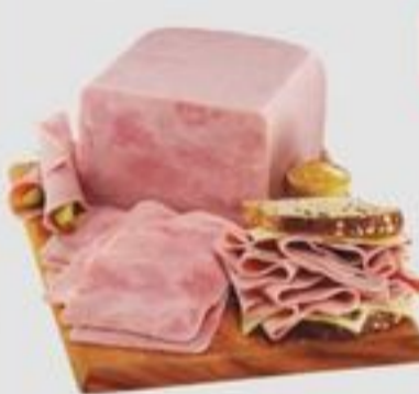
ZIGGY'S® SERVICE CASE HAMS SELECTED VARIETIES JAMBONS ZIGGY'S® DU COMPTOIR DE SERVICE 20313480_KG