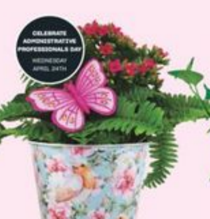
CELEBRATE ADMINISTRATIVE PROFESSIONALS DAY WEDNESDAY APRIL 24TH SMALL GARDEN PLANTER PETITE JARDINIÈRE 21096894_EA