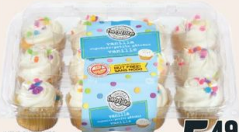
MINI CUPCAKES SELECTED VARIETIES 12'S MINI PETITS GÂTEAUX 21298140_EA