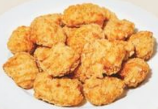
18 PIECE BONELESS BITES 684 G 18 MORCEAUX DE BOUCHÉES DÉOSSÉS 21574551_EA

Great to go items plus applicable taxes.