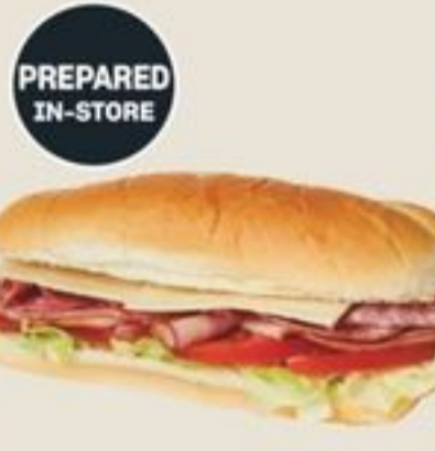
PREPARED IN-STORE SUB SANDWICHES BEEF, HAM, TURKEY OR ASSORTED 331/364 G SOUS-MARINS 21362145_EA