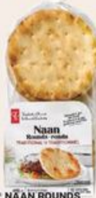
PC® NAAN ROUNDS ORIGINAL OR WHOLE WHEAT B'S PAINS NAAN RONDS PC® 20757871_EA/20866020_EA

3 75 EA. BUY 2 OR MORE LESS THAN $4.49 EA.