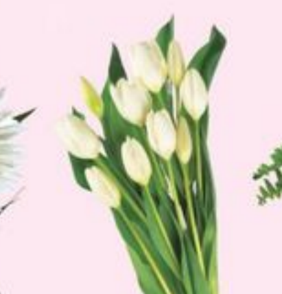
10 STEM TULIPS ASSORTED COLOURS 10 TULIPES SUR TIGE 21521853_EA