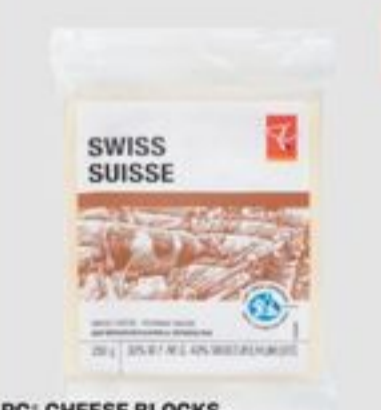
PC® CHEESE BLOCKS SELECTED VARIETIES 250 G BARRES DE FROMAGE PC® 20770652_EA