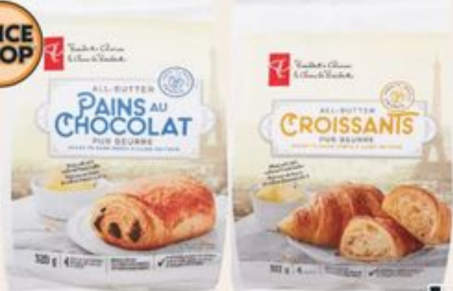
PC® ALL BUTTER CROISSANTS SELECTED VARIETIES, FROZEN 312-360 G CROISSANTS PUR BEURRE PC® 21545086_EA/21545111_EA