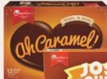
VACHON SNACK CAKE SELECTED VARIETIES AND SIZES PETIT GÂTEAU VACHON 20005728_EA/20963606_EA

$4 EA. BUY 2 OR MORE LESS THAN $4.49 EA.