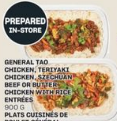
PREPARED IN-STORE GENERAL TAO CHICKEN, TERIYAKI CHICKEN, SZECHUAN BEEF OR BUTTER CHICKEN WITH RICE ENTRÉES 900 G PLATS CUISINÉS DE POULET GÉNÉRAL TAO, POULET TERIYAKI, BŒUF À LA SICHUANAISE OU POULET AU BEURRE AVEC RIZ 21533950_EA/21533951_EA