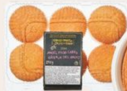
FARMER'S MARKET® ANGEL CAKE OR MINI ANGEL CAKES SELECTED VARIETIES 270/283 G GÂTEAU DES ANGES OU MINI-GÂTEAUX DES ANGES D ÉLICES DU MARCHÉ™ 21313115_EA