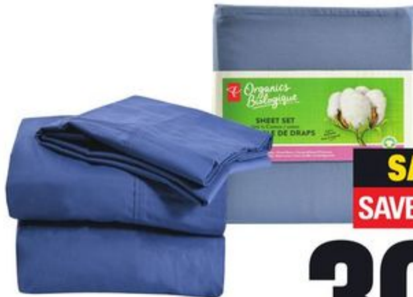
PC ORGANICS SHEET SETS SELECTED VARIETIES 21289184_EA