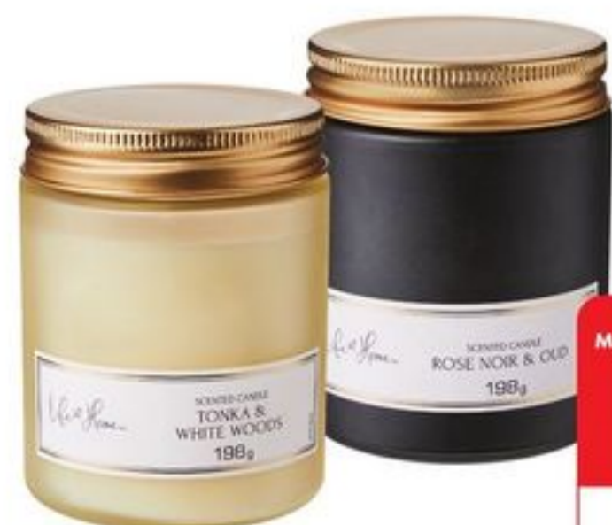
LIFE AT HOME SINGLE WICK CANDLE ASSORTED SCENTS 21414437_EA/21414475_EA