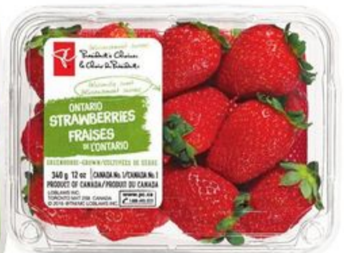
PC® GREENHOUSE STRAWBERRIES PRODUCT OF CANADA CANADA NO. 1 GRADE 340 G 21027142001_EA