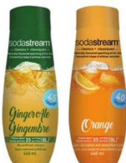
SODASTREAM CLASSICS 440 ML OR BUBBLY SYRUPS 40 ML SELECTED VARIETIES 21361021_EA/21361500_EA