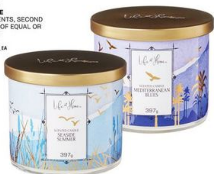
LIFE AT HOME 3 WICK CANDLE ASSORTED SCENTS, SECOND ITEM MUST BE OF EQUAL OR LESSER VALUE $16 21541249_EA/21541281_EA