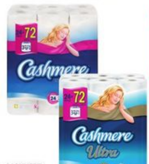
CASHMERE BATHROOM TISSUE SELECTED VARIETIES 24-72 ROLLS 21189845_EA 21443648_EA