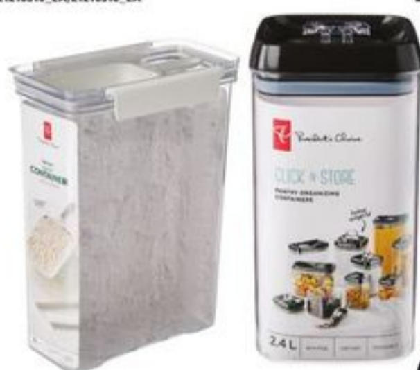
PC TRITAN PANTRY, PC CLICK & STORE OR PC PANTRY STORAGE CONTAINERS SELECTED VARIETIES 20786342_EA/21350618_EA