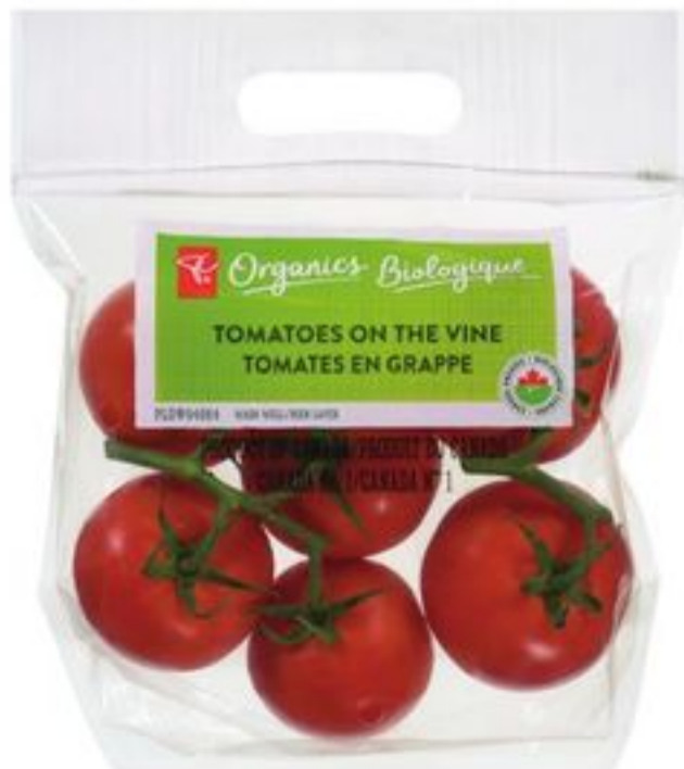
PC® ORGANICS TOMATOES ON THE VINE PRODUCT OF CANADA 8.80/KG 20127917001_KG