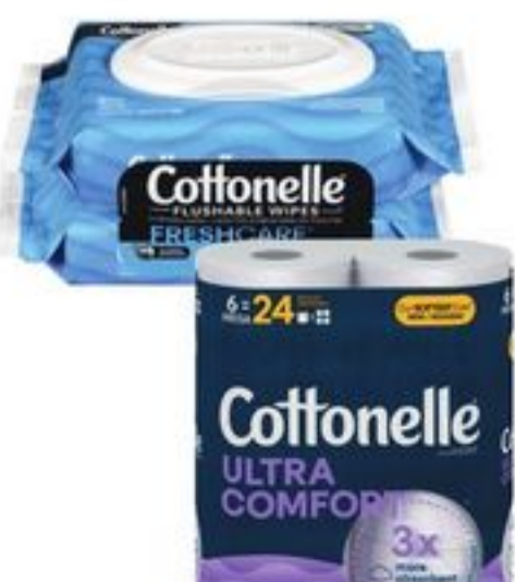
COTTONELLE BATHROOM TISSUE 6-24 ROLLS OR FLUSHABLE WIPES 2'S SELECTED VARIETIES 20688530_EA/21594641_EA