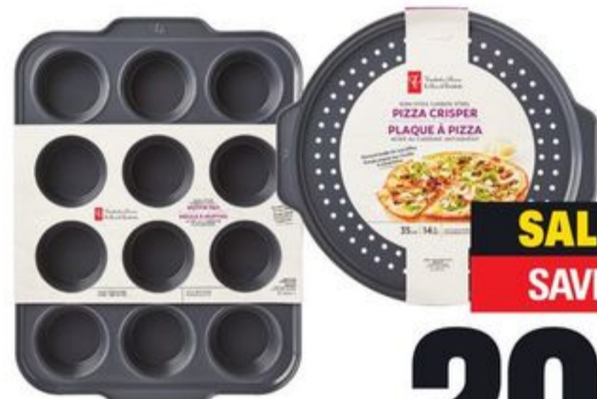
PC METAL BAKEWARE SELECTED VARIETIES 21494804_EA/21494818_EA