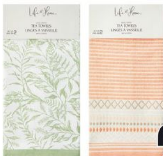
LIFE AT HOME KITCHEN TERRY TEA TOWELS 21541262_EA/21541261_EA