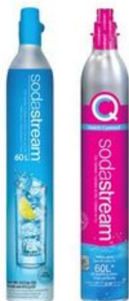
SODASTREAM CO2 CYLINDER OR $19.99 EA. FOR EXCHANGED 21128469_EA/21475557_EA