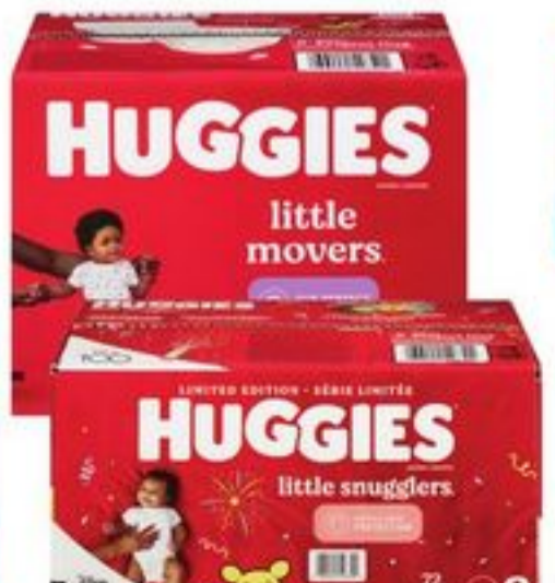
HUGGIES SUPER BIG PACK DIAPERS SELECTED VARIETIES 36-108'S 21456221_EA/21456311_EA