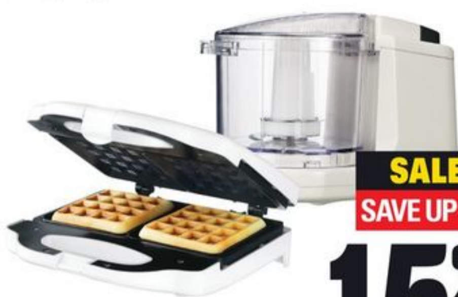
EVERYDAY ESSENTIALS APPLIANCES SELECTED VARIETIES 20020568_EA/20121544_EA