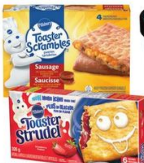
PILLSBURY TOASTER STRUDEL 326 G OR SCRAMBLES 204 G SELECTED VARIETIES FROZEN 20172664001_EA/21474507_EA