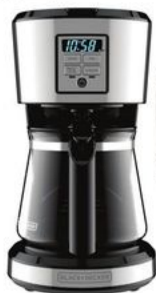
BLACK & DECKER APPLIANCES SELECTED VARIETIES 20960122_EA/21513969_EA