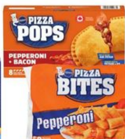
PILLSBURY PIZZA POPS 760 G OR BITES 693 G SELECTED VARIETIES FROZEN 20972958_EA 21435931_EA