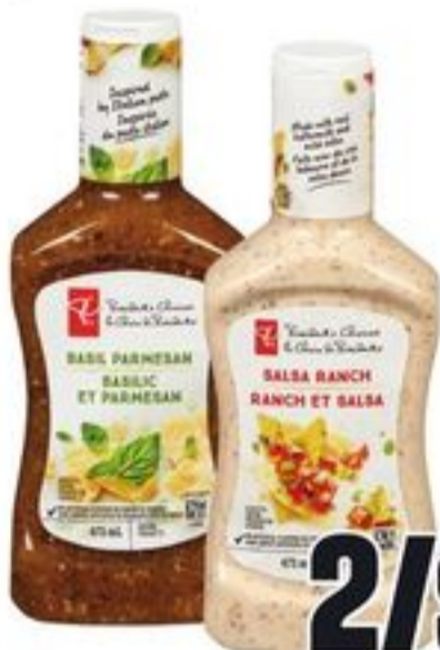
PC® SALAD DRESSING SELECTED VARIETIES 475 ML 20627618001_EA/20627618005_EA

Optimum Members-Only Price 6 99 Non-members 8 99