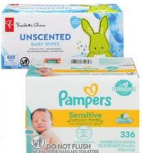
PC®, HUGGIES OR PAMPERS 6'S BABY WIPES 352-600'S SELECTED VARIETIES 21102958_EA 21271645_EA