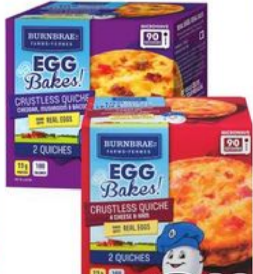
BURNBRAE EGG BAKES SELECTED VARIETIES FROZEN 2/4'S 21060391_EA/21097732_EA