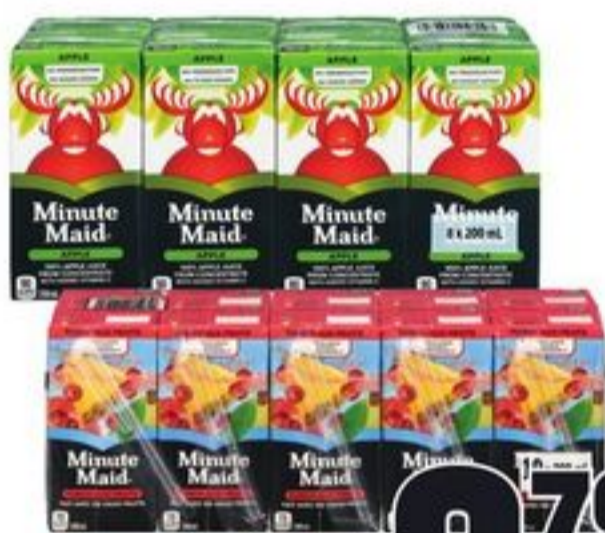
MINUTE MAID, FIVE ALIVE OR NESTEA ICED TEA DRINK BOXES SELECTED VARIETIES 8/10X200 ML 20327042001_EA/21092667_EA