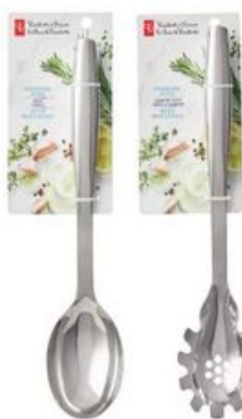
PC STAINLESS STEEL GADGETS 21216316_EA/21216318_EA