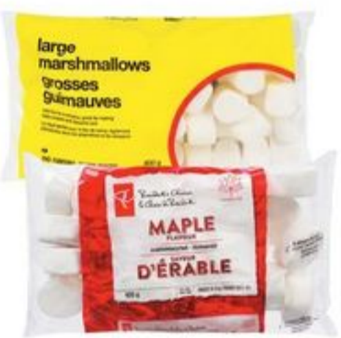
NO NAME® MARSHMALLOWS SELECTED VARIETIES 400 G 20304672001_EA 21008975_EA