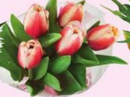
5 STEM TULIPS ASSORTED COLOURS 21525035_EA