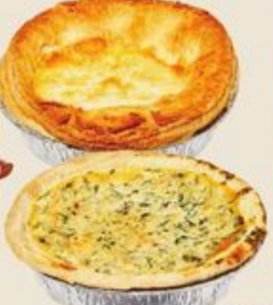
FROM OUR CHEFS' PIES 590-600 G 21579901_EA/ 21583326_EA