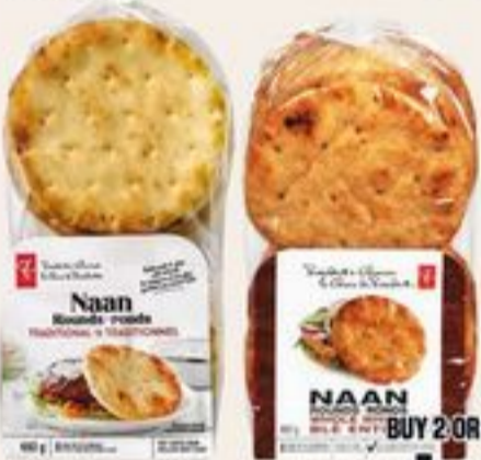
PC® NAAN ROUNDS ORIGINAL OR WHOLE WHEAT 8'S 20757871_EA/20866020_EA

BUY 2 OR MORE $4 EA. LESS THAN 2 $4.49 EA.