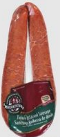
GRIMM'S KOLBASSA SELECTED VARIETIES 300 G 21531418_EA