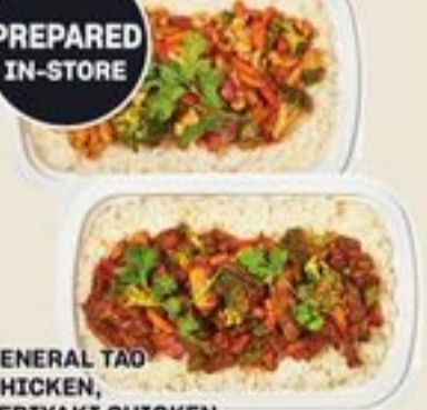
GENERAL TAO CHICKEN, TERIYAKI CHICKEN, SZECHUAN BEEF OR BUTTER CHICKEN WITH RICE ENTRÉES 900 G 21533950_EA/21533951_EA