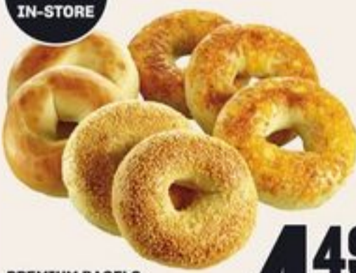
PREMIUM BAGELS SELECTED VARIETIES 6'S 21016648_EA