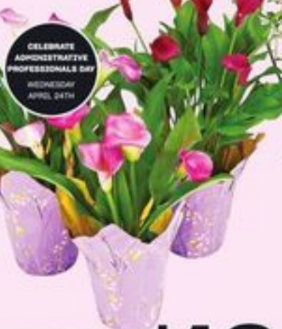
CALLA LILY ASSORTED COLOURS 4 INCH 21105494_EA