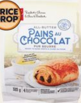
PC® ALL BUTTER CROISSANTS SELECTED VARIETIES, FROZEN 312-360 G 21545086_EA/21545111_EA