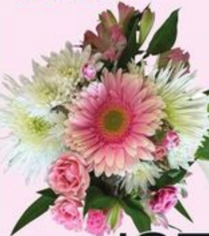
SIGNATURE BOUQUETS SELECTED VARIETIES 21436377_EA/21436378_EA