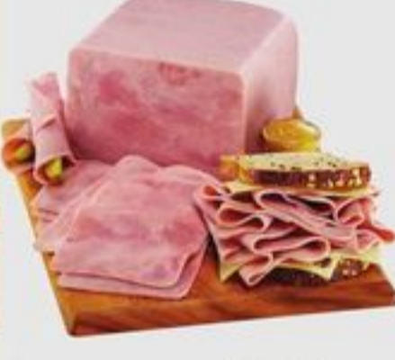
ZIGGY'S® SERVICE CASE HAMS SELECTED VARIETIES 20313480_KG