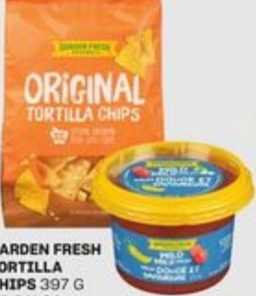
GARDEN FRESH TORTILLA CHIPS 397 G OR SALSA 473 ML SELECTED VARIETIES 20325398_EA/ 20565699_EA