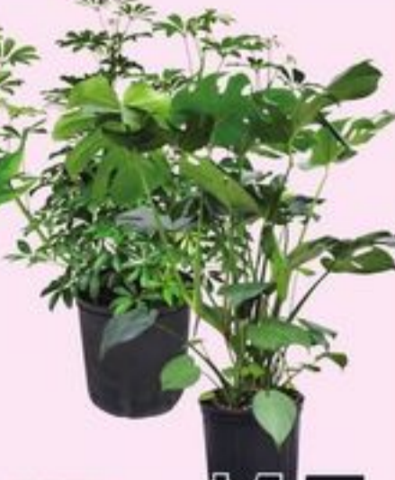
PREMIUM FOLIAGE 6 INCH ASSORTED VARIETIES 21388951_EA