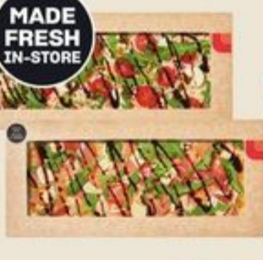
GOURMET FLATBREAD 340-382 G 21487152_EA/21487153_EA