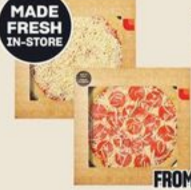
FRESH PIZZA 335-730 G 21456393_EA/21456401_EA