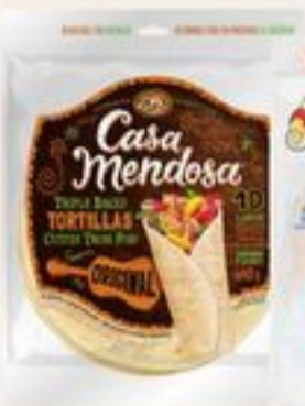
CASA MENDOSA OR WONDER TORTILLAS SELECTED VARIETIES 10 INCH 20318788_EA/20976626_EA

BUY 2 OR MORE $4 EA. LESS THAN 2 $4.49 EA.