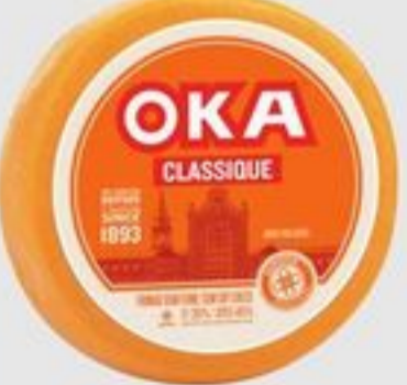
OKA SOFT CHEESE SELECTED VARIETIES CUT IN-STORE 21162370_KG