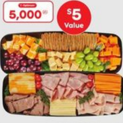
PARTY PLATTERS SELECTED VARIETIES 696 G-1.15 KG 21217521_EA/21217522_EA