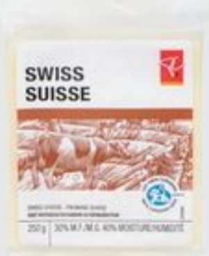
PC® CHEESE BLOCKS SELECTED VARIETIES 250 G 20770652_EA