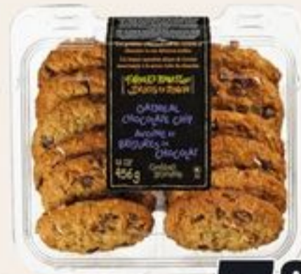
FARMER'S MARKET® COOKIES SELECTED VARIETIES 12'S 20566294_EA