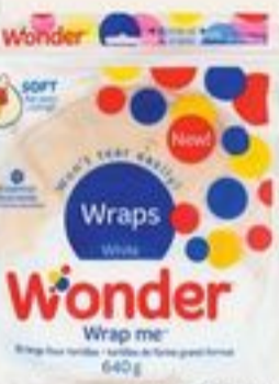
BUY 2 OR MORE 3 75 EA. LESS THAN 2 $4.49 EA.