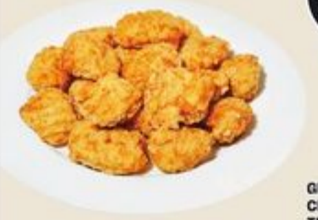
18 PIECE BONELESS BITES 684 G 21566451_EA