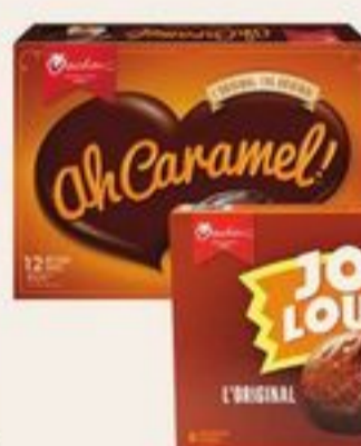
VACHON SNACK CAKE SELECTED SIZES AND VARIETIES 252-336 G 20005728_EA/20963606_EA

Members save $1 Members-Only Price 3 49 Non-members 4 49