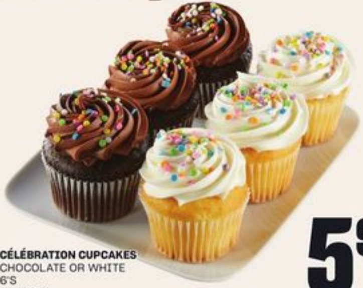
CÉLÉBRATION CUPCAKES CHOCOLATE OR WHITE 6'S 20379763_EA