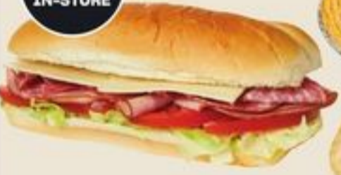
SUB SANDWICHES BEEF, HAM, TURKEY OR ASSORTED 331/364 G 21362145_EA