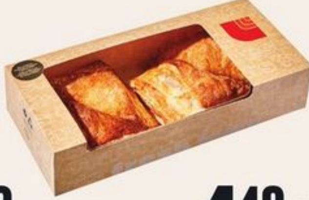
TURNOVERS SELECTED VARIETIES 4'S 21469196_EA