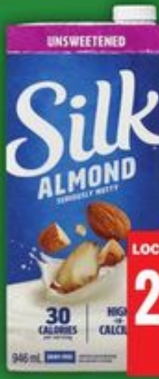
SILK ALMOND BEVERAGE SELECTED VARIETIES