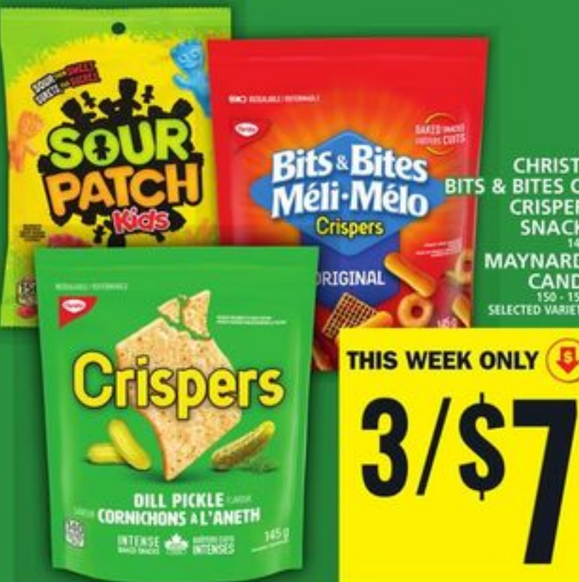
CHRISTIE BITS & BITES OR CRISPERS SNACKS 145 G MAYNARDS CANDY 150 - 154 G SELECTED VARIETIES