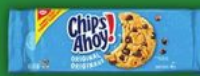
CHRISTIE FAMILY SIZE COOKIES OR CRACKERS 303 - 488 G SELECTED VARIETIES