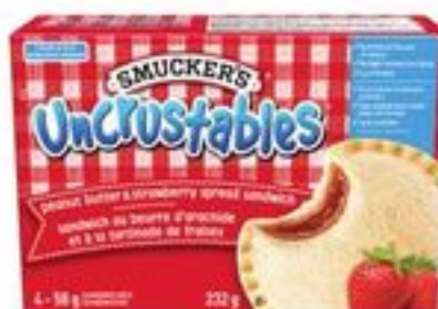
SMUCKER'S UNCRUSTABLES SANDWICH SELECTED VARIETIES