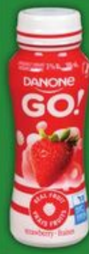
DANONE GO! DRINKABLE YOGURT 150 ML SELECTED VARIETIES