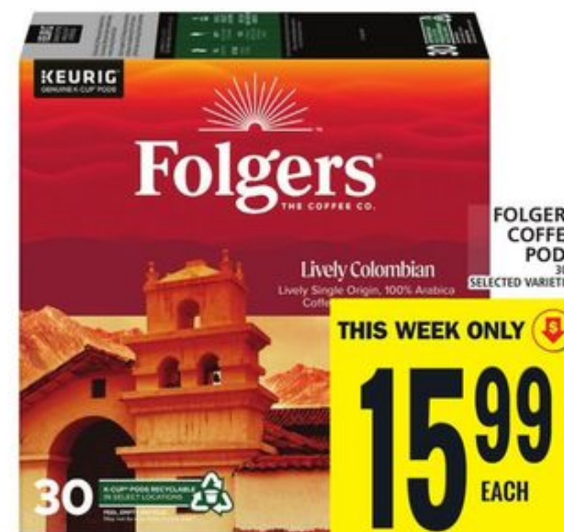
FOLGERS COFFEE PODS 30'S SELECTED VARIETIES