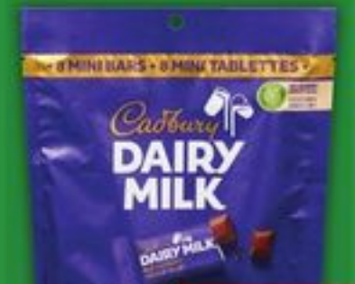
CADBURY DAIRY MILK CHOCOLATE POUCHES 150 - 200 G SELECTED VARIETIES