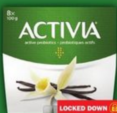
ACTIVIA YOGOURT SELECTED VARIETIES