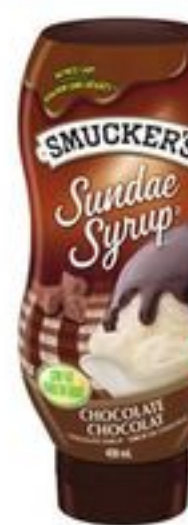
SMUCKER'S DESSERT TOPPING 425 ML SELECTED VARIETIES