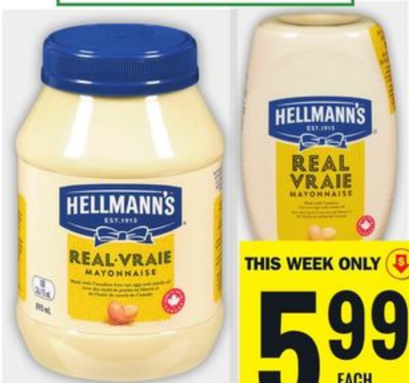
HELLMANN'S MAYONNAISE 710 - 890 ML SELECTED VARIETIES