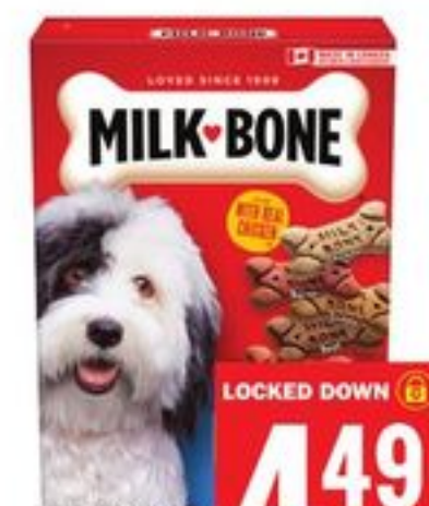
MILK-BONE DOG SNACKS SELECTED VARIETIES