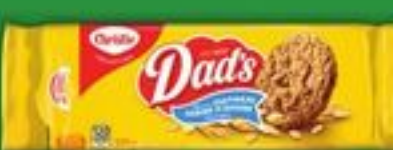
CHRISTIE PEEK FREANS OR DAD'S OATMEAL COOKIES 275 - 310 G SELECTED VARIETIES