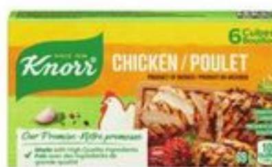
KNORR BOUILLON CUBES SELECTED VARIETIES