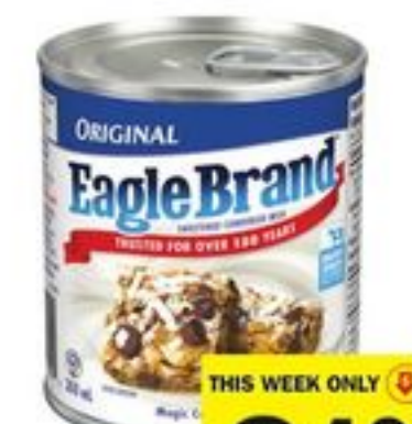
EAGLE BRAND CONDENSED MILK 300 ML SELECTED VARIETIES