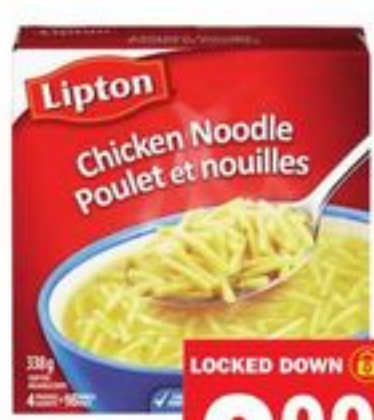
LIPTON SOUP MIX SELECTED VARIETIES