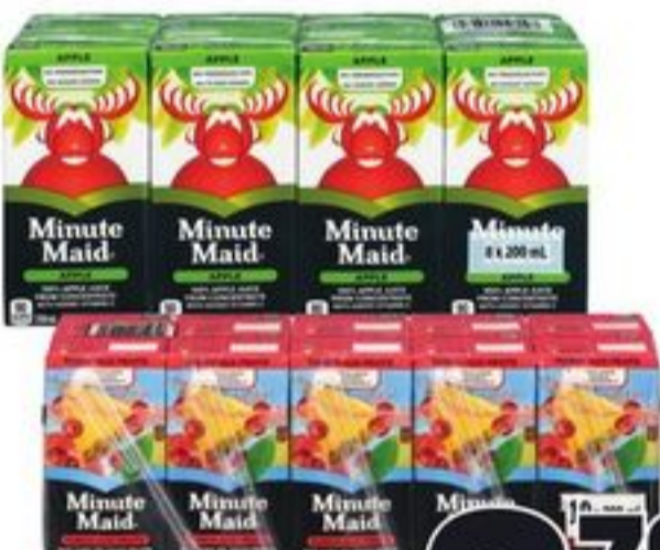
MINUTE MAID, FIVE ALIVE OR NESTEA ICED TEA DRINK BOXES SELECTED VARIETIES 8/10X200 ML 20327042001_EA/21092667_EA