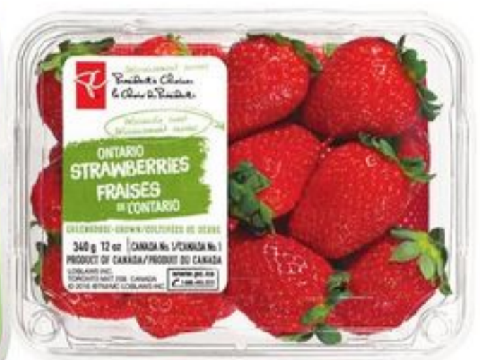
PC® GREENHOUSE STRAWBERRIES PRODUCT OF ONTARIO CANADA NO. 1 GRADE 340 G 21027142001_EA