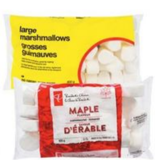
NO NAME® MARSHMALLOWS SELECTED VARIETIES 400 G 20304672001_EA 21008975_EA