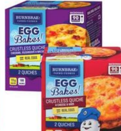
BURNBRAE EGG BAKES SELECTED VARIETIES FROZEN 2/4'S 21060391_EA/21097732_EA