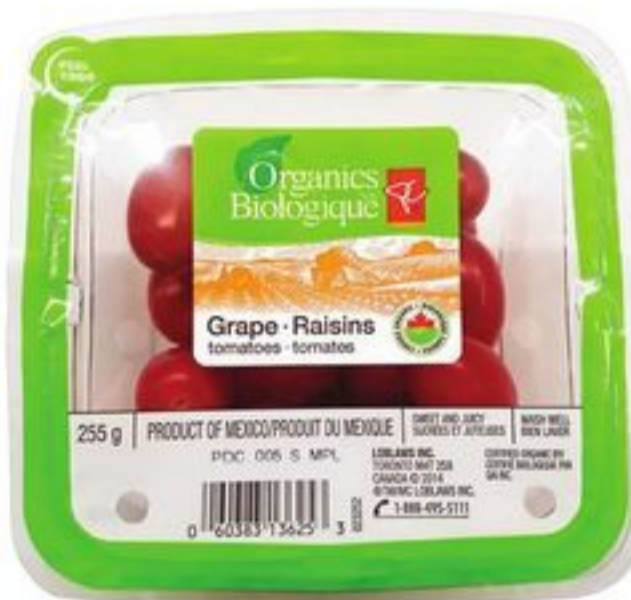
PC® ORGANICS GRAPE TOMATOES PRODUCT OF CANADA OR MEXICO 255 G 20799491001_EA