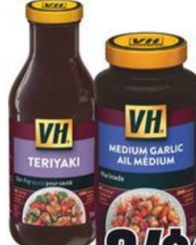
VH SAUCES SELECTED VARIETIES 341/355 ML 20308726001_EA/20309693001_EA