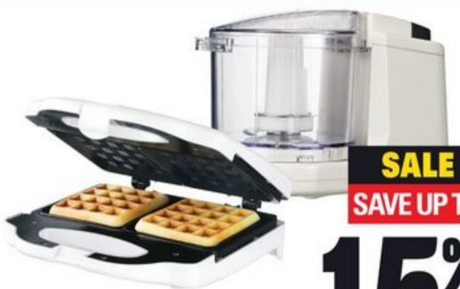
EVERYDAY ESSENTIALS® APPLIANCES SELECTED VARIETIES 20020568_EA/20121544_EA