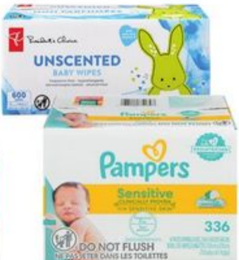
PC®, HUGGIES OR PAMPERS 6'S BABY WIPES 352-600'S SELECTED VARIETIES 21102958_EA 21271645_EA