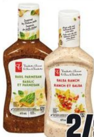
PC® SALAD DRESSING SELECTED VARIETIES 475 ML 20627618001_EA/20627618005_EA

Optimum Members-Only Price 6 99 Non-members 8 99