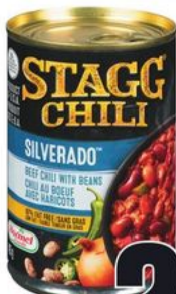
STAGG CHILI SELECTED VARIETIES 425 G 20309125004_EA