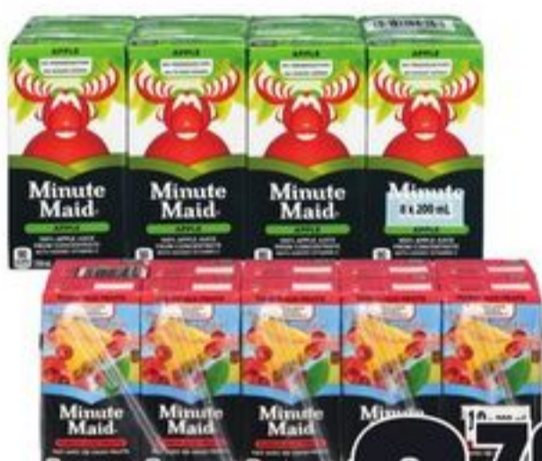
MINUTE MAID, FIVE ALIVE OR NESTEA ICED TEA DRINK BOXES SELECTED VARIETIES 8/10X200 ML 20327042001_EA/21092667_EA