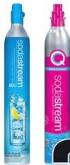
SODASTREAM CO2 CYLINDER OR $19.99 EA. FOR EXCHANGED 21128469_EA/21475557_EA