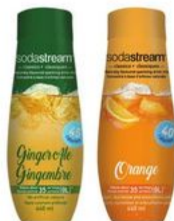
SODASTREAM CLASSICS 440 ML OR BUBLY SYRUPS 40 ML SELECTED VARIETIES 21361021_EA/21361500_EA