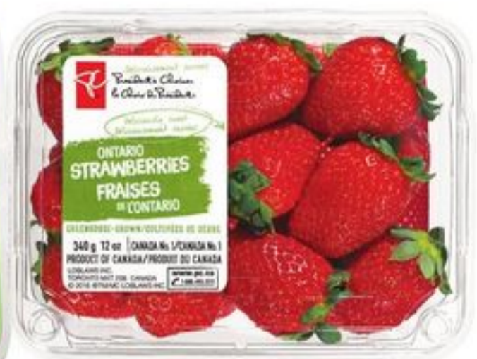
PC® GREENHOUSE STRAWBERRIES PRODUCT OF ONTARIO CANADA NO. 1 GRADE 340 G 21027142001_EA