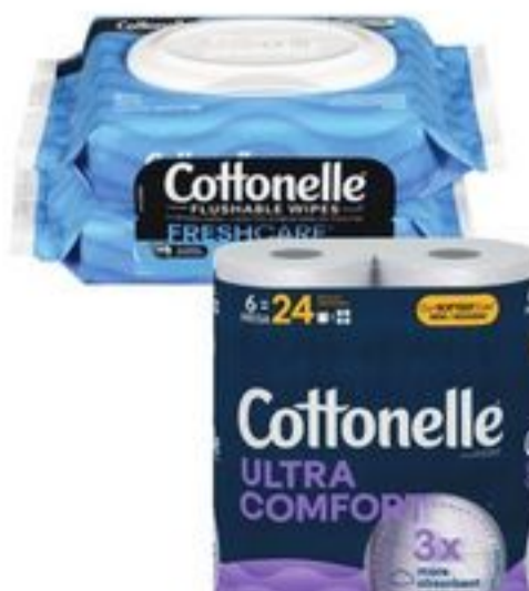
COTTONELLE BATHROOM TISSUE 6-24 ROLLS OR FLUSHABLE WIPES 2'S SELECTED VARIETIES 20688530_EA/21594641_EA