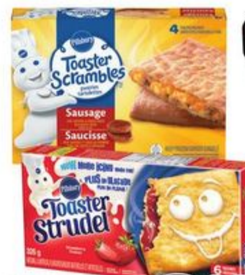
PILLSBURY TOASTER STRUDEL 326 G OR SCRAMBLES 204 G SELECTED VARIETIES FROZEN 20172664001_EA/21474507_EA