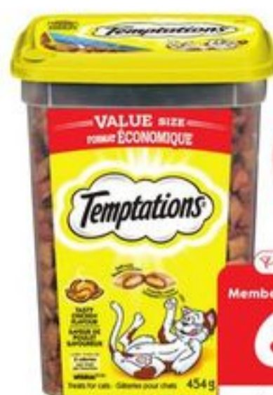
WHISKAS TEMPTATIONS CAT TREATS SELECTED VARIETIES 454 G 21012108_EA