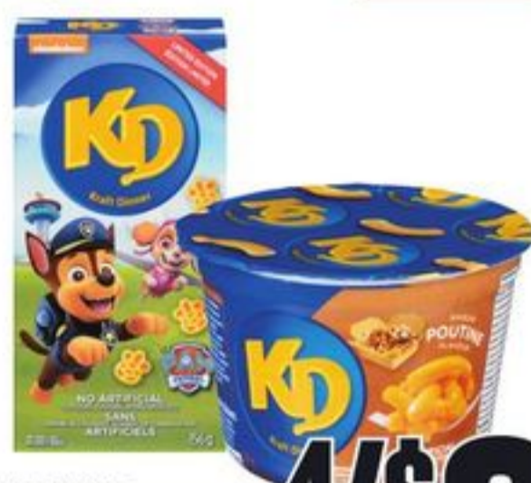
KRAFT DINNER FLAVOURED CUPS 58 G OR SPECIALTY FLAVOURS 150-200 G SELECTED VARIETIES 21393426_EA/21435132_EA