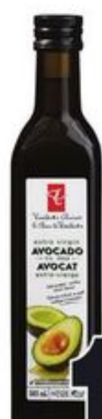
PC® AVOCADO OIL 500 ML 20332066_EA