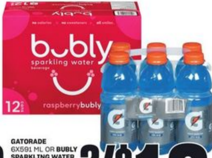
GATORADE 6X591 ML OR BUBLY SPARKLING WATER 12X355 ML OR MONTELLIER 10X355 ML SELECTED VARIETIES 20303218003_C06 21568926_C12