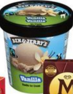
BEN & JERRY'S 473 ML OR MAGNUM BARS 4'S SELECTED VARIETIES FROZEN 20950739_EA/21568089_EA