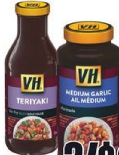
VH SAUCES SELECTED VARIETIES 341/355 ML 20308726001_EA/20309693001_EA