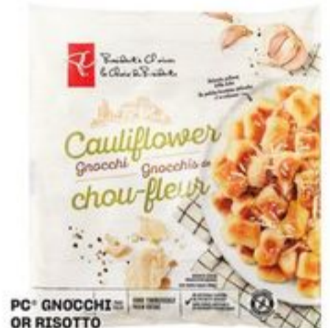
PC® GNOCCHI OR RISOTTO 350-400 G OR PC® ASIAN ENTRÉES OR SOUPS 300 G SELECTED VARIETIES, FROZEN 21546584_EA 21546625_EA