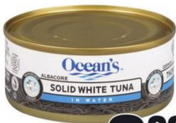
OCEAN'S WHITE TUNA SELECTED VARIETIES 170 G 21005158_EA