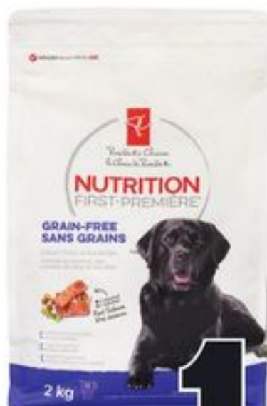
PC ® NUTRITION FIRST ® DOG FOOD SELECTED VARIETIES 2 KG 21307661_EA