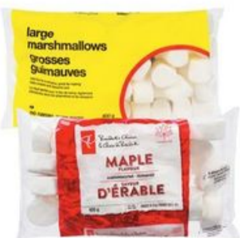
NO NAME® MARSHMALLOWS SELECTED VARIETIES 400 G 20304672001_EA 21008975_EA