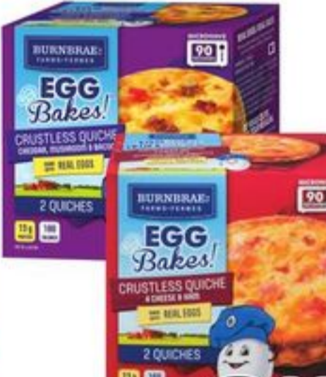
BURNBRAE EGG BAKES SELECTED VARIETIES FROZEN 2/4'S 21060391_EA/21097732_EA