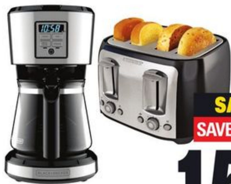
BLACK & DECKER APPLIANCES SELECTED VARIETIES 20960122_EA/21513969_EA