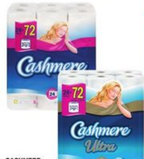
CASHMERE BATHROOM TISSUE SELECTED VARIETIES 24-72 ROLLS 21189845_EA 21443648_EA