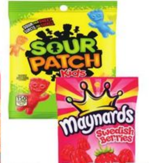
MAYNARDS CANDY SELECTED VARIETIES 150-154 G 21545554_EA/21545605_EA