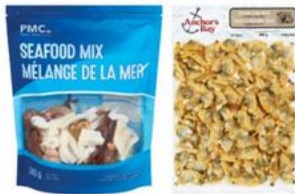
ANCHOR'S BAY MUSSEL MEAT, COOKED CLAM MEAT, OR PMC SEAFOOD MEDLEY FROZEN, 340 G 20792247_EA/21433078_EA