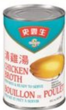
CAMPBELL'S SWANSON CHICKEN BROTH 412 ML 20042814_EA