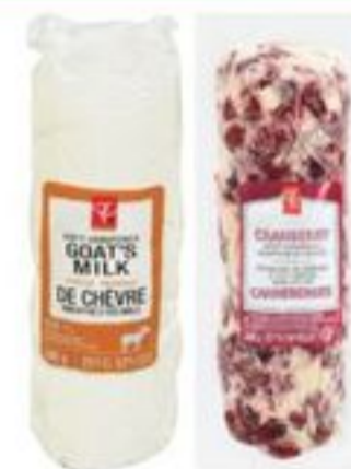
PC® GOAT CHEESE LOGS SELECTED VARIETIES, 300 G