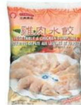
O'TASTY DUMPLINGS SELECTED VARIETIES FROZEN, 567 G 20319343004_EA