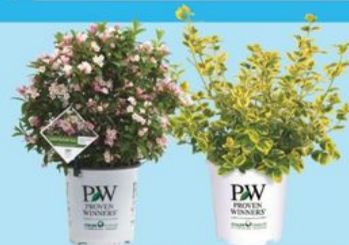
ASSORTED SHRUBS PROVEN WINNER 8 INCH 2084134_EA/21220481_EA