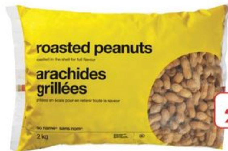
NO NAME® ROASTED PEANUTS CLUB SIZE, PRODUCT OF U.S.A., 2 KG