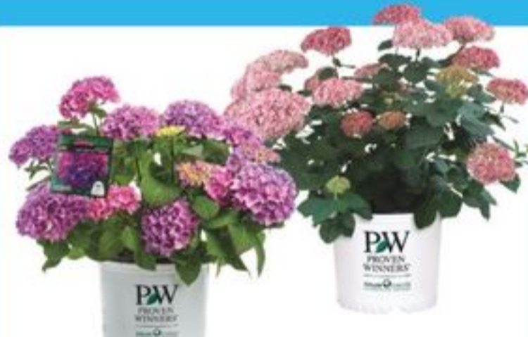
HYDRANGEA PW SHRUB ASSORTED VARIETIES, 8 INCH 20652732_EA