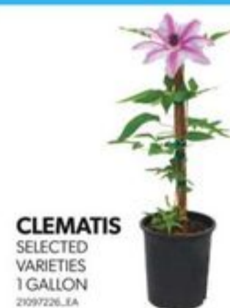
CLEMATIS SELECTED VARIETIES 1 GALLON 21097226_EA