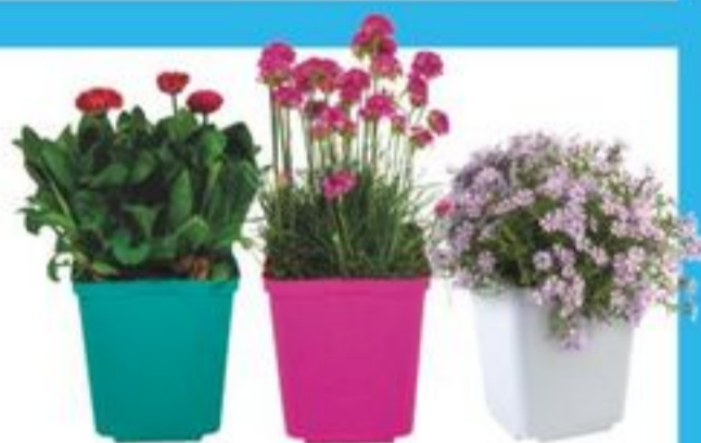
PC® PERENNIALS ASSORTED VARIETIES, 15 CM 21350466_EA