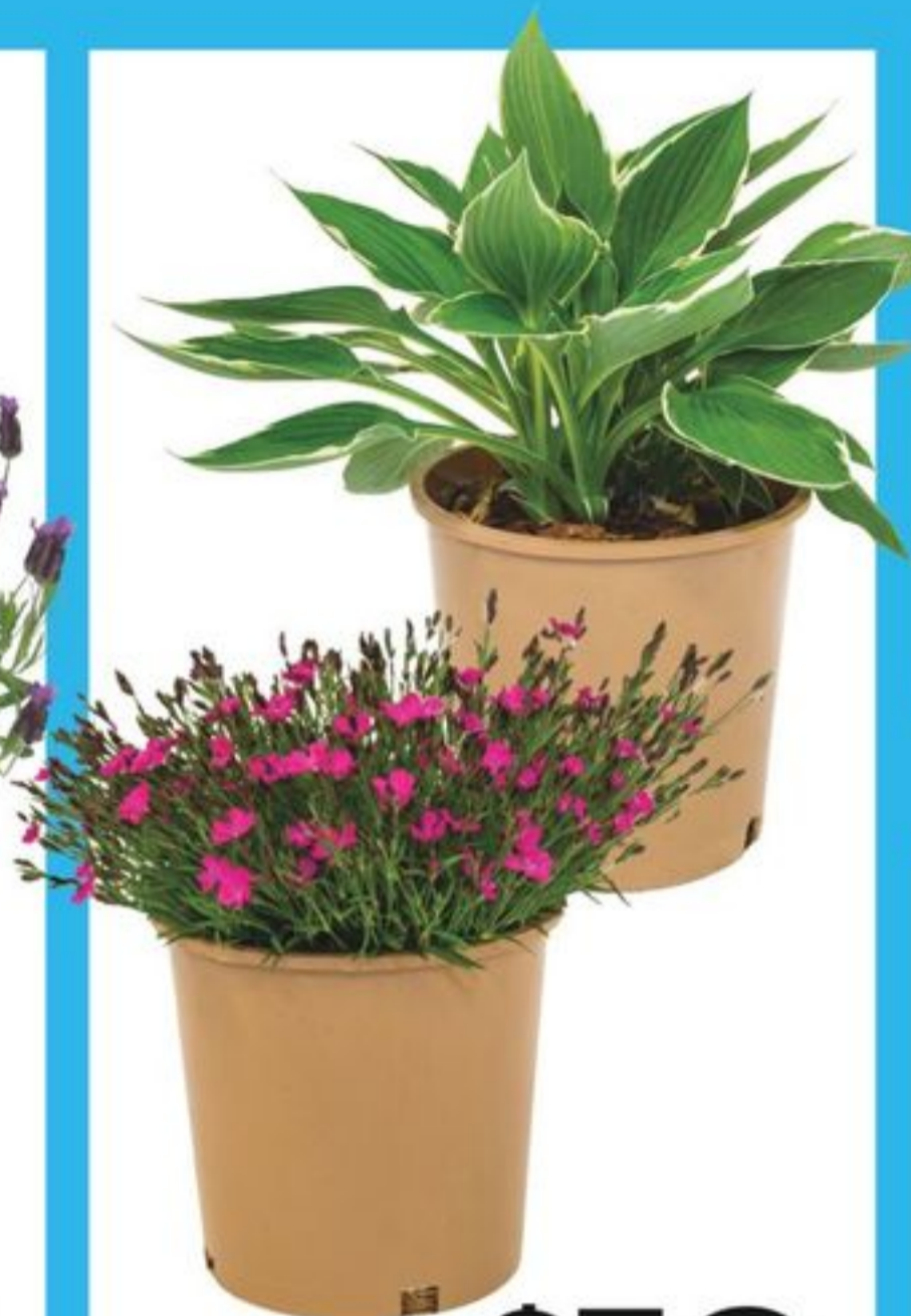
PERENNIAL 2 GALLON 21221090_EA