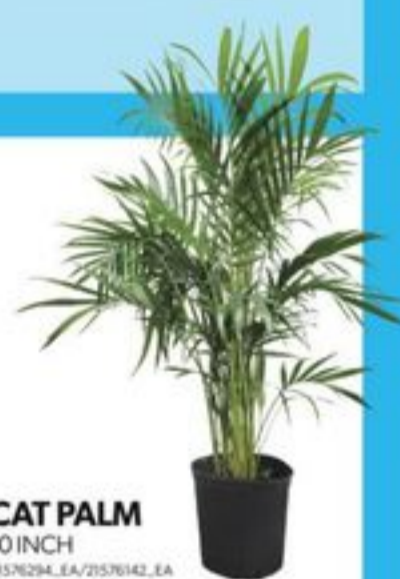
CAT PALM 10 INCH 21570294_EA/21570142_EA