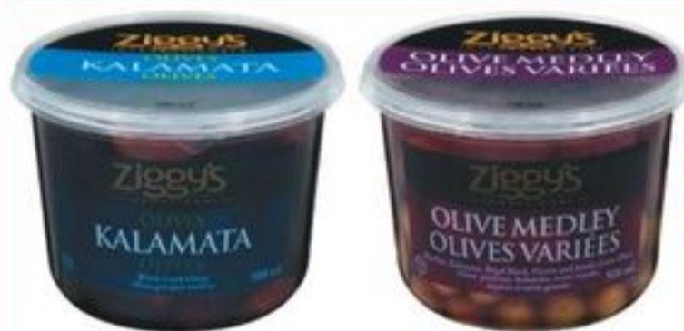
ZIGGY'S® OLIVES SELECTED VARIETIES, 500 ML