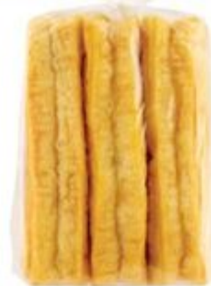
CHINESE LONG DONUTS BAKED IN-STORE, 6'S 20923195_EA