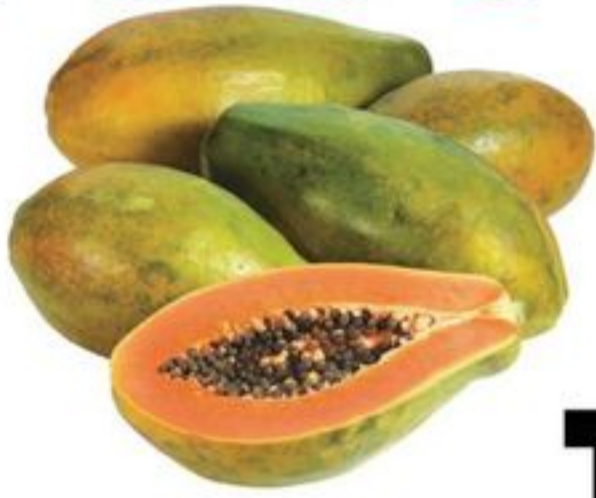
PAPAYA PRODUCT OF MEXICO 20817066001_KG