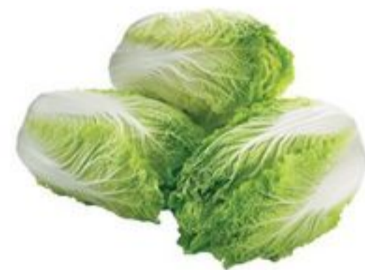
NAPA PRODUCT OF U.S.A. 20015025001_KG