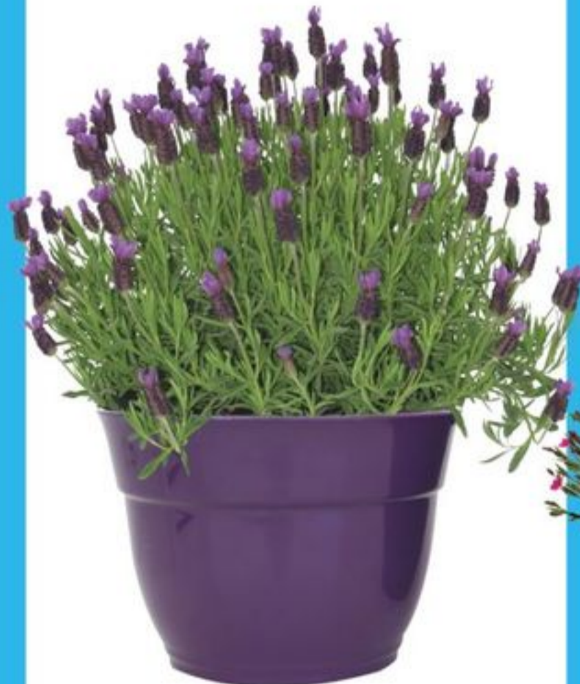
PC® LAVENDER SHRUB 11 INCH 20926885_EA