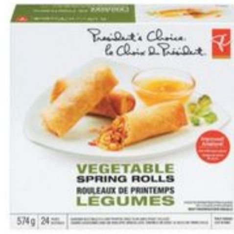
PC® SPRING ROLLS SELECTED VARIETIES, FROZEN, 560/574 G