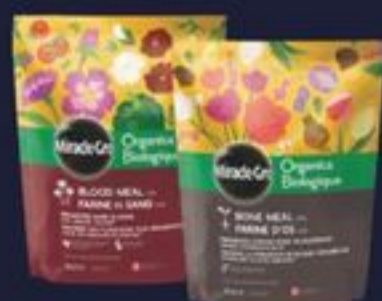
MIRACLE GRO® BLOOD MEAL OR BONE MEAL 1.36 KG 21090312_EA/21090313_EA