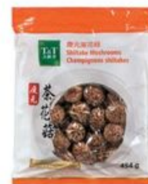
T&T® DRIED SHIITAKE MUSHROOMS 454 G 21026418_EA