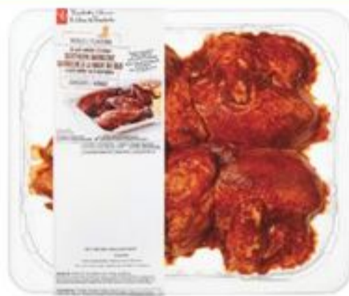
PC® WORLD OF FLAVOURS SOUTHERN BBQ CHICKEN