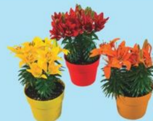
PC® LILIUM COLLECTION IN A DECORATIVE COLOUR POT SELECTED VARIETIES, 8 INCH 20998886_EA