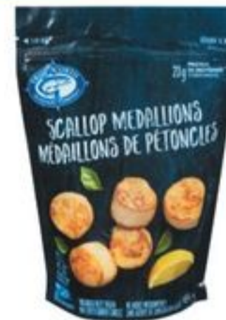
TALLY'S GREENSHELL MUSSELS IN THE HALF SHELL 907 G OR TRUE NORTH SCALLOP MEDALLIONS 454 G FROZEN