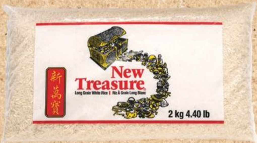
New Treasure Long Grain White Rice 2kg