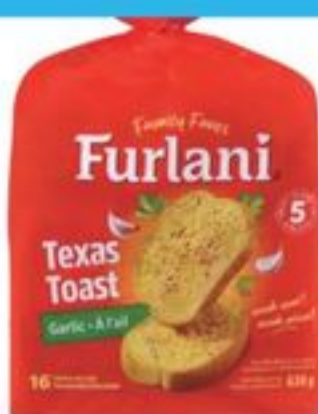
FURLANI GARLIC TOAST SELECTED VARIETIES, 16'S