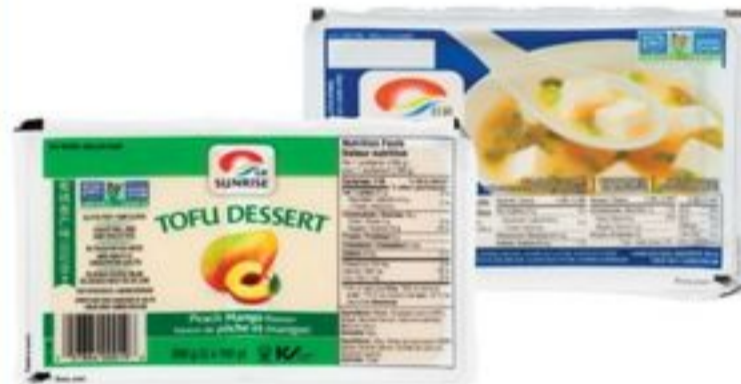
SUNRISE DESSERT OR SOFT TOFU SELECTED VARIETIES 300 G 20131704_EA/20569354_EA