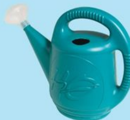
WATERING CAN 2 GALLON 20279904_EA