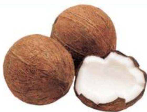
COCONUT PRODUCT OF INDIA 20005774001_EA