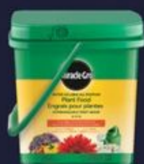
MIRACLE GRO® ALL PURPOSE PLANT FOOD 1.5 KG 21137038_EA