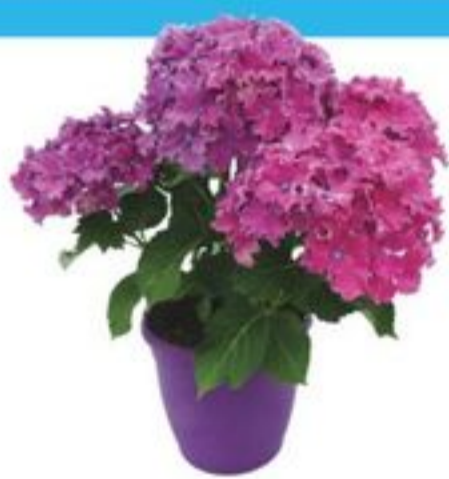
PATIO HYDRANGEA 8 INCH 21221049_EA