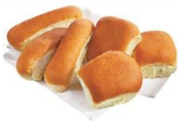
TEXAS-STYLE HAMBURGER OR HOT DOG BUNS BAKE IN-STORE, 12'S