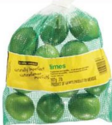
NO NAME® NATURALLY IMPERFECT™ LIMES PRODUCT OF MEXICO, 907 G