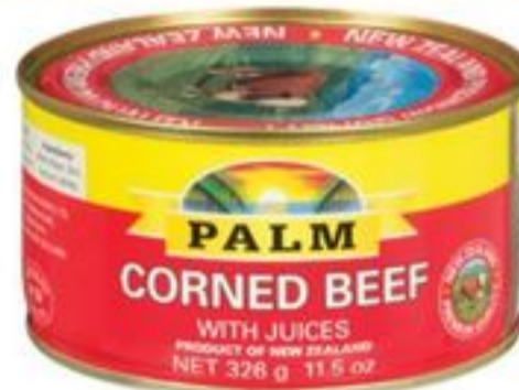
PALM CORNED BEEF SELECTED VARIETIES, 326 G 20416342_EA