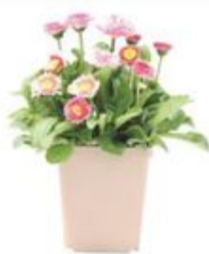
PC® PERENNIALS ASSORTED VARIETIES, 9 CM 21350463_EA