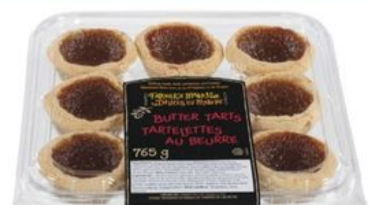
FARMER'S MARKET™ BUTTER TARTS