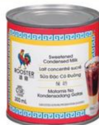
ROOSTER® SWEET CONDENSED MILK 300 ML 20106907_EA