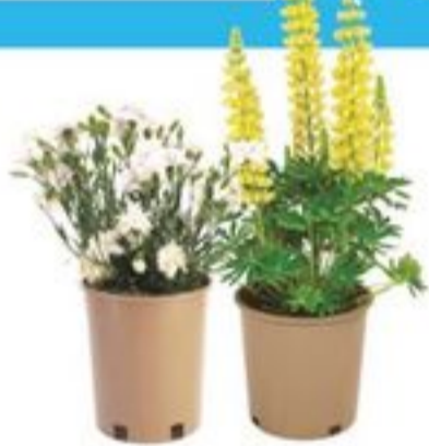
PC® PERENNIALS ASSORTED VARIETIES, 13 CM 21350465_EA