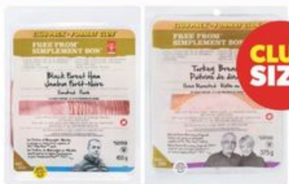
PC® FREE FROM® SLICED DELI MEAT SELECTED VARIETIES 300-400 G