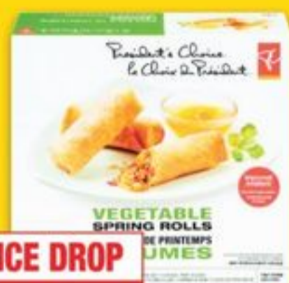
PC® SPRING ROLLS selected varieties, frozen 574 g rouleaux de printemps 20692094 SA