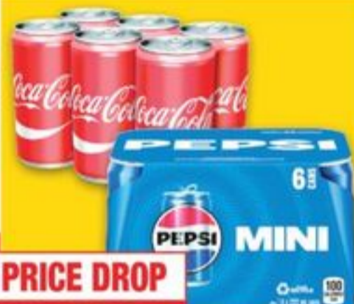
COCA-COLA or PEPSI SOFT DRINKS selected varieties 6x222 mL boissons gazeuses 20344284002 C06/20637360004 C06