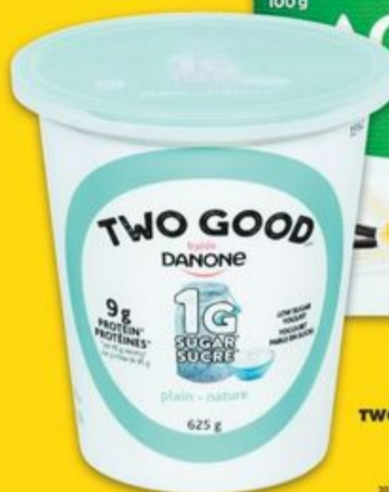
DANONE ACTIVIA 8% MIX & GO VANILLA 2% or TWO GOOD LOW SUGAR 625 g selected varieties yogourt 20223264002 SA/21477313 SA