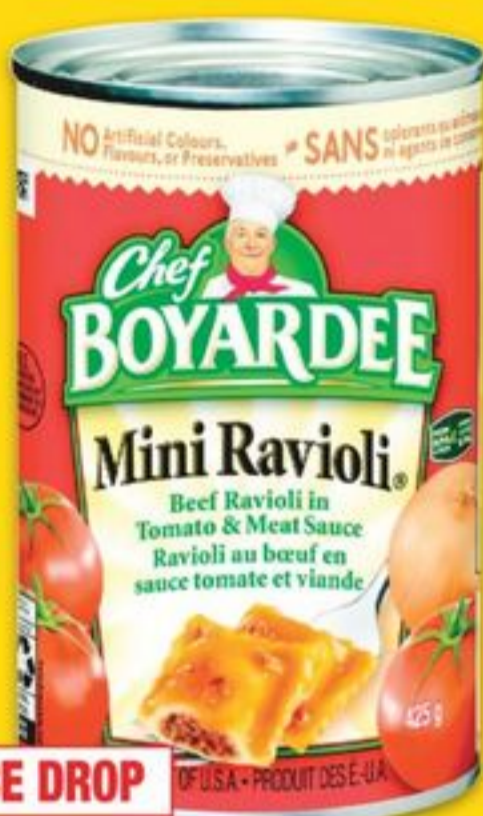
CHEF BOYARDEE selected varieties 418/425 g pâtes 2031230001 SA