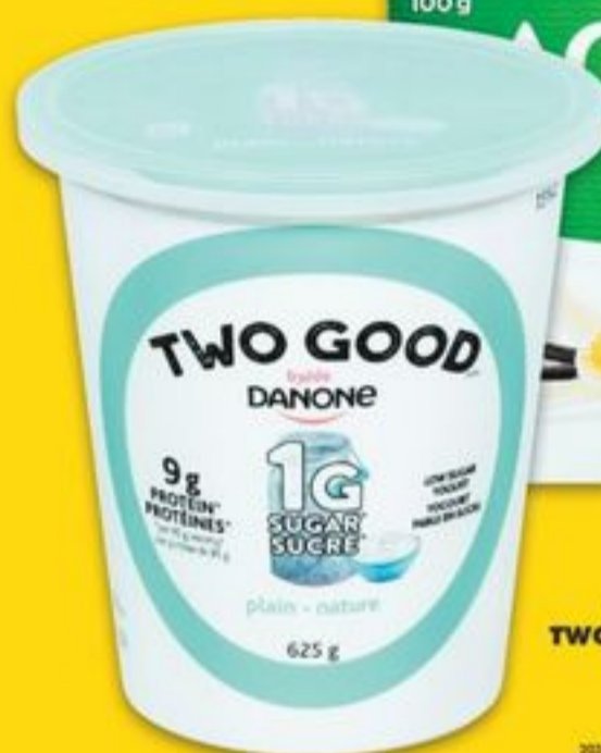
DANONE ACTIVIA 8% MIX & GO VANILLA 2% or TWO GOOD LOW SUGAR YOGURT selected varieties yogourt 2022384002 SA/21477313 SA