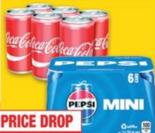
COCA-COLA or PEPSI SOFT DRINKS selected varieties 6x222 mL boissons gazeuses 2034428002 C06/20637340004 C06