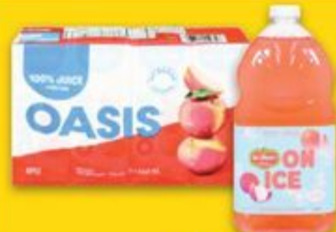
OASIS JUICE or ARIZONA ICED TEA, ALLEN'S APPLE or CRANBERRY COCKTAIL or DEL MONTE ON ICE REFRESHERS 1.89 L selected varieties jus ou thé glacé ou boissons 20313744002 SA/21375041 SA