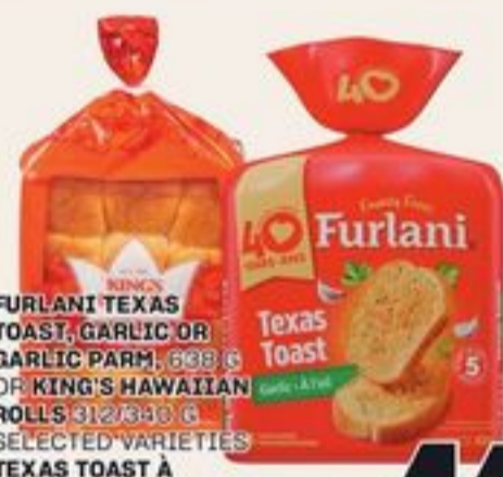
FURLANI TEXAS TOAST, GARLIC OR GARLIC PARM. 698 G OR KING'S HAWAIIAN ROLLS 312/340 G SELECTED VARIETIES TEXAS TOAST À L'AIL OU AIL ET PARMESAN FURLANI OU PETITS PAINS KING'S HAWAIIAN 20041579_EA/21475970_EA