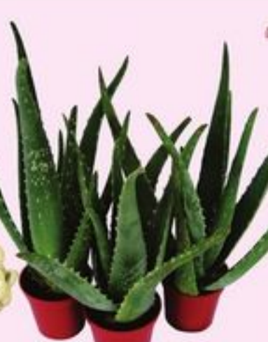
ALOE VERA 4 INCH POT ALÔES 21047366_EA