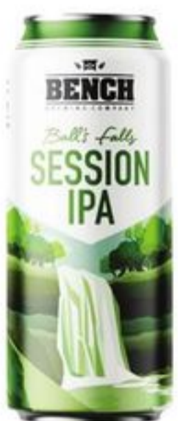
BALL'S FALLS SESSION IPA 473 ML CAN 21009874_EA