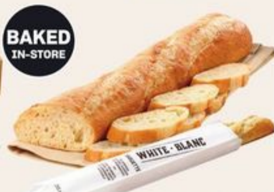
BAGUETTE WHITE OR WHOLE WHEAT 255 G BAGUETTE 21529211_EA