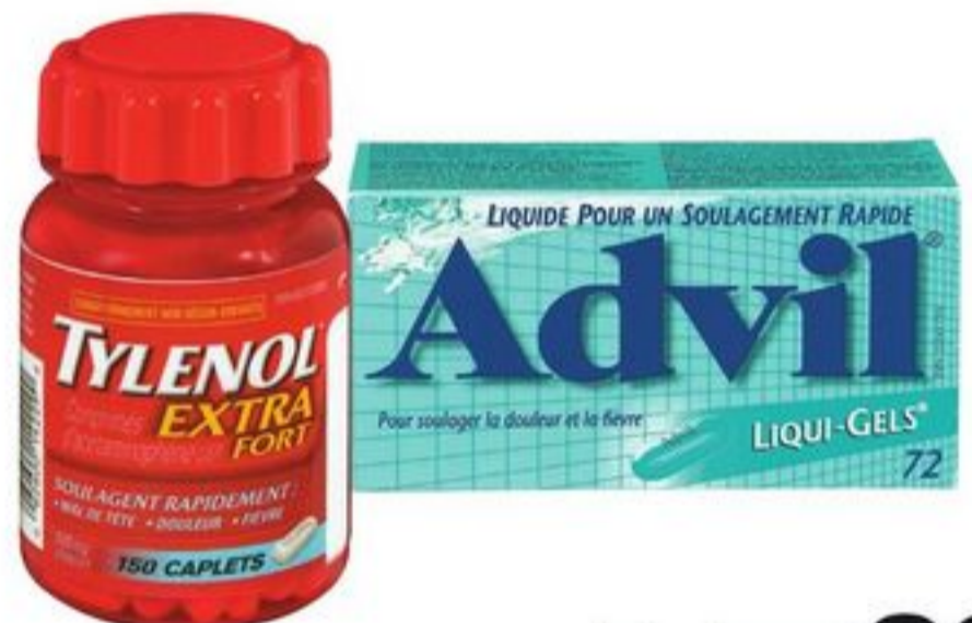
ASPIRIN 100/120'S, ALEVE 40-100'S, ALEVE-X 72 G, TYLENOL 72-150'S, MOTRIN 60/150'S OR ADVIL 40-72'S PAIN RELIEF TABLETS, CAPLETS, GELS OR RUB SELECTED VARIETIES 21532778_EA/20328051_EA