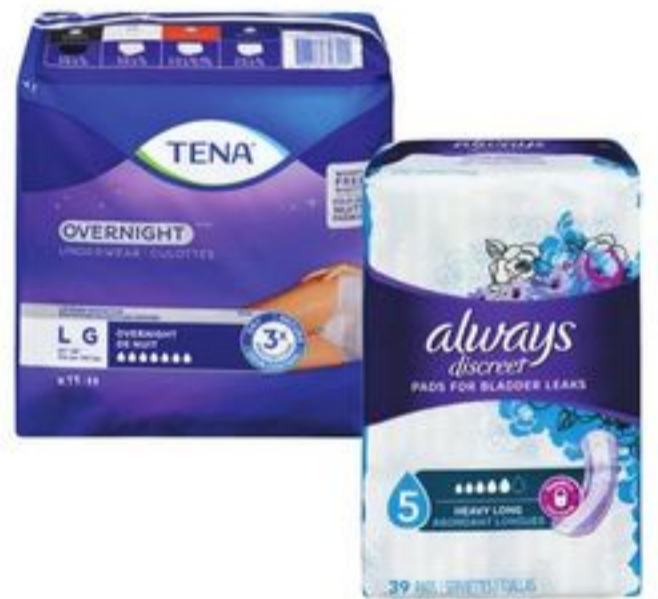
ALWAYS DISCREET 10-54'S OR TENA 12-48'S INCONTINENCE UNDERWEAR OR PADS SELECTED VARIETIES AND SIZES 20814896_EA/210333778_EA