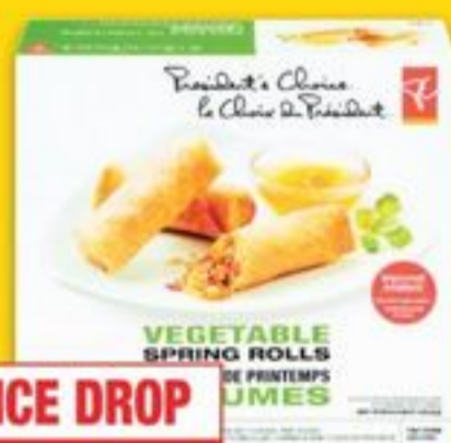
PC® SPRING ROLLS selected varieties, frozen 574 g rouleaux de printemps 20692094 SA