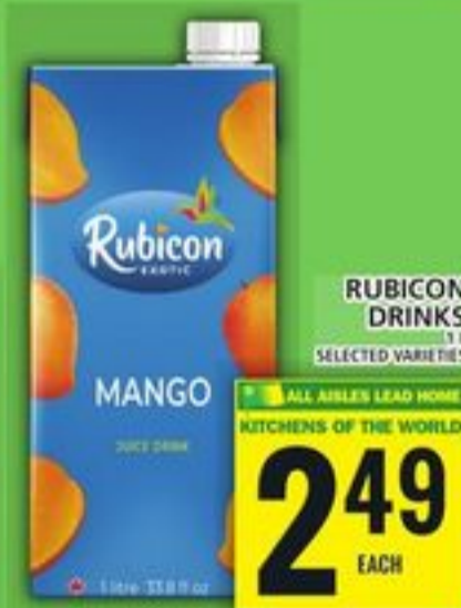
RUBICON DRINKS 1.5 L SELECTED VARIETIES

ALL AISLES LEAD HOME KITCHENS OF THE WORLD 2.79 EACH