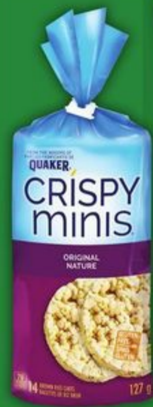
QUAKER CRISPY MINIS ORIGINAL NATURE 127 g