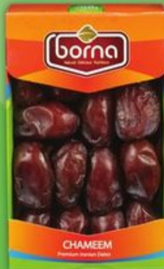
BORNA CHAMEEM DATES 1400 G PRODUCT OF IRAN

ALL AISLES LEAD HOME KITCHENS OF THE WORLD 1.98 /LB