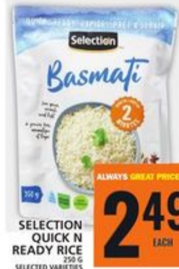
SELECTION QUICK N READY RICE 250 G SELECTED VARIETIES