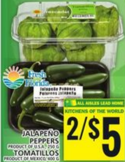
JALAPEÑO PEPPERS PRODUCT OF USA 250 G TOMATILLOS PRODUCT OF MEXICO 400 G

ALL AISLES LEAD HOME KITCHENS OF THE WORLD 7.49 EACH