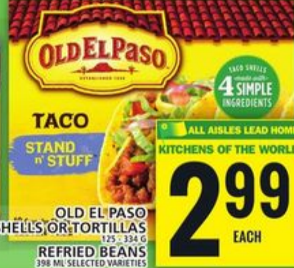
OLD EL PASO SHELLS OR TORTILLAS 125-334 G REFRIED BEANS 398 ML SELECTED VARIETIES

ALL AISLES LEAD HOME KITCHENS OF THE WORLD 2.99 EACH