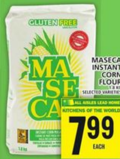
MASECA INSTANT CORN FLOUR 1.8 KG SELECTED VARIETIES

ALL AISLES LEAD HOME KITCHENS OF THE WORLD 1.67 EACH