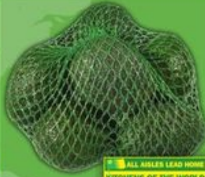
AVOCADOS PRODUCT OF MEXICO OR PERU BAG OF 5 OR 6

ALL AISLES LEAD HOME KITCHENS OF THE WORLD 2/$5