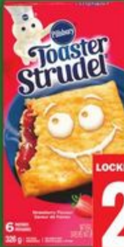
PILLSBURY TOASTER STRUDEL 326 G FROZEN SELECTED VARIETIES