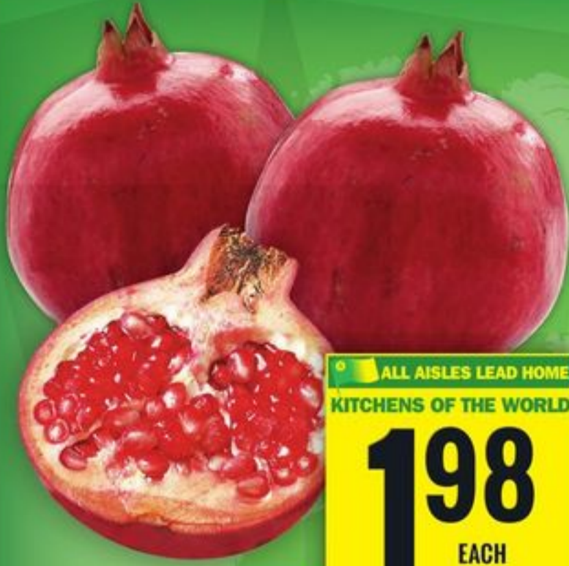
POMEGRANATE PRODUCT OF INDIA OR PERU

ALL AISLES LEAD HOME KITCHENS OF THE WORLD 1.98 EACH