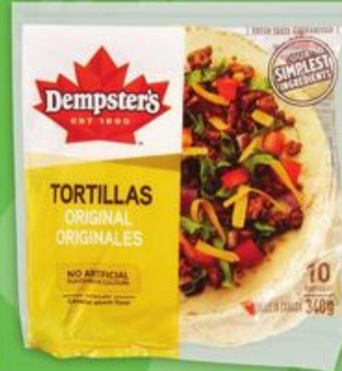
DEMPSTER'S 7" TORTILLAS 272-340 G SELECTED VARIETIES

ALL AISLES LEAD HOME KITCHENS OF THE WORLD 4.88 EACH