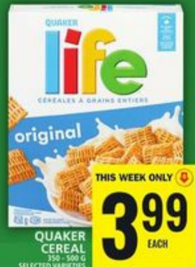
QUAKER LIFE CEREAL 350 - 500 G SELECTED VARIETIES