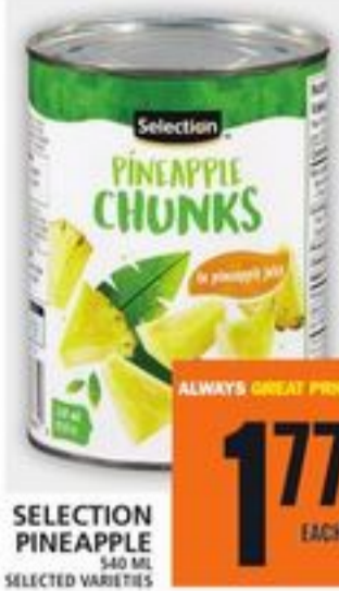
SELECTION PINEAPPLE 540 ML SELECTED VARIETIES