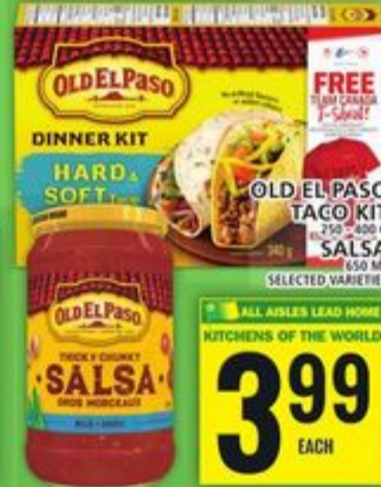
OLD EL PASO DINNER KIT HARD SOFT FREE TOSTITOS OLD EL PASO TACO KIT 250-280 G SALSA 650 ML SELECTED VARIETIES

ALL AISLES LEAD HOME KITCHENS OF THE WORLD 2.99 EACH