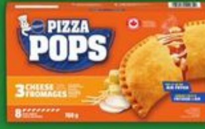
PILLSBURY PIZZA POPS 693 - 768 G FROZEN SELECTED VARIETIES