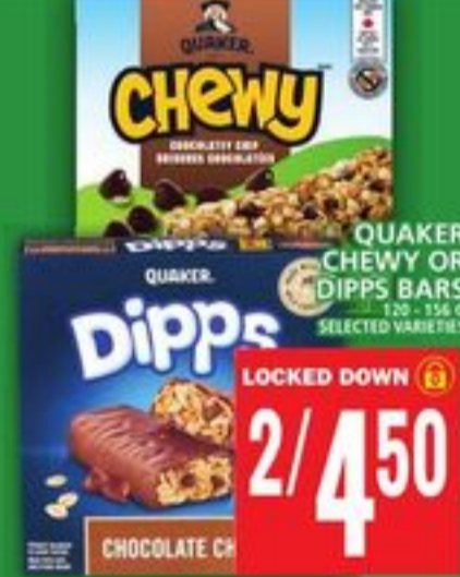
QUAKER CHEWY OR DIPPES BARS 120 - 156 G SELECTED VARIETIES