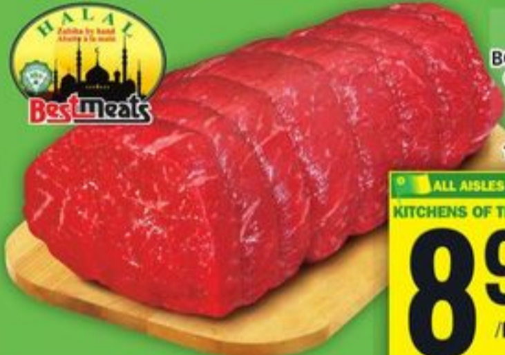
FRESH HALAL BONELESS OUTSIDE ROUND ROAST VACUUM PACK 19.82/KG

ALL AISLES LEAD HOME KITCHENS OF THE WORLD 8.99 /LB