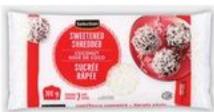
SELECTION SHREDDED COCONUT 200 G SELECTED VARIETIES