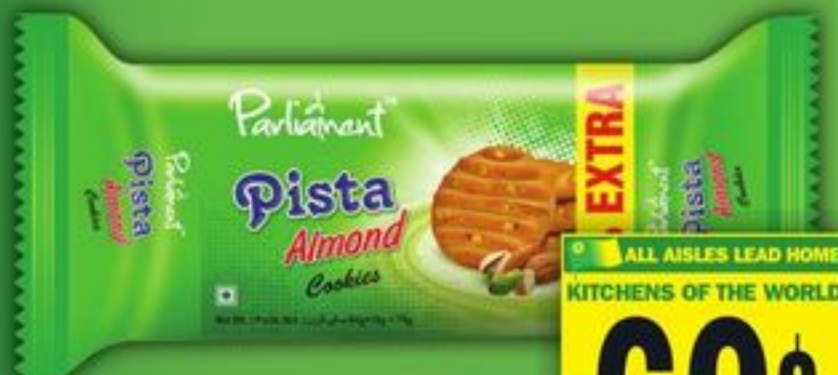
PARLIAMENT COOKIES 75.780 G SELECTED VARIETIES

ALL AISLES LEAD HOME KITCHENS OF THE WORLD 4.99 EACH