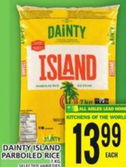
DAINTY ISLAND PARBOILED RICE 7.4 KG SELECTED VARIETIES

ALL AISLES LEAD HOME KITCHENS OF THE WORLD 2.49 EACH