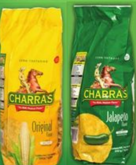
CHARRAS TOSTADAS CHIPS 350 G SELECTED VARIETIES

ALL AISLES LEAD HOME KITCHENS OF THE WORLD 1.29 EACH