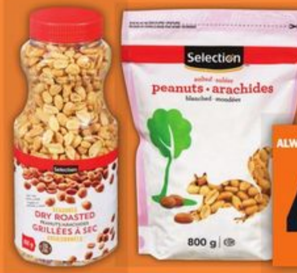
SELECTION PEANUTS 700 - 800 G SELECTED VARIETIES