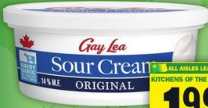
GAY LEA SOUR CREAM 250 ML SELECTED VARIETIES

ALL AISLES LEAD HOME KITCHENS OF THE WORLD 1.99 EACH