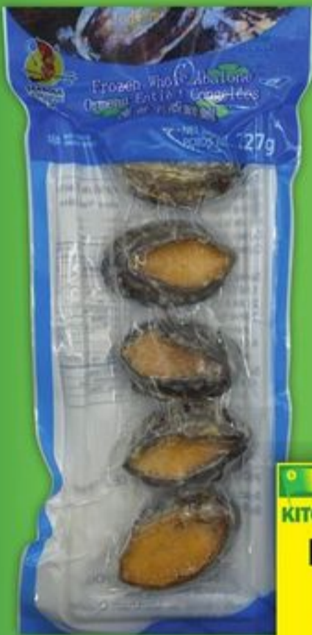
FROZEN WHOLE ABALONE 227 G SELECTED VARIETIES

ALL AISLES LEAD HOME KITCHENS OF THE WORLD 8.99 /LB