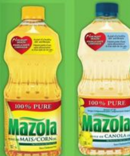
MAZOLA CORN, VEGETABLE OR CANOLA OIL 1.18 L SELECTED VARIETIES

ALL AISLES LEAD HOME KITCHENS OF THE WORLD 13.99 EACH