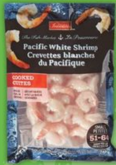
IRRESISTIBLES PACIFIC WHITE COOKED SHRIMP 51-60 CT 340 G FROZEN SELECTED VARIETIES

ALL AISLES LEAD HOME KITCHENS OF THE WORLD 1.99 EACH