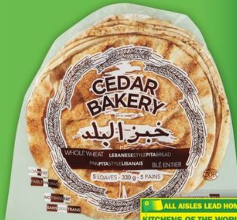
CEDAR LEBANESE PITA 330 G SELECTED VARIETIES

ALL AISLES LEAD HOME KITCHENS OF THE WORLD 7.99 EACH