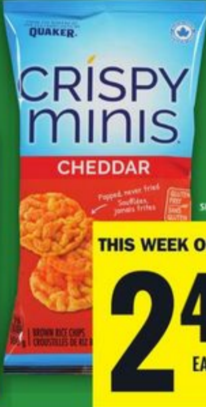
QUAKER CRISPY MINIS CHEDDAR 127 g