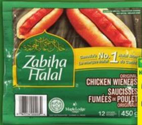
ZABIHA HALAL CHICKEN WIENERS 450 G SELECTED VARIETIES

ALL AISLES LEAD HOME KITCHENS OF THE WORLD 2/$6