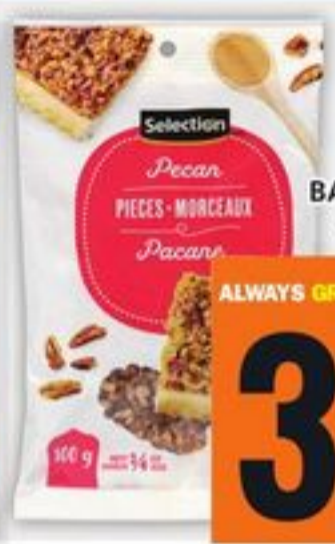
SELECTION BAKING NUTS 100 G SELECTED VARIETIES