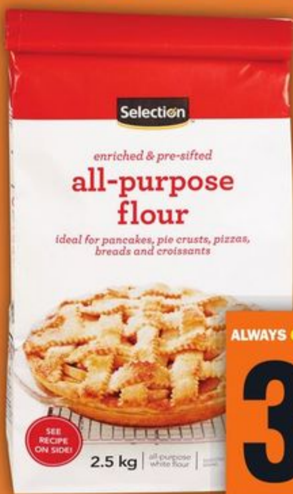
SELECTION FLOUR 2.5 KG SELECTED VARIETIES