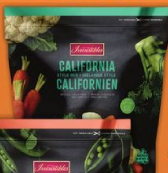
IRRESISTIBLES VEGETABLES 500 G FROZEN SELECTED VARIETIES