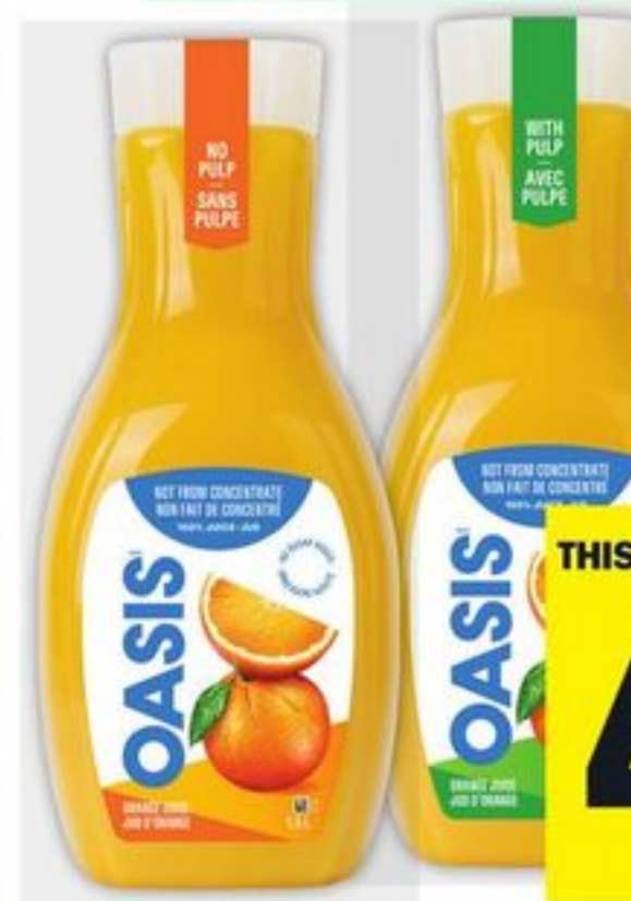
OASIS ORANGE JUICE 1.5 L SELECTED VARIETIES