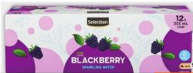
SELECTION SOFT DRINKS OR SPARKLING WATER 12 X 355 ML SELECTED VARIETIES