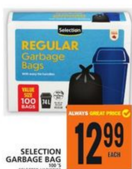
SELECTION GARBAGE BAG 100'S SELECTED VARIETIES