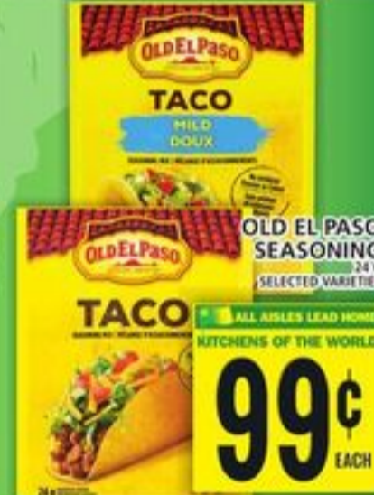
OLD EL PASO TACO MILD DOUX OLD EL PASO SEASONING 24 G SELECTED VARIETIES

ALL AISLES LEAD HOME KITCHENS OF THE WORLD 3.99 EACH