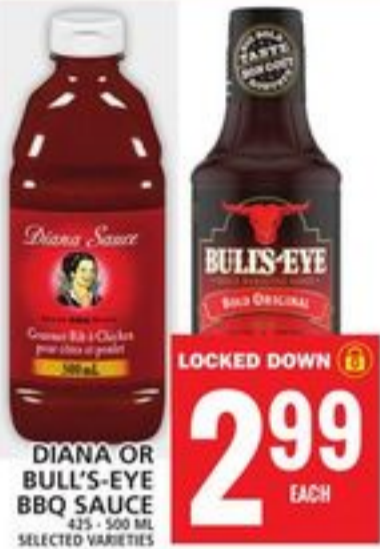
DIANA OR BULL'S-EYE BBQ SAUCE 425 - 500 ML SELECTED VARIETIES