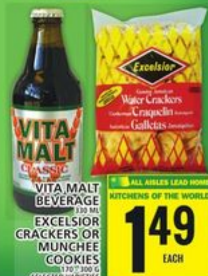
VITA MALT BEVERAGE 330 ML EXCELSIOR CRACKERS OR MUNCHEE COOKIES 170-300 G SELECTED VARIETIES

ALL AISLES LEAD HOME KITCHENS OF THE WORLD 99¢ EACH