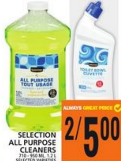
SELECTION ALL PURPOSE CLEANERS 710 - 950 ML 1.2 L SELECTED VARIETIES