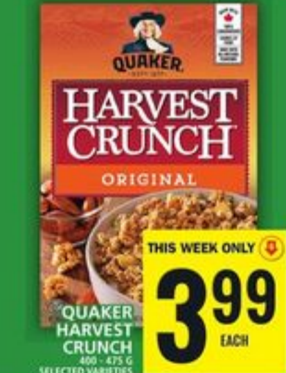
QUAKER HARVEST CRUNCH 400 - 475 G SELECTED VARIETIES