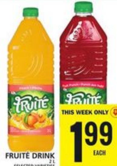
FRUITÉ DRINK SELECTED VARIETIES