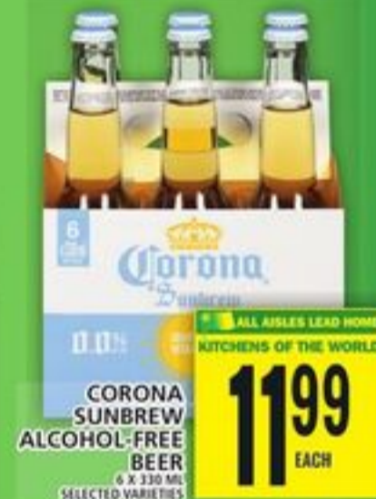
CORONA SUNBREW ALCOHOL-FREE BEER 6 x 230 ML SELECTED VARIETIES

ALL AISLES LEAD HOME KITCHENS OF THE WORLD 7.99 EACH