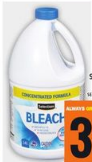
SELECTION BLEACH 2.4 L SELECTED VARIETIES