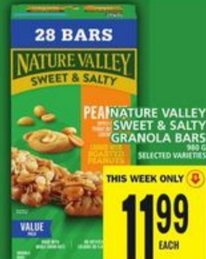
NATURE VALLEY SWEET & SALTY GRANOLA BARS 960 G SELECTED VARIETIES