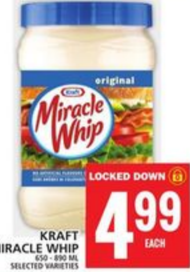
KRAFT MIRACLE WHIP 650 - 890 ML SELECTED VARIETIES