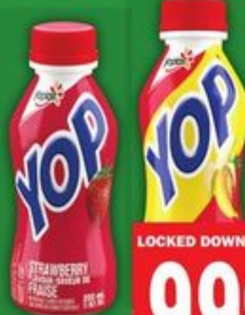
YOPLAIT YOP 250 ML SELECTED VARIETIES