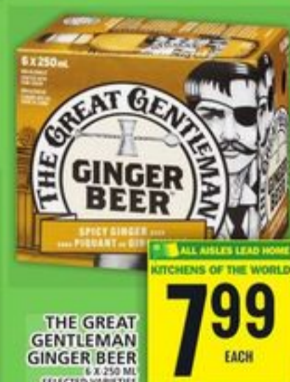
THE GREAT GENTLEMAN GINGER BEER 6 x 250 ml SELECTED VARIETIES

ALL AISLES LEAD HOME KITCHENS OF THE WORLD 5.99 EACH