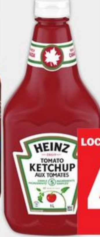
HEINZ KETCHUP 750 ML - 1 L PURE J.L. KRAFT DRESSING OR MARINADE 375 ML SELECTED VARIETIES