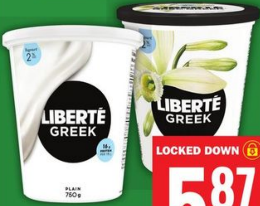
LIBERTÉ GREEK YOGURT 650 - 750 G SELECTED VARIETIES