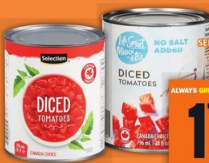
SELECTION OR LIFE SMART TOMATOES 540 - 796 ML SELECTED VARIETIES