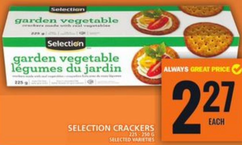
SELECTION CRACKERS 225 - 250 G SELECTED VARIETIES