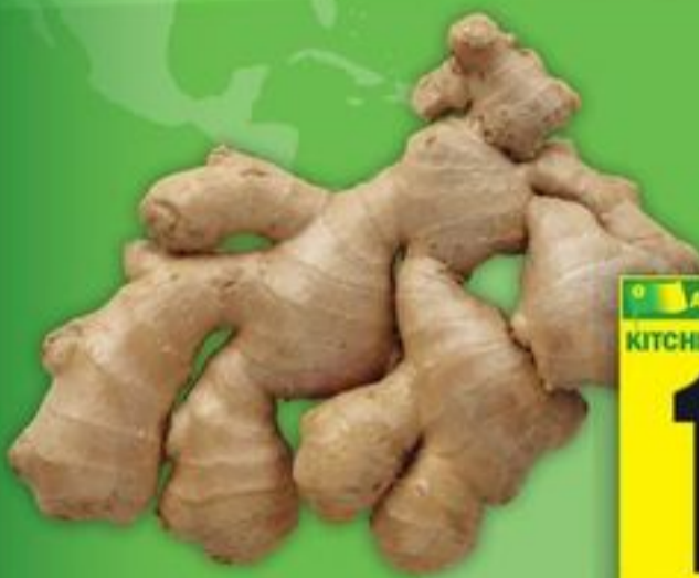
FRESH GINGER PRODUCT OF CHINA 4.37/KG

ALL AISLES LEAD HOME KITCHENS OF THE WORLD 99¢ /LB