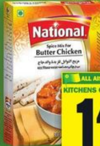
NATIONAL SPICE MIXES OR GITS MIXES 45.200 G SELECTED VARIETIES

ALL AISLES LEAD HOME KITCHENS OF THE WORLD 1.49 EACH