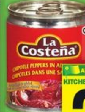
LA COSTEÑA CANNED BEANS 528-546 ML MARINADES 186-477 ML SELECTED VARIETIES

ALL AISLES LEAD HOME KITCHENS OF THE WORLD 2.79 EACH