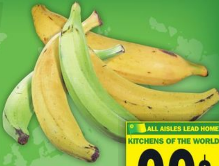
PLANTAIN BANANAS PRODUCT OF GUATEMALA 2.18/KG

ALL AISLES LEAD HOME KITCHENS OF THE WORLD 1.98 EACH