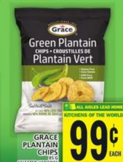
GRACE Green Plantain CHIPS • CROUSTILLES DE Plantain Vert 1.8 KG SELECTED VARIETIES

ALL AISLES LEAD HOME KITCHENS OF THE WORLD 3.49 EACH