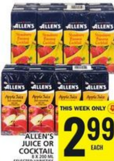
ALLEN'S JUICE OR COCKTAIL 1.5 L SELECTED VARIETIES