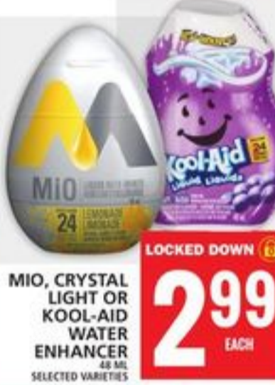
MIO, CRYSTAL LIGHT OR KOOL-AID WATER ENHANCER 48 ML SELECTED VARIETIES