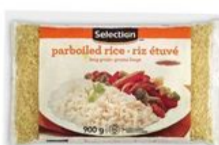
SELECTION LONG GRAIN RICE 900 G SELECTED VARIETIES