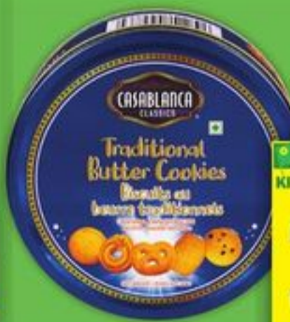
PURE HEAVEN DRINKS OR CASABLANCA BUTTER COOKIES 750 ML/454 G SELECTED VARIETIES

ALL AISLES LEAD HOME KITCHENS OF THE WORLD 3.99 EACH