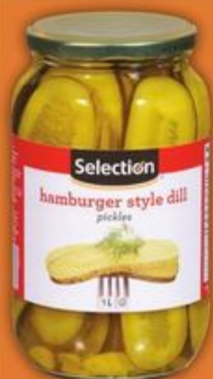
SELECTION PICKLES 1 L SELECTED VARIETIES