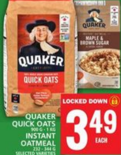
QUAKER QUICK OATS 900 G - 1 KG INSTANT OATMEAL 232 - 344 G SELECTED VARIETIES