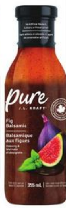
PURE J.L. KRAFT Fig Balsamic Balsamique aux Figues 305 mL