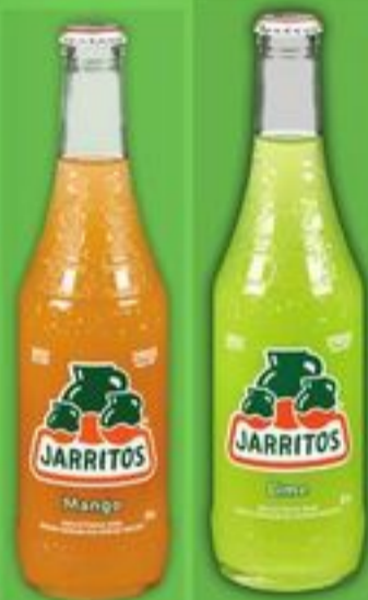
JARRITOS SODAS 370 ML SELECTED VARIETIES

ALL AISLES LEAD HOME KITCHENS OF THE WORLD 99¢ EACH