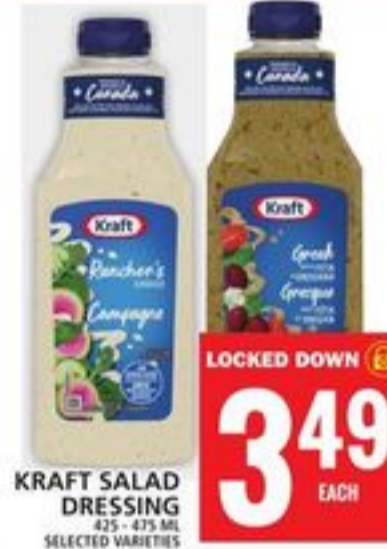
KRAFT SALAD DRESSING 425 - 475 ML SELECTED VARIETIES