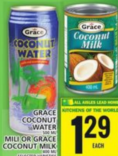
GRACE COCONUT WATER 500 ML MILI OR GRACE COCONUT MILK 400 ML SELECTED VARIETIES

ALL AISLES LEAD HOME KITCHENS OF THE WORLD 7.99 EACH