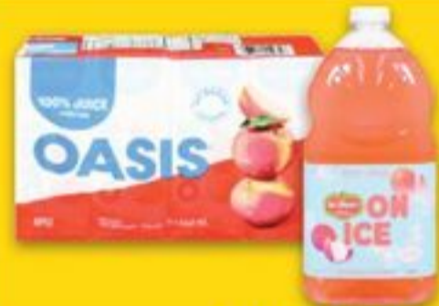
OASIS JUICE or ARIZONA ICED TEA, ALLEN'S APPLE or CRANBERRY COCKTAIL or DEL MONTE ON ICE REFRESHERS 1.89 L selected varieties jus ou thé glacé ou boissons 20313744002 SA/21375041 SA