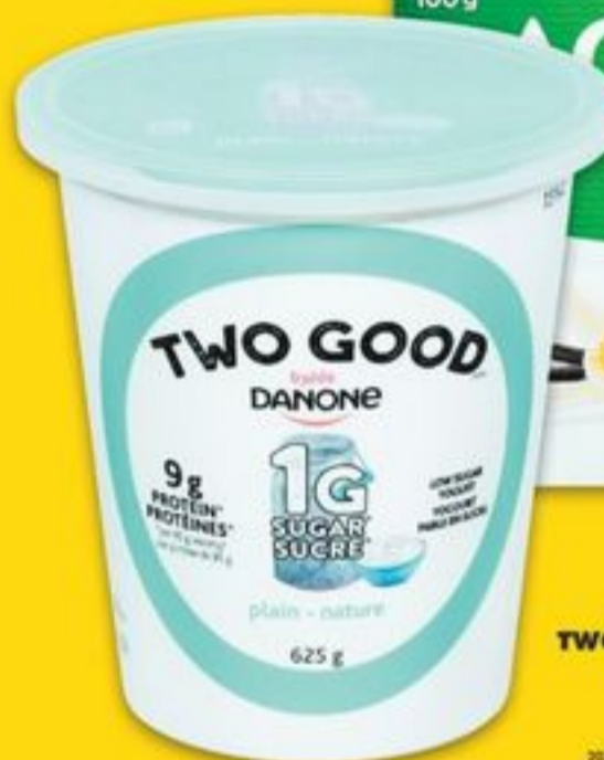
DANONE ACTIVA 8% MIX & GO VANILLA 2% or TWO GOOD LOW SUGAR YOGURT selected varieties yogourt 2022384002 SA/21477313 SA