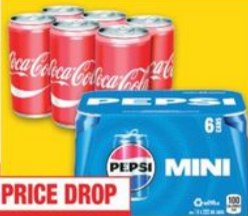
COCA-COLA or PEPSI SOFT DRINKS selected varieties 6x222 mL boissons gazeuses 2034428002 C06/20637340004 C06