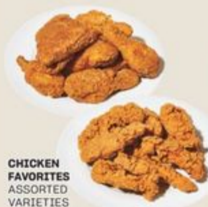
CHICKEN FAVORITES ASSORTED VARIETIES SERVED HOT OR CHILLED 320-700 G MORCEAUX PRÉFÉRÉS DE POULET 20137058_EA/20992187_EA