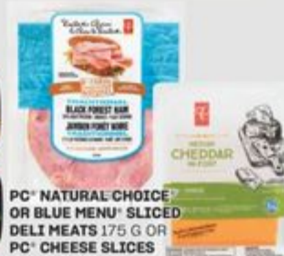
PC® NATURAL CHOICE OR BLUE MENU® SLICED DELI MEATS 175 G OR PC® CHEESE SLICES 140-170 G SELECTED VARIETIES CHARCUTERIES PC® LE CHOIX NATUREL® OU MENU BLEU™ OU TRANCHES DE FROMAGE PC® 20216643_EA/20310580_EA