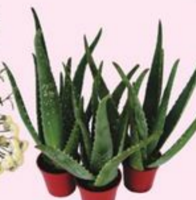
ALOE VERA 4 INCH POT ALOÈS 21047366_EA