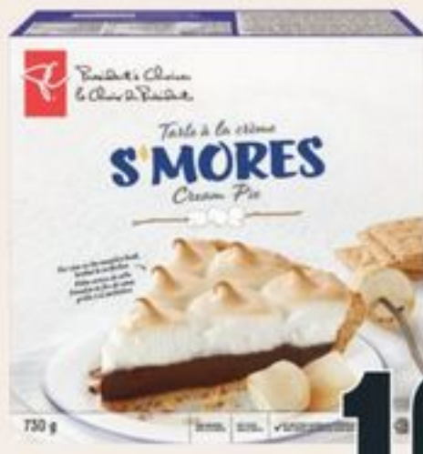
PC® S'MORES CREAM PIE FROZEN 730 G TARTE À LA CRÈME S'MORES PC® 21574358_EA