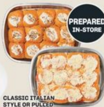
CLASSIC ITALIAN STYLE OR PULLED PORK SLIDERS 716/853 G MINI-BURGERS STYLE ITALIEN CLASSIQUE OU PORC EFFILOCHÉ 21562105_EA/21595416_EA