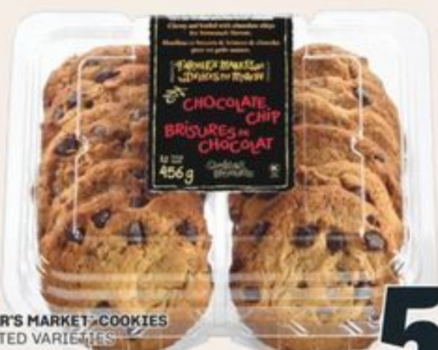
FARMER'S MARKET COOKIES SELECTED VARIETIES 12'S BISCUITS DÉLICÉS DU MARCHÉ™ 20566774_EA