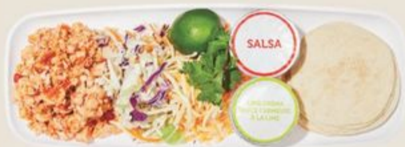
CHICKEN, FAJITA, TANDOORI OR GYRO TACO TRAYS SELECTED VARIETIES 1-1.1 KG PLATEAUX DE TACOS AU POULET, FAJITA, TANDOORI OU GYRO 21354582_EA/21395977_EA