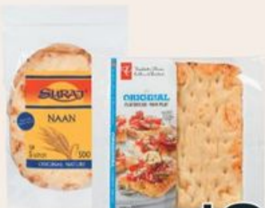
PC® FLATBREAD 220/300 G OR SURAJ® NAAN 5'S SELECTED VARIETIES PAIN PLAT PC® OU NAAN SURAJ® 20910042_EA/21051353_EA