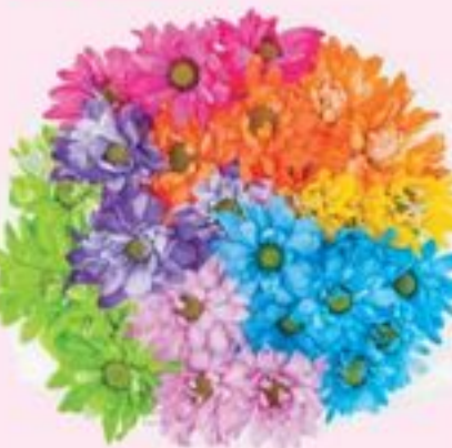
COLOUR POP DAISIES MARGUERITES COLOUR POP 21437439_EA