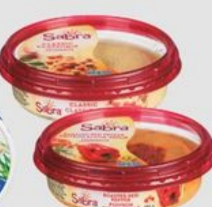
SABRA HUMMUS SELECTED VARIETIES 283 G HUMMUS SABRA 20005858_EA/20103117_EA