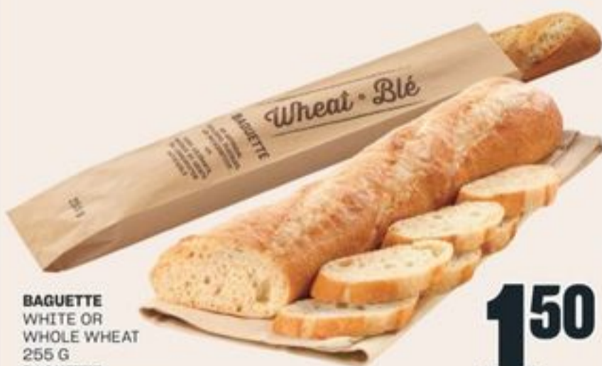
BAQUETTE WHITE OR WHOLE WHEAT 255 G BAQUETTE 21529211_EA/21530097_EA