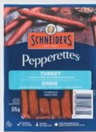
SCHNEIDERS PEPPERETTES SELECTED VARIETIES 250-375 G PEPPERETTES SCHNEIDERS 20976093_EA/21196171_EA