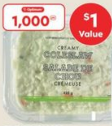
PREMIUM SALADS 425-454 G SALADES DE QUALITÉ SUPÉRIEURE FRAÎCHES 21544608_EA/21544611_EA

Great to go items plus applicable taxes.