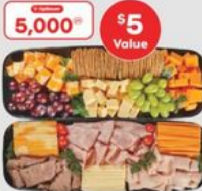
PARTY PLATTERS SELECTED VARIETIES 696 G/1.8 KG PLATEAUX DE CÉLÉBRATION 21217522_EA/21217539_EA

Members save $4 Optimum Members-Only Price 7 99 Non-members 11 99