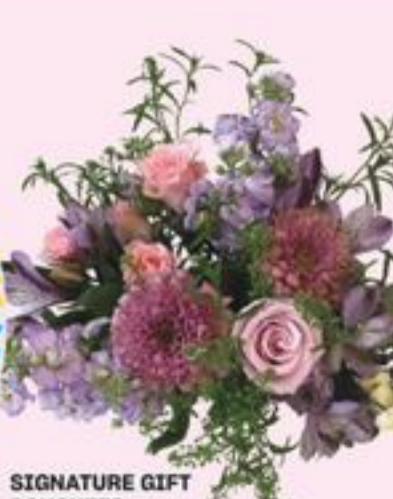
SIGNATURE GIFT BOUQUETS SELECTED VARIETIES BOUQUETS- CADEAUX SIGNATURE 21436377_EA/21436378_EA