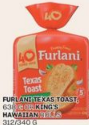
FURLANI TEXAS TOAST, 638 G CRINKLING'S HAWAIIAN ROLLS 312/340 G SELECTED VARIETIES TEXAS TOAST À L'AIL FURLANI OU PETITS PAINS KING'S HAWAIIAN 20041579_EA/21489831_EA