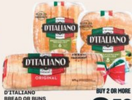
D'ITALIANO BREAD OR BUNS SELECTED VARIETIES AND SIZES PAIN OU PETITS PAINS D'ITALIANO 20038335_EA/20587369_EA/ 20673736_EA

BUY 2 OR MORE 3 50 EA. LESS THAN 2 $3.99 EA.