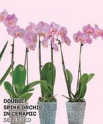
DOUBLE SPIKE ORCHID IN CERAMIC SELECTED VARIETIES EACH ORCHIDÉE À DEUX TIGES DANS UN POT EN CÉRAMIQUE 20293541_EA