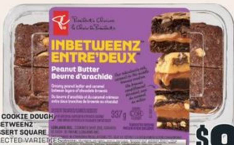
PC® COOKIE DOUGH INBETWEENZ DESSERT SQUARE SELECTED VARIETIES 312/337 G CARRÉS ENTRE'DEUX À LA PÂTE À BISCUITS PC® 21582554_EA