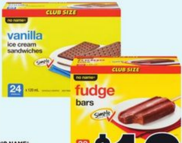
NO NAME® ICE CREAM SANDWICHES OR BARS CLUB SIZE SELECTED VARIETIES FROZEN 24/30'S 2034740002_EA/21013432_EA