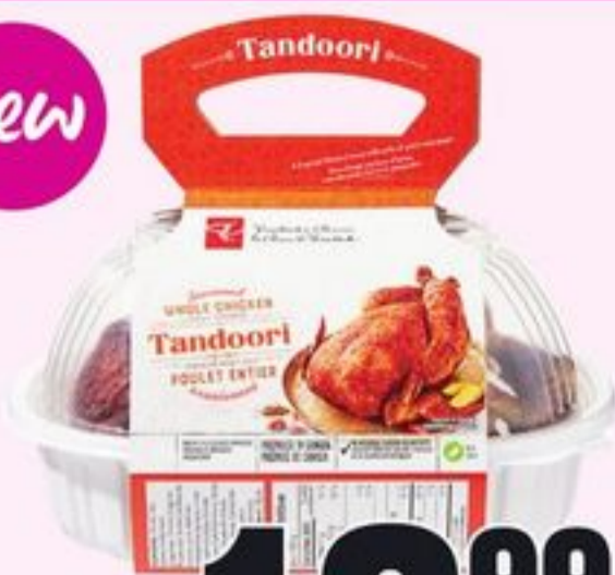
PC® TANDORI SEASONED FULLY COOKED WHOLE CHICKEN 900 G 21587735_EA