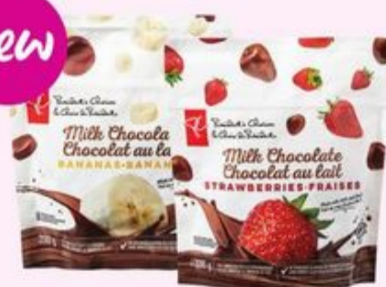
PC® MILK CHOCOLATE COVERED STRAWBERRIES OR BANANAS SELECTED VARIETIES FROZEN 200 G 21544053_EA 21520140_EA