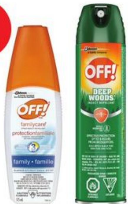
OFF! OR RAID INSECT REPELLENT SELECTED VARIETIES 20001279002_EA/20158572_EA