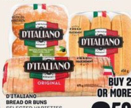
D'ITALIANO BREAD OR BUNS SELECTED VARIETIES AND SIZES PAIN OU PETITS PAINS D'ITALIANO 20038335_EA/20627101_EA/20587369_EA

BUY 2 OR MORE 3 50 EA. LESS THAN 2 $3.99 EA.