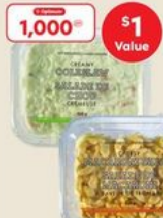
PREMIUM SALADS 425-454 G SALADES DE QUALITÉ SUPÉRIEURE 21544608_EA/21544611_EA