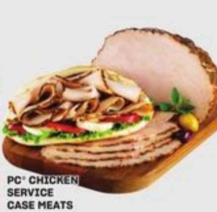
PC® CHICKEN SERVICE CASE MEATS SELECTED VARIETIES POULET PC™ POUR LE COMPTOIR DE SERVICE 20301114_KG