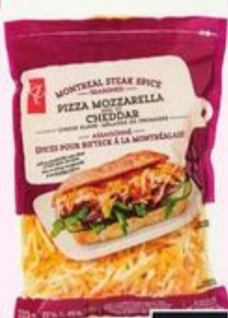
PC® MONTREAL STEAK SPICE SEASONED PIZZA MOZZARELLA AND CHEDDAR CHEESE BLEND 320 G 21575868_EA