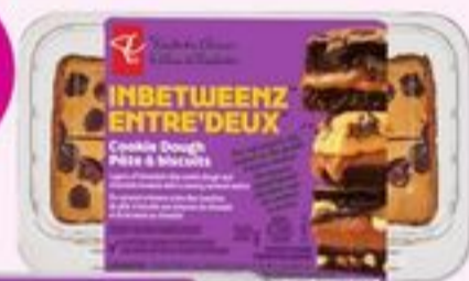
PC® INBETWEENZ™ DESSERT SQUARE SELECTED VARIETIES 312 G 21592641_EA