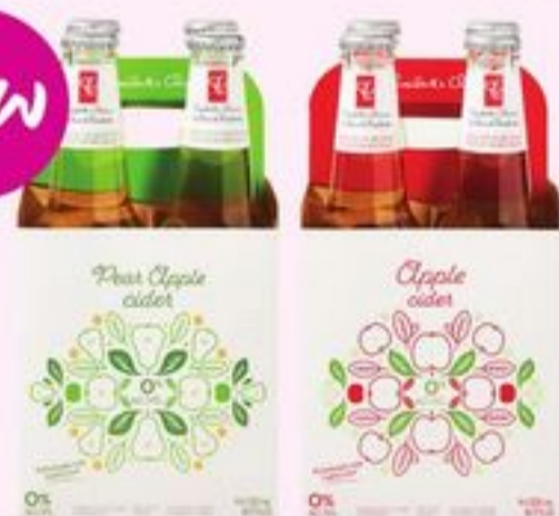
PC® SPARKLING DEALCOHOLIZED APPLE OR PEAR CIDER BEVERAGE SELECTED VARIETIES 4X330 ML 21588266_C04 21588277_C04