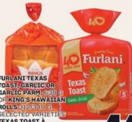
FURLANI TEXAS TOAST, GARLIC OR GARLIC PARM. 698 G OR KING'S HAWAIIAN ROLLS 312/340 G SELECTED VARIETIES TEXAS TOAST À L'AIL OU AIL ET PARMESAN FURLANI OU PETITS PAINS KING'S HAWAIIAN 20041579_EA/21475970_EA