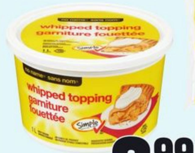
NO NAME® WHIPPED TOPPING SELECTED VARIETIES FROZEN 1 L 20113422001_EA