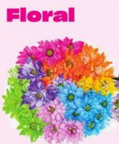
COLOUR POP DAISIES MARGUERITES COLOUR POP 21437439_EA