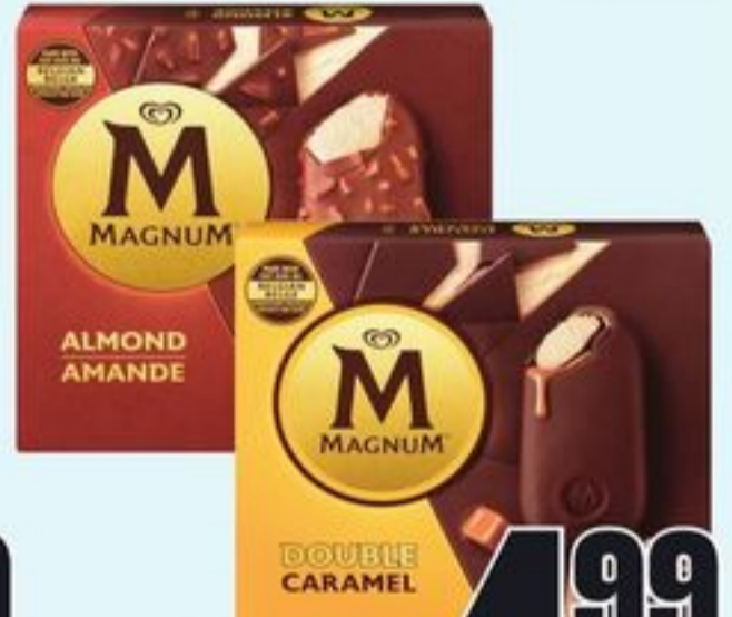
MAGNUM BARS SELECTED VARIETIES FROZEN 4'S 20342005003_EA/20950739_EA