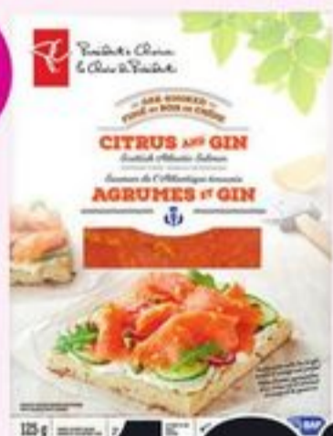
PC® OAK-SMOKED CITRUS AND GIN SCOTTISH ATLANTIC SALMON 125 G 21576457_EA