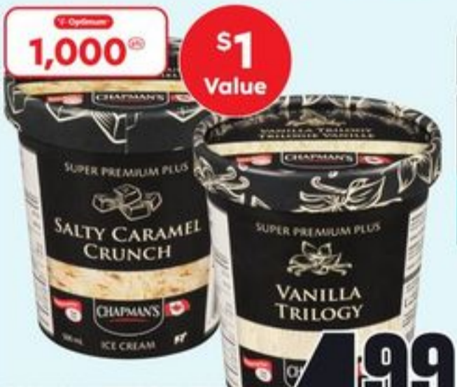
CHAPMAN'S SUPER PREMIUM PLUS ICE CREAM SELECTED VARIETIES FROZEN 500 ML 21511147_EA/21511200_EA