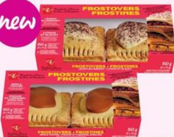
PC® FROSTOVERS™ HAND PIE SELECTED VARIETIES 150 G 21588644_EA