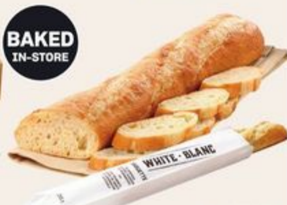
BAGUETTE WHITE OR WHOLE WHEAT 255 G BAGUETTE 21529211_EA