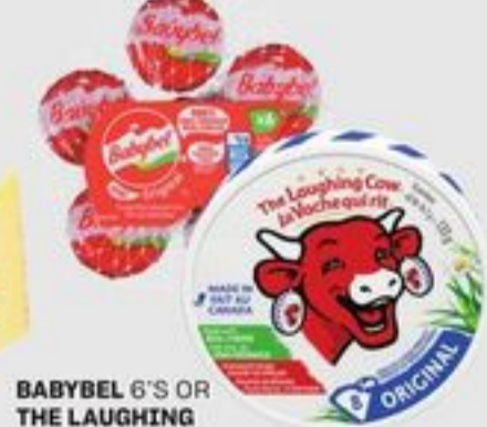
BABYBEL 6'S OR THE LAUGHING COW 8'S SELECTED VARIETIES BABYBEL OU LA VACHE QUI RIT 20319107_EA/20574332_EA