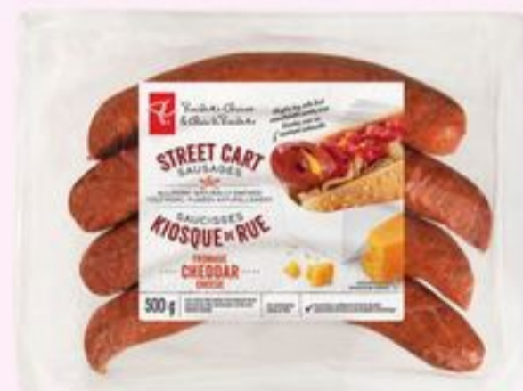
PC® STREET CART SAUSAGE CHEDDAR OR ORIGINAL 500 G 21525048_EA/21525049_EA