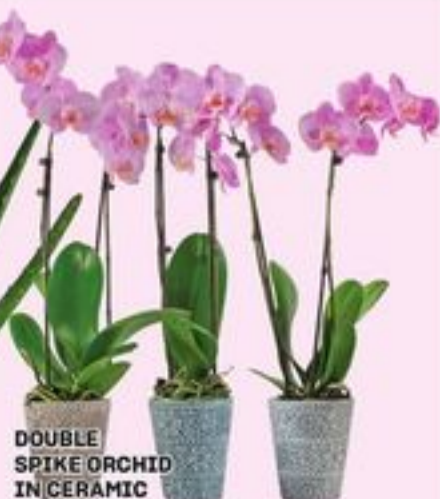
DOUBLE SPIKE ORCHID IN CERAMIC SELECTED VARIETIES ORCHIDÉE À DEUX TIGES DANS UN POT EN CÉRAMIQUE 20293541_EA