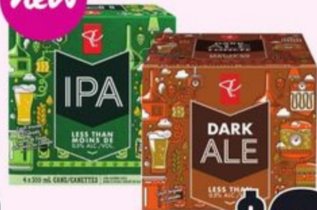
PC® DARK ALE OR IPA LOW ALCOHOL BEER (LESS THAN 0.5% ALC./VOL.) 4X355 ML 21588335_C04 21589408_C04