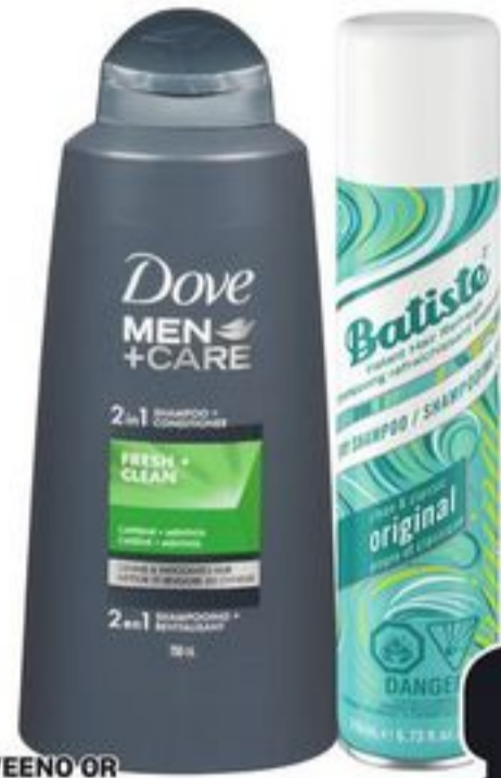
DOVE, BATISTE, AVEENO® OR GARNIER WHOLE BLENDS HAIR CARE OR STYLING SELECTED VARIETIES AND SIZES 20419882001_EA/20850398_EA