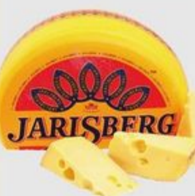
NORWEGIAN JARLSBERG CHEESE FROMAGE JARLSBERG NORVÉGIEN 21388103_KG