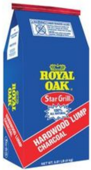
STAR GRILL LUMP CHARCOAL 8.8 LB 20773869_EA