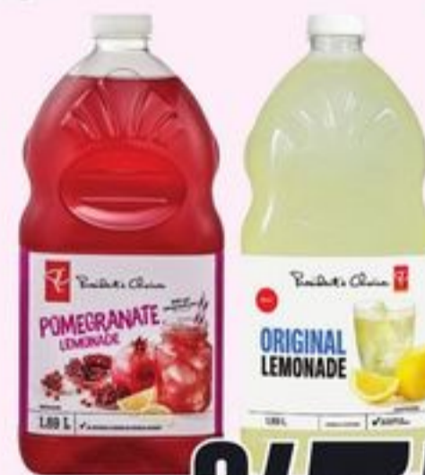
PC® LEMONADE SELECTED VARIETIES 1.89 L 20772870001_EA 21425929_EA