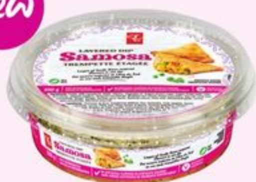
PC® SAMOSA LAYERED DIP 350 G 21588729_EA