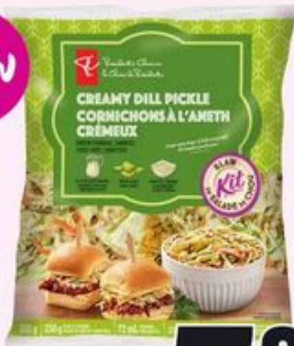
PC® CREAMY DILL PICKLE SLAW KIT 301 G 21588279_EA