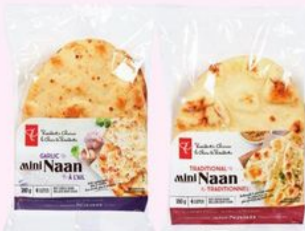
PC® MINI NAAN TRADITIONNAL OR GARLIC SELECTED VARIETIES 4'S 21076210_EA 21076234_EA