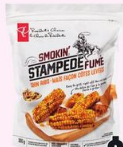
PC® SMOKIN' STAMPEDE FUMÉ CORN RIBS FROZEN 500 G 21520140_EA