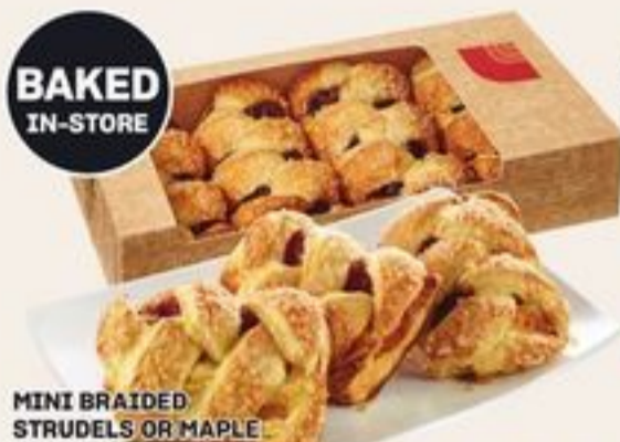
MINI BRAIDED STRUDELS OR MAPLE PECAN DANISH SELECTED VARIETIES 4'S MINI-CHAUSSON TRESSÉ OU DANOISÉ ÉRABLE ET PACANES 21464142_EA/21464199_EA