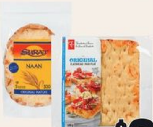
PC® FLATBREAD 220/300 G OR SURAJ® NAAN 5'S SELECTED VARIETIES PAIN PLAT PC™ OU NAAN SURAJ® 20910042_EA/21051353_EA