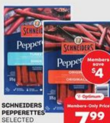
SCHNEIDERS PEPPERETTES SELECTED VARIETIES 250-375 G PEPPERETTES SCHNEIDERS 20976093_EA/20976110_EA