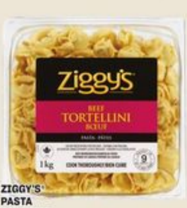
ZIGGY'S PASTA SELECTED VARIETIES 1 KG PÂTES ZIGGY'S® 21521156_EA