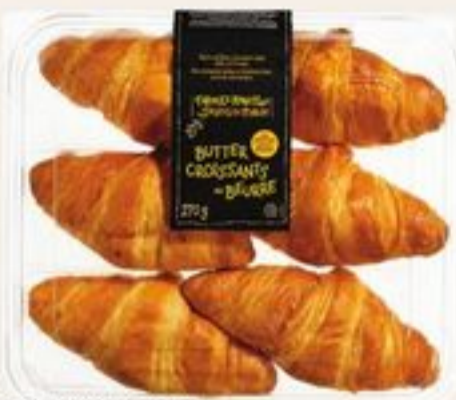
FARMER'S MARKET™ BUTTER CROISSANTS SELECTED VARIETIES 6'S CROISSANTS AU BEURRE DÉLICÉS DU MARCHÉ™ 20975943_EA