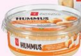
PC® DIPS OR HUMMUS 190-227 G OR PC® NAAN DIPPERS 200 G SELECTED VARIETIES 20584097_EA 21092033_EA