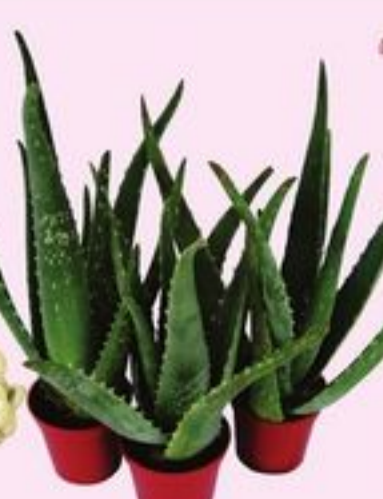
ALOE VERA 4 INCH POT ALOËS 21047366_EA