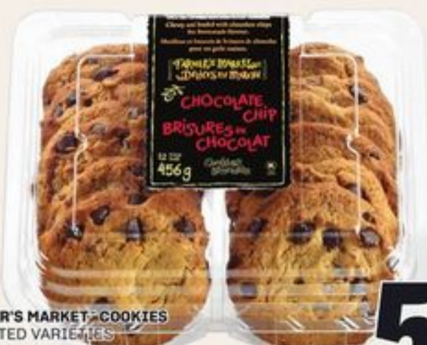
FARMER'S MARKET™ COOKIES SELECTED VARIETIES 12'S BISCUITS DÉLICÉS DU MARCHÉ™ 20566774_EA