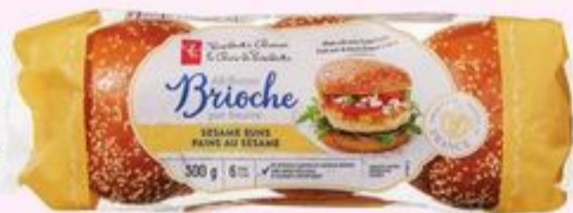
PC® BRIOCHE SESAME BUNS 300 G 21576538_EA