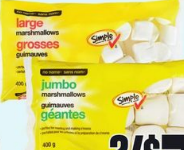
NO NAME® MARSHMALLOW SELECTED VARIETIES 400 G 20304672001_EA/21023141_EA