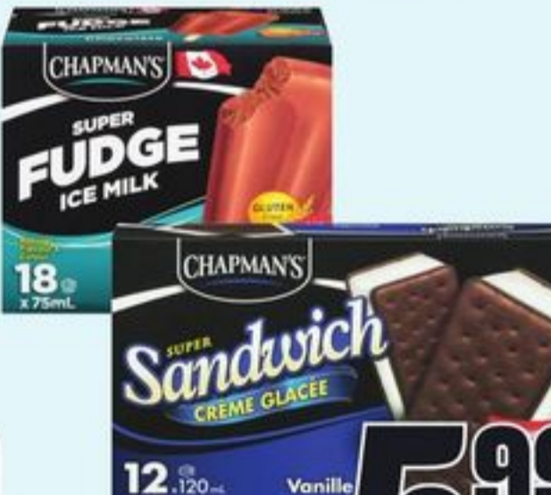
CHAPMAN'S SUPER NOVELTIES SELECTED VARIETIES FROZEN 20072328002_EA/20111532_EA