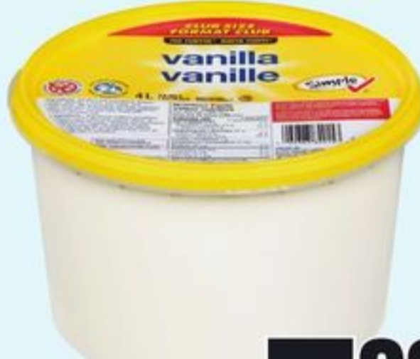
NO NAME® ICE MILK SELECTED VARIETIES FROZEN 4 L 20015284002_EA