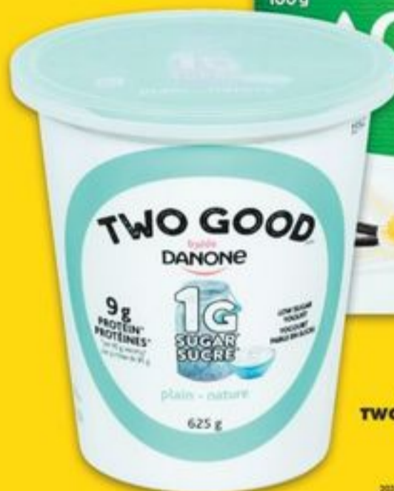
DANONE ACTIVIA 8% MIX & GO VANILLA 2% or TWO GOOD LOW SUGAR 625 g selected varieties yogourt 20223264002 SA/21477313 SA