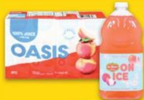
OASIS JUICE or ARIZONA ICED TEA, ALLEN'S APPLE or CRANBERRY COCKTAIL or DEL MONTE ON ICE REFRESHERS 1.89 L selected varieties jus ou thé glacé ou boissons 20313764002 SA/21375061 SA