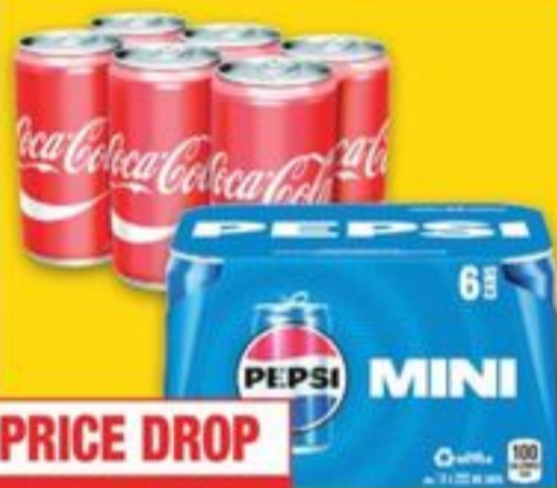
COCA-COLA or PEPSI SOFT DRINKS selected varieties 6x222 mL boissons gazeuses 20344284002 C06/20637340004 C06